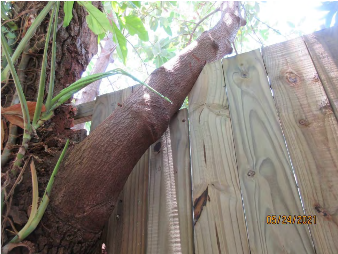
Photo of tree branch and fence.