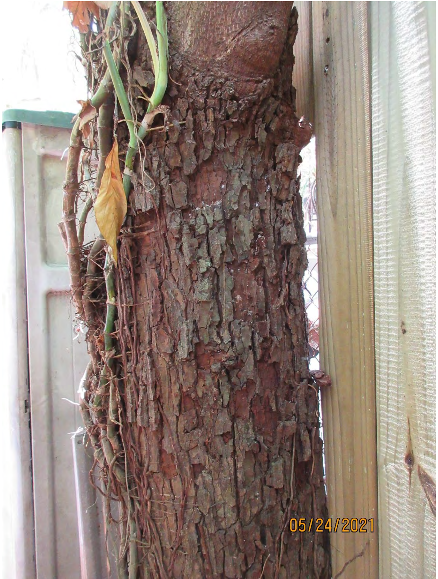
Photo of tree trunk and completed fence, view 5.