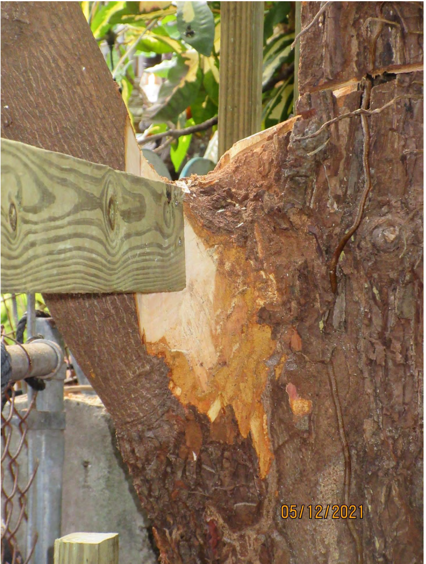
Closer view of fence and tree damage, view 3.