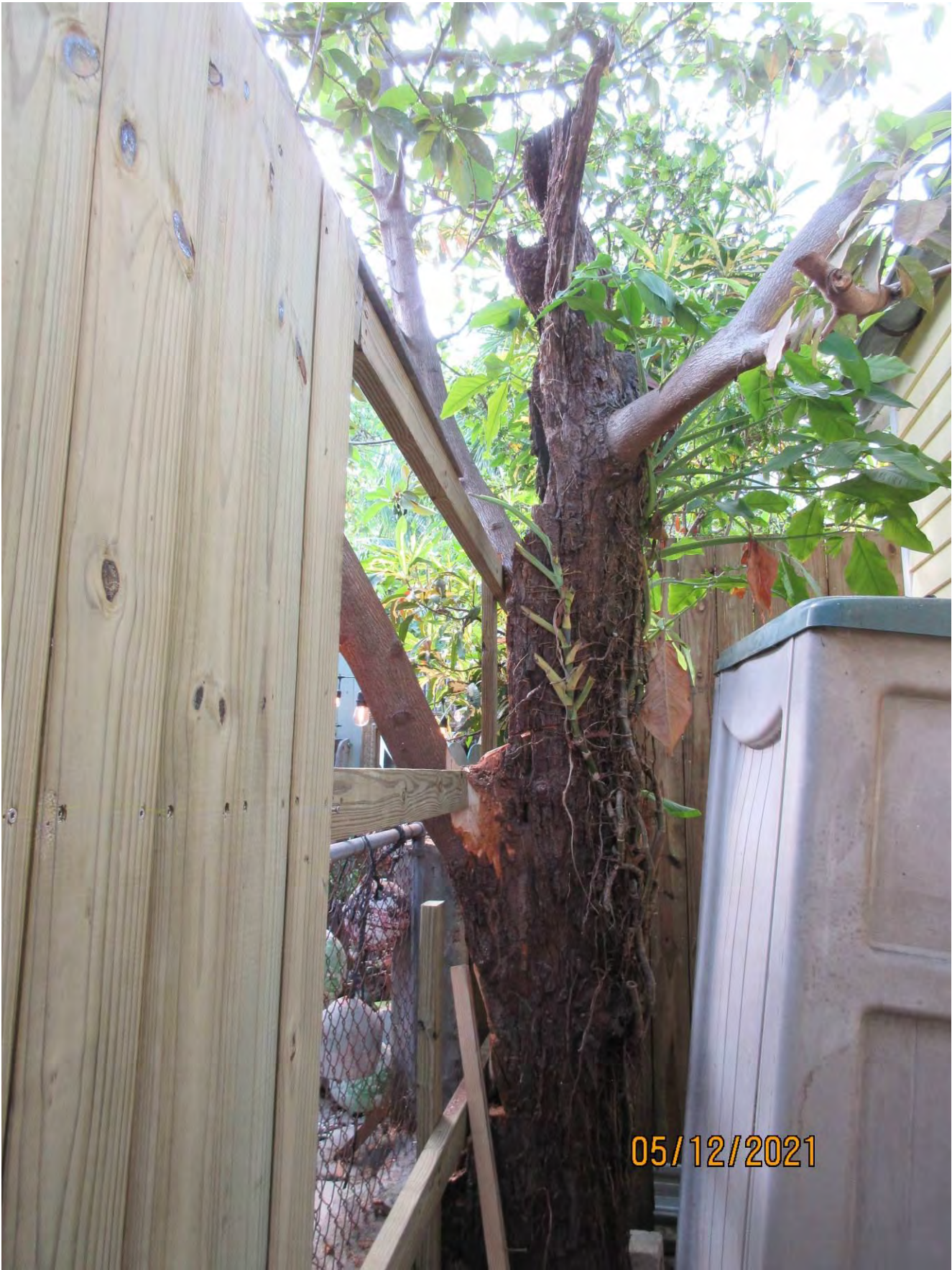
Photo showing tree and fence installation damage. Note that main tree trunk had been damaged previously by a storm in the past and branches were regrowth.