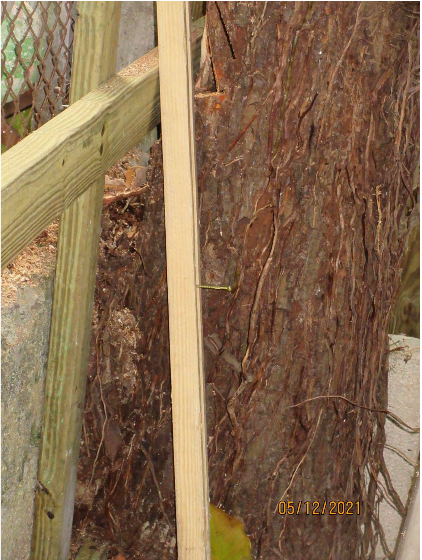
05/12/2021 Clouser view of fence and tree damage, view 4.