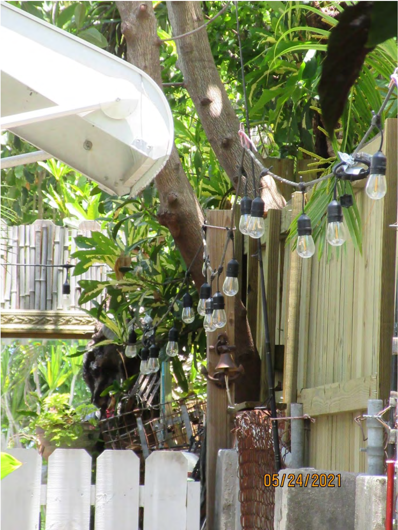
Photo of tree branches from neighboring property.