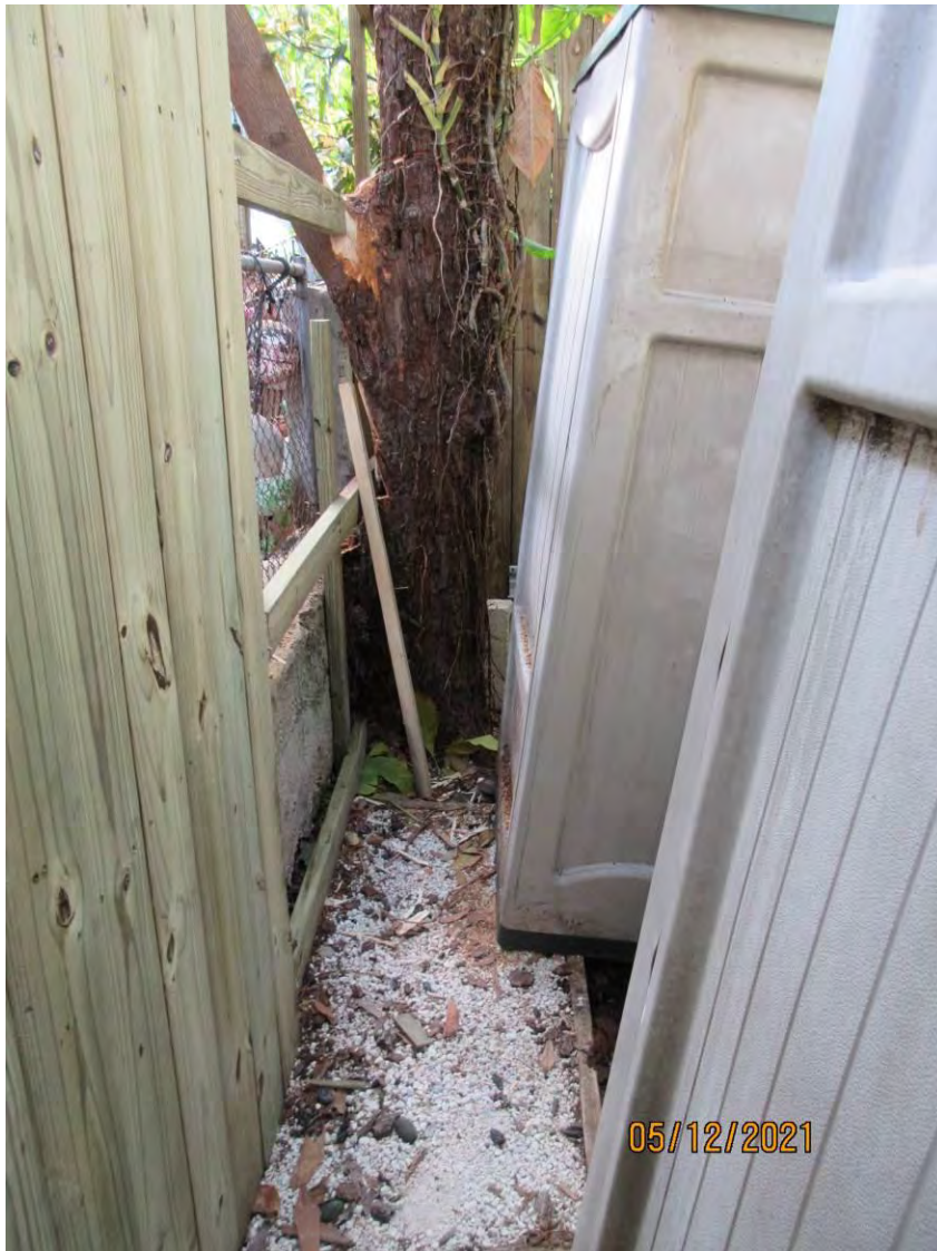
Photo showing fence and tree.

On May 12, 2021, a complaint was received regarding the cutting into a tree due to the installation of a fence. An inspection documented that a wood fence was being installed along a property line and an avocado tree in the rear corner of the property had been abused-cuts were made to the main trunk and branches in order to install framing for the fence. The person on site doing the work gave permission to inspect the tree and was informed of the issue and code violation. A business card was left for the property owner and subsequently, a meeting with the property owner was held onsite. Further research determined that the fence was being installed without a permit and the person doing the work was not a licensed contractor.