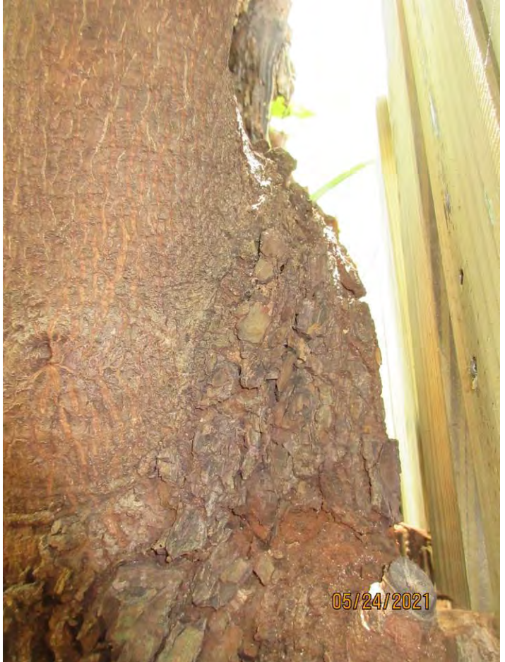
Above are two photos of tree trunk and completed fence, views 3 and 4.