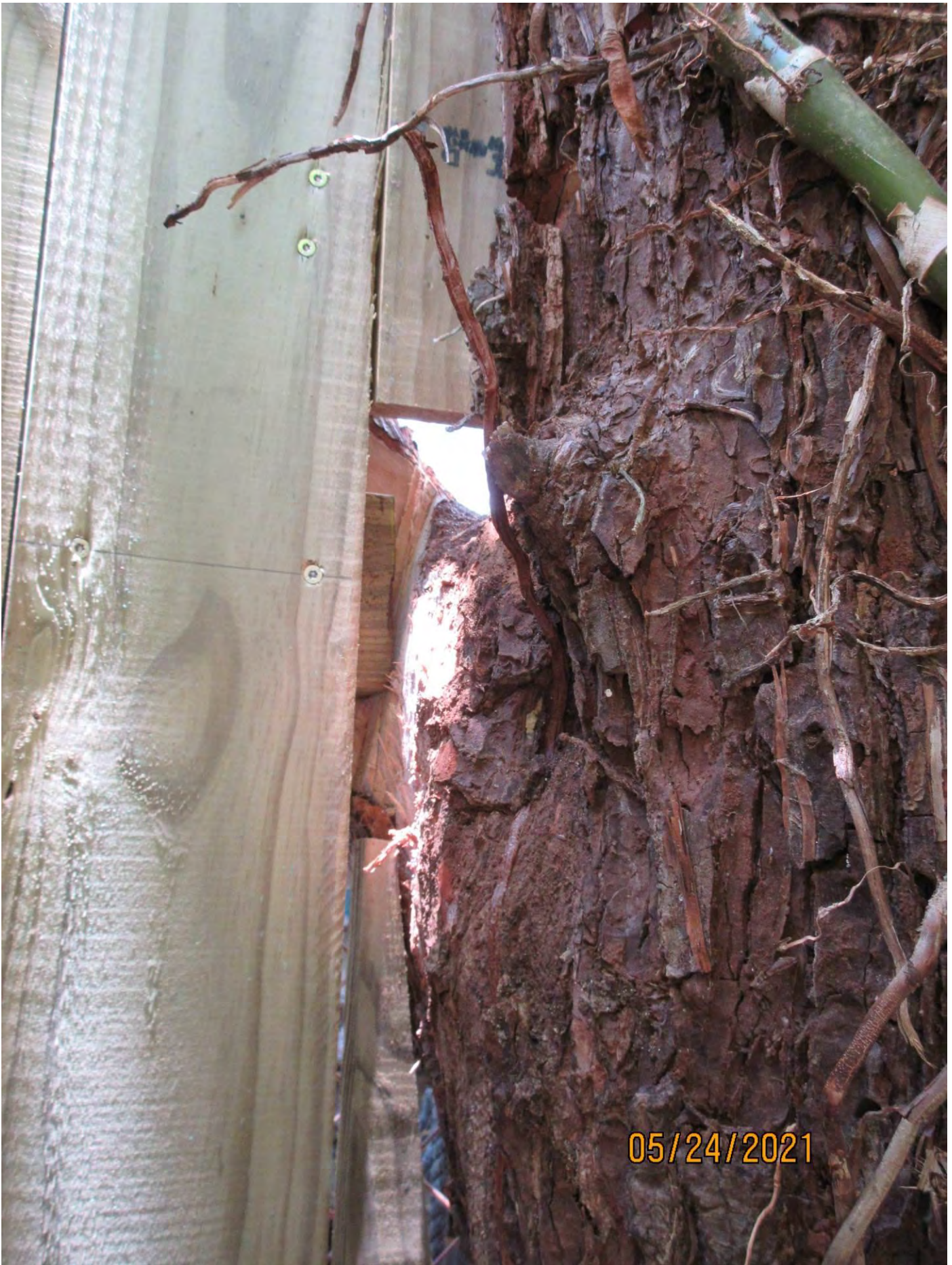
Photo of tree trunk and completed fence, view 2.