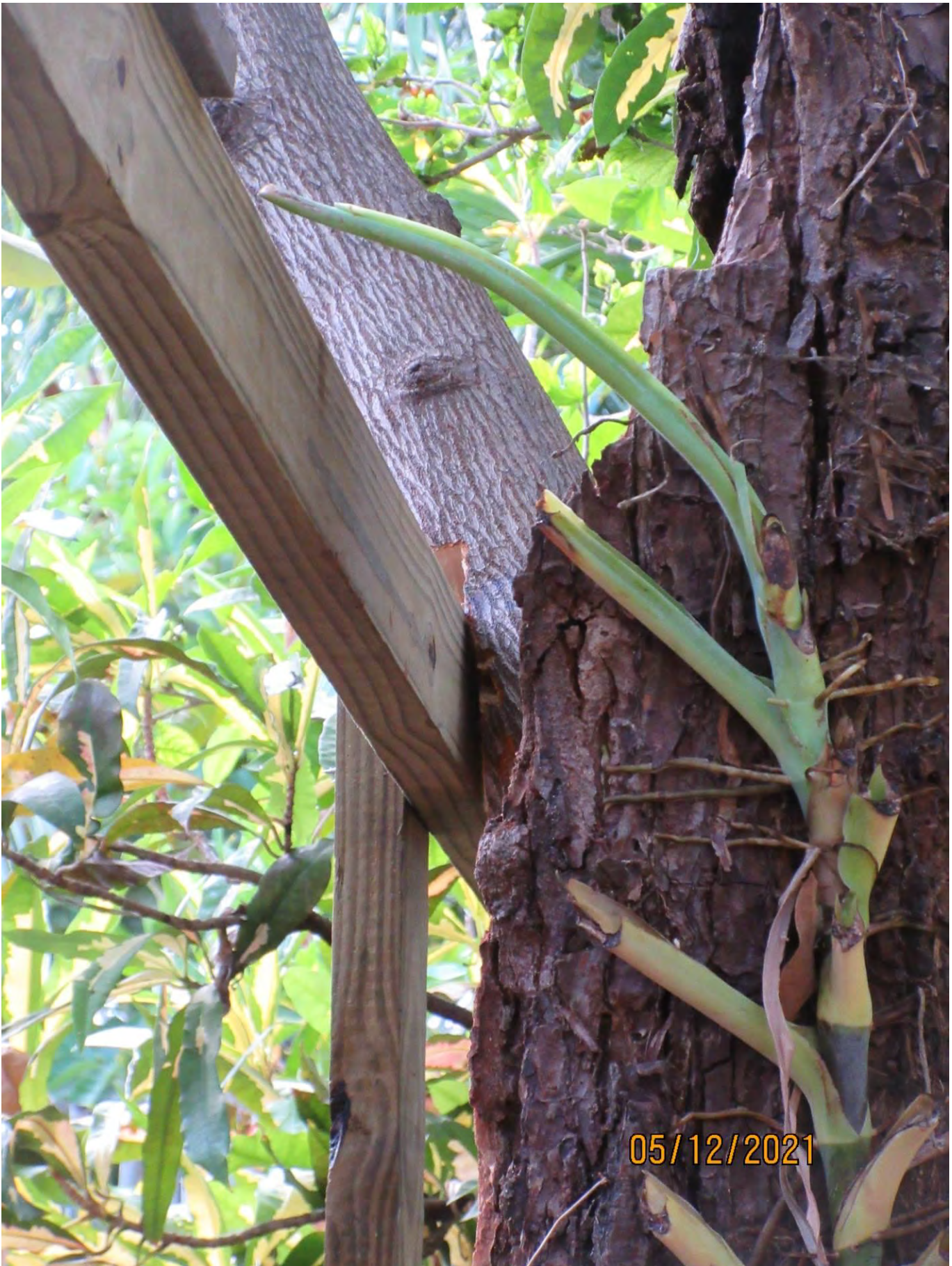
Closer view of fence and tree damage, view 2.