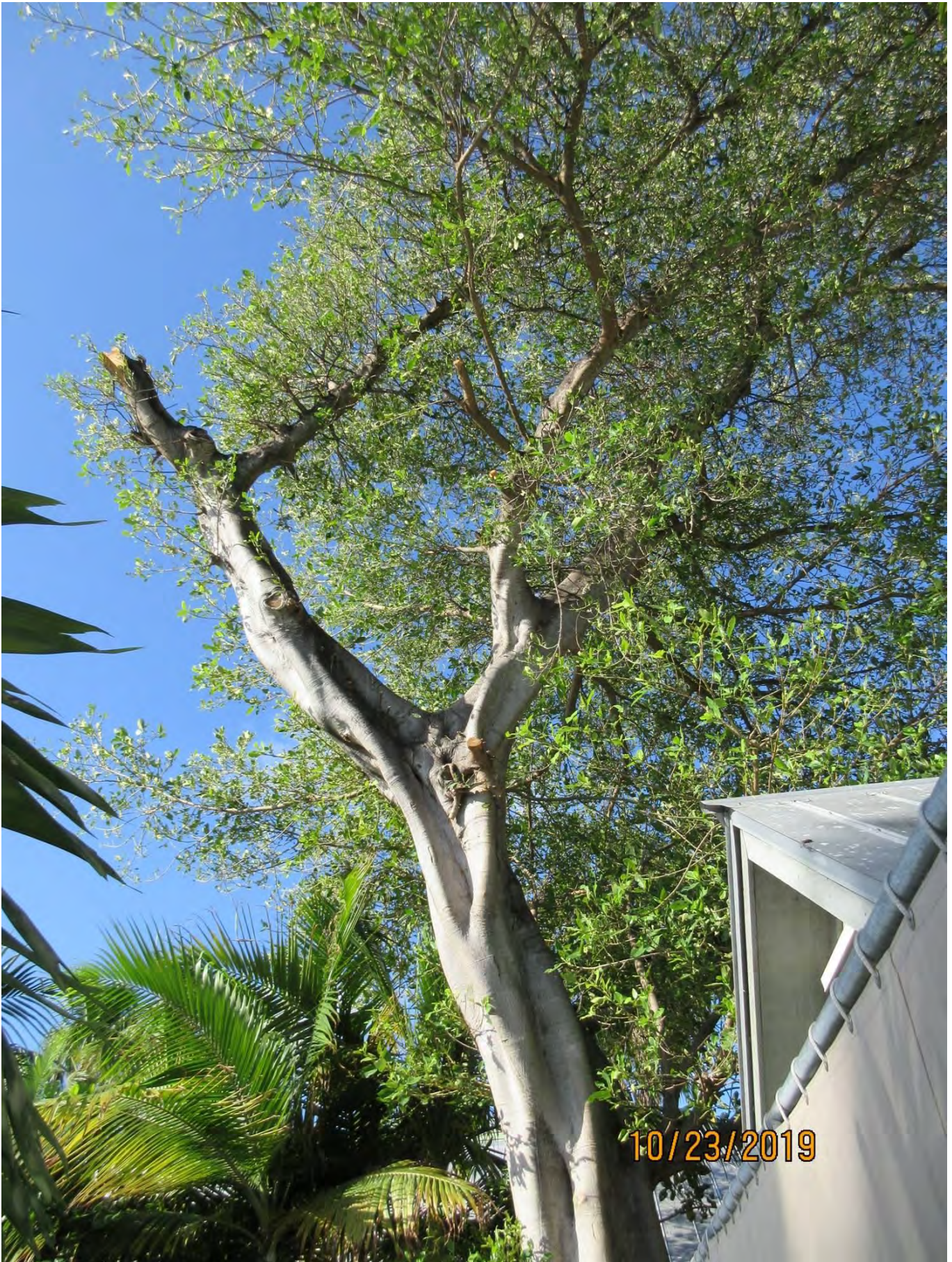
Photo of tree trunk and canopy, view 3.