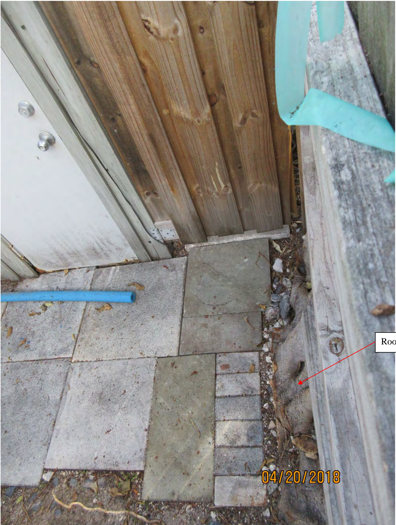
Looking over the fence on the 1114 Varela side.