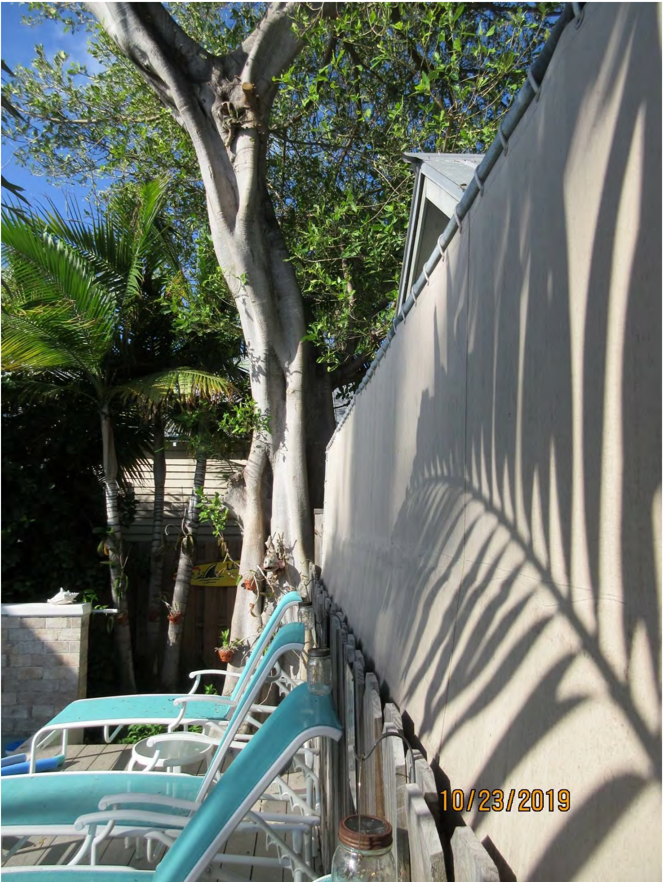
Photo showing tree trunk growing against fence, view 1.