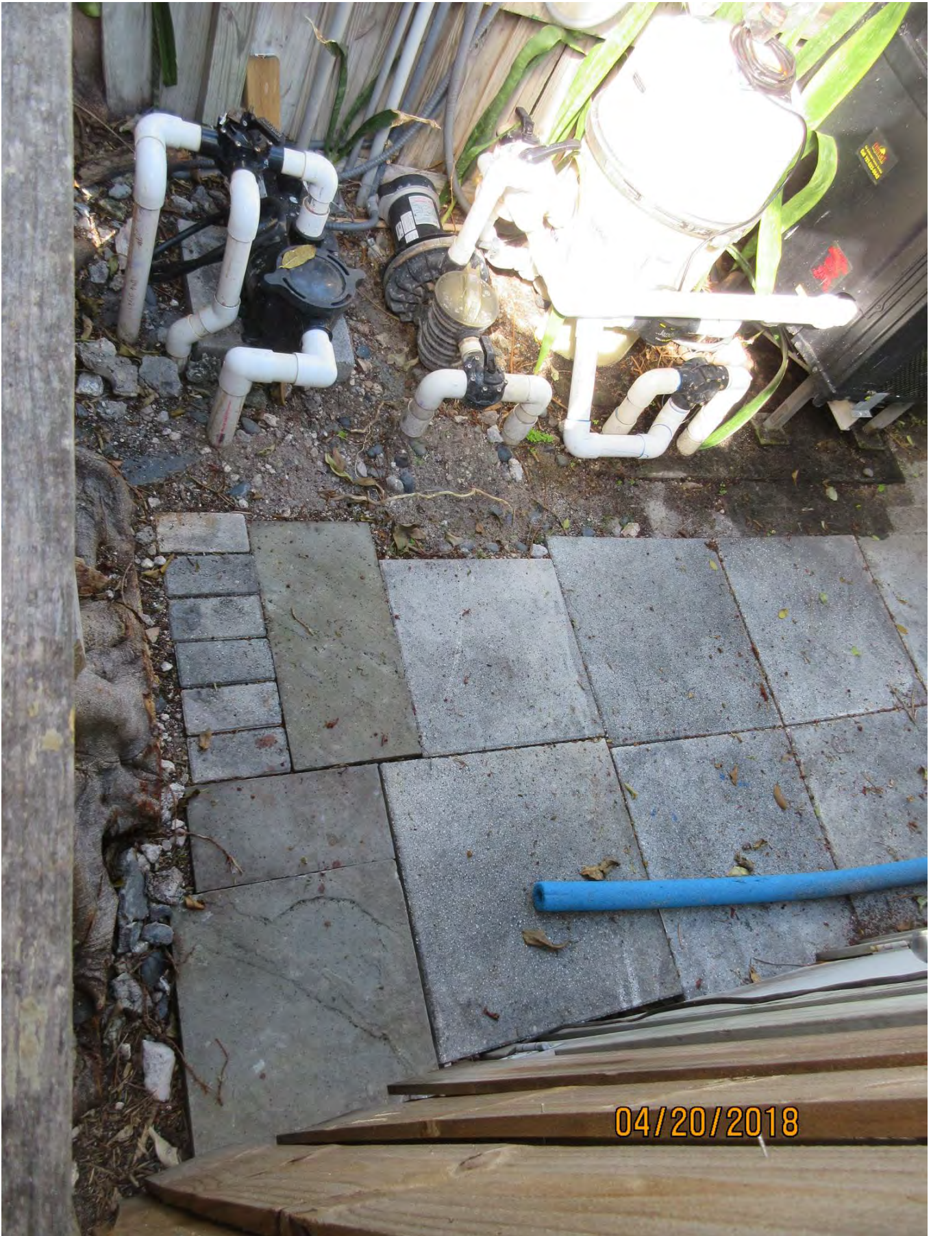
Looking over the fence on the 1114 Varela side.