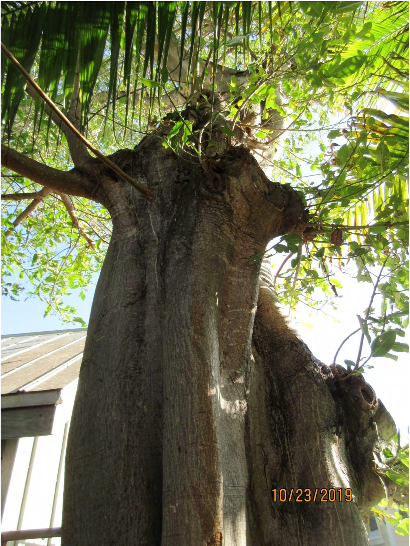
Photo looking upward at tree trunk.