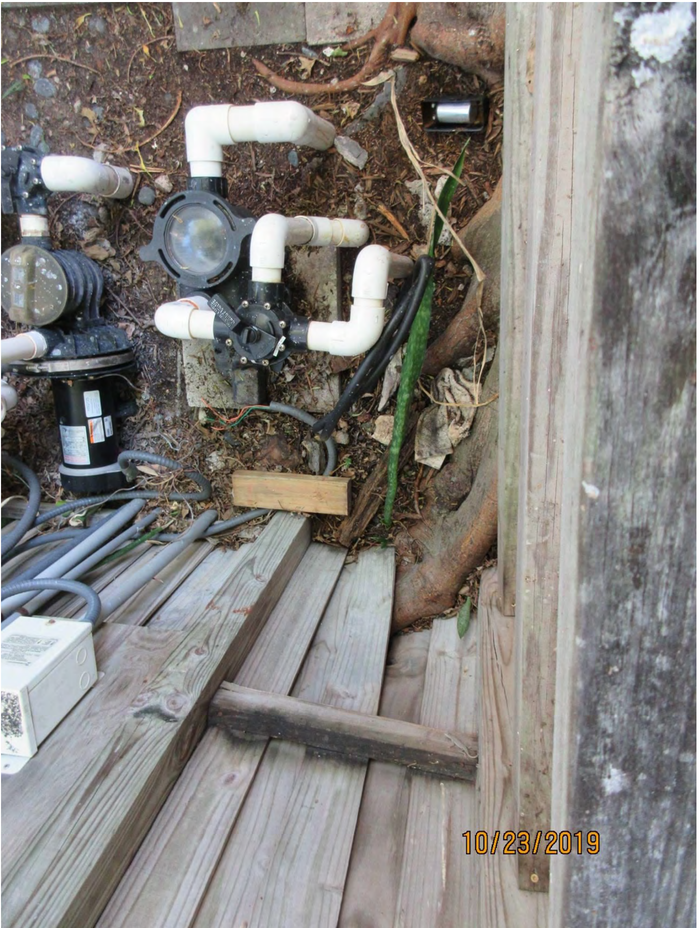
Photo looking over fence at neighbor's pump system, view 1.