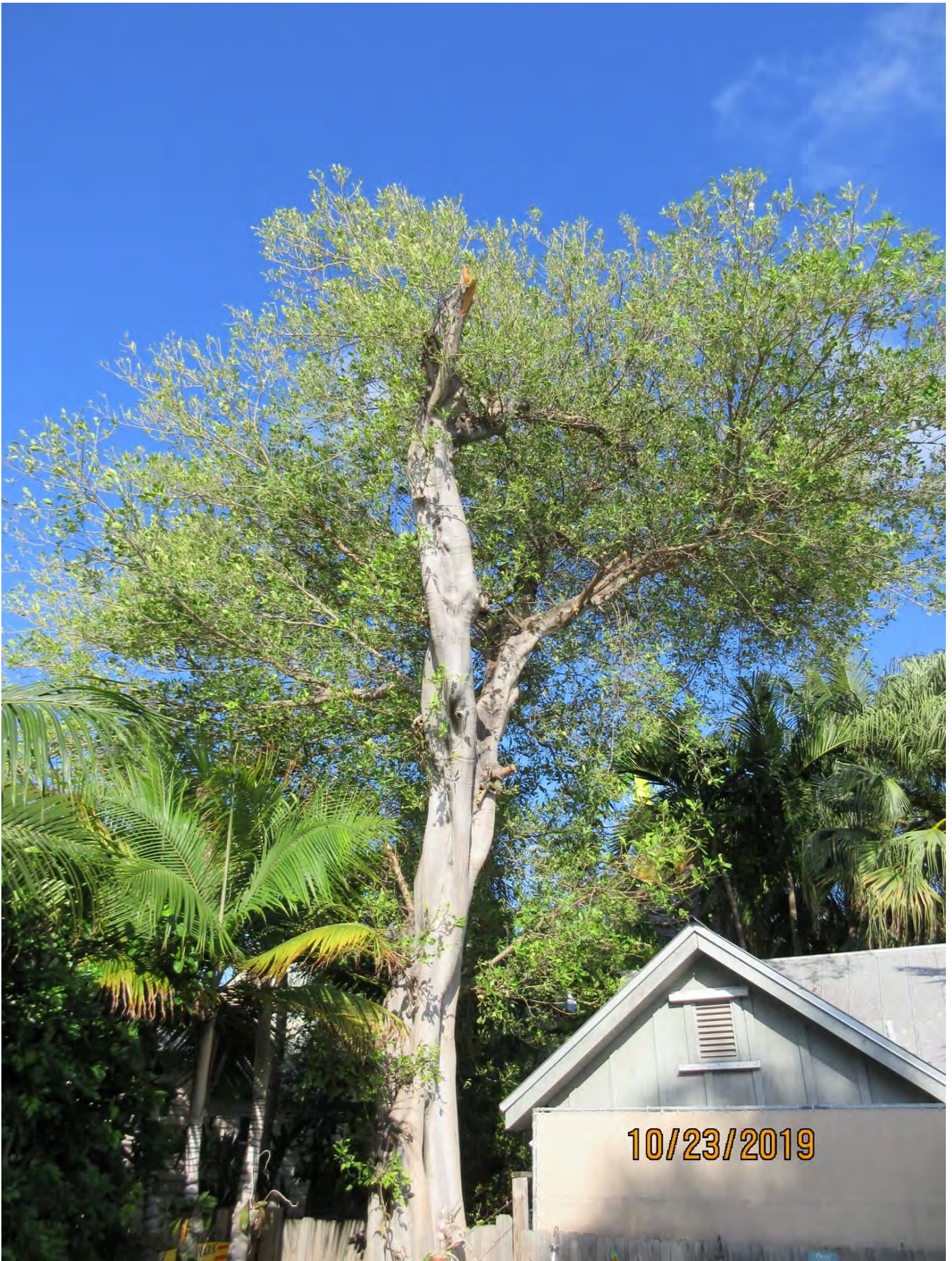
Photo showing tree trunk and canopy, view 2.