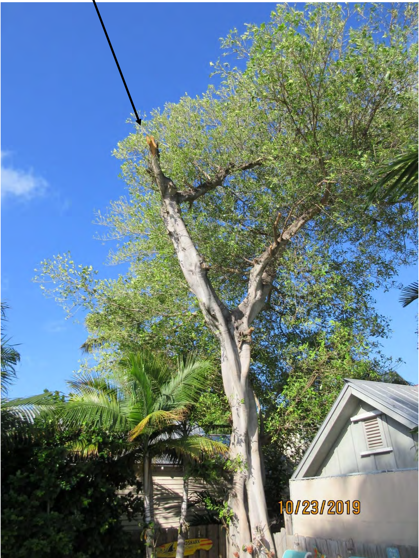
Photo showing tree trunk and canopy, view 1.