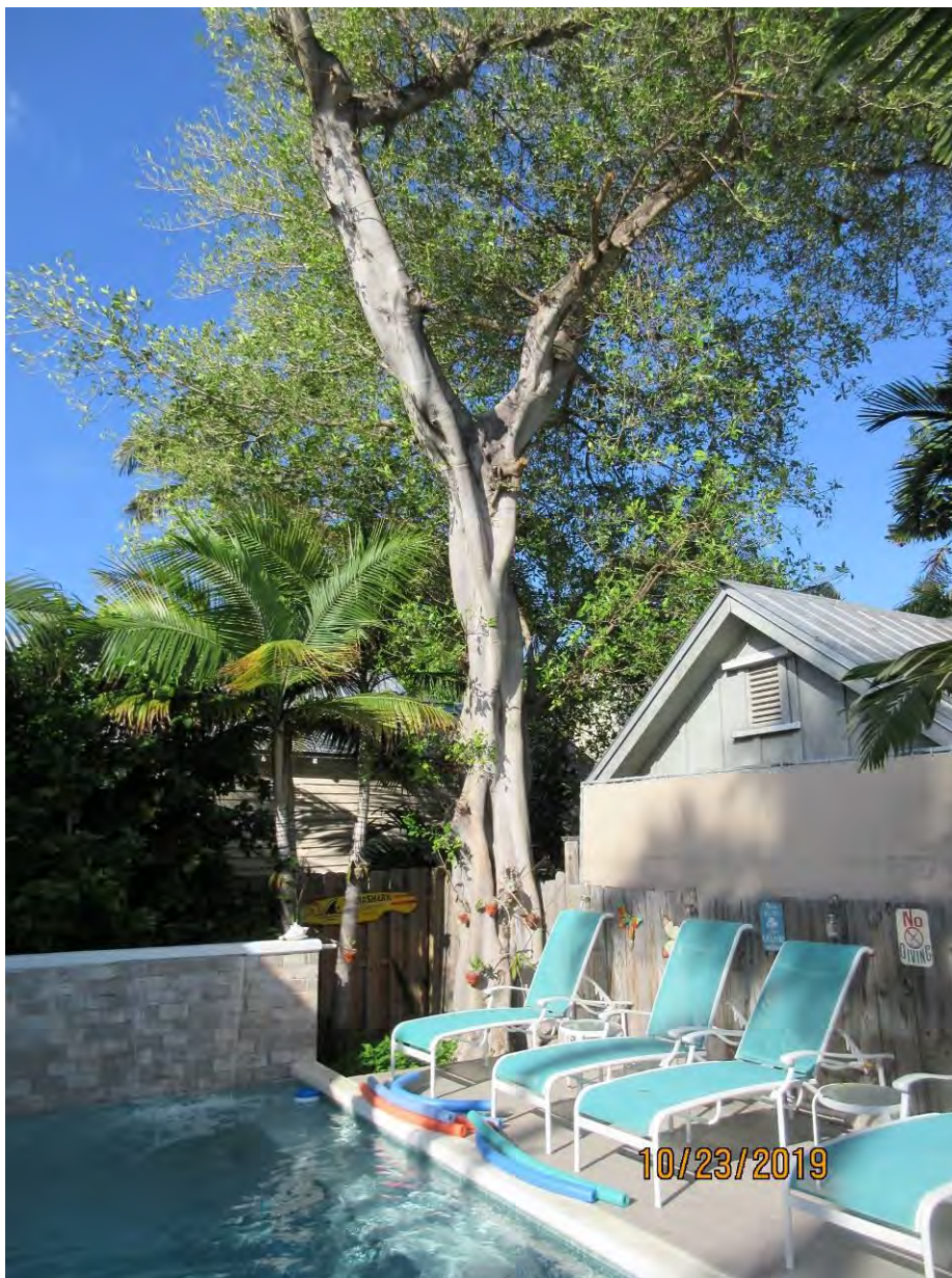
Photo showing tree location.

Tree Species: Strangler Fig ( Ficus aurea )