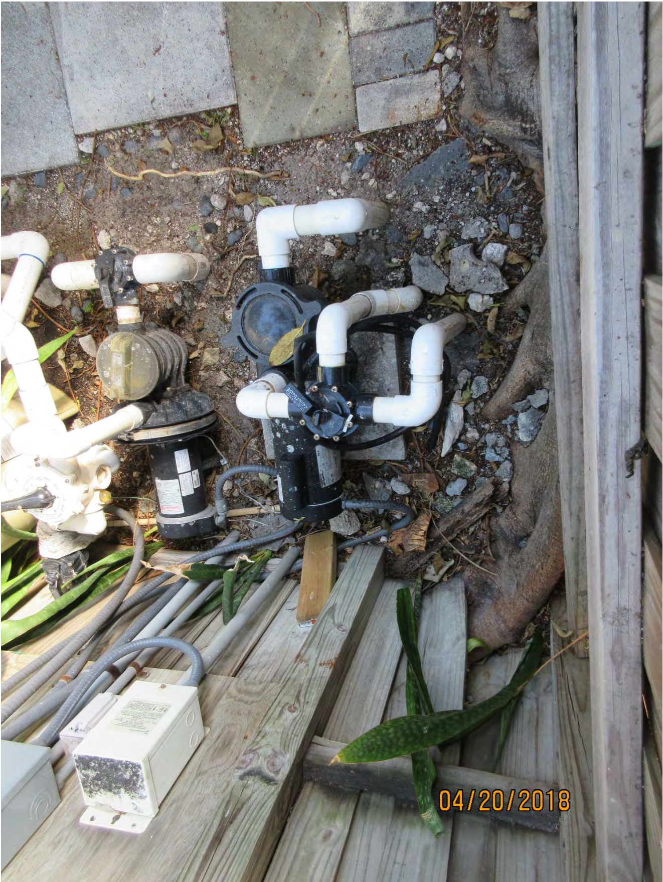
Looking over the fence on the 1114 Varela side.