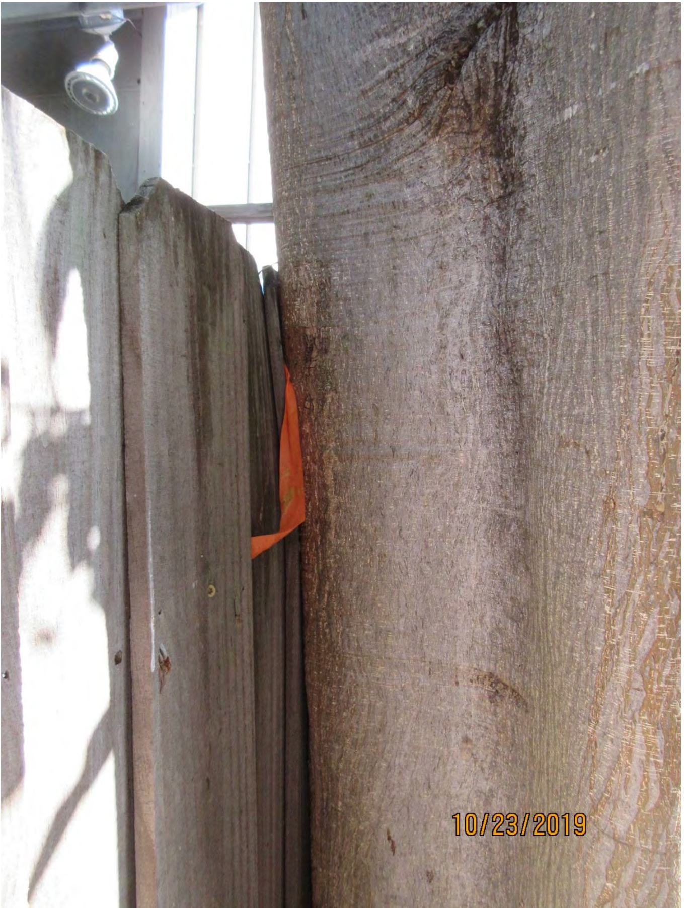
Photo showing tree trunk growing against fence, view 2.