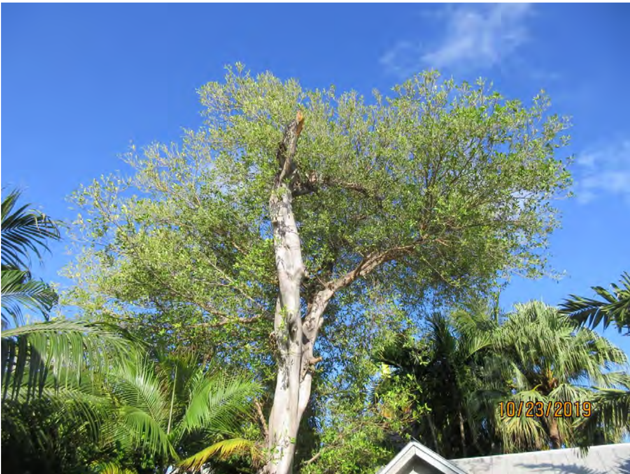
Photo of tree canopy, view 2.