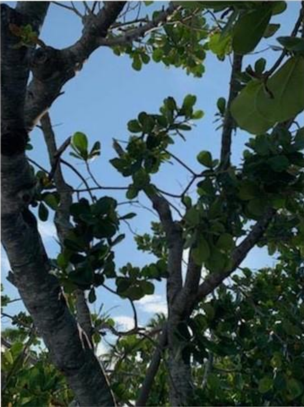
Close up photo of tree canopy, view 3.