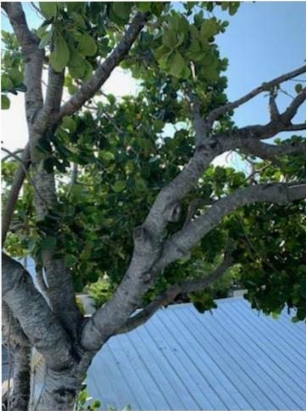
Photo of tree canopy