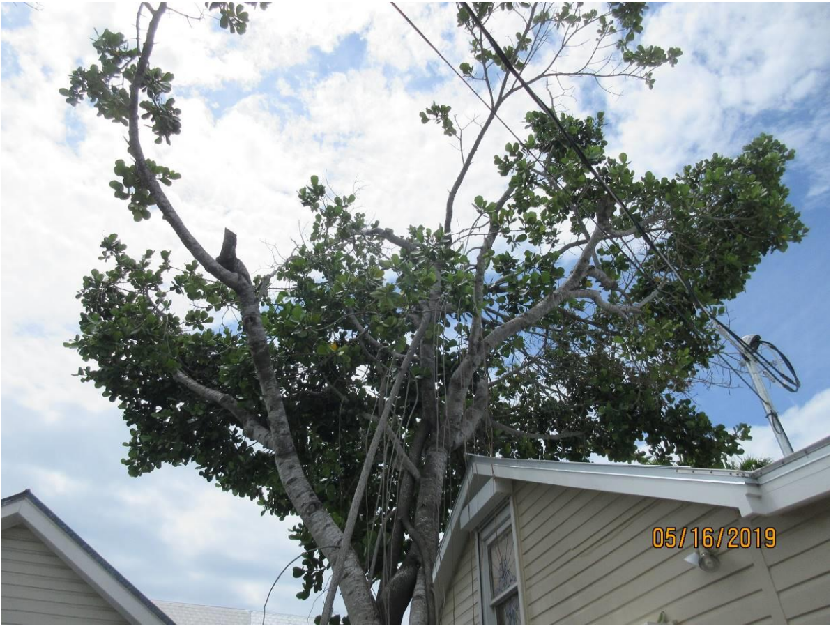
Photo of autograph tree canopy view 1.