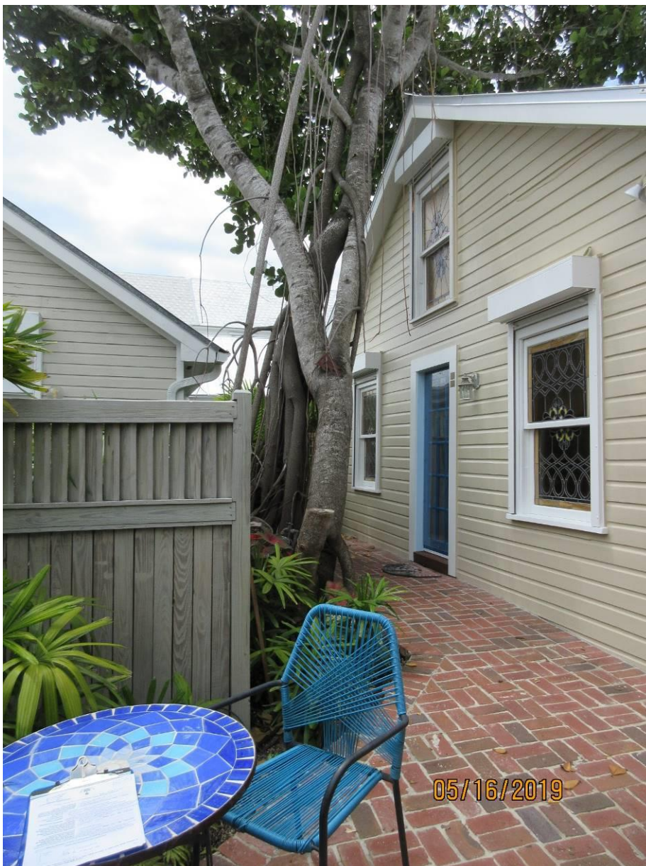
Photo of Autograph tree.