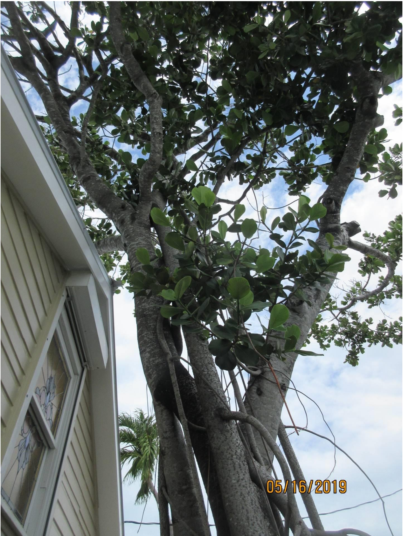
Photo of Autograph tree-close to house view 2.