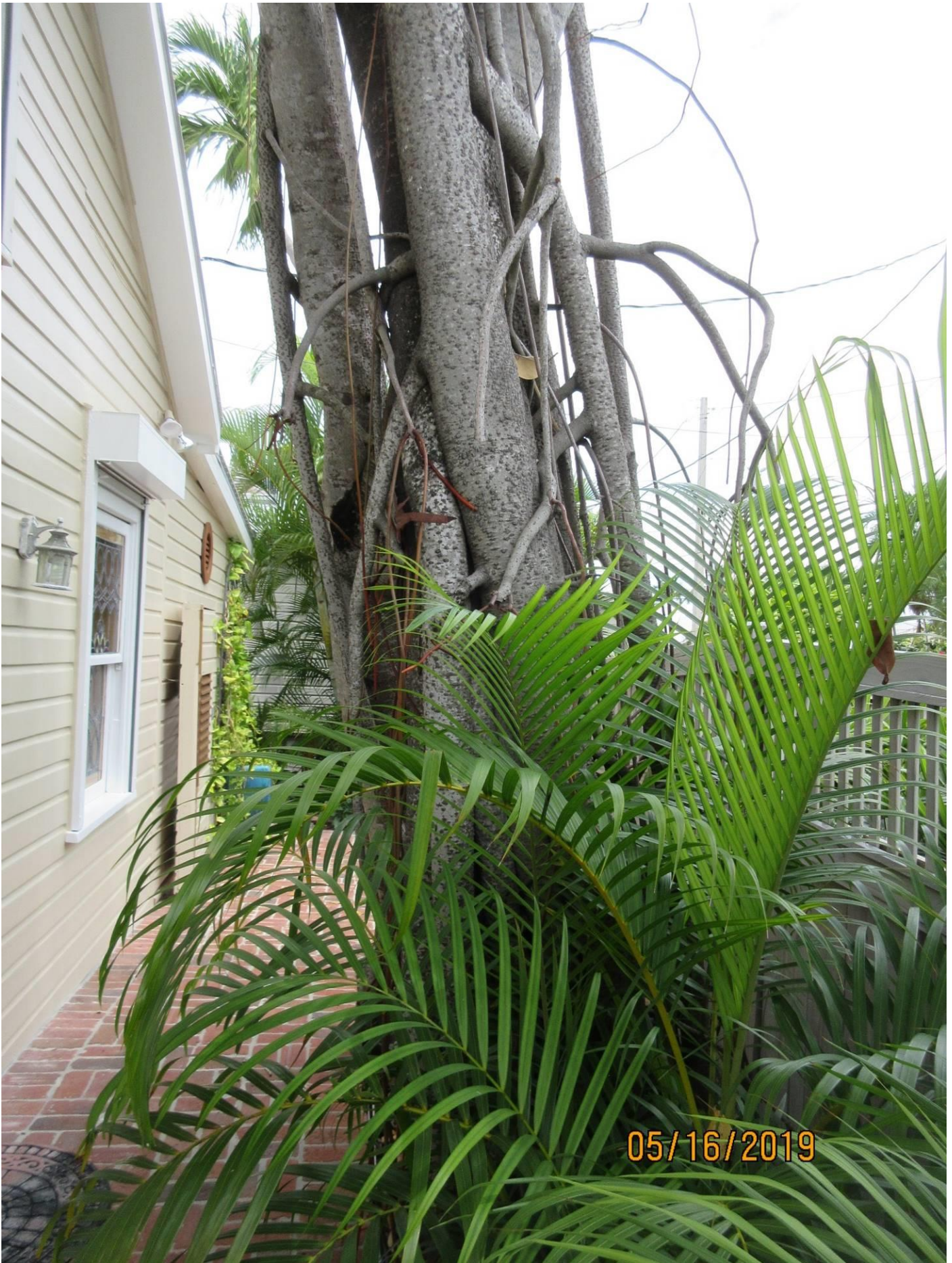
Photo of Autograph tree trunks view 2.