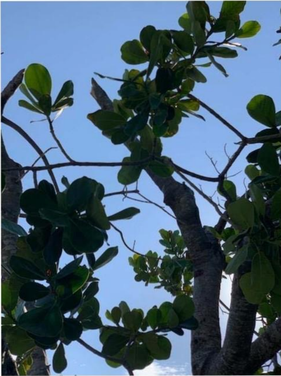
Closeup photo of tree canopy, view 1.