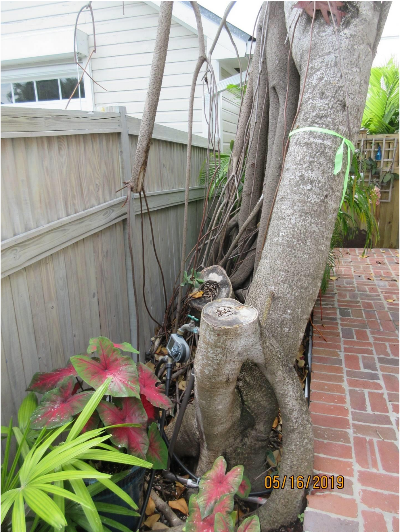
Photo of Autograph tree trunks close up.