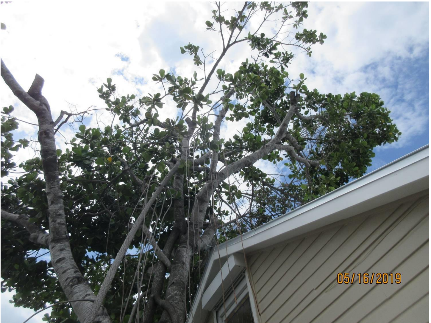
Photo of Autograph tree canopy view 4.