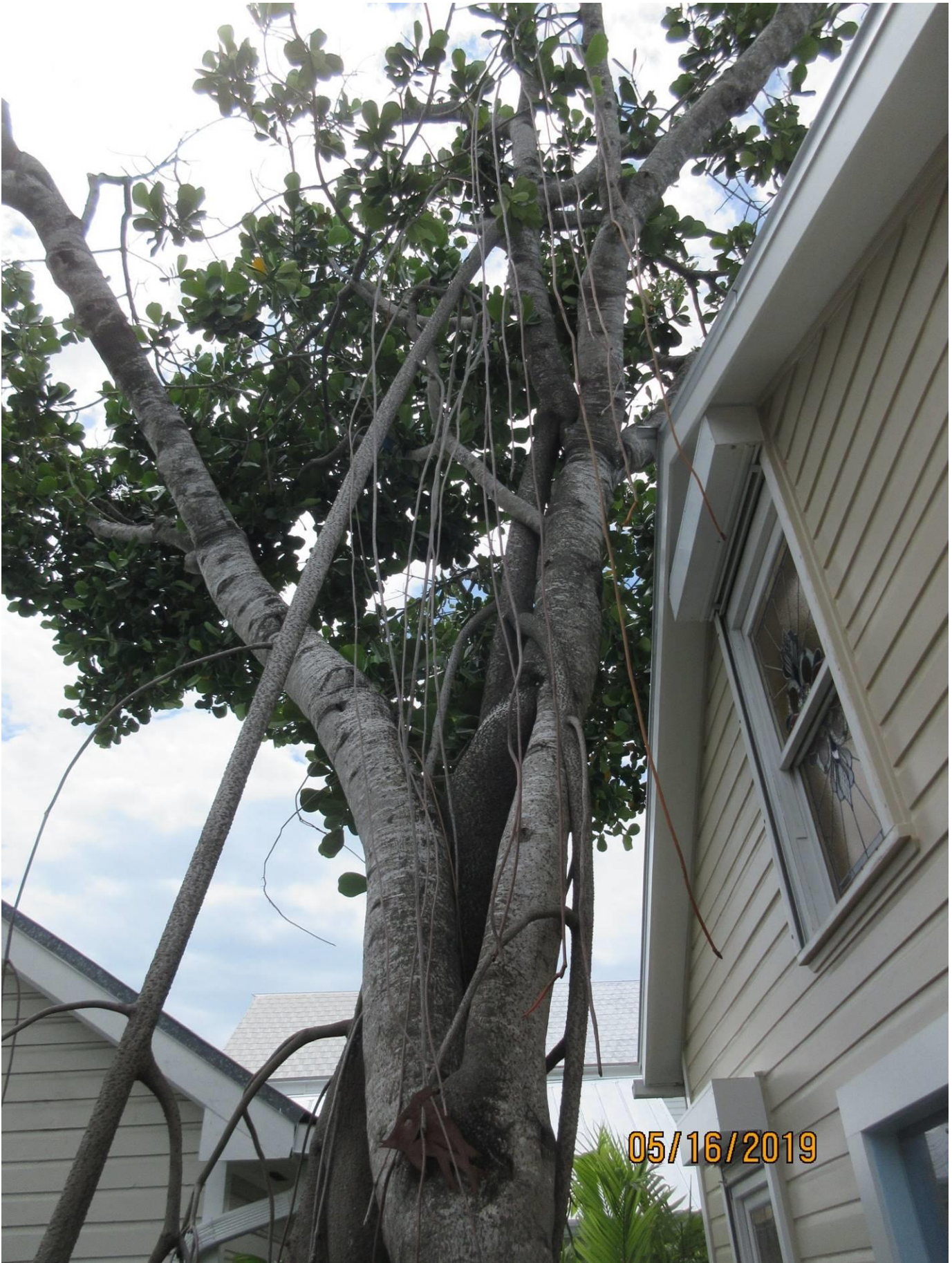
Photo of Autograph tree showing aerial roots and trunk structure.