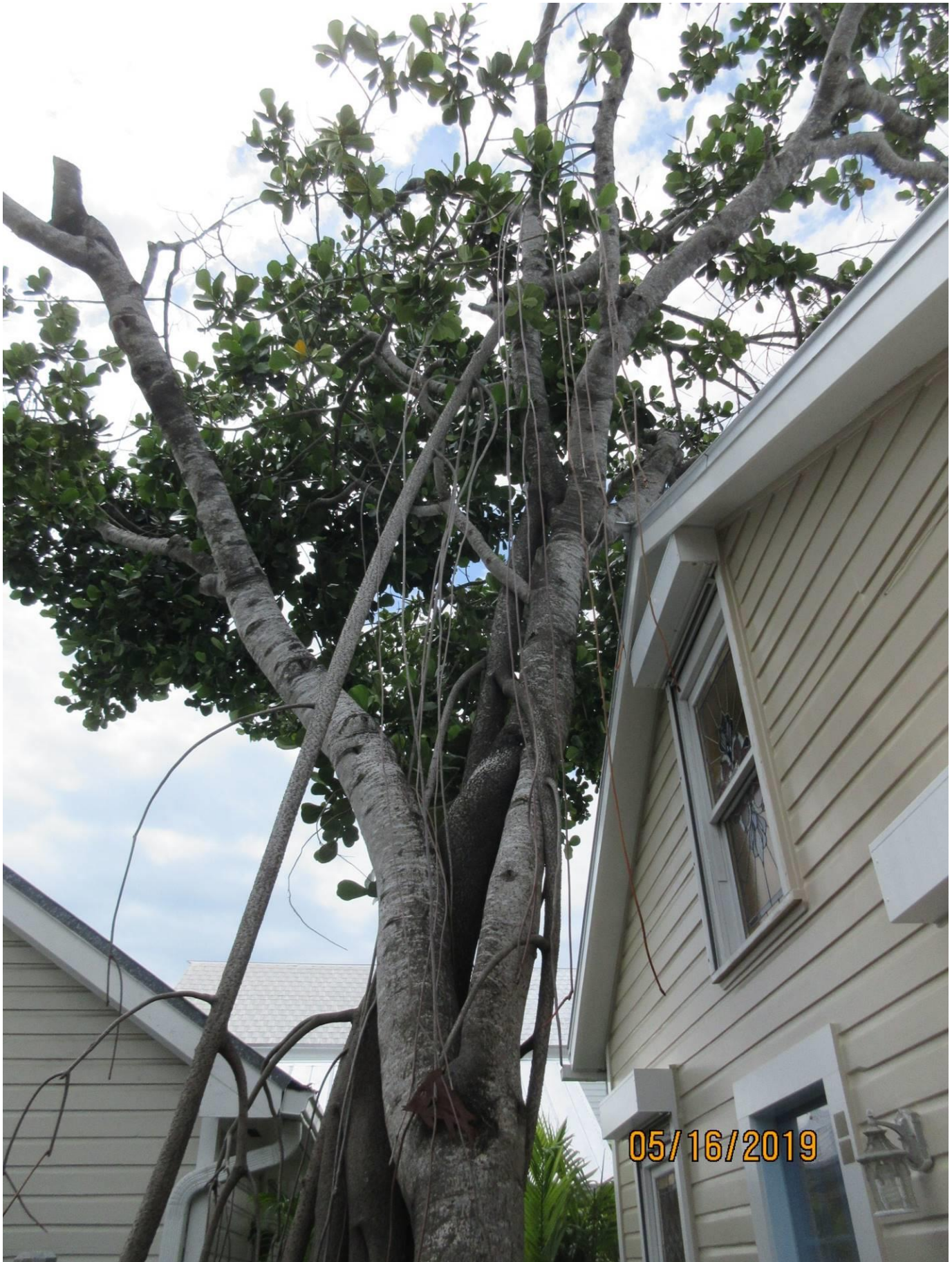
Photo of Autograph tree-close to house view 1.