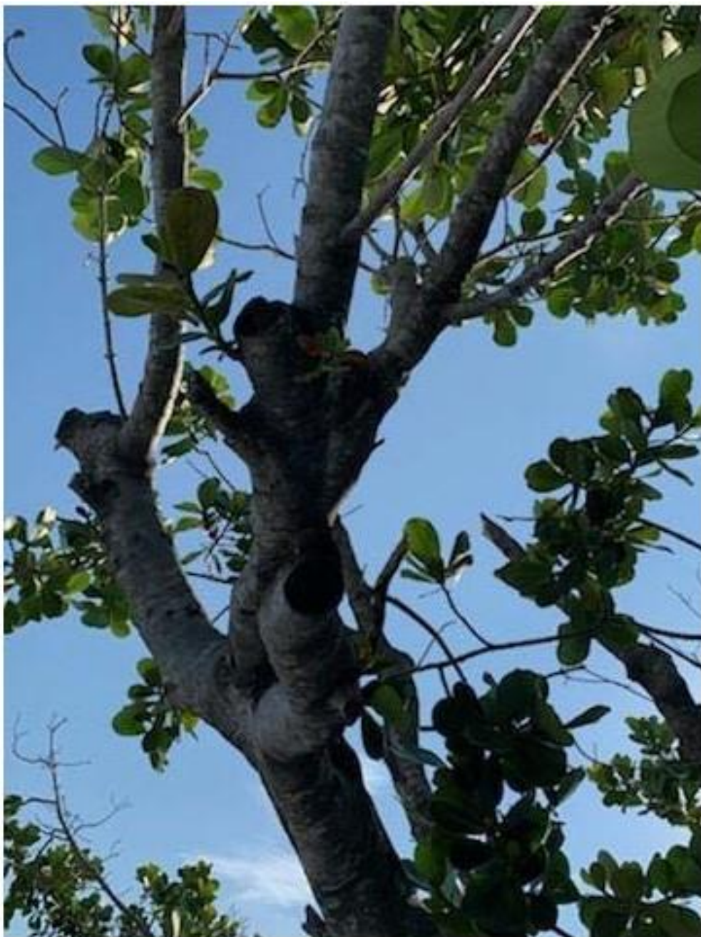
Close up photo of tree canopy, view 2.