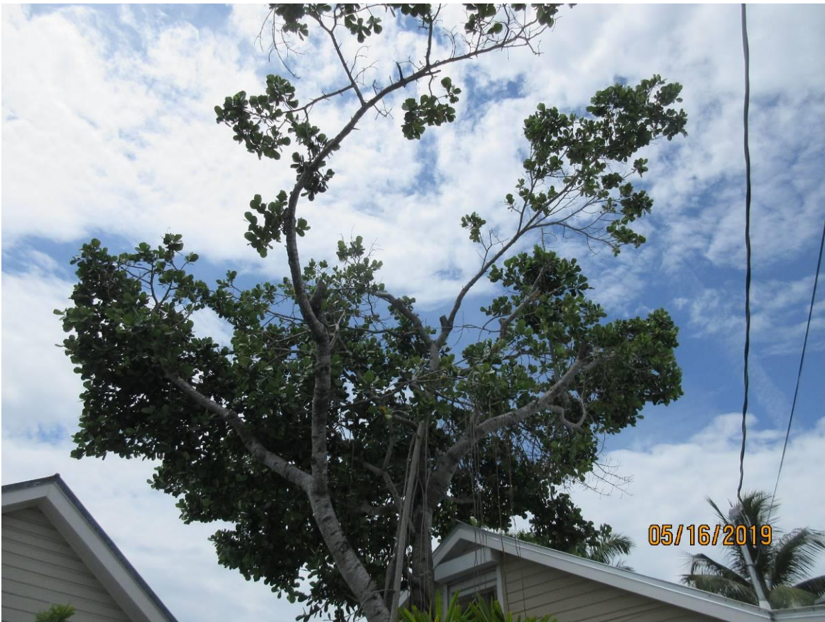
Photo of autograph tree canopy view 2.