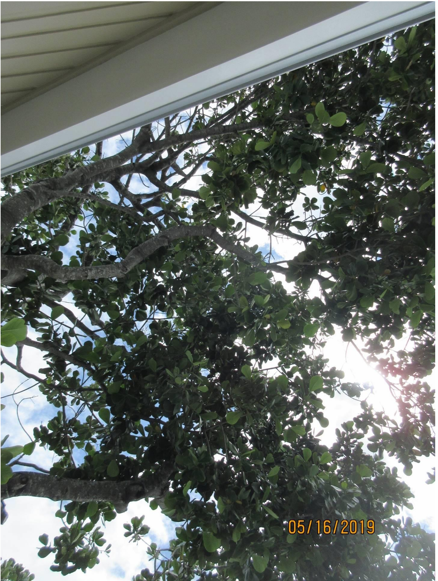
Photo of Autograph tree-canopy view 3.