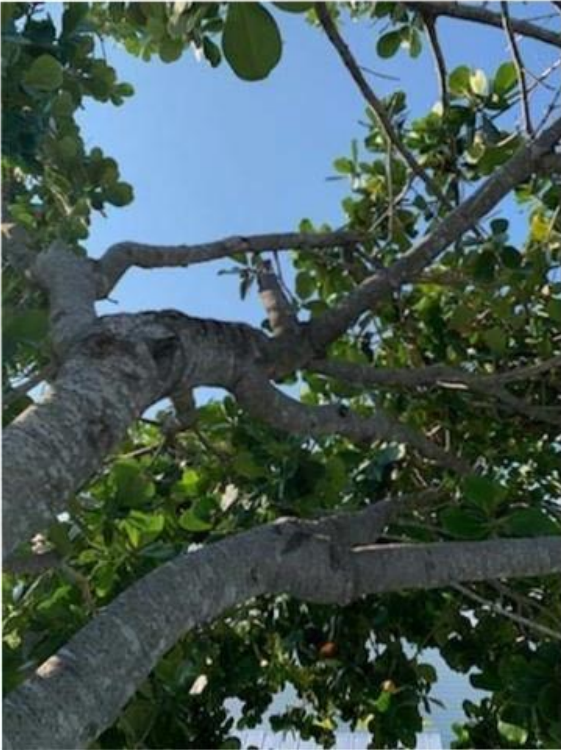
Close up photo of tree canopy, broken branch area.