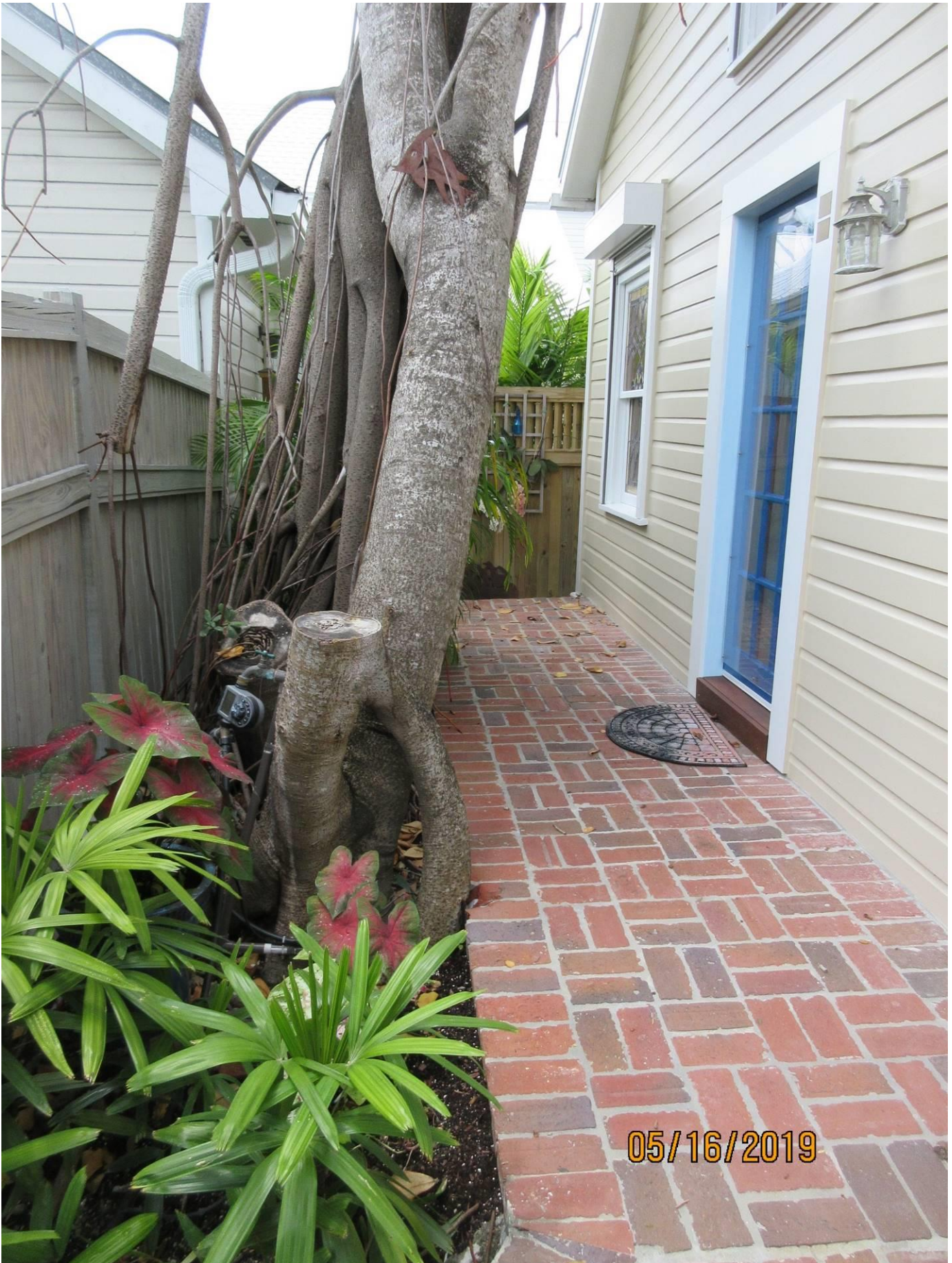
Photo of Autograph tree trunks view 1.