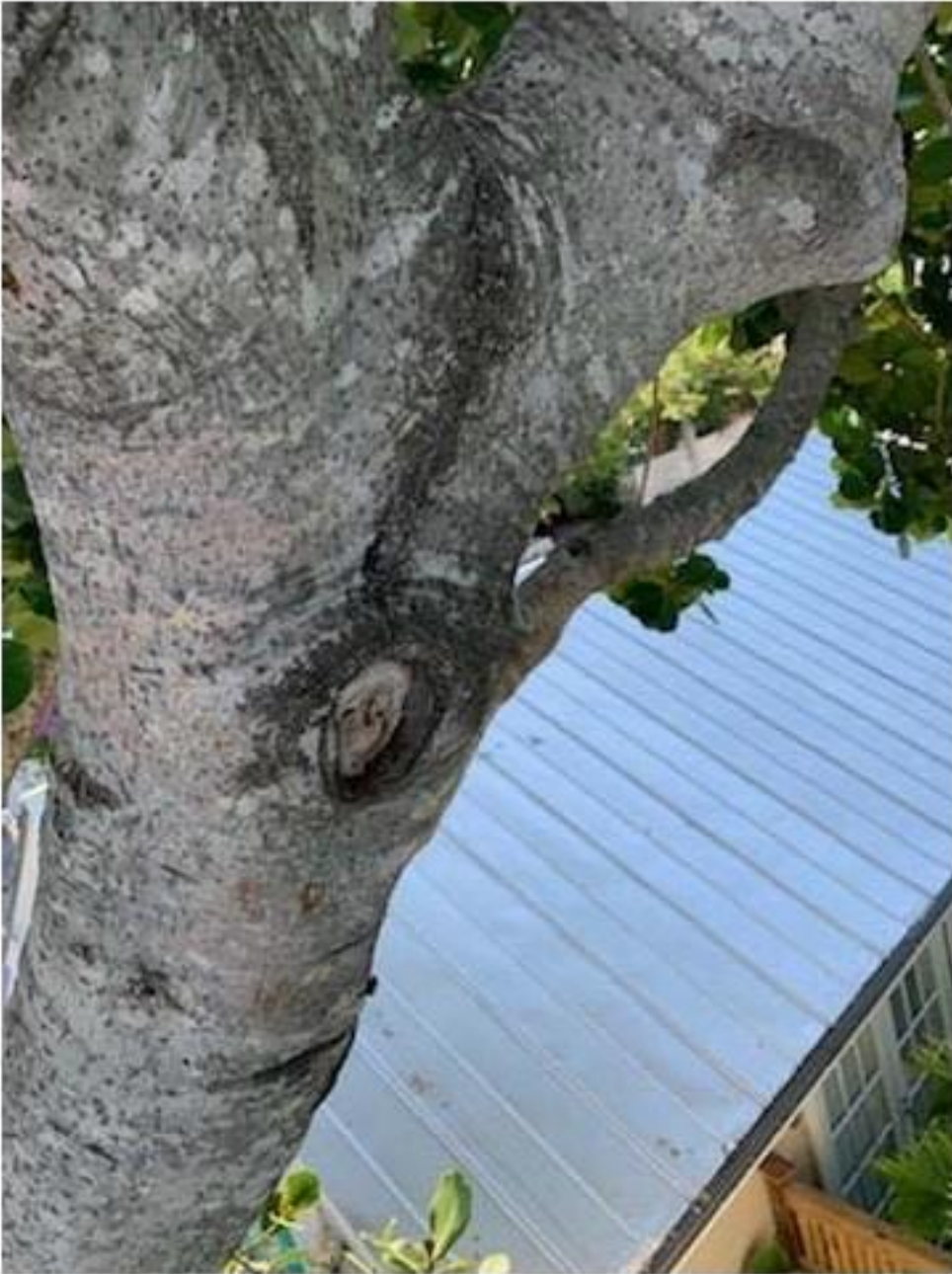
Photo of tree crotch in canopy.