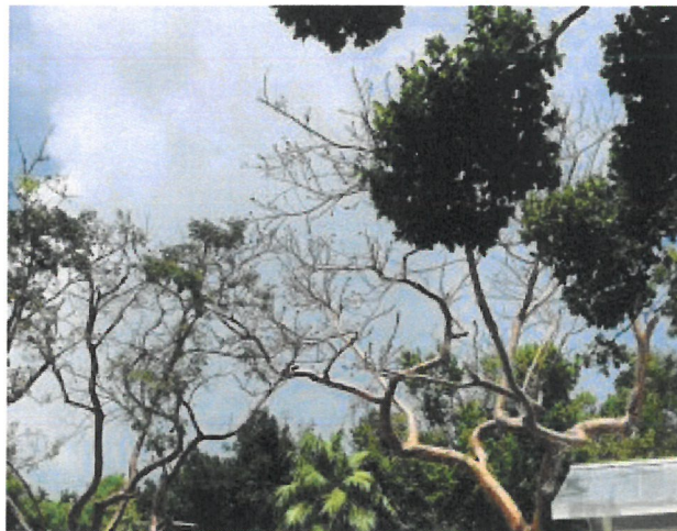
Gumbo limbo impacted by Imazypr

So what could be other causes of entire landscapes with this distorted growth? Herbicide damage. Many homeowners in the Florida Keys enjoy a landscape comingled with mature trees, landscape beds, and copious amounts of gravel covering otherwise rocky soils. However, this creates a perfect opportunity for weeds to exploit and take advantage of the open, barren space. Since many prefer a weed-free landscape, herbicides are often used. Herbicides are pesticides used to control unwanted vegetation in landscapes, ball fields, rights-of-way, farms, forests, aquatic environments and natural areas. They are very important management tools when used in addition to other types of control mechanisms. However, homeowners in many cases, pay little attention to label instructions, which includes site restrictions and rates. Presumptions are made that if it is available at retail stores, it must be safe to use.