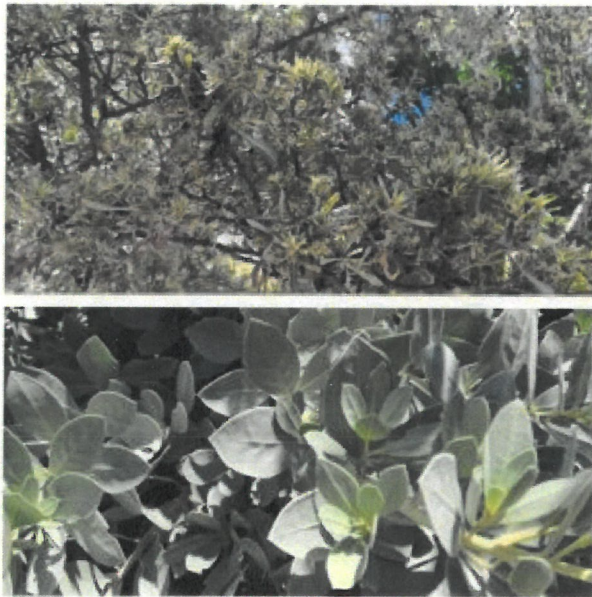
Herbicide damaged foliage (top) vs. healthy foliage (bottom)

What is killing my trees? This has been a common thread of some calls our office, and other departments within the County, have received recently. Distorted growth, severe stunting, and shoot proliferation have all been reported on mature Gumbo Limbo's and Buttonwoods. Initially,