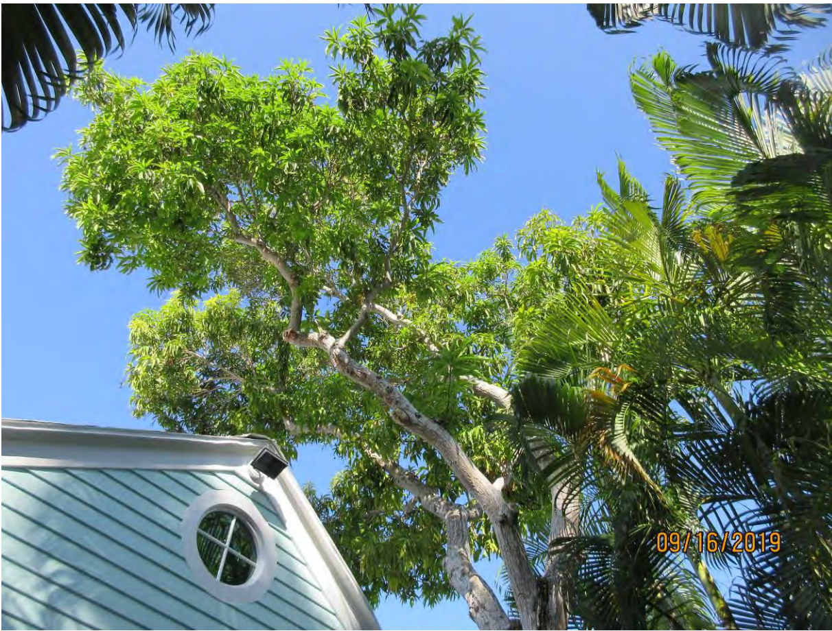
Photo of tree canopy, view 1.