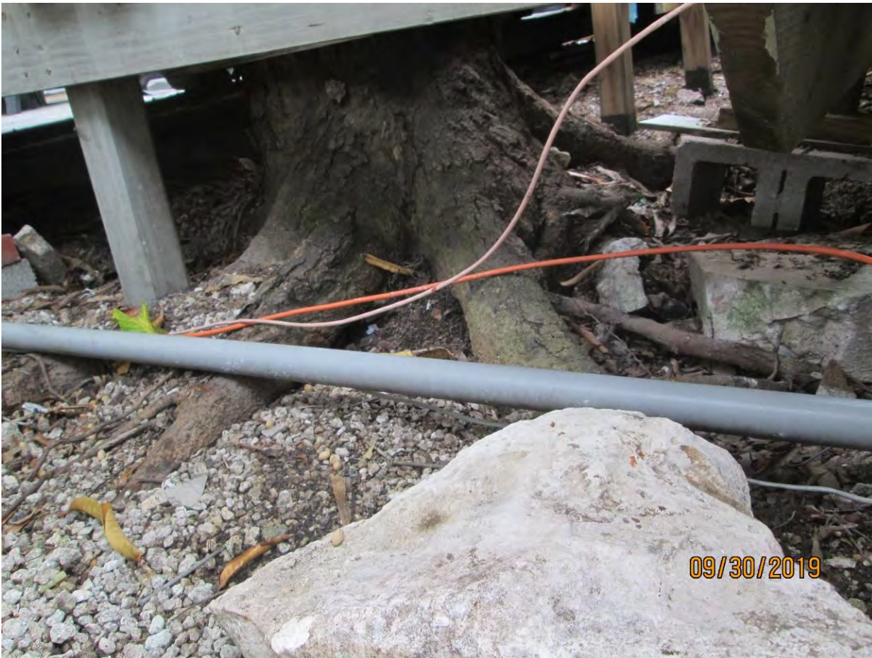
Photo of base of tree, showing root areas that had been uplifted in Hurricane Irma, view 2.