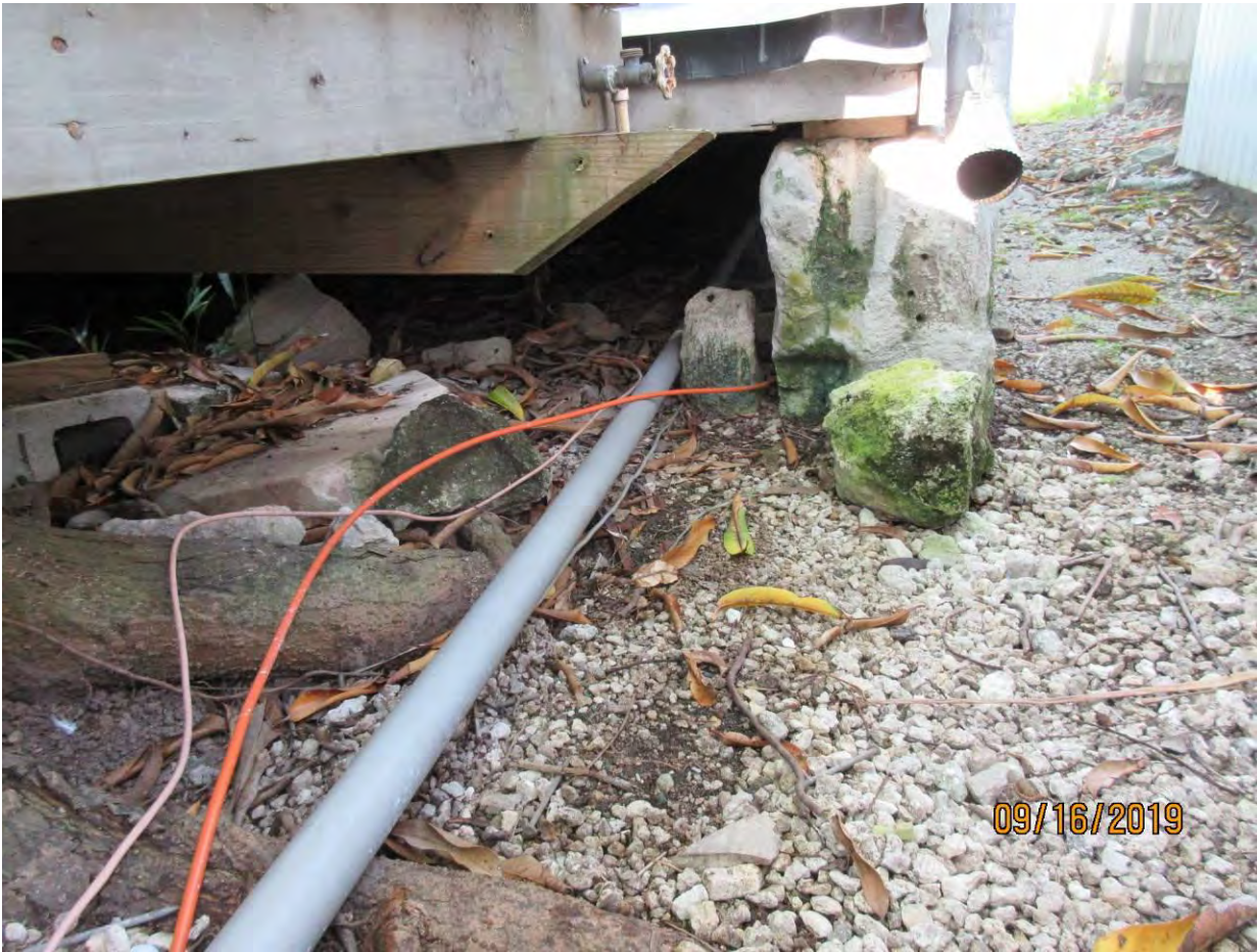
Photo of base of tree and roots growing toward house footer, view 2.