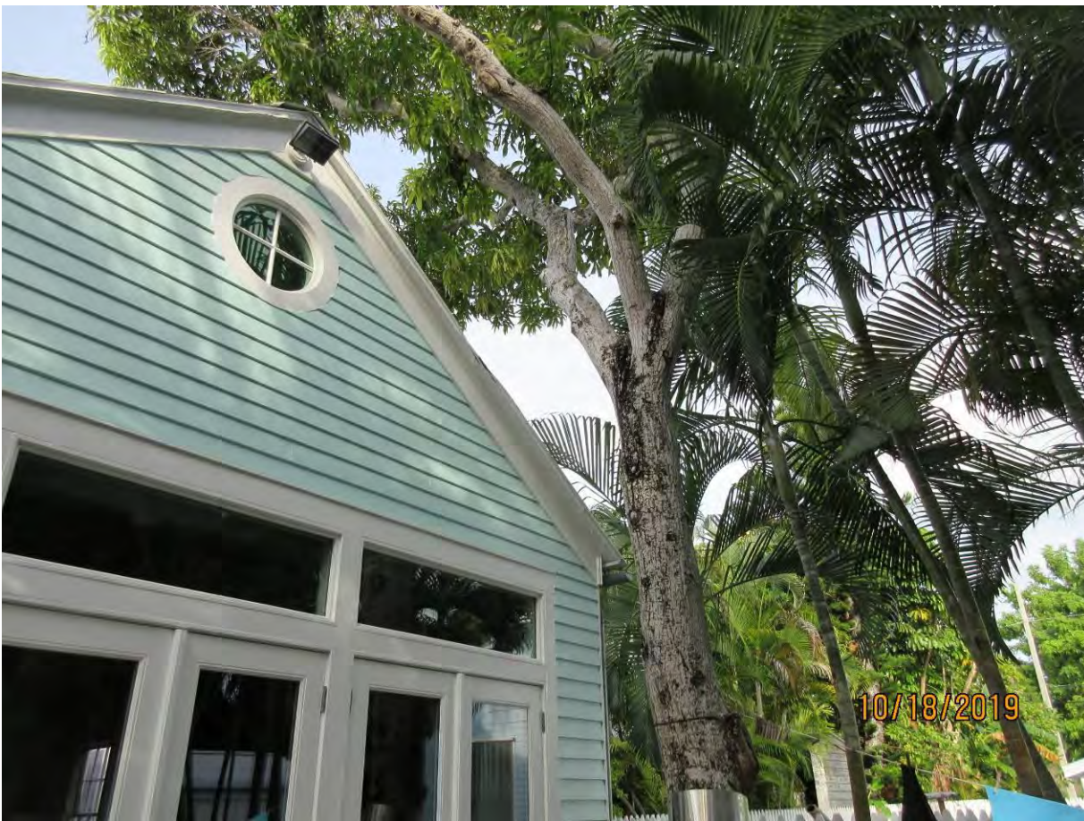
Photo of tree trunk, view 1.