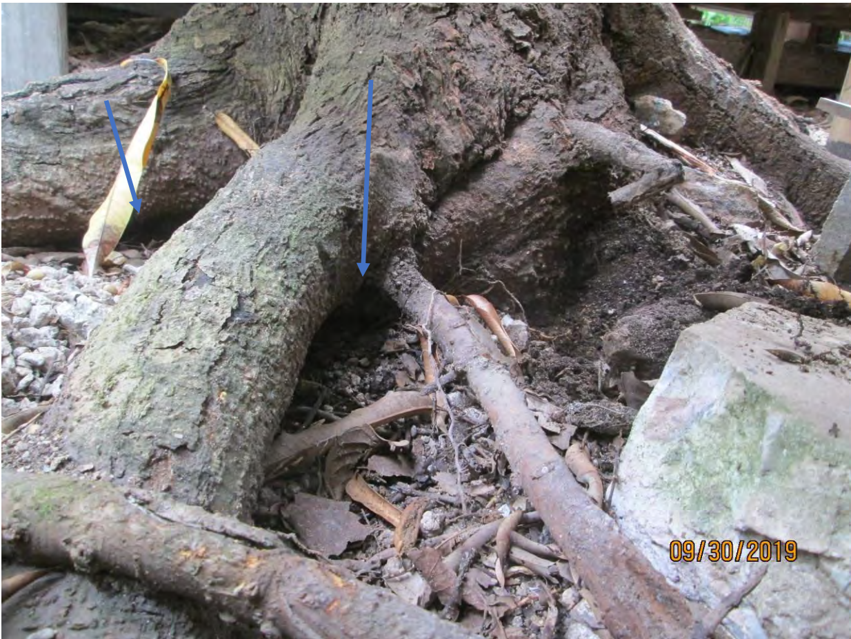
Close up photo of void areas, view 2.