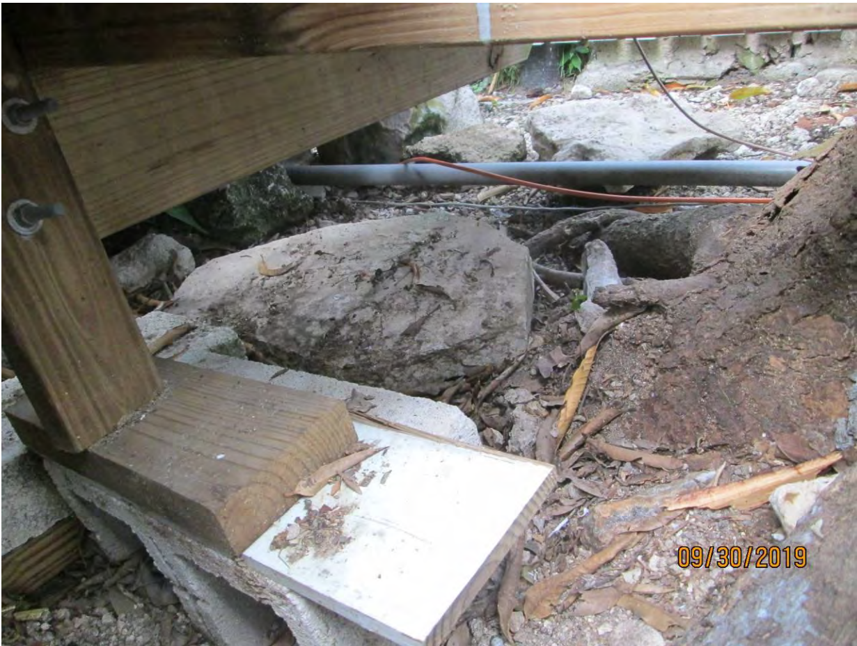
Photo of base of tree, showing root areas that had been uplifted in Hurricane Irma, view 1.