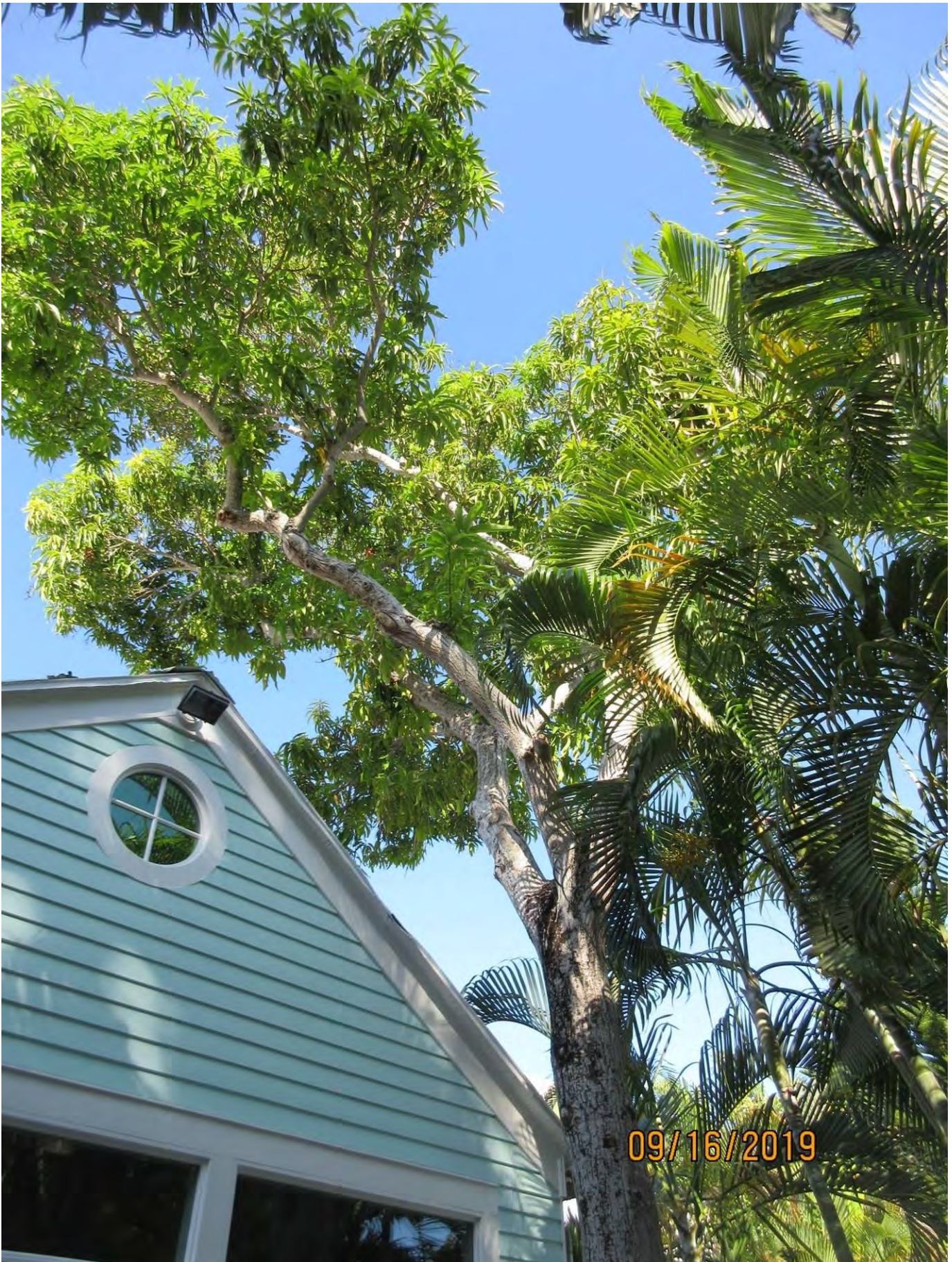
Photo of tree canopy over roof.