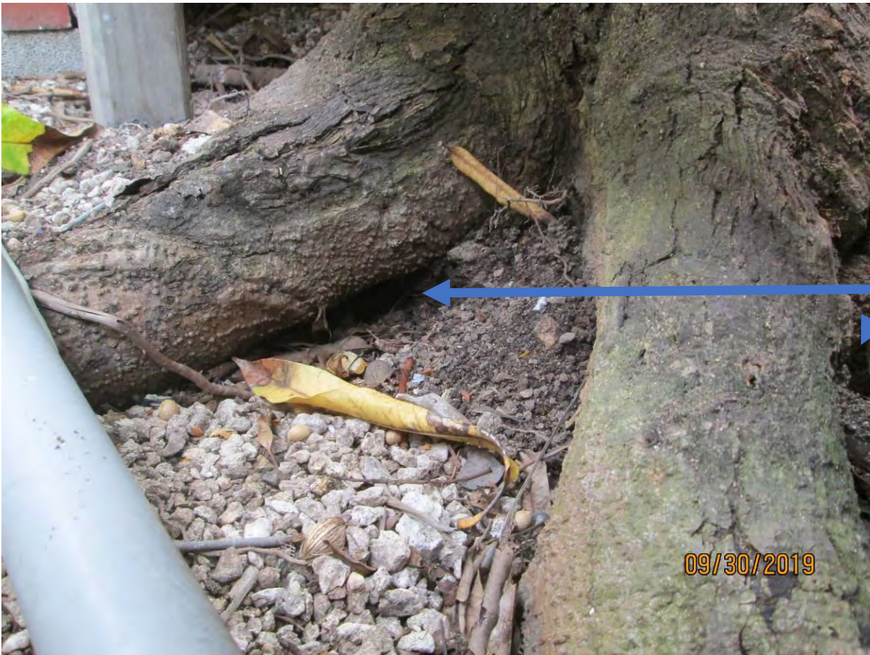
Close up photo of void areas, view 1.