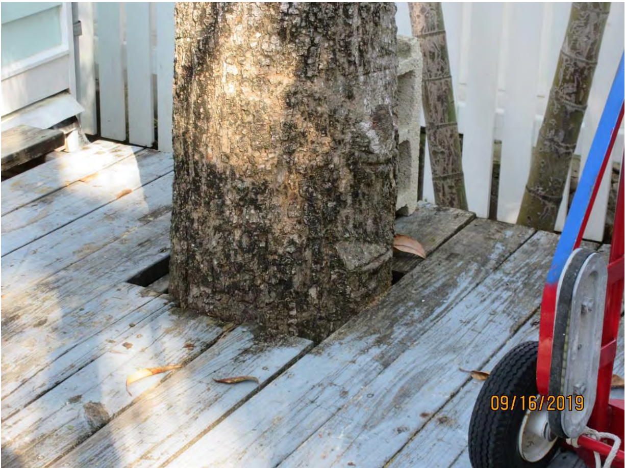
Photo of tree trunk at deck area, view 2.