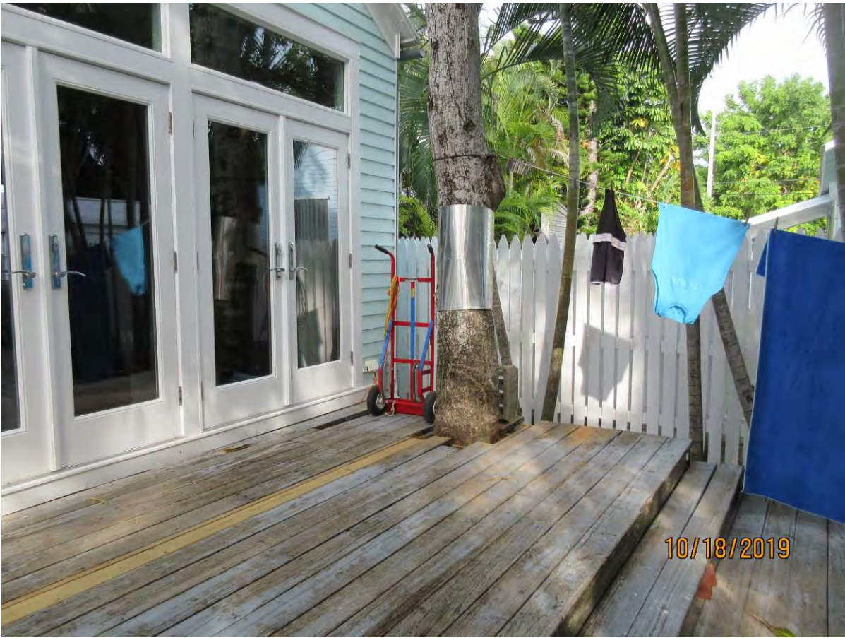
Photo of tree trunk, view 2.