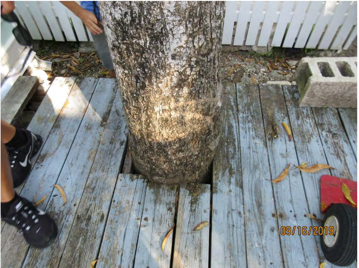
Photo of tree trunk at deck area, view 1.