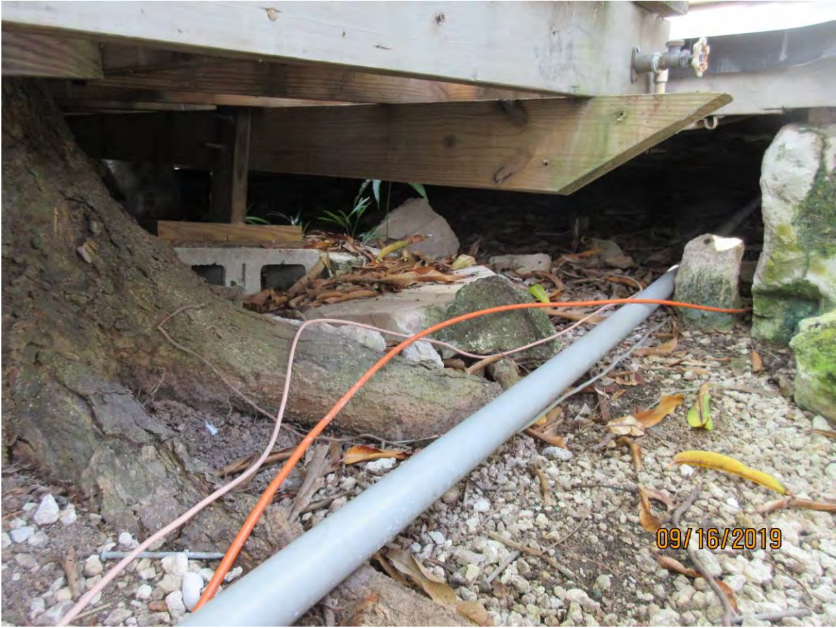
Photo of base of tree and roots growing toward house footer, view 1.