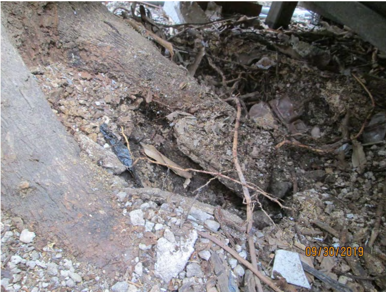
Close up photo of void areas, view 3.