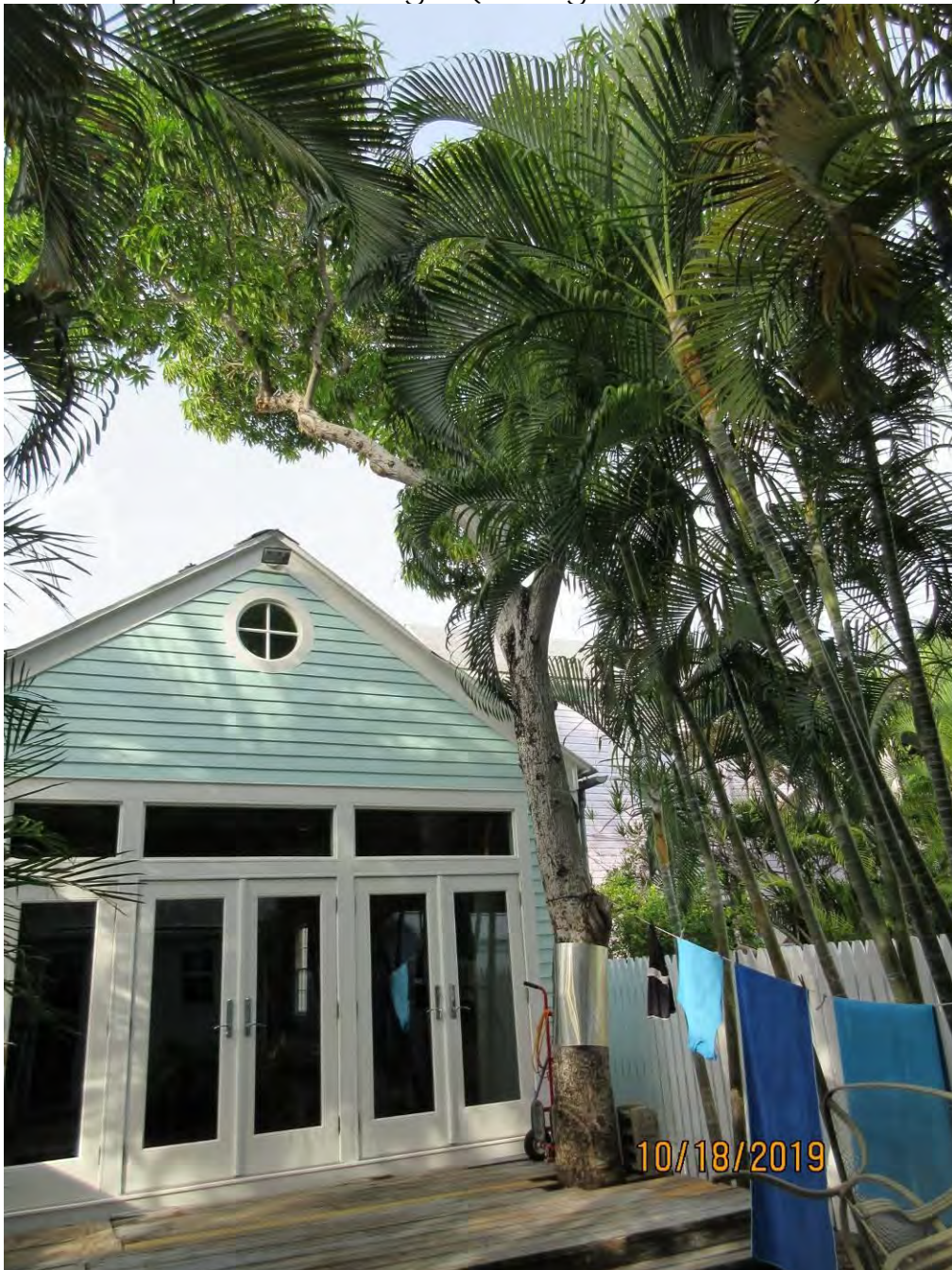
Photo of mango tree in back yard near structure

Tree Species: Mango ( Mangifera indica )