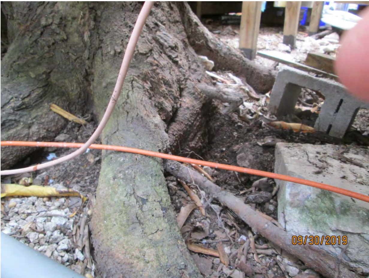
Photo of base of tree, showing root areas that had been uplifted, view 3.