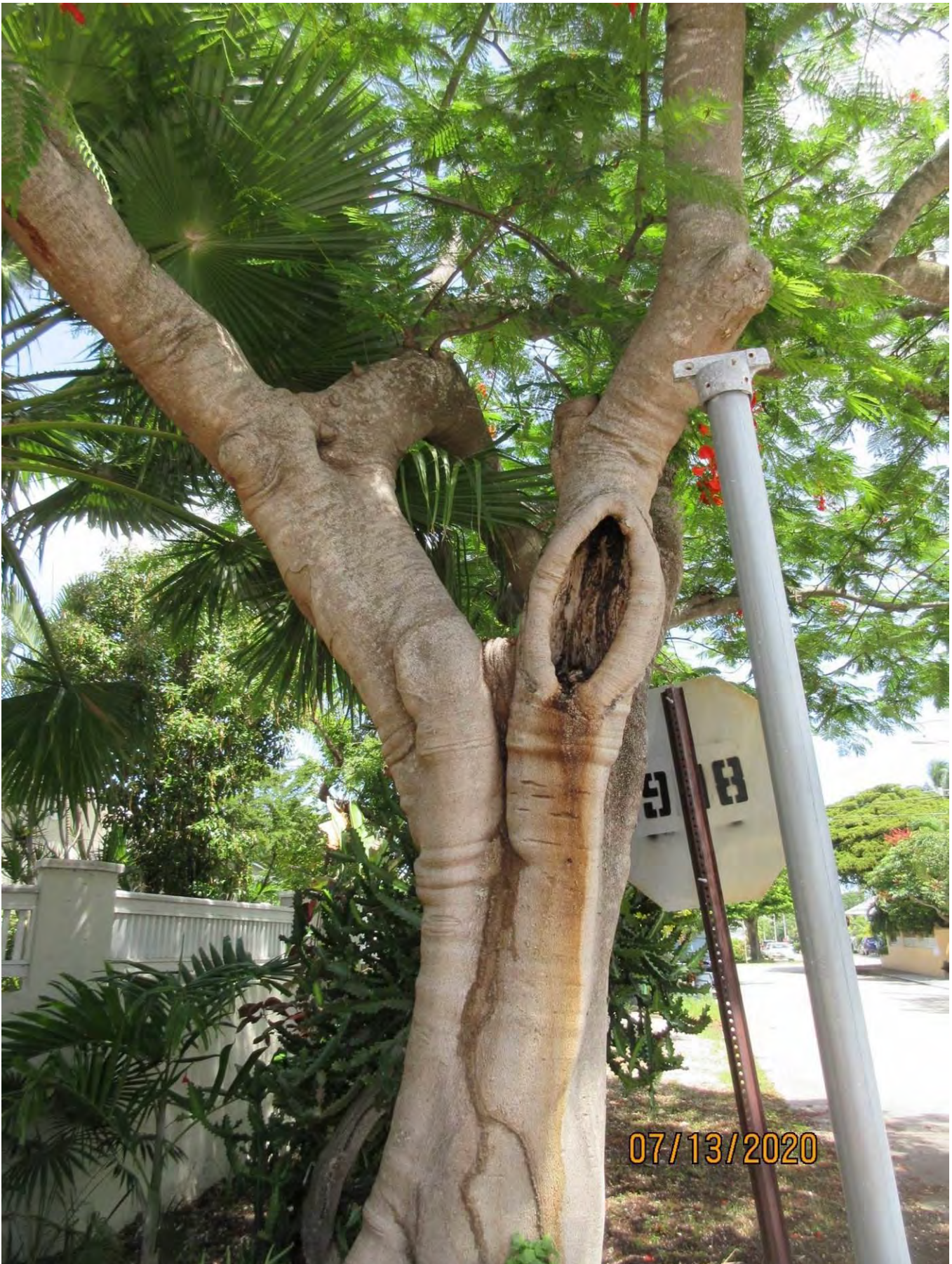
Photo of tree trunk and crotch area. Main trunk breaks off into two main trunks. Note major decay at base of one trunk and termite trails