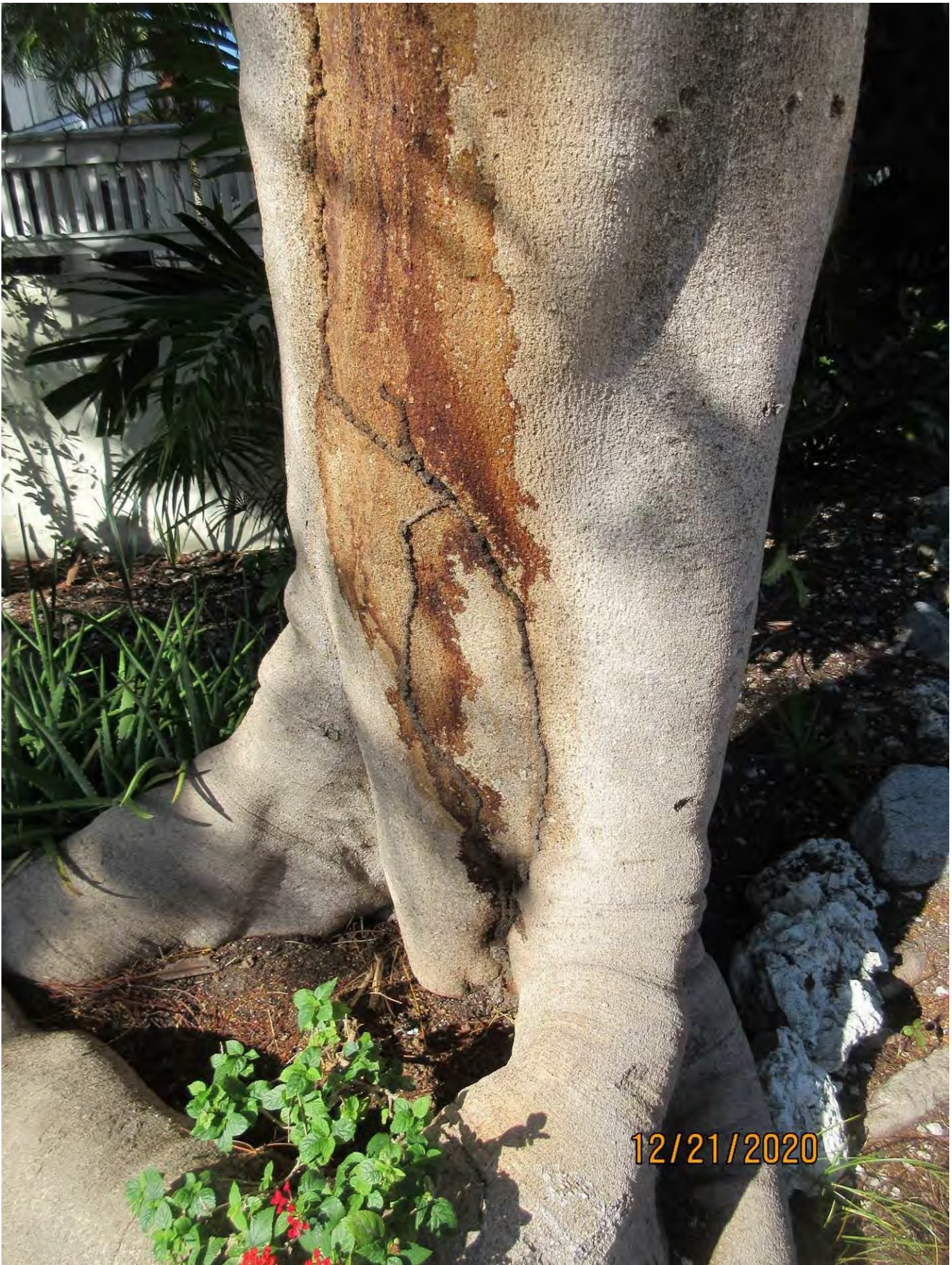
Photo of base of tree and tree trunk, view 1. Photo shows termite trails going up trunk and frass at base of tree.