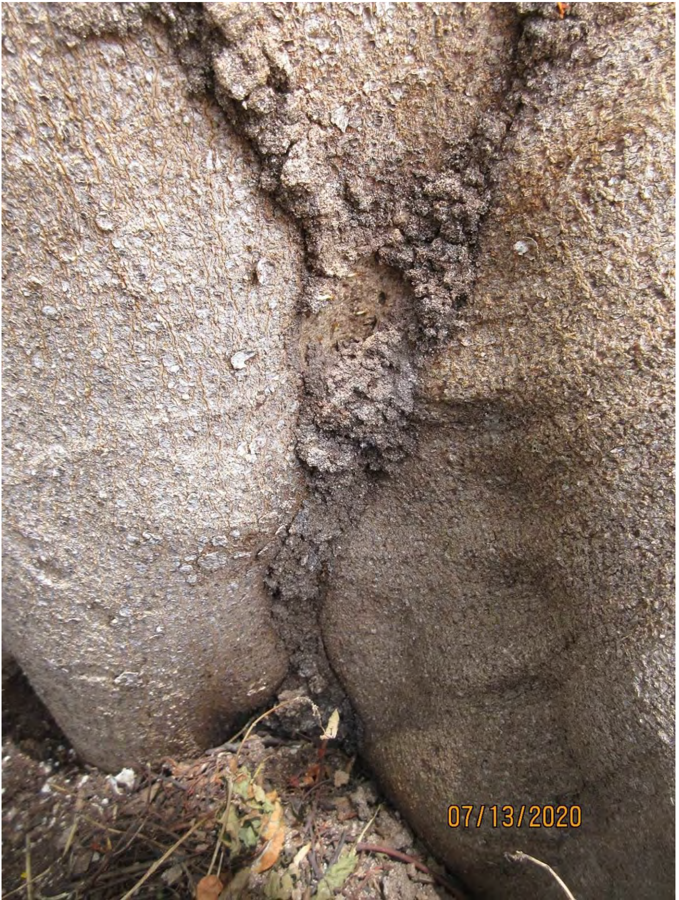
Close up photo of mud trails and live termites, view 2.