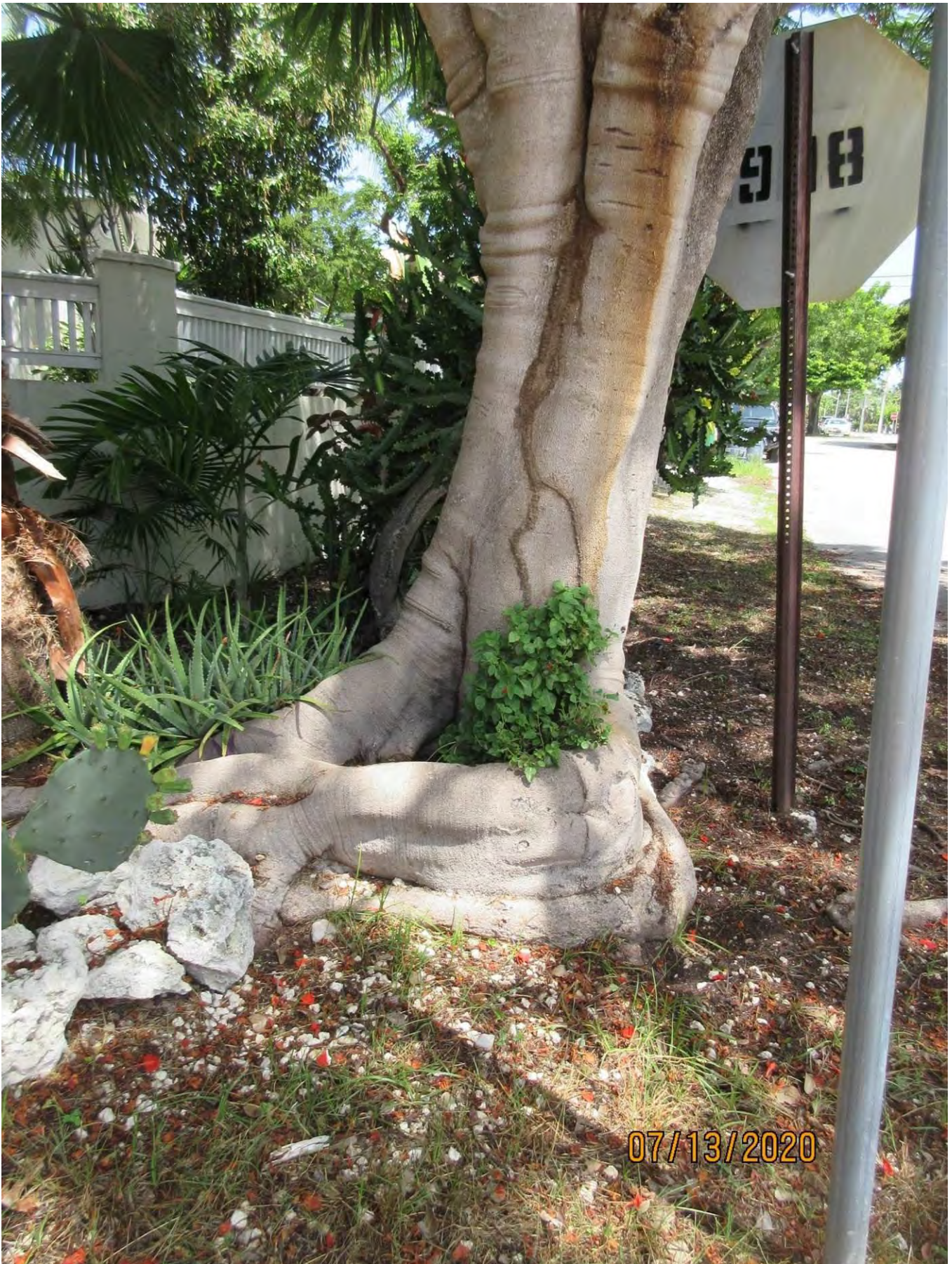
Photo showing base and trunk of tree, view 2.