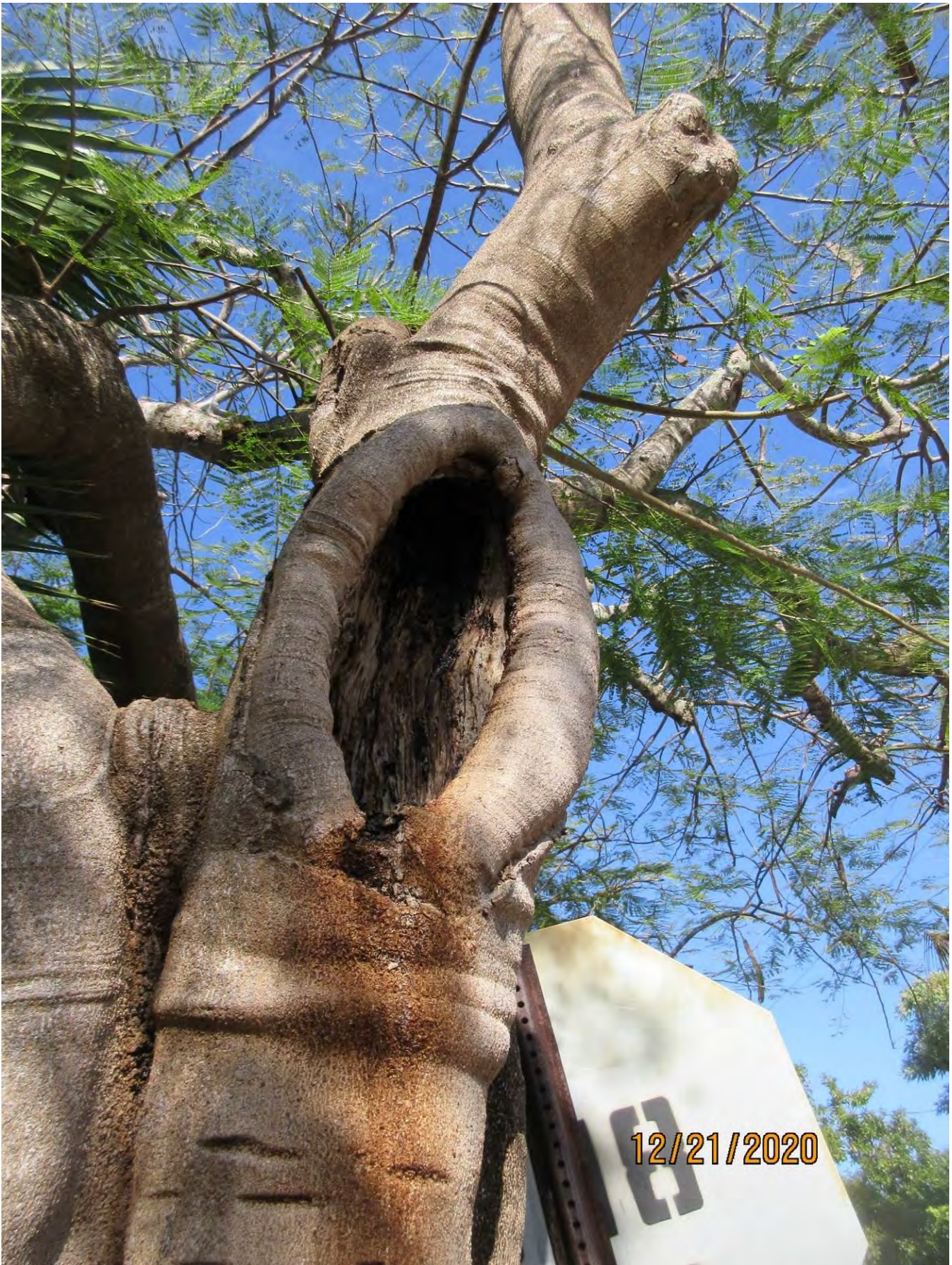
Photo showing crotch area of the tree trunk and major decay at connection with large branch/trunk.