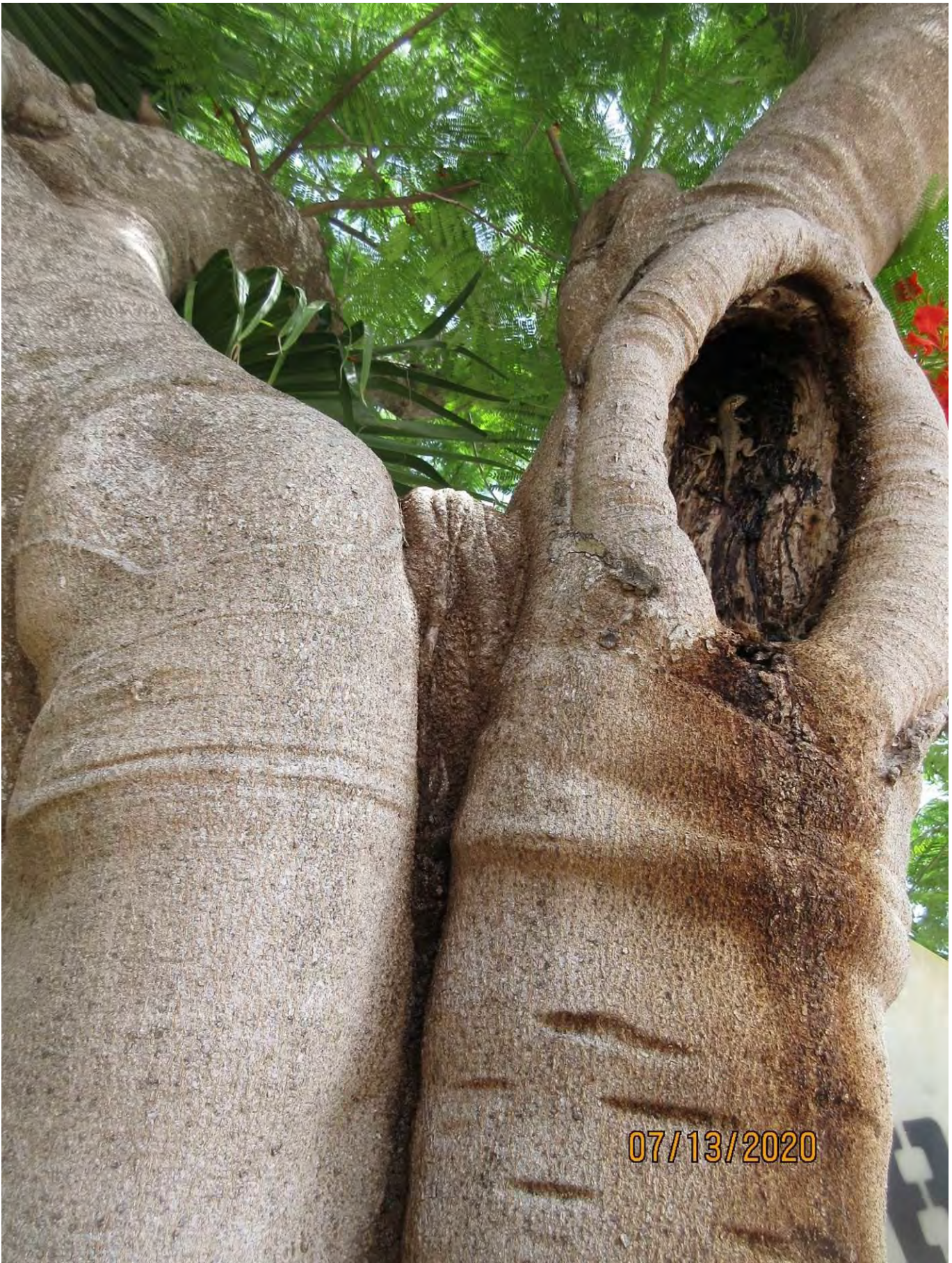
Close up photo of crotch area juncture.