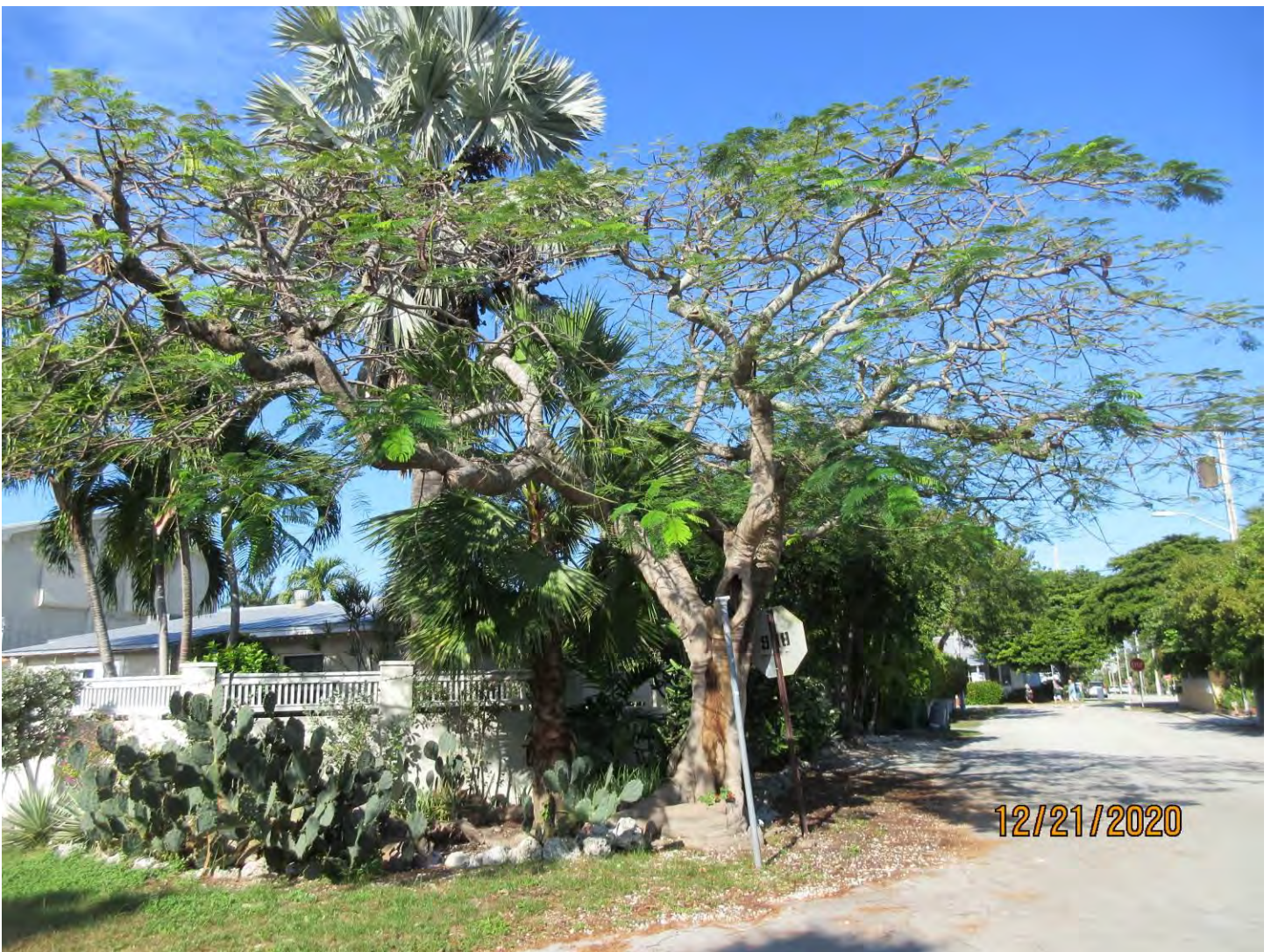
Photo of whole tree at corner of Johnson and Thompson Streets, taken December 2020.

Tree Species: Royal Poinciana ( Delonix regia )