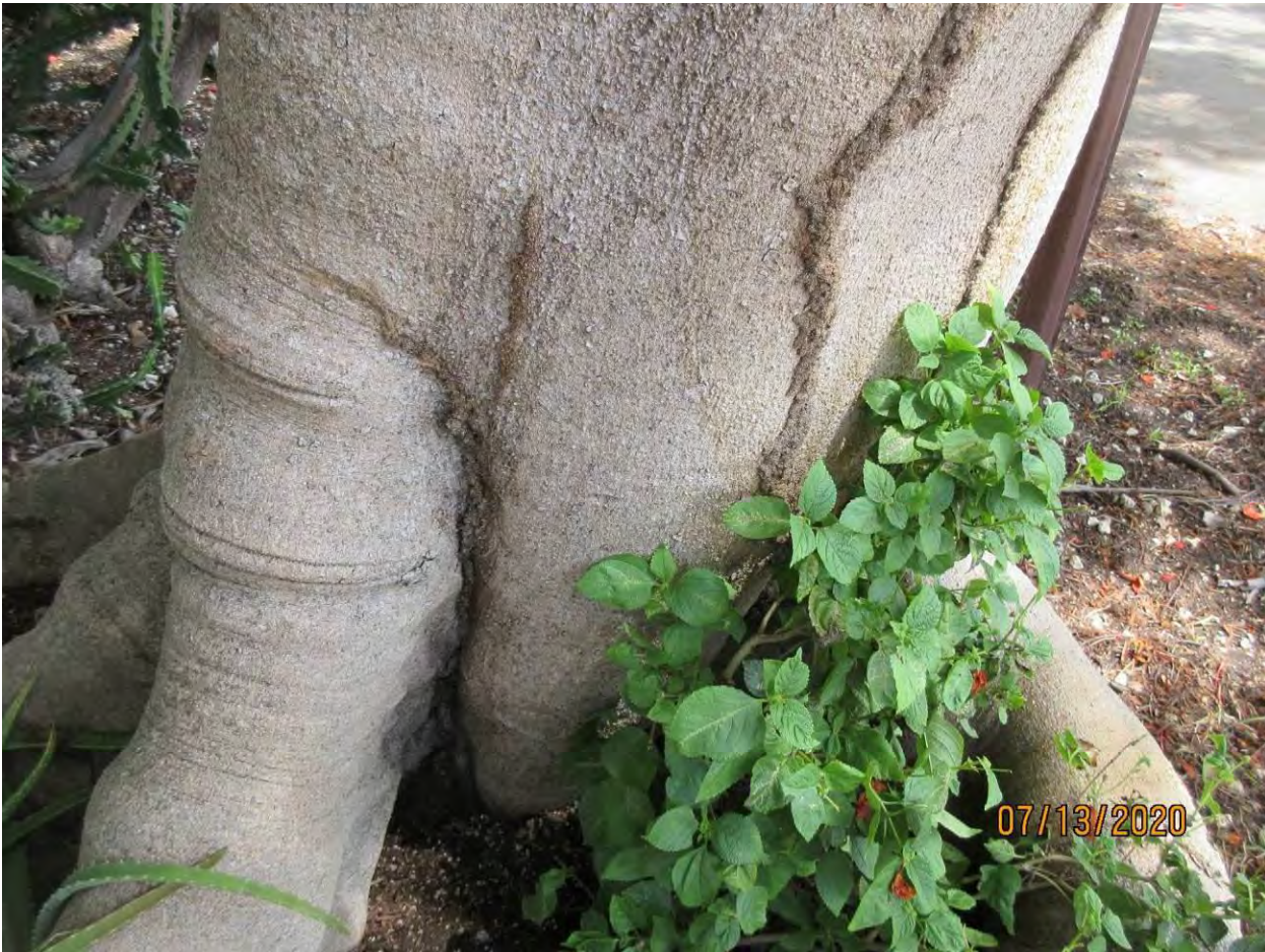
Photo showing base of tree and termites trails.