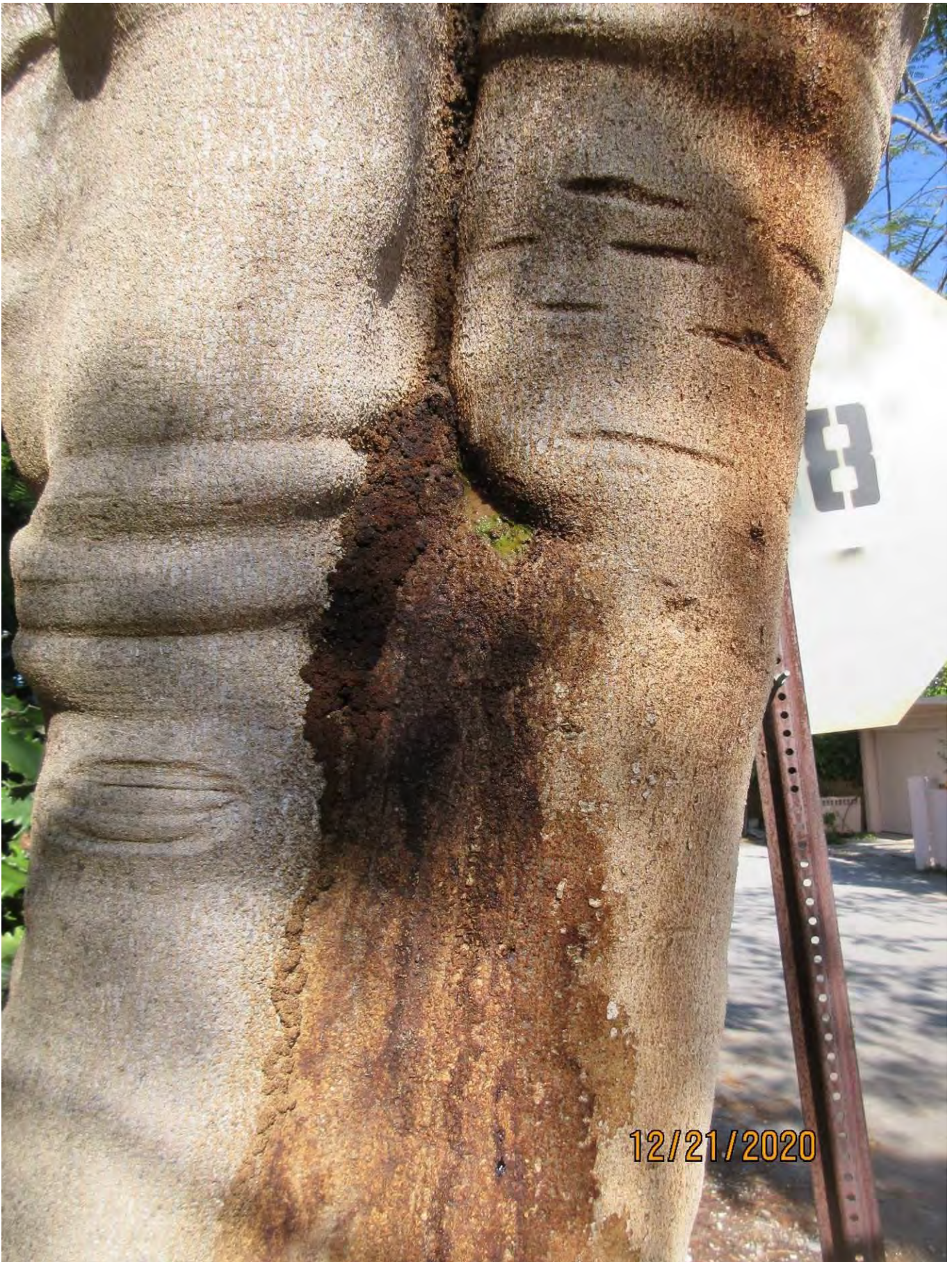
Photo of tree trunk, view 2. Not large area of termite mud trail closer to crotch of tree.