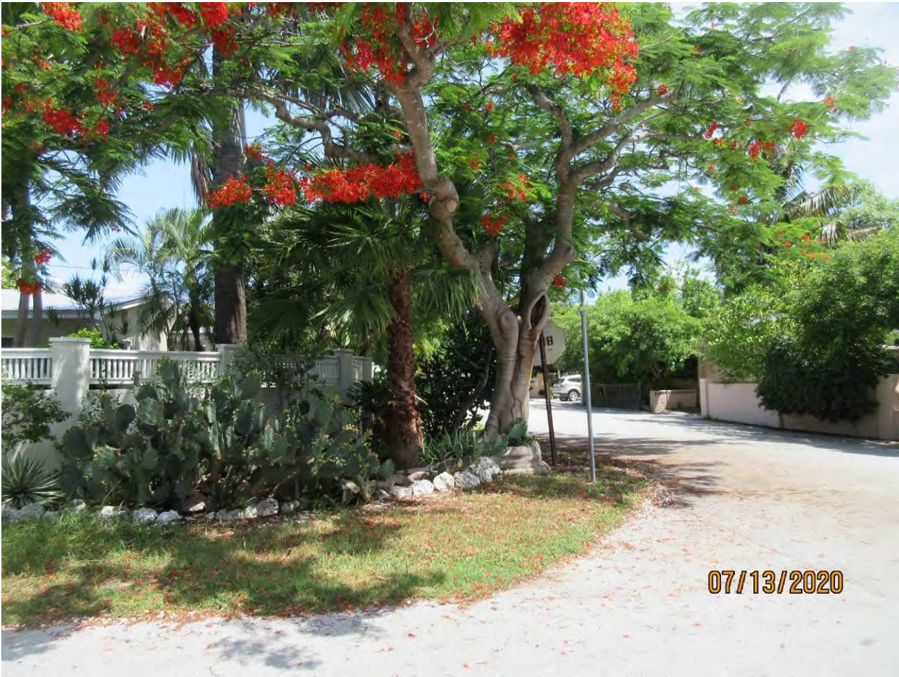
Photo of whole tree taken in July 2020.