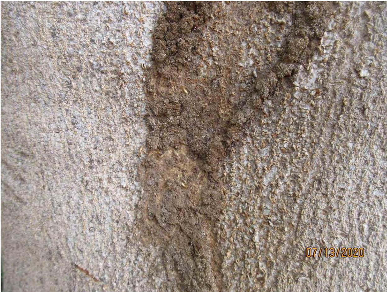
Close up photo of mud trails and live termites, view 1.