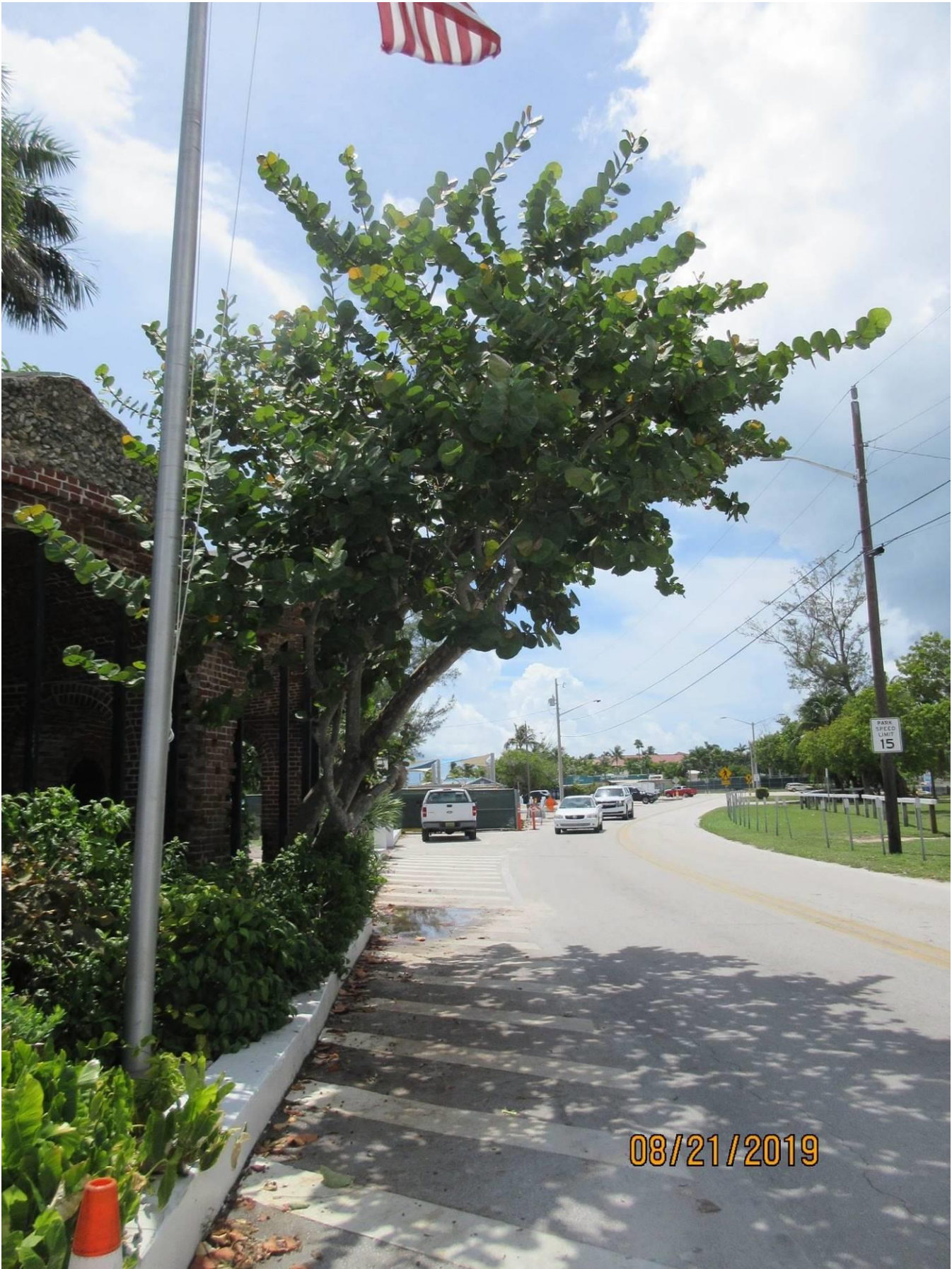
Photo of whole Sea Grape tree, street view 4.