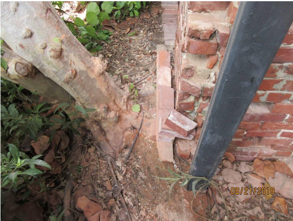
Photo showing base of tree close to wall, view 1