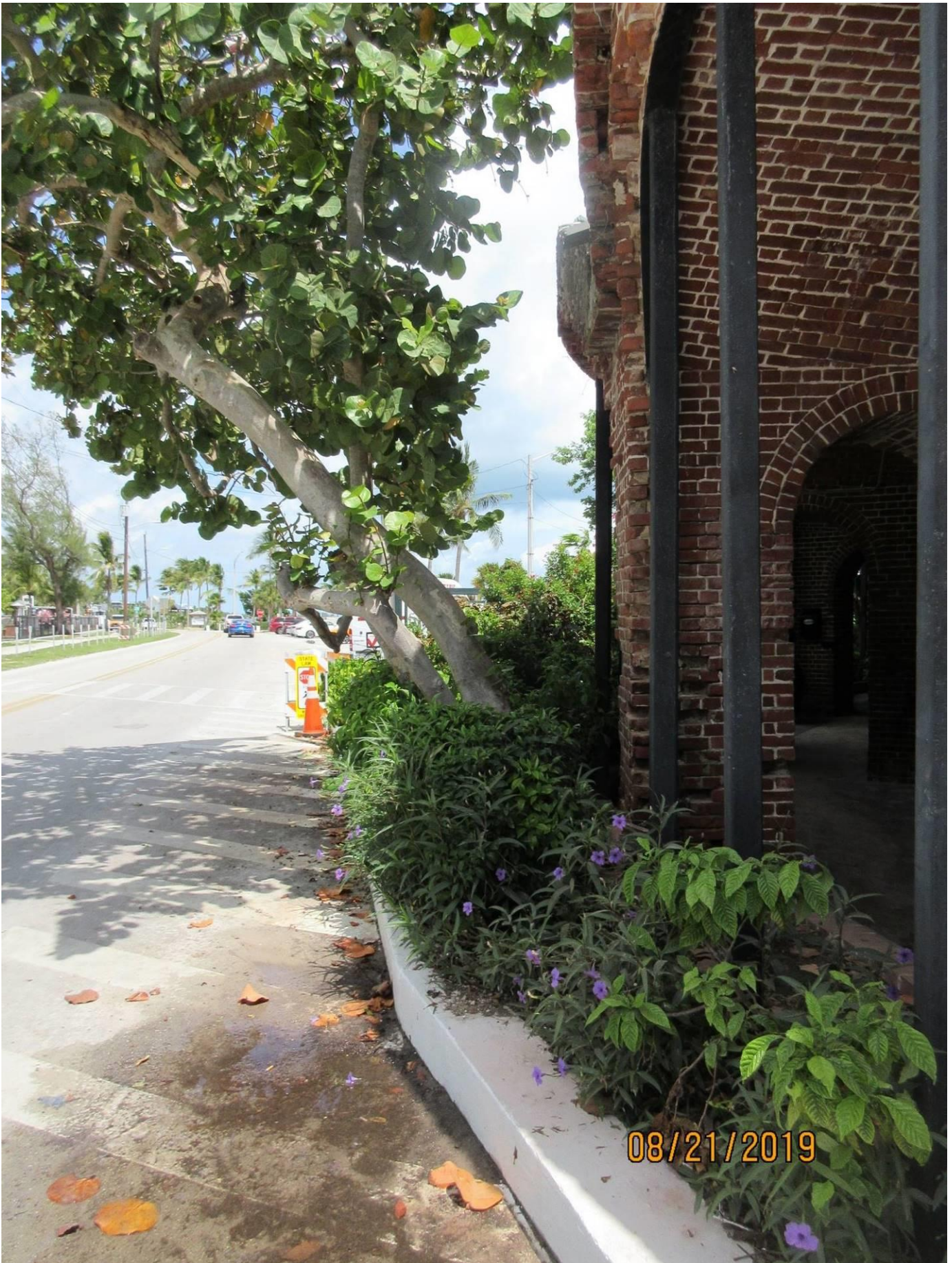
Photo of whole Sea Grape tree, street view 3.