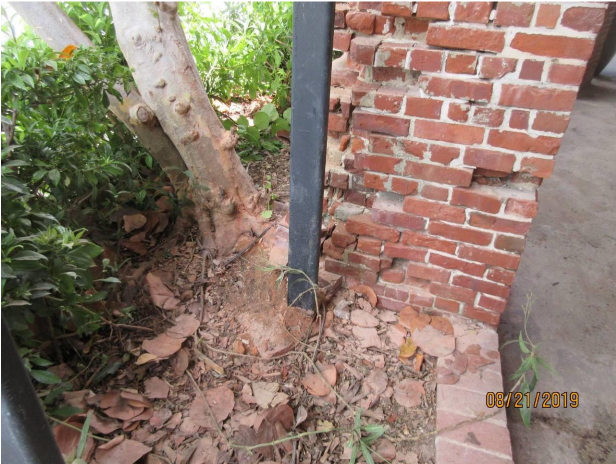
Photo showing tree trunks close to wall, view 1