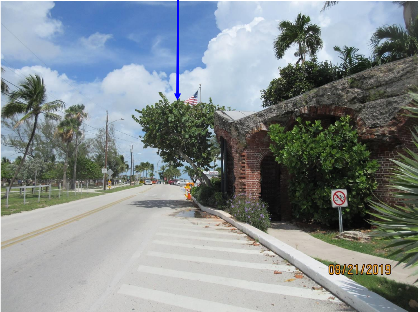
Photo of whole Sea Grape tree, street view 1.

Tree Species: Sea Grape ( Coccoloba uvifera )