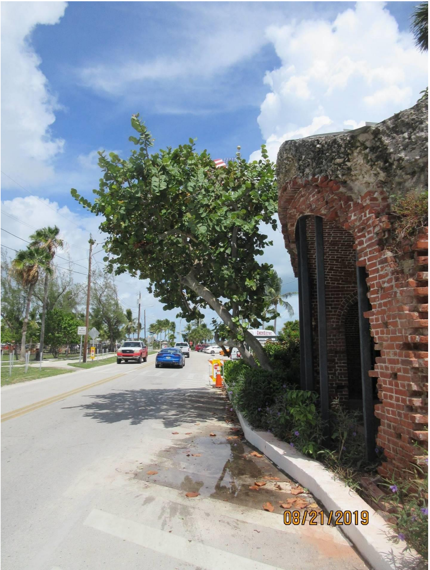
Photo of whole Sea Grape tree, street view 2.