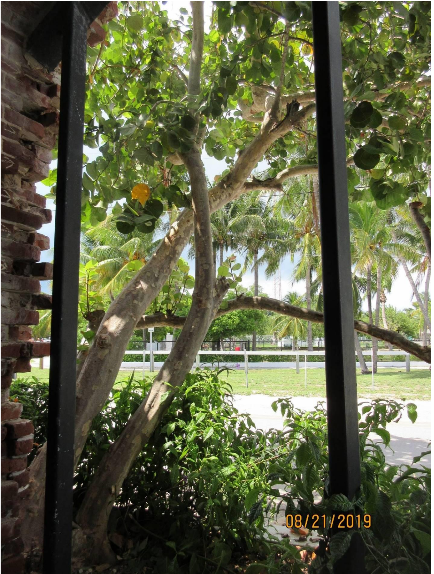
Photo of tree trunk from inside walkway area.