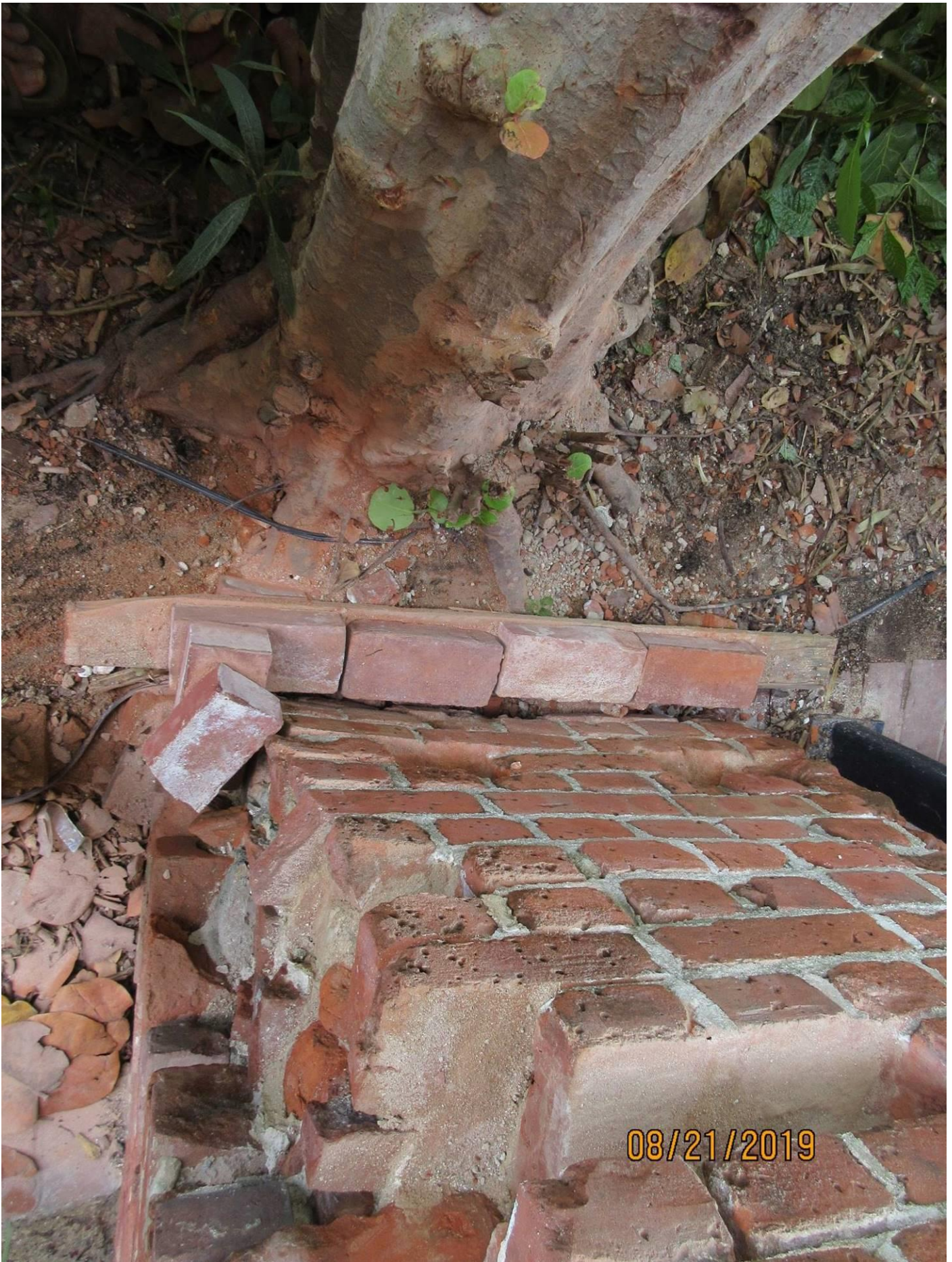
Photo showing base of tree close to wall, view 2.