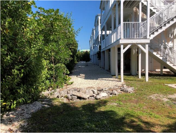
Multifamily at Sunset Marina to the northeast