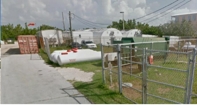
Fuel tanks and empoundment area