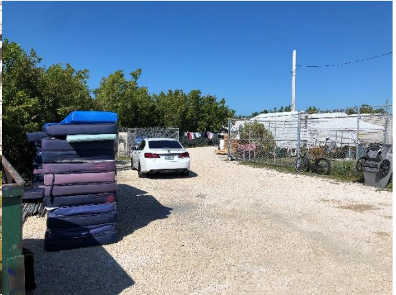
Entry to existing KOTS facility