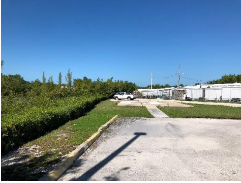
Sherriff's helicopter pad and parking