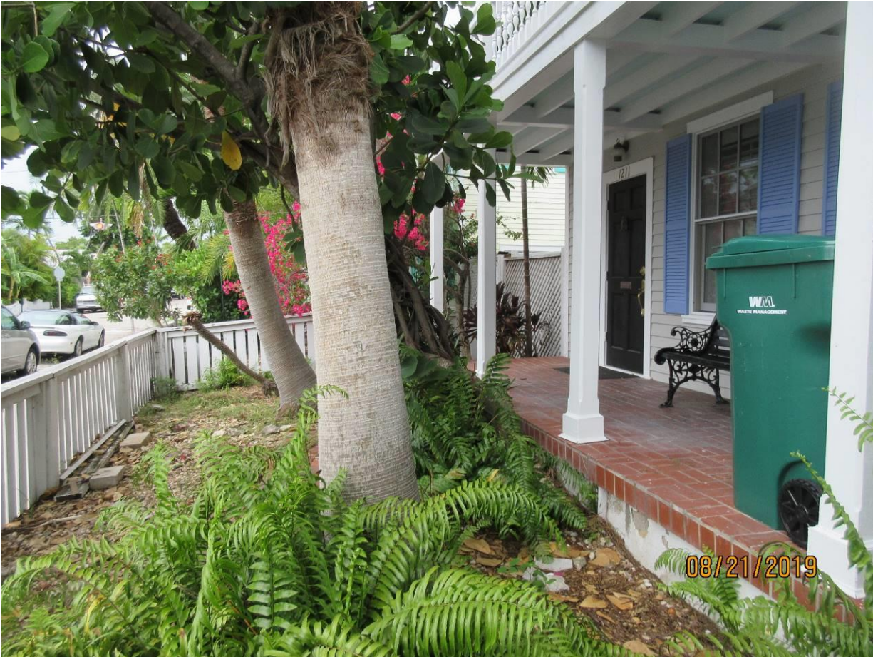
Photo of tree view 2.