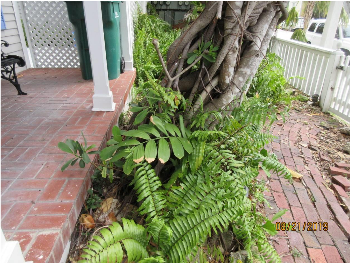
Photo of tree trunk next to structure.