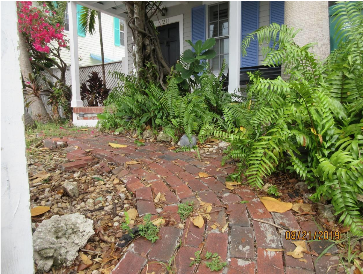
Photo of entrance to house and sidewalk pavers and base of tree.