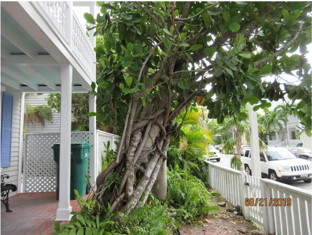
Photo of tree view 1.