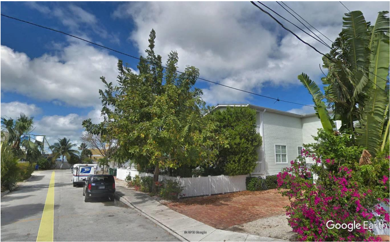
Photo dated March 2019