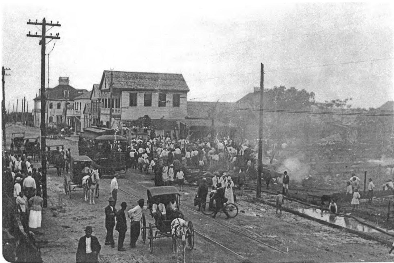
MM 000 21075 Fire at Gato Cigar Factory on Simonton Street on December 17, 1915