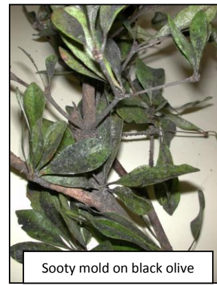
Sooty mold on black olive

Management in the Landscape: Often, when new pests arrive, they can reach very high populations and can be extremely damaging. It is not uncommon, however, that after several years, the impact is greatly reduced. Although it may be necessary to use insecticides for this pest, it is very important to understand the importance of natural enemies and the need to focus on long-term, biologically based management.