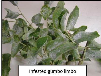
Infested gumbo limbo