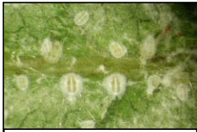
Whitefly immature stages

from the eggs and crawls around before it starts to feed with its “needle-like” mouthparts. This stage is very small and difficult to see.