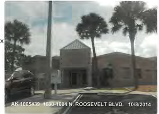
AK 1065439 - 1600-1604 N. ROOSEVELT BLVD. 10/8/2014

Parcel ID 00064920-000000 Account# 1065439 Property ID 1065439 Millage Group 10KW Location 1604 N ROOSEVELT Blvd, KEY WEST Address Legal KW PT SEC 5 TWP 68S R 25E LYING NWLY OF TR 20 S OF BLVD G46-57/58 (RE72082-003600 COMBINED WITH THIS PARCEL FOR THE 1998 TAX Description ROLL 11/20/97) OR1603-149Q/C (Note: Not to be used on legal documents.) Neighborhood 32230 Property Class MUNICIPAL (8900) Subdivision Sec/Twp/Rng 05/68/25 Affordable No Housing