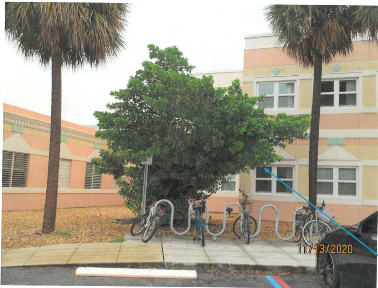
Tree #2 Autograph tree