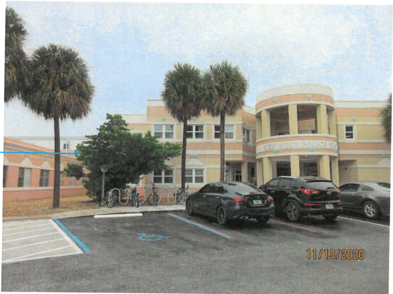
Tree #2- Autograph tree