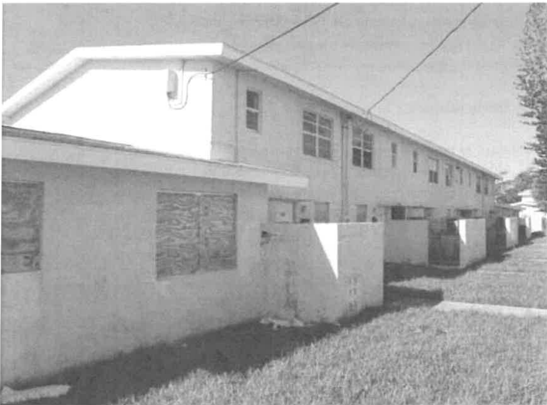
The Navy demolished 166 housing units at Sigsbee Park in May 2021 after they flooded in Hurricane Wilma in 2005 and sat empty for 16 years.

S o much for a learning curve. Capt. Beth Regoli, the new commander of Naval Air Station Key West, barely had time to unpack before running headlong into Key West's housing crisis.