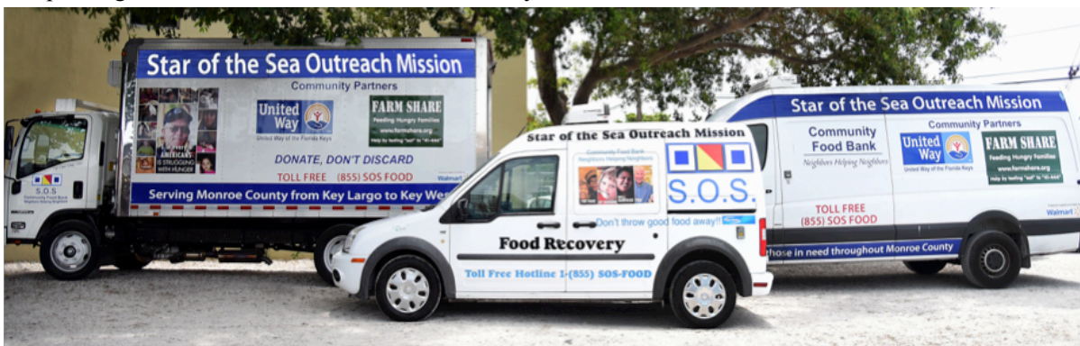
SOS trucks (pictured L to R): Isuzu NPR, Ford Transit Connect, and Mercedes-Benz Sprinter.

Food Delivery/Pick-up – Food deliveries from the SOS Kitchen to feeding sites as well as the majority of food deliveries to the Kitchen will be made in the Food Transit Connect. The Mercedes-Benz Sprinter will also deliver to the Kitchen between two and four times per week while the largest Isuzu NPR will make very occasional deliveries, most likely less than two times per month. All food will be loaded and unloaded via the City Hall parking lot, and SOS will not utilize Seminary Street.