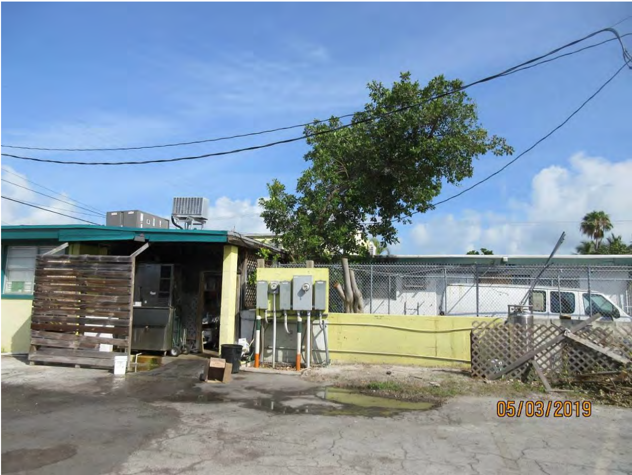
Photo of impacted tree area view 1