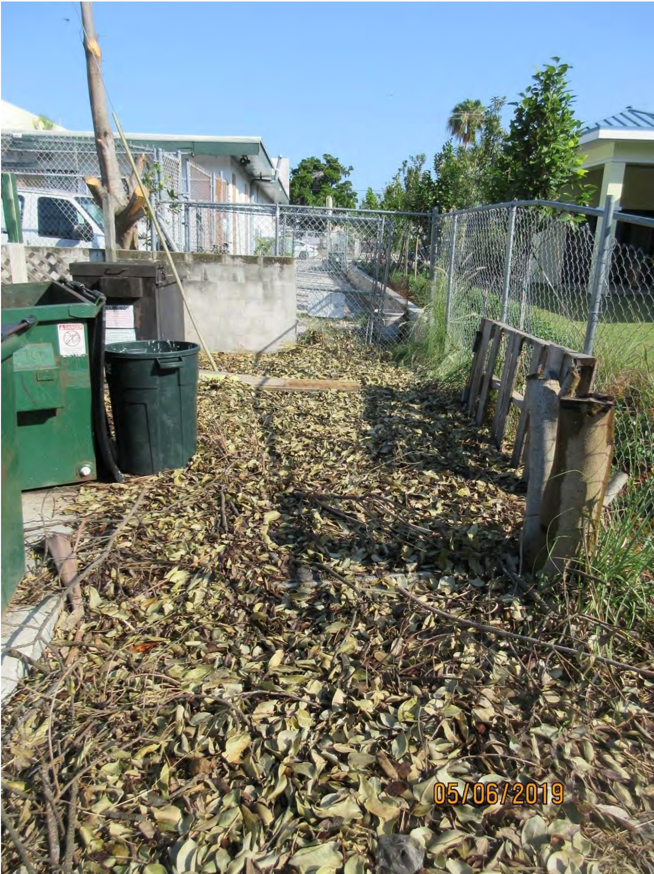
View of tree #7 and #8.