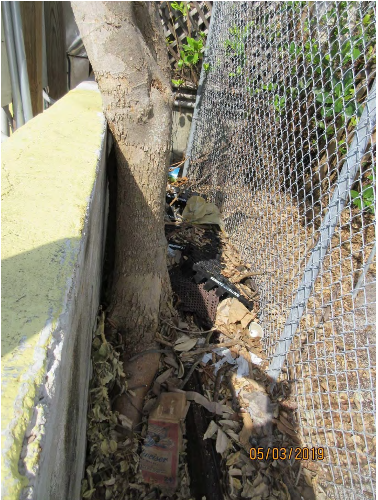
Closeup photo of tree #1, view 2.