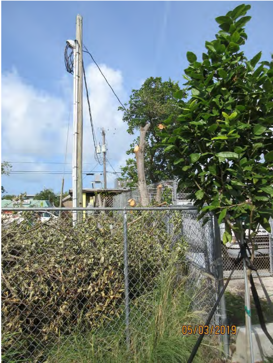
Standing on neighboring property looking at tree impact area.

On May 3, 2019, while inspecting installed landscaping on a neighboring property, it was noticed that several trees have been cut down on the adjacent property. A site inspection documented the entire canopies of some Strangler Fig and Jamaican Dogwood trees had been removed leaving only tree trunks.