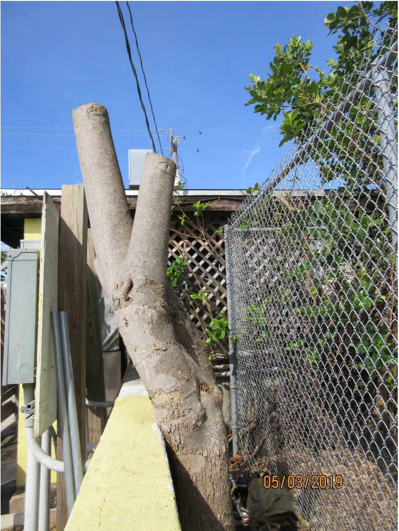
Close up photo tree #1, view 3.