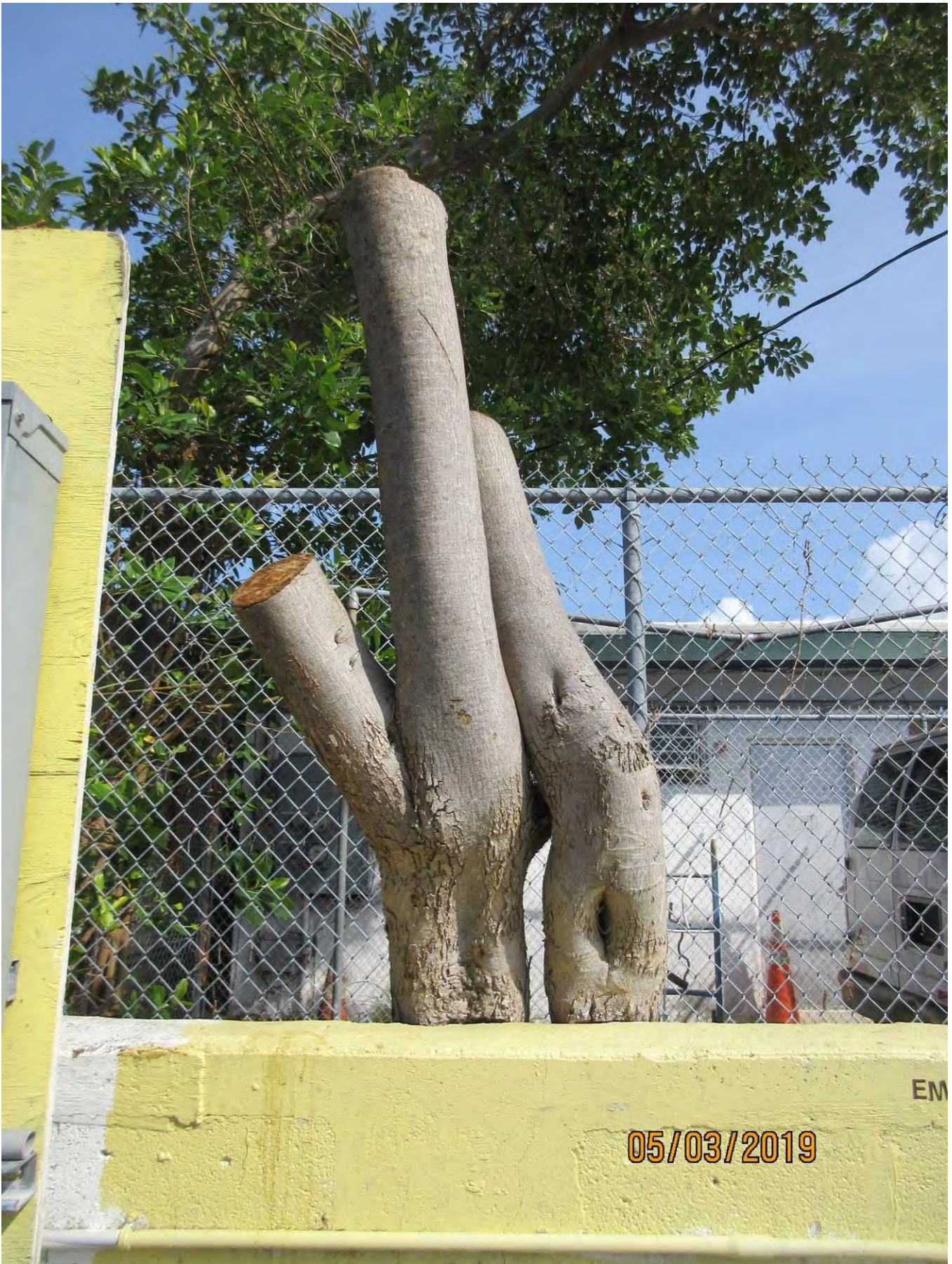
Close up photo of tree #1.