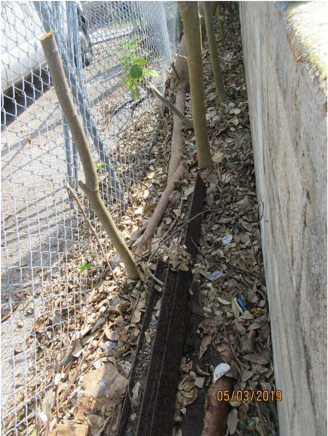
Closeup photo trees #2-#6.