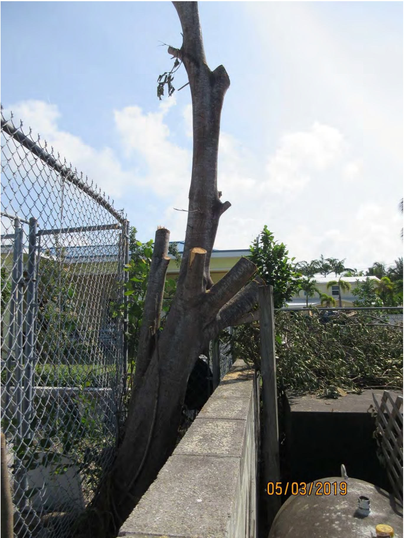
Close up view tree #7.