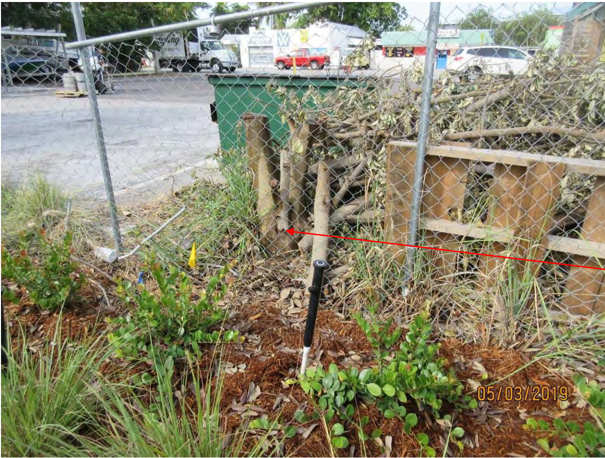
Standing on neighboring property looking at debris pile and impacted tree.