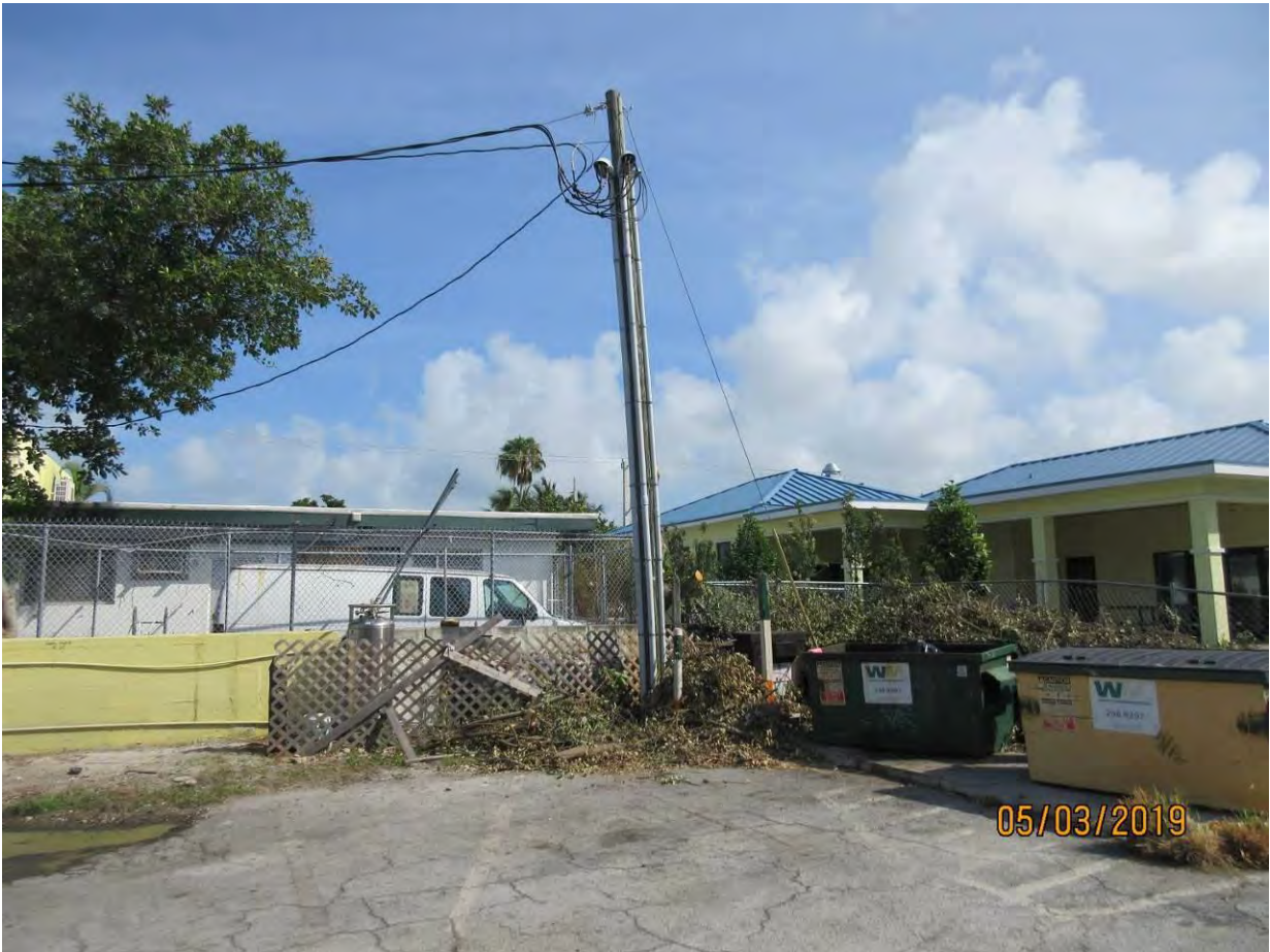
Photo of impacted tree area view 2