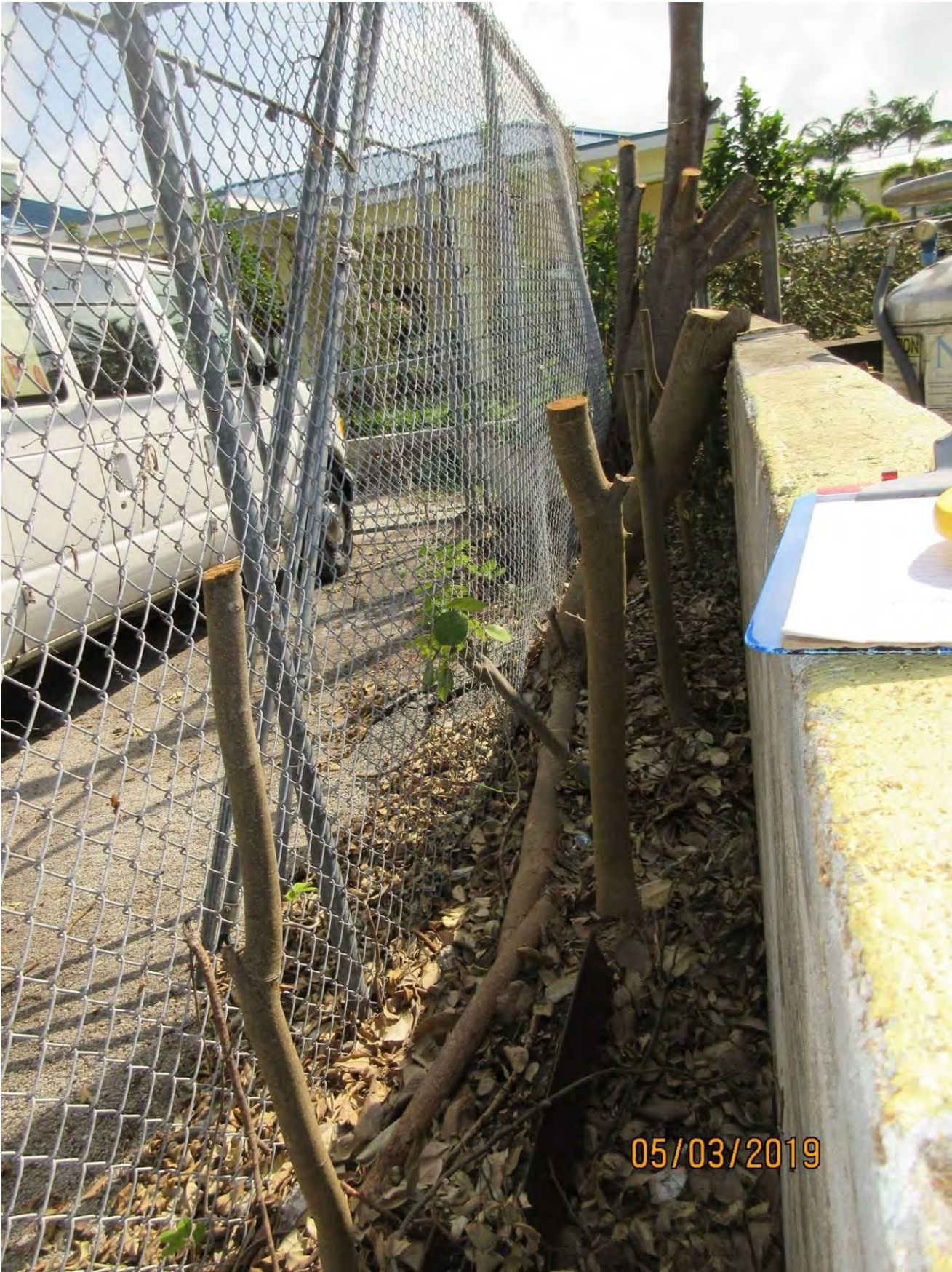
Close up photo trees #2-#7.