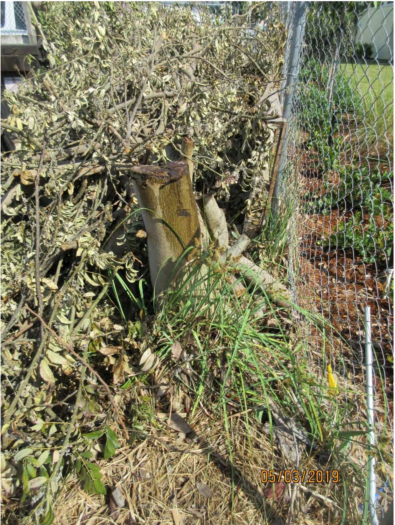
Close up view tree #8.