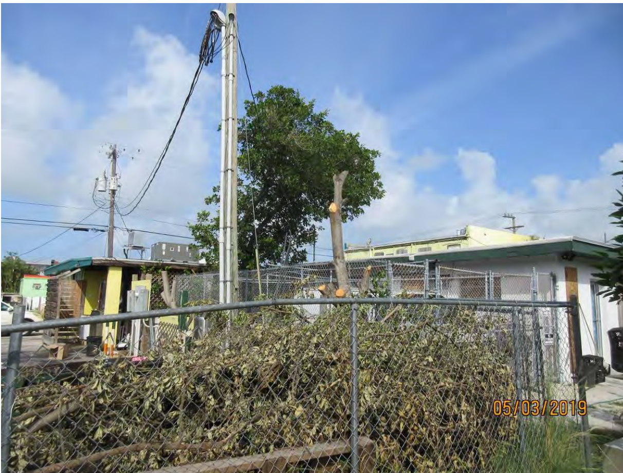
Standing on neighboring property looking at tree impact area and debris pile.