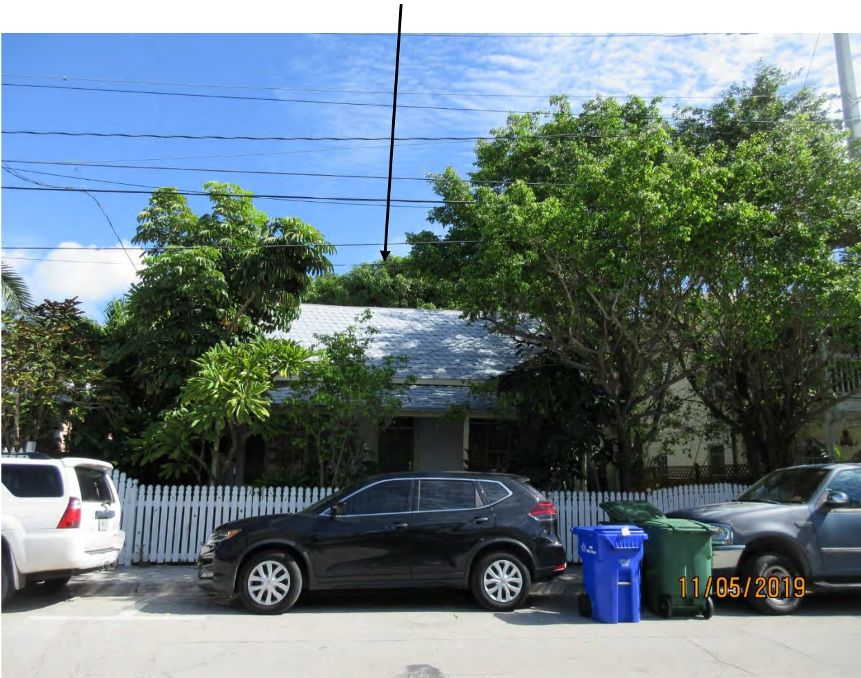
621 Thomas- photo showing location of Mango tree.