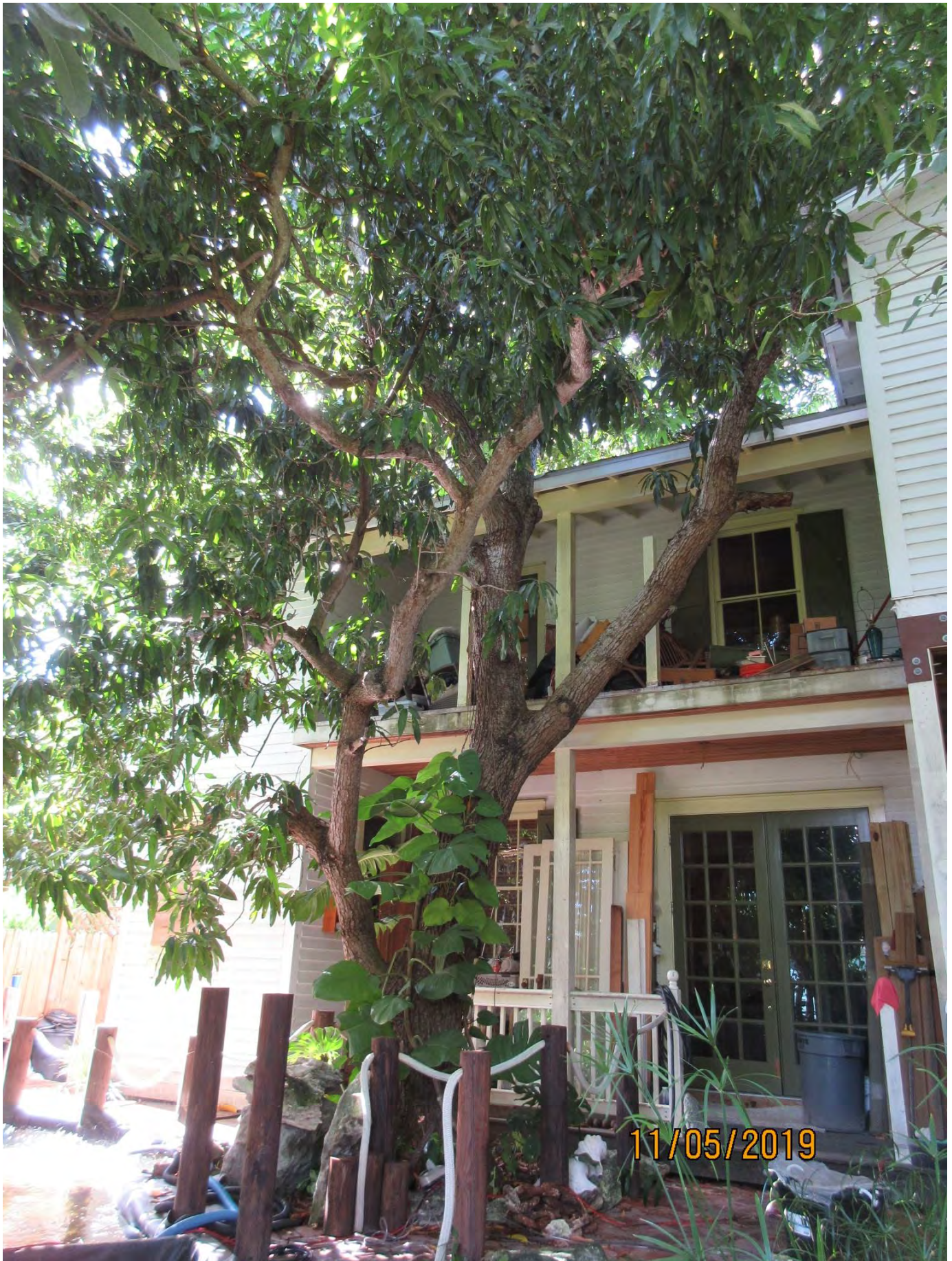
Photo of mango tree showing entire tree, view 2.