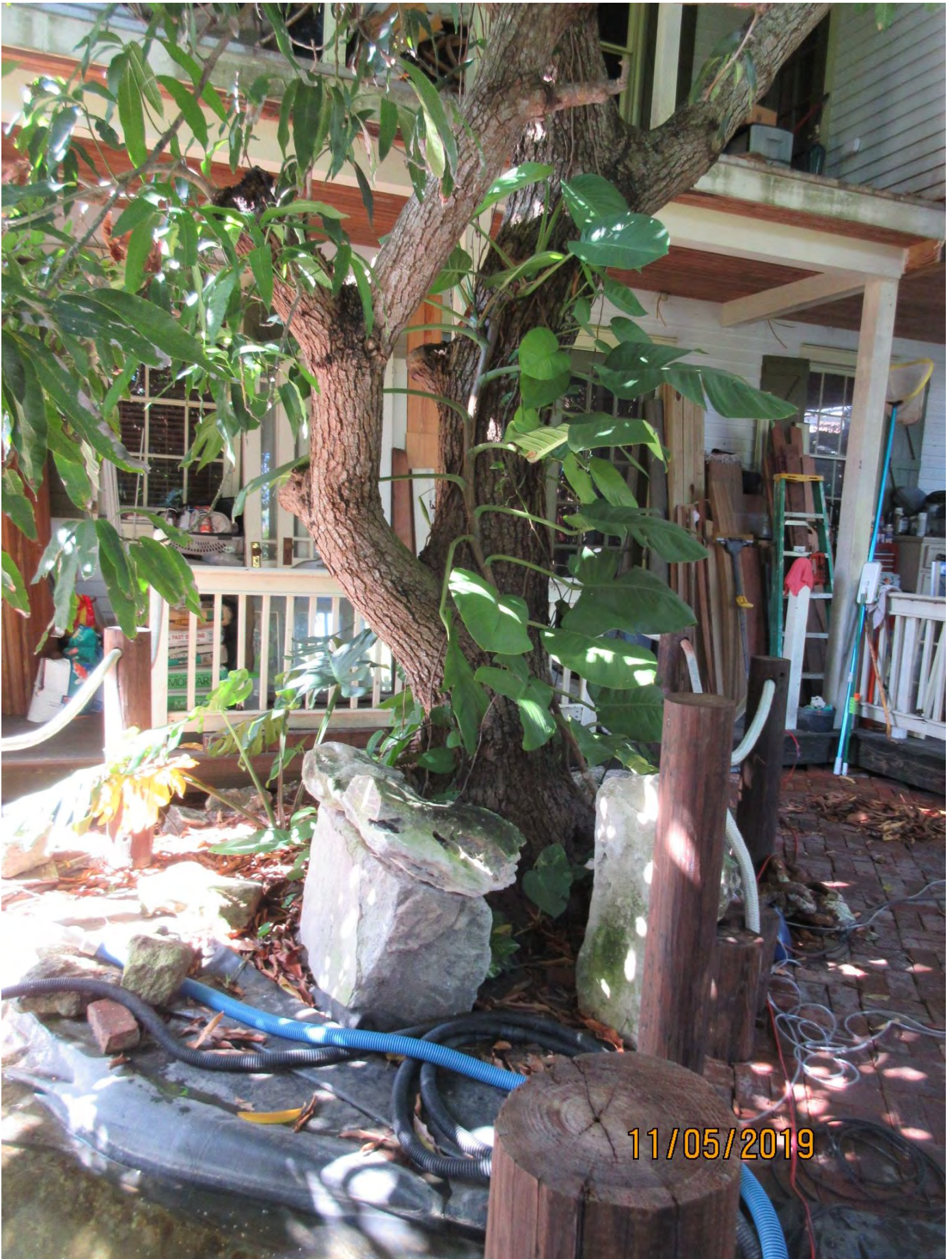
Photo of mango tree showing base of tree and main trunks.