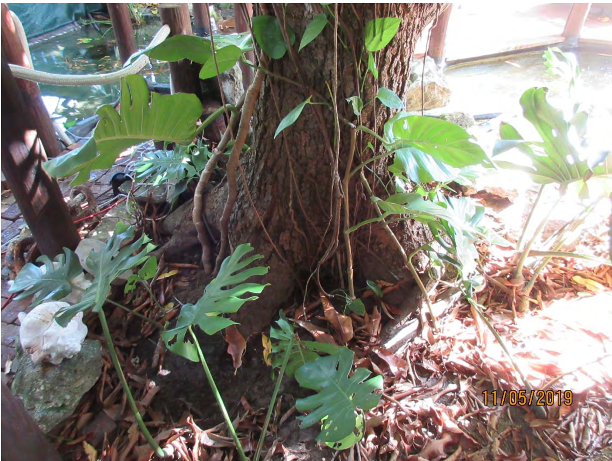
Photo of base of mango tree, view 2.