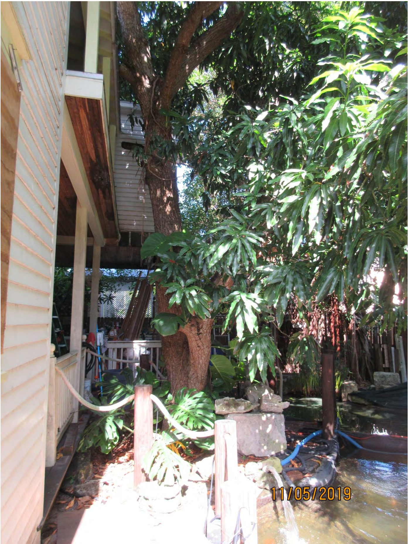
Photo of mango tree showing entire tree, view 1.