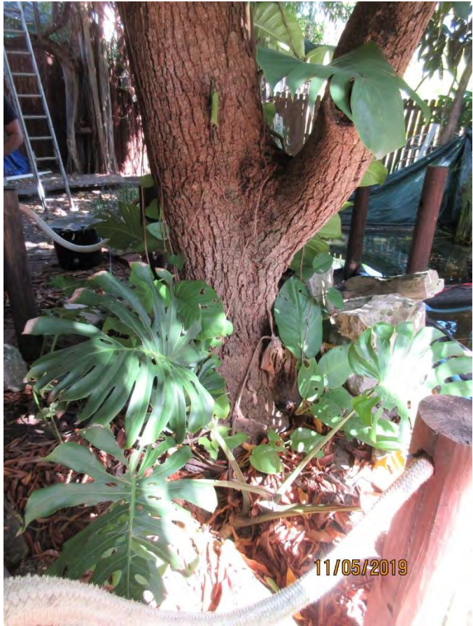
Photo of base of mango tree, view 1.