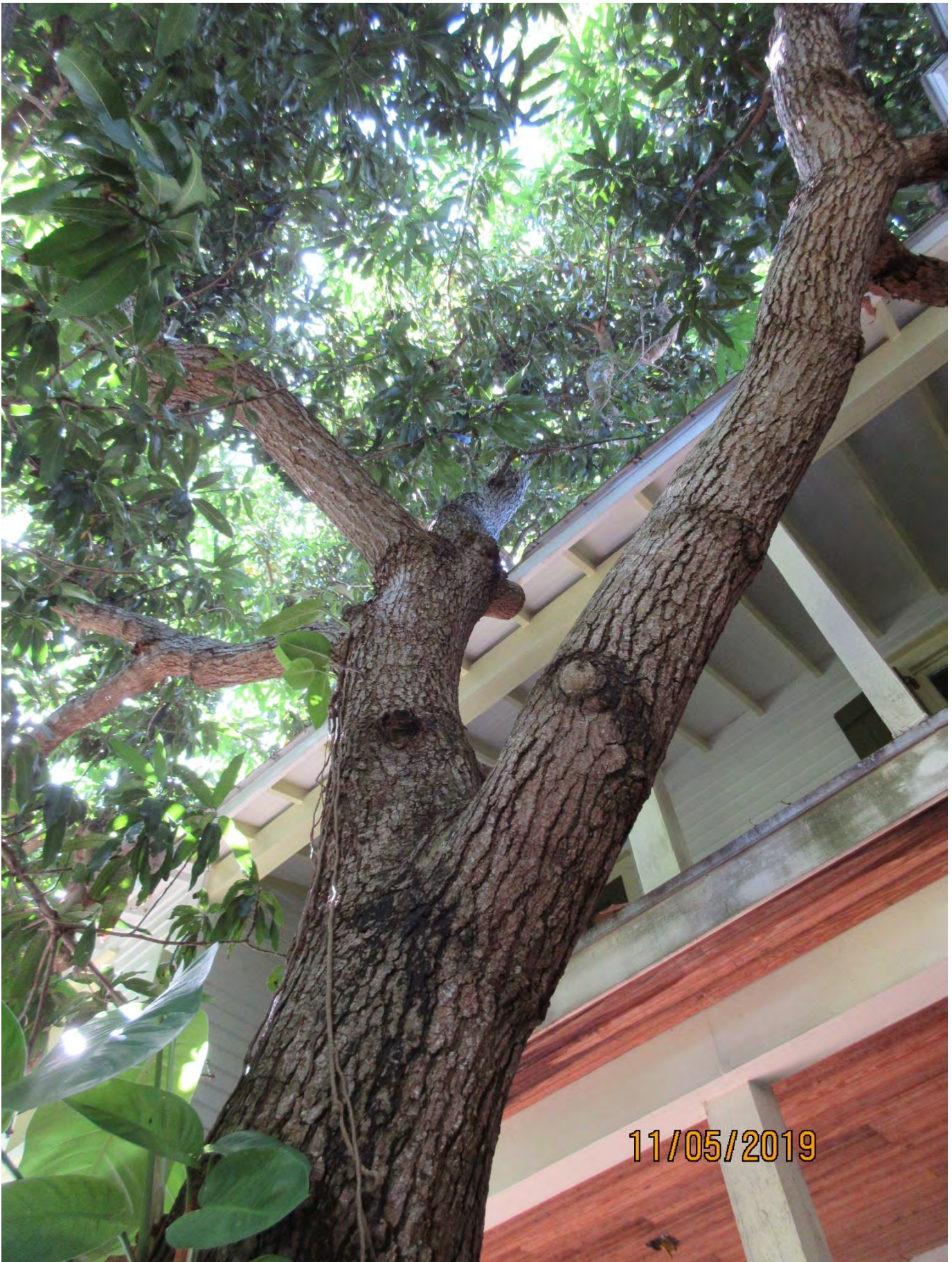
Photo of main trunks of mango tree in relation to house, view 2.