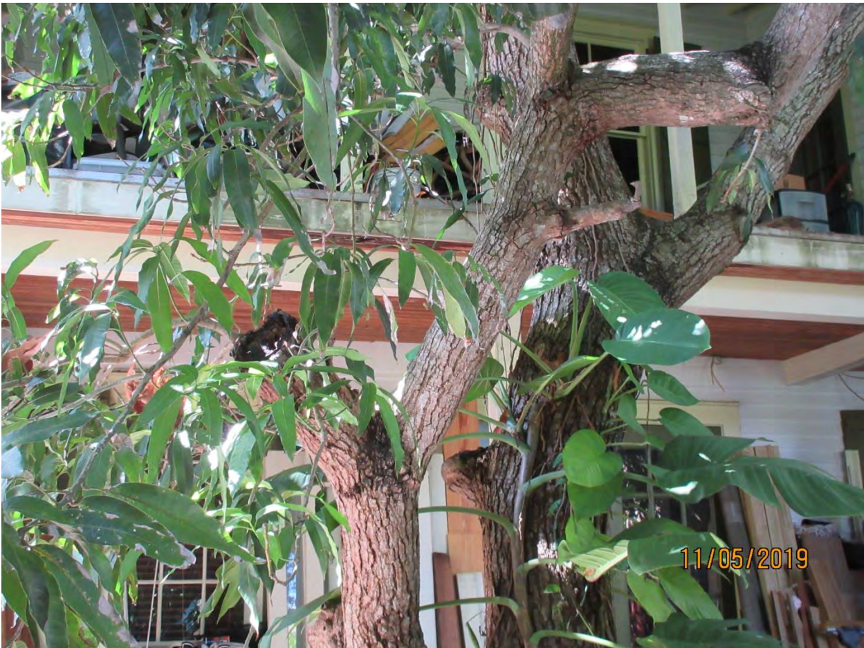
Photo of mango tree showing main trunks, view 2.