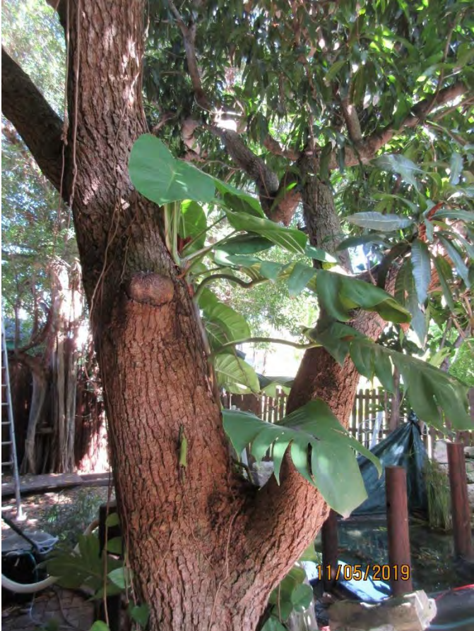
Photo of mango tree trunk, view 1.