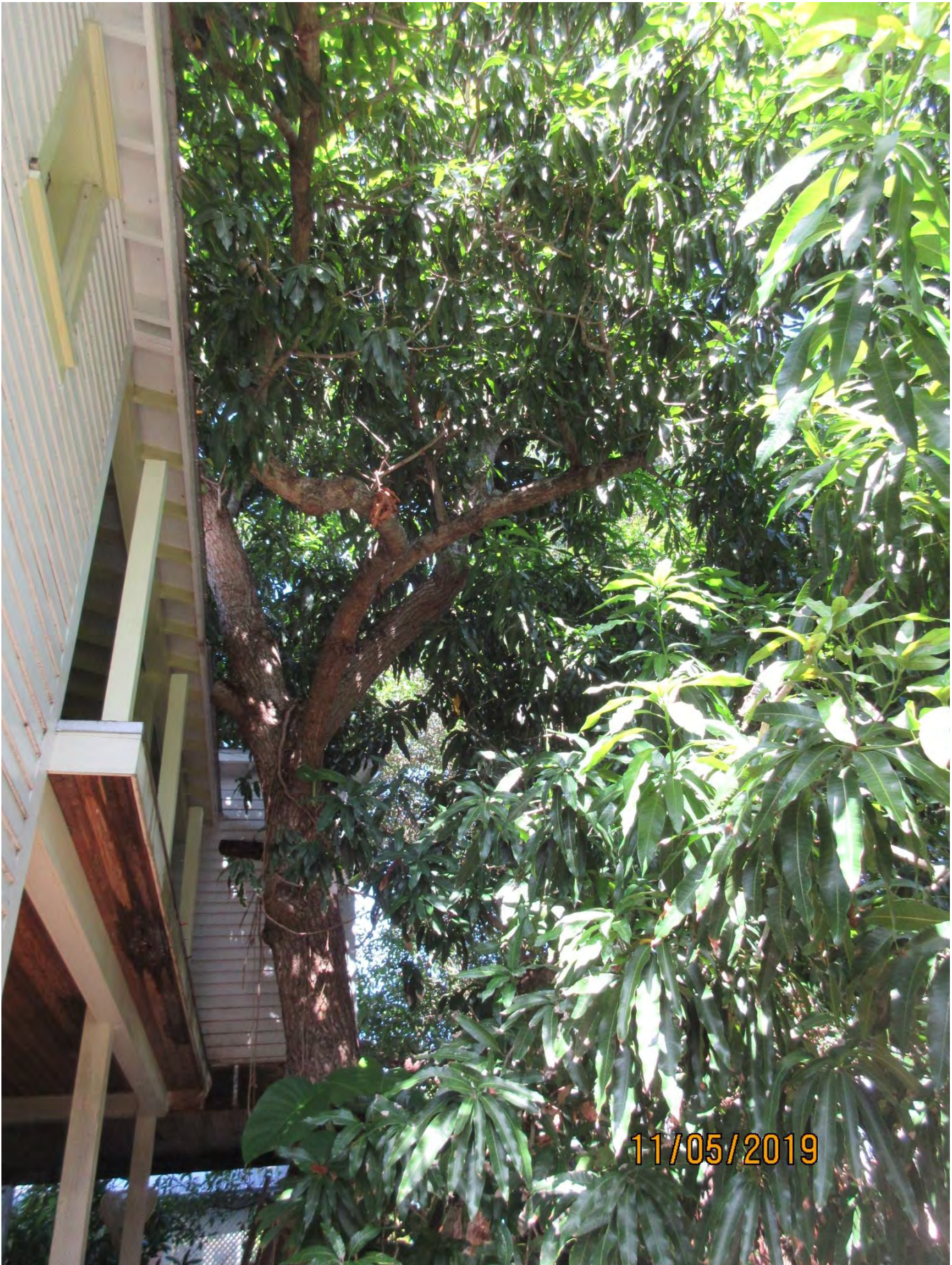
Photo of mango tree showing main trunk and canopy location in relation to house.