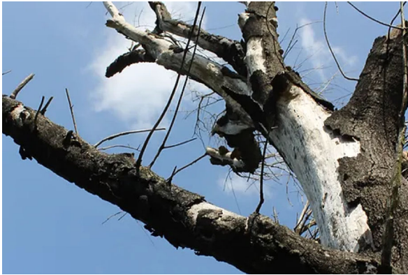
Risk of Failure