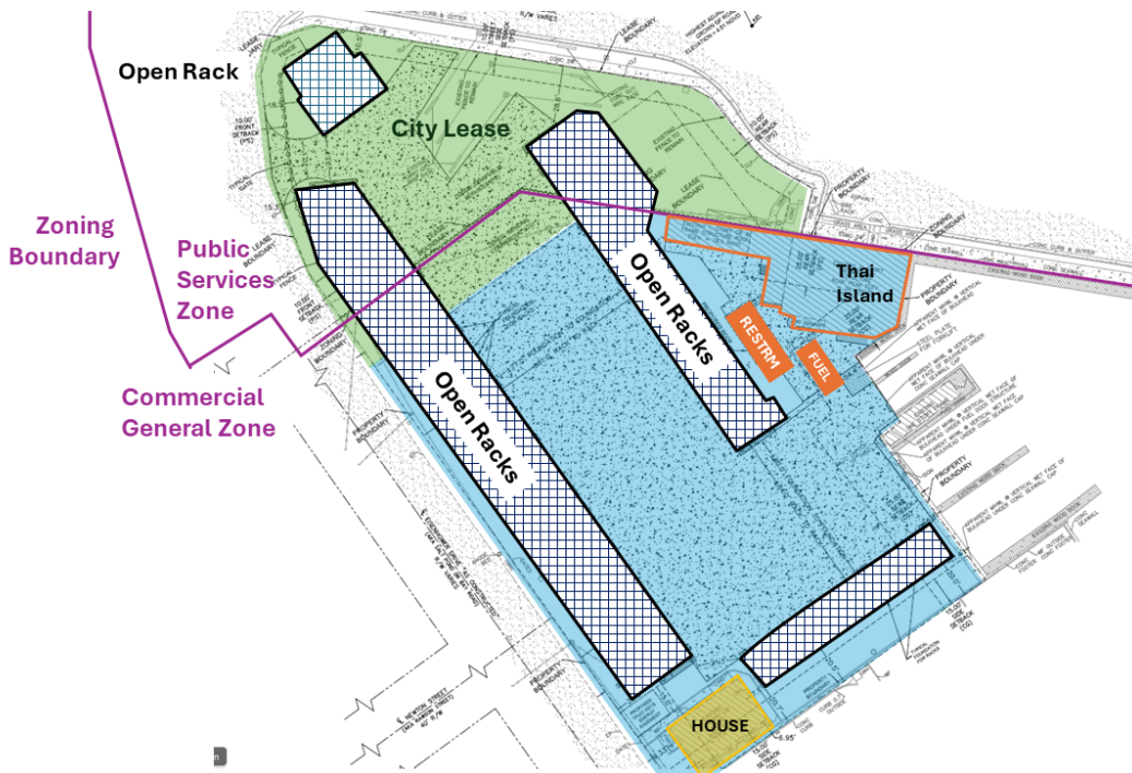
Proposed Upland Site Plan