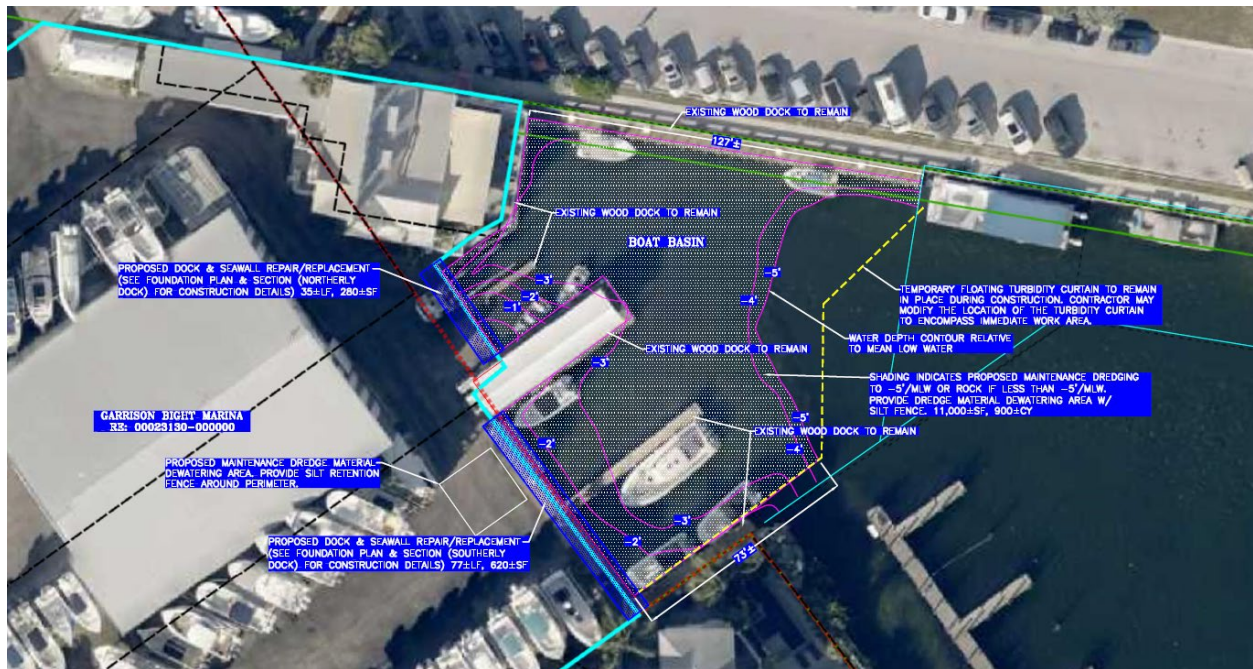
Above: Dredging area. Below: Mean low water depth.