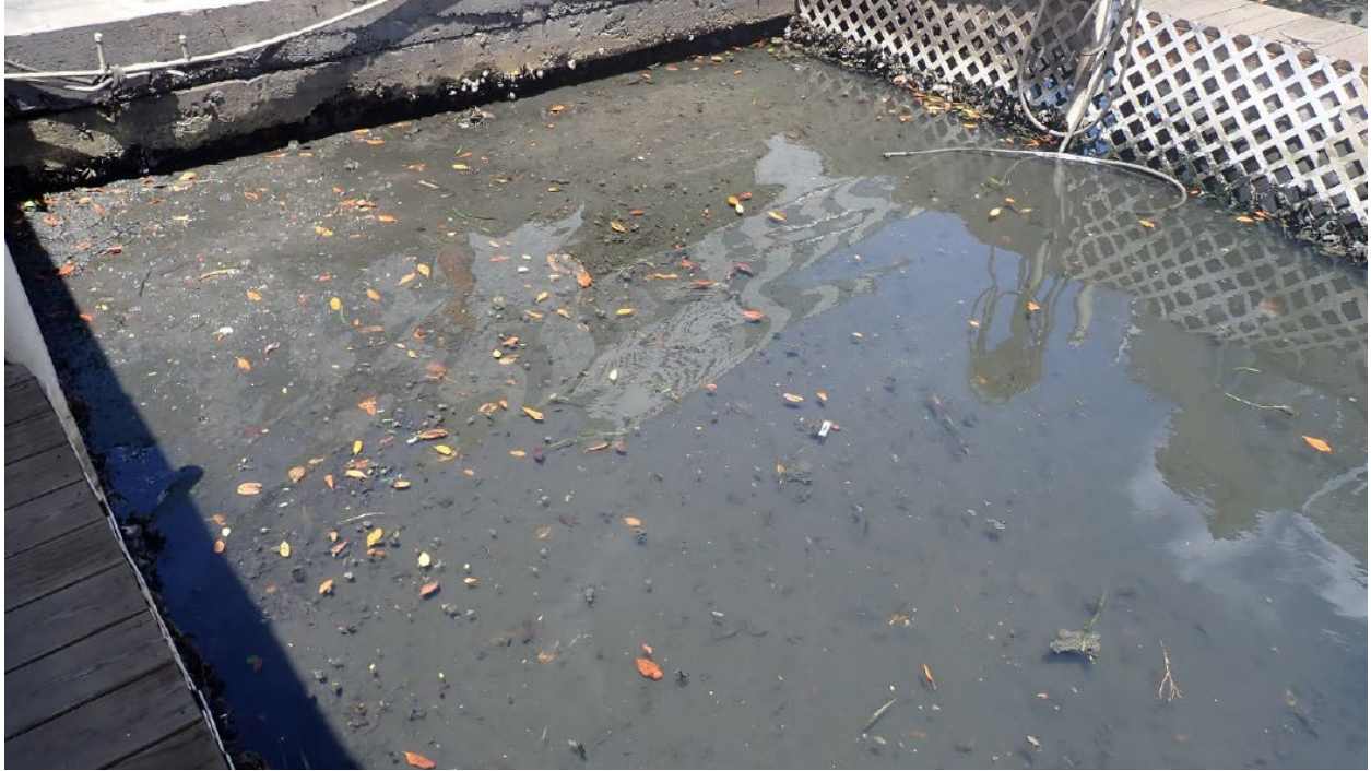
Photos along the marina's seawall/bulkhead show that sediment has accumulated up to the water line.