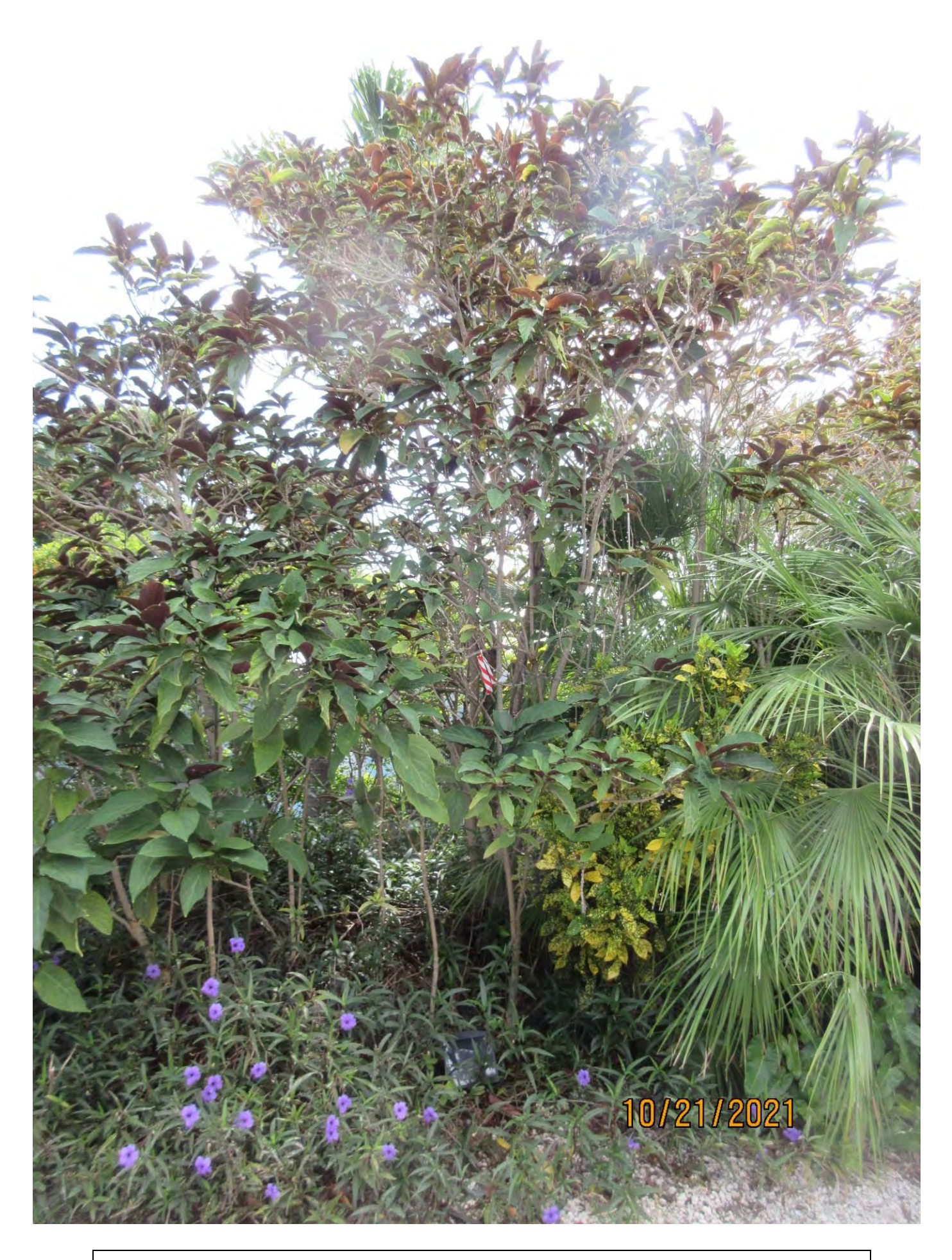
Photo of entire tree. There are several smaller starburst sapling trees around subject tree.