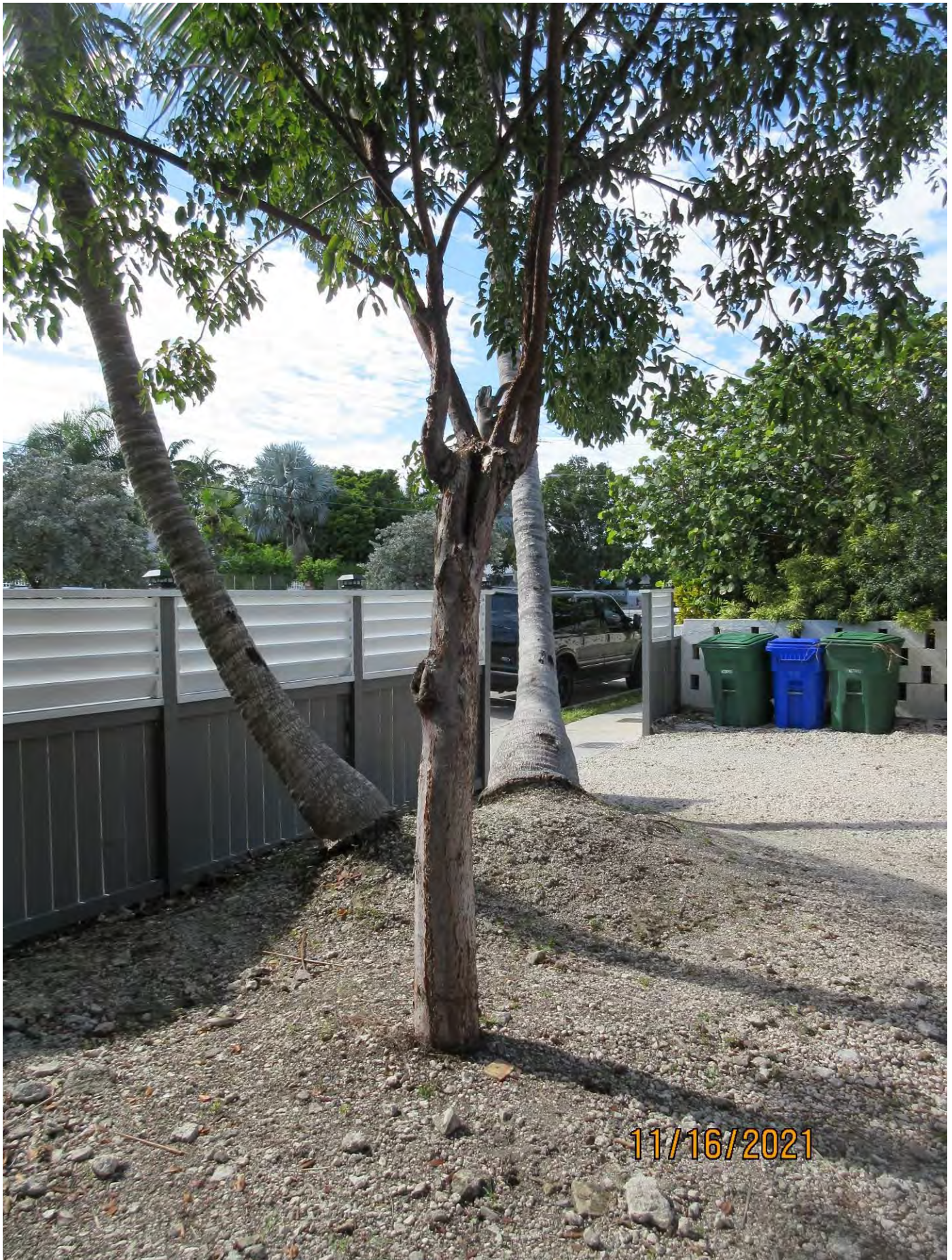
Photo of whole tree, view 2.