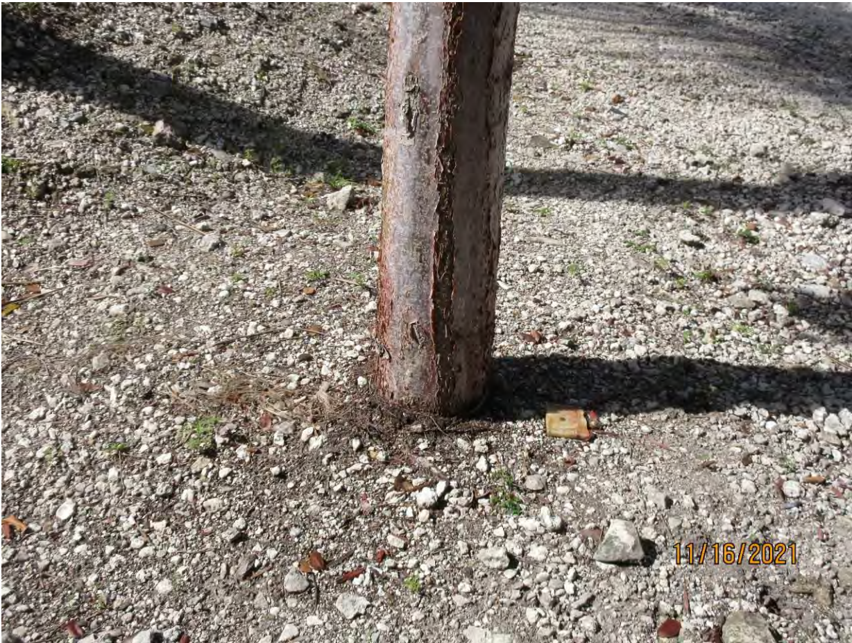
Photo of base of tree.