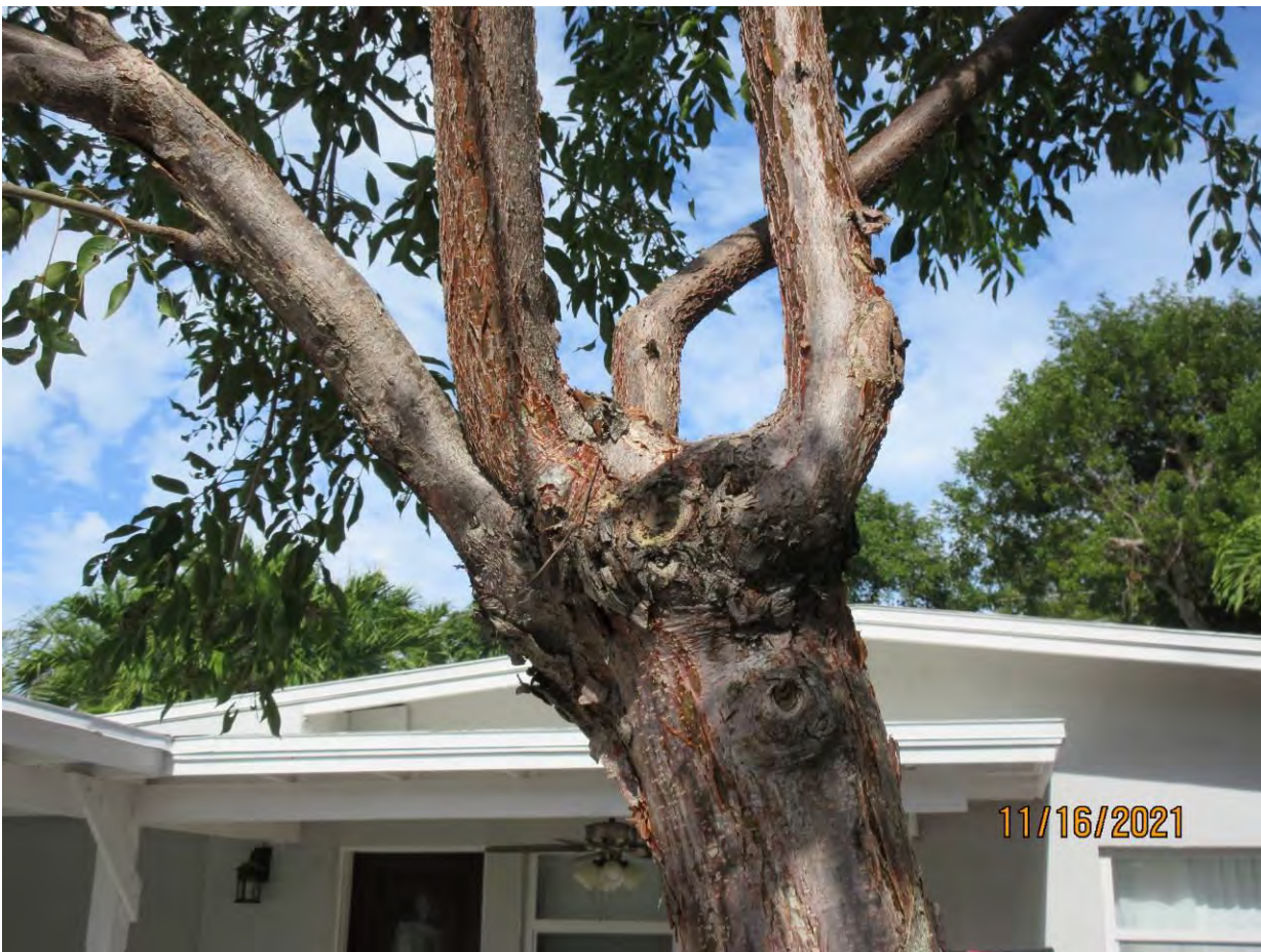
Close up photo of canopy “crotch” area, view 3.