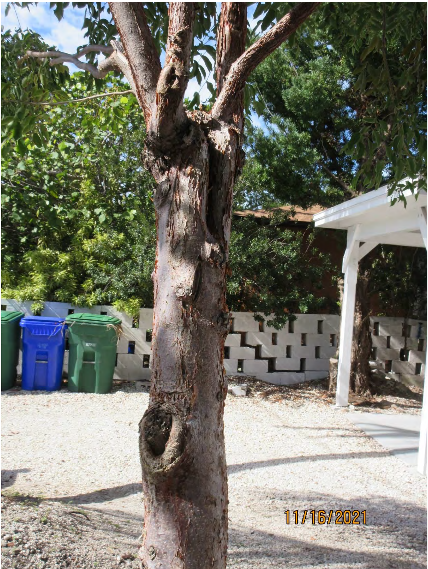
Photo of tree trunk showing damage areas (damage areas have been there since planting, healing wood has been growing).