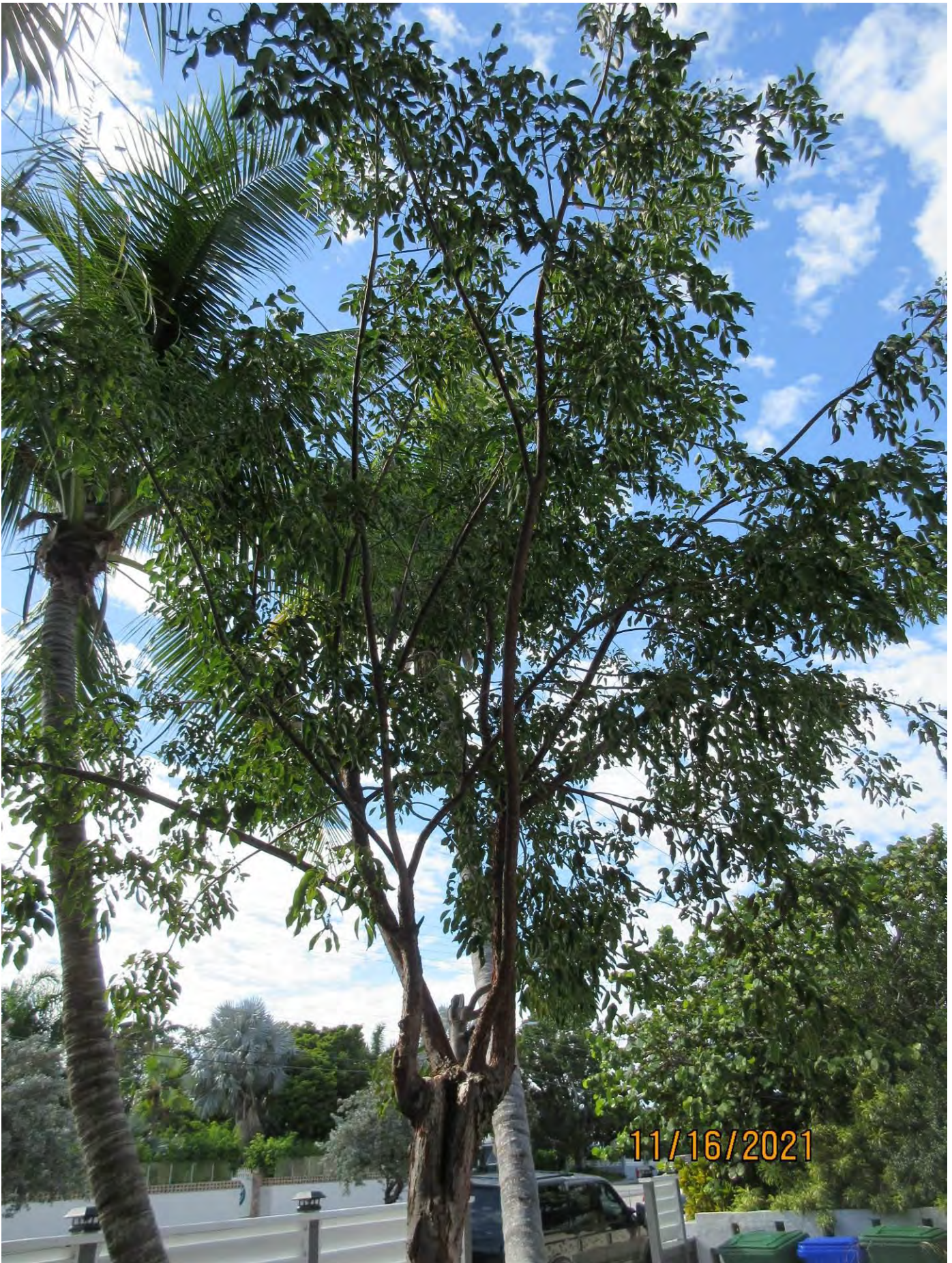
Photo of tree canopy and damaged area.