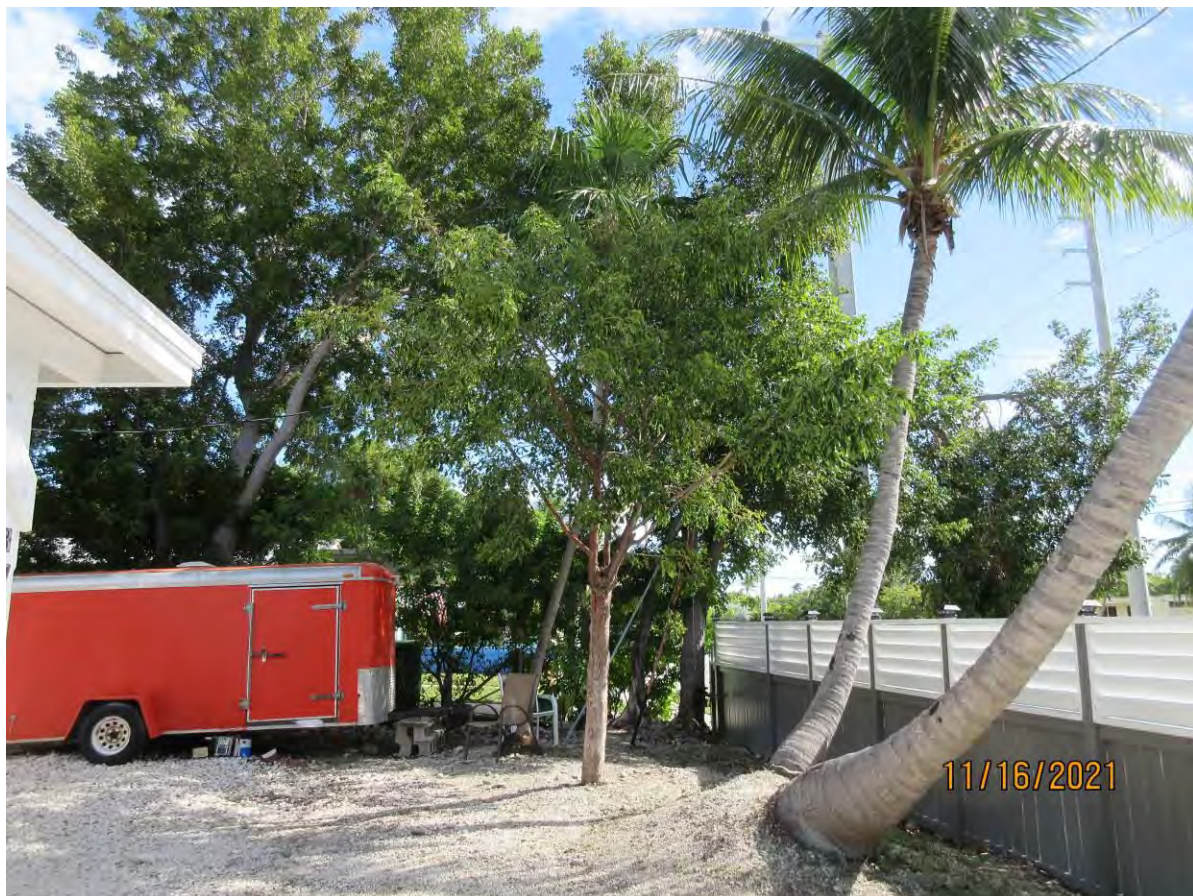
Photo showing location of tree in front yard.

On November 16, 2021, an inspection was done of the gumbo limbo tree. The tree is growing and currently has a diameter of 7 inches.