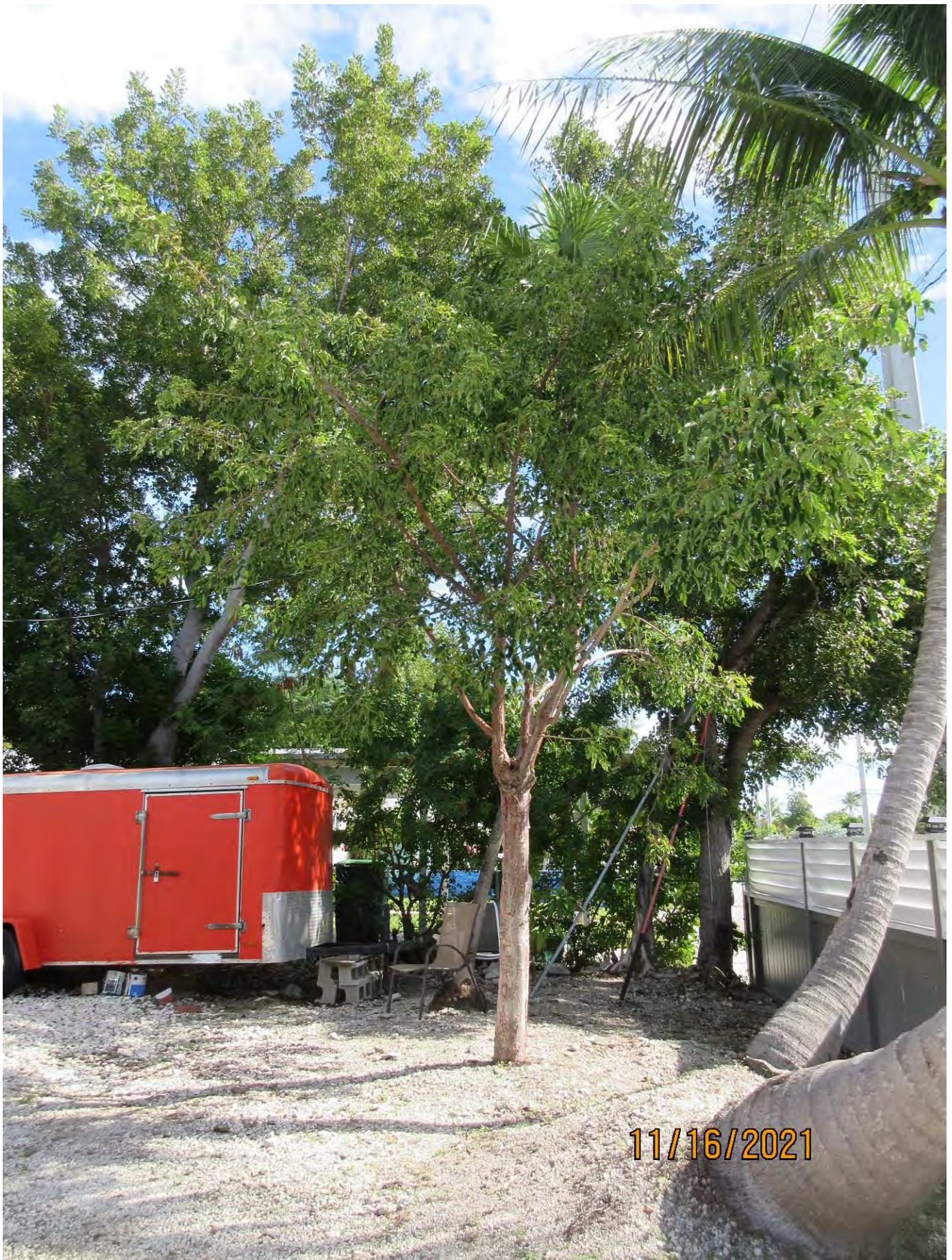
Photo of whole tree, view 1.