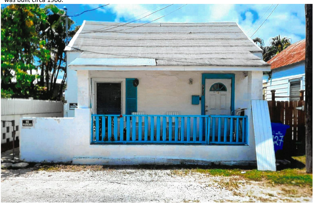
Undated Photo – 927 Catherine Street

This is a request for an easement pursuant to Section 2-938 (b) (3) of the Code of Ordinances of the City of Key West. The easement request is for a total of two hundred fifty-eight (258) square feet, more or less, including a portion of the principal structure, the covered porch, and a portion of the existing concrete pad on the Catherine Street right-of-way as shown on the attached specific purpose survey. The one-story single family residential structure is a historic building located within the Key West Historic District and was built circa 1906.