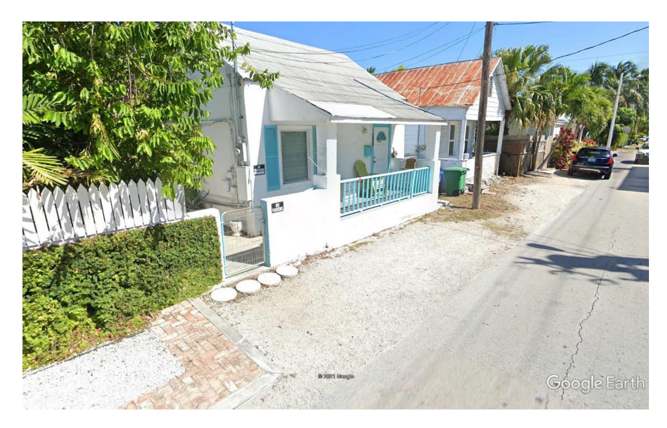
927 Catherine Street