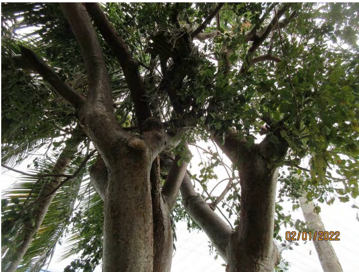
Photo of tree canopy.