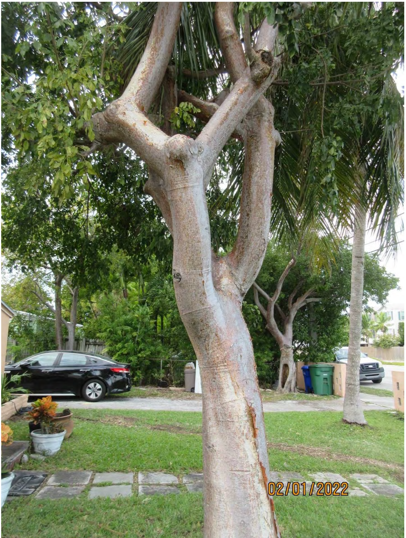
Photo of tree trunk and canopy branches.