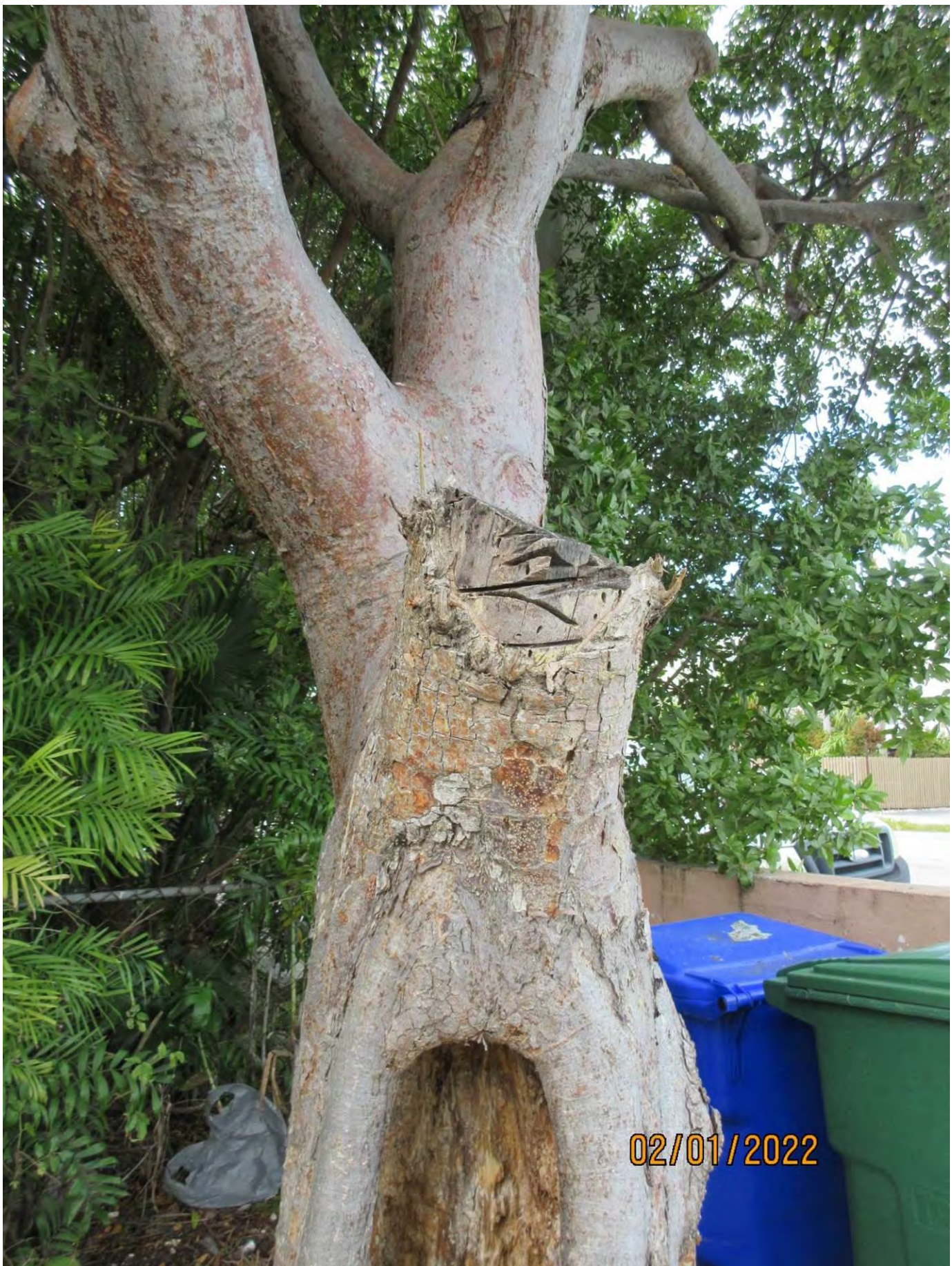
Photo of tree trunk.