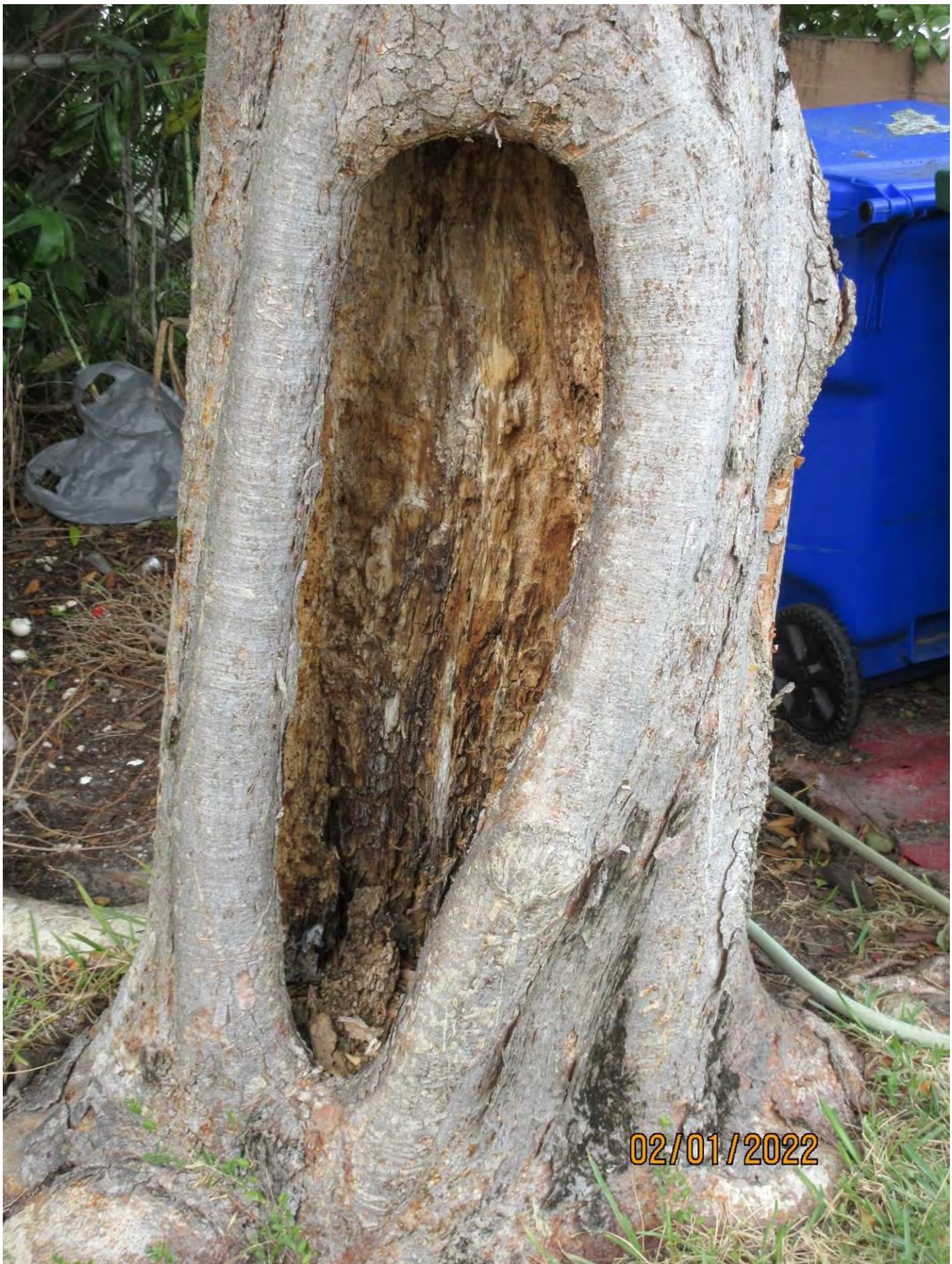
Close up photo of major decay area in trunk.