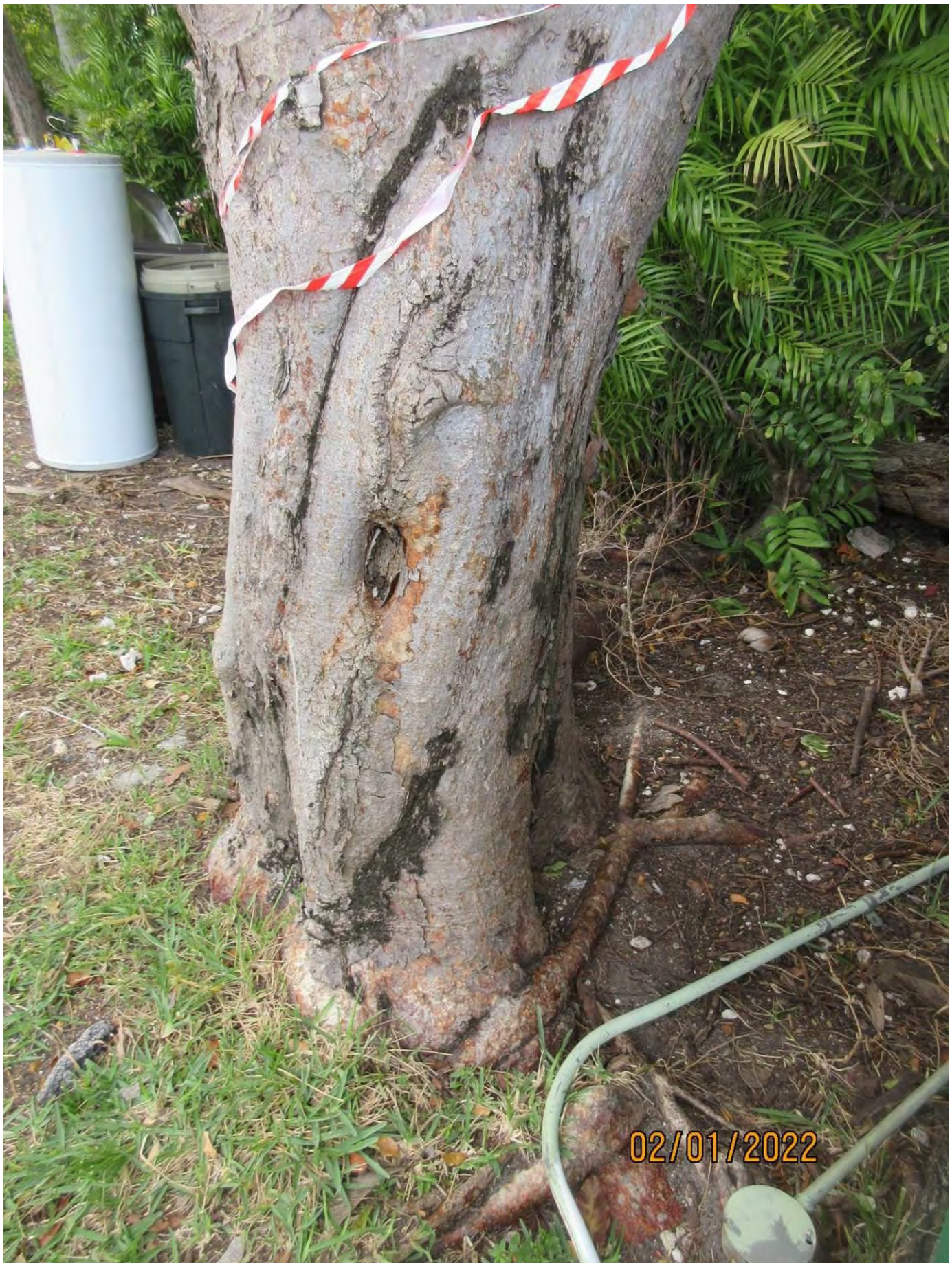
Photo of tree trunk and base of tree, view 1.