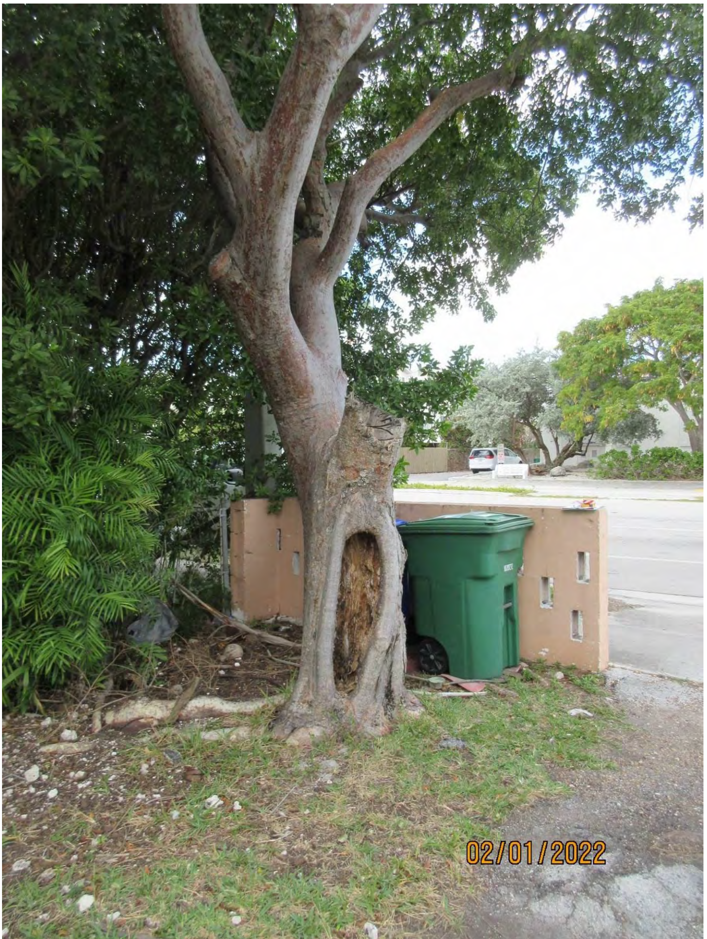
Photo of whole tree, view 2.