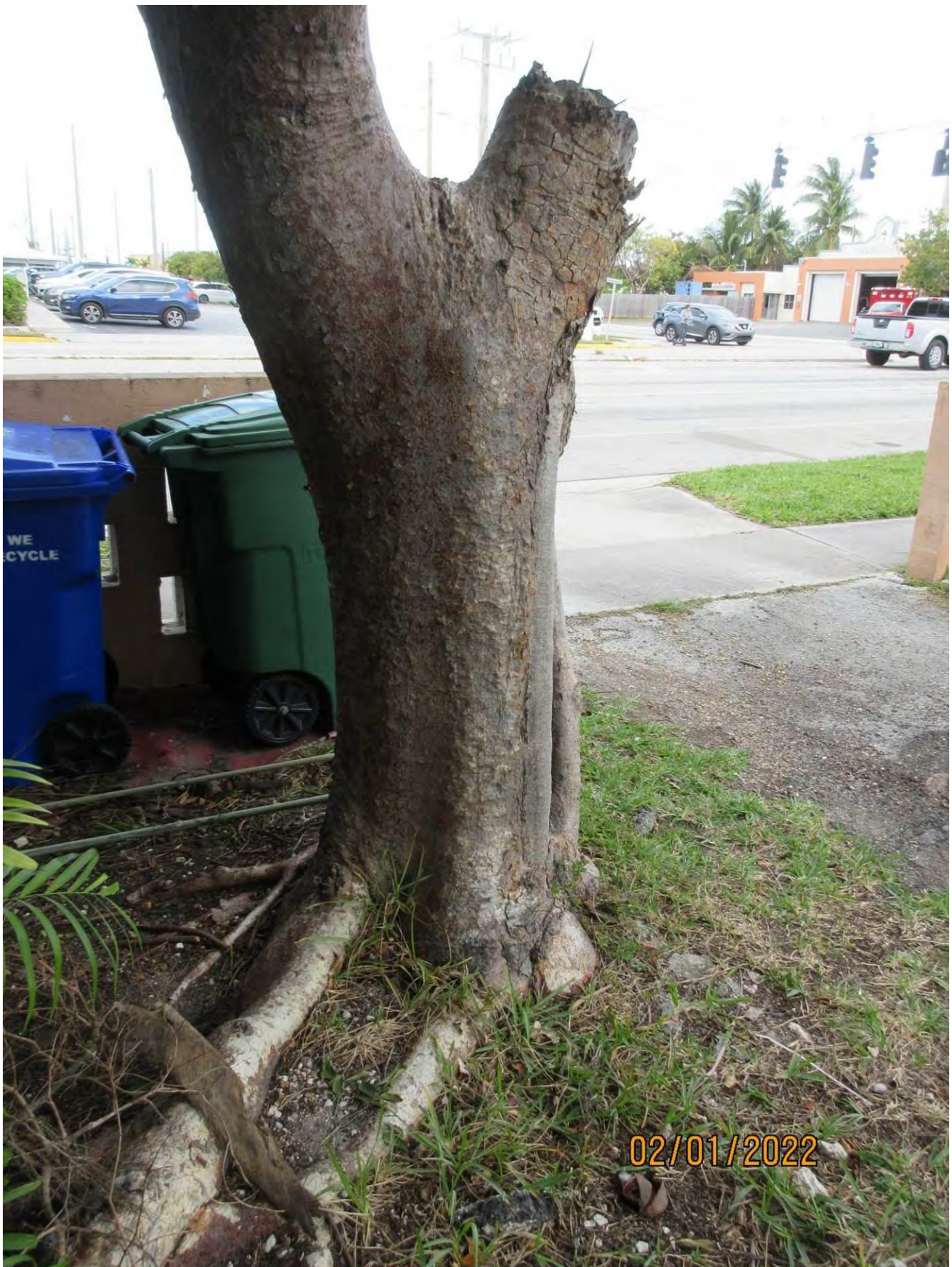
Photo of trunk and base of tree, view 2