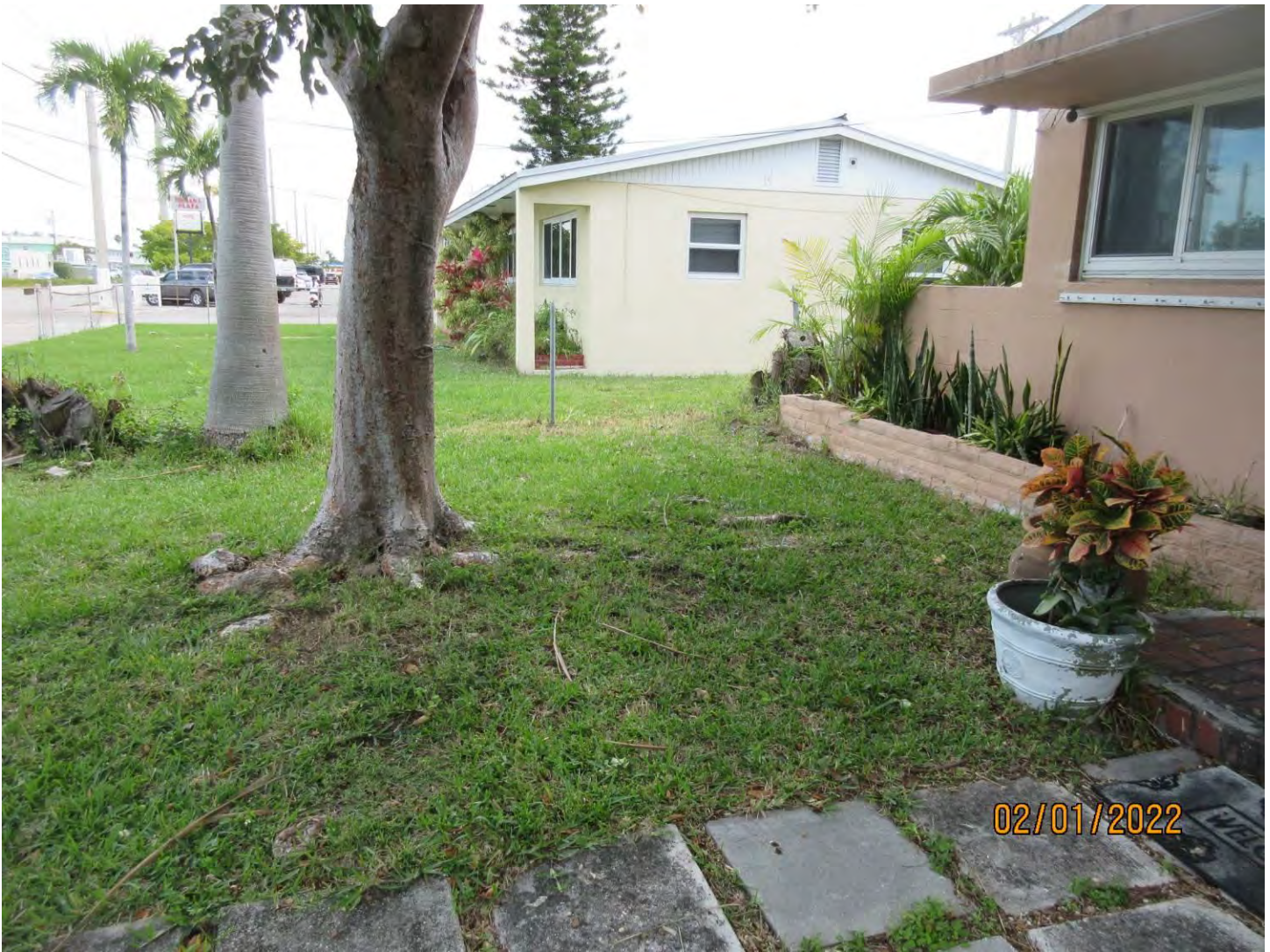
Photo of tree location in relation to structure, view 2.