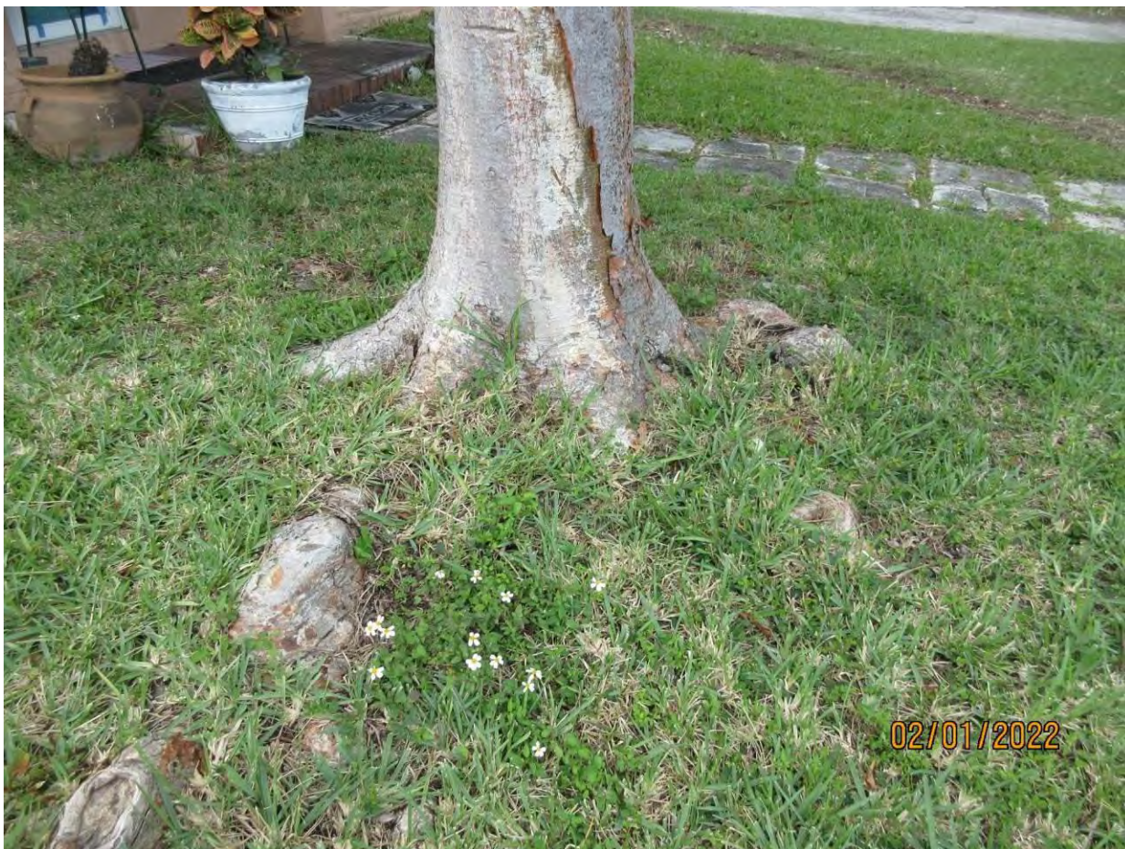
Photo of base of tree, view 1.