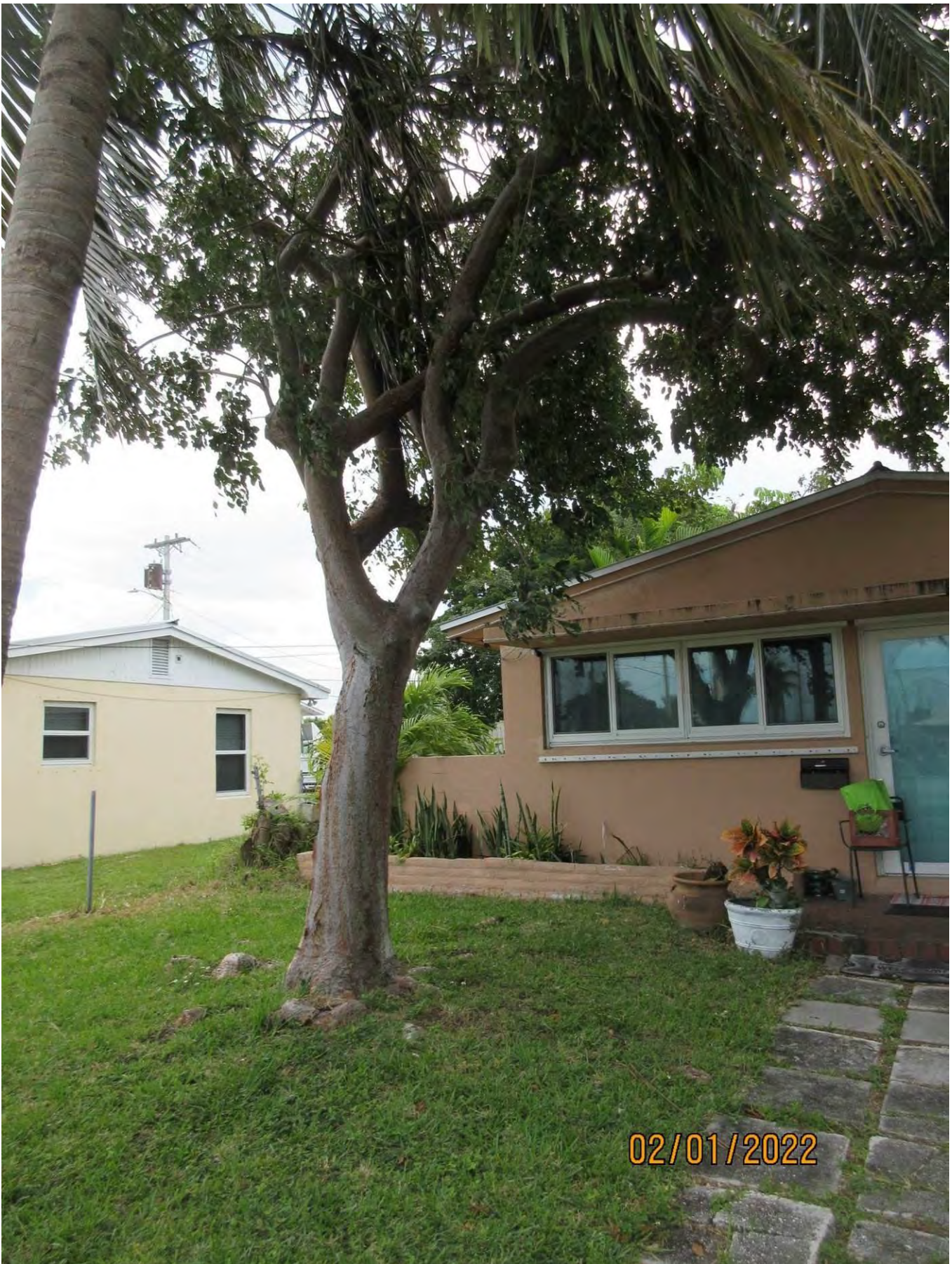
Photo of whole tree.