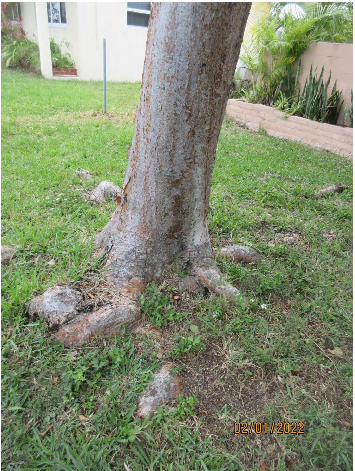
Photo of trunk and base of tree, view 2.