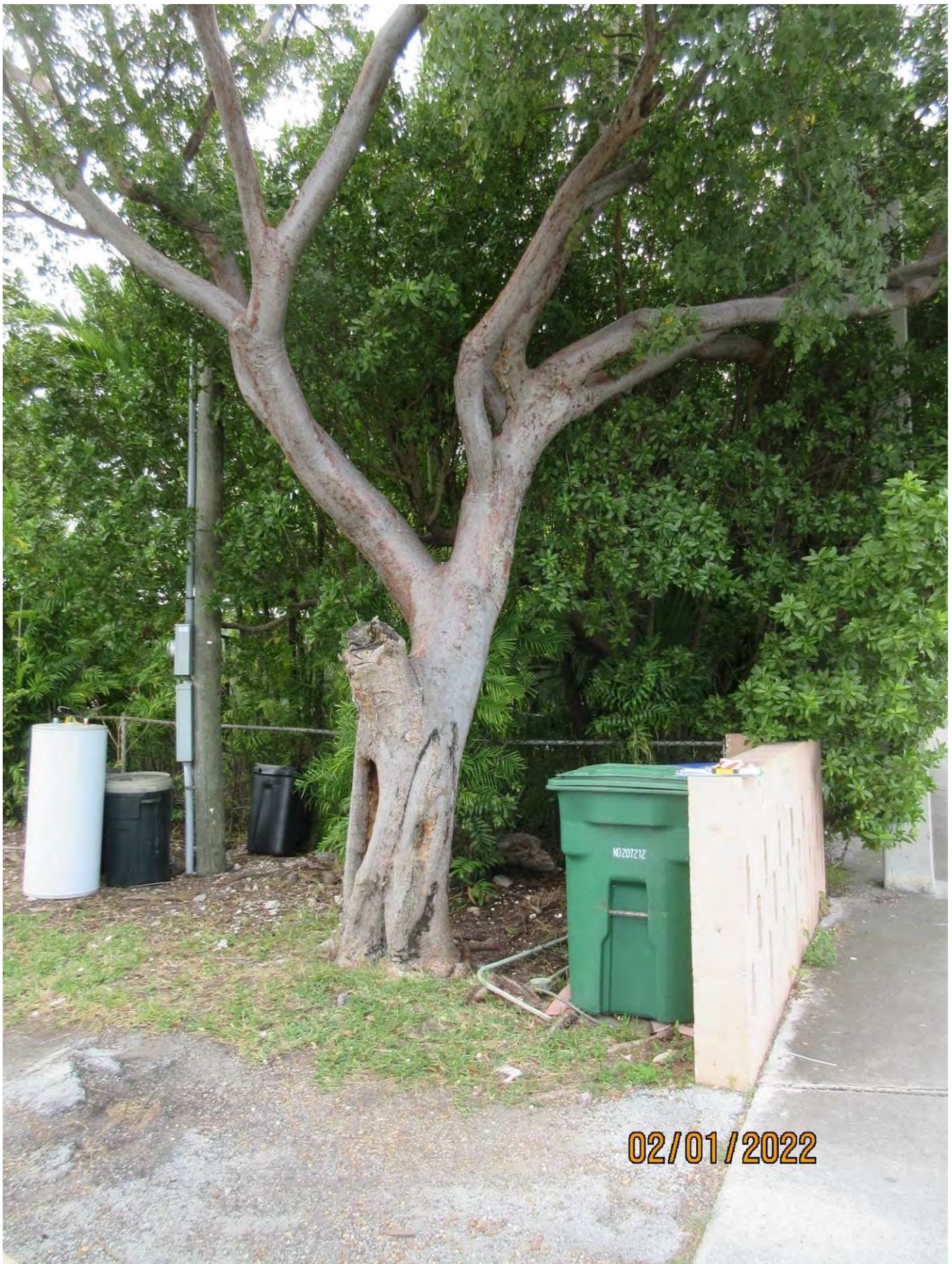
Photo of whole tree, view 1.