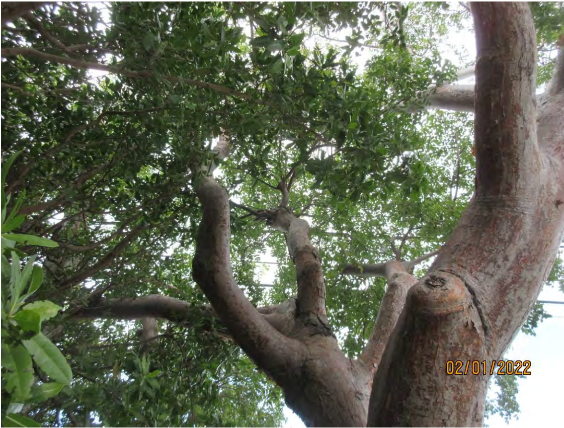
Two photos of tree canopy.