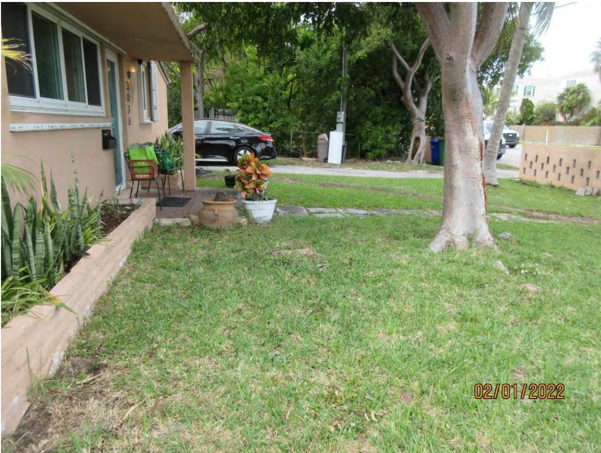
Photo of trunk and base of tree in relation to structure, view 1