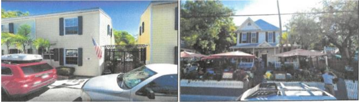
Street View of Both Sender and Receiver Sites

921 Center Street #3 – One transient license currently is held by the owners of the existing condominium unit #3 in the “Old Town Garden Villas” who wish to transfer the license and convert the unit to a permanent residential dwelling. The existing building is residential and is more compatible with permanent residential uses, than with transient uses. Center Street is a mixed use street with some remaining non-transient residences and many transient rental properties. The overall density at “Old Town Garden Villas” consists of a total of 12 units on 0.3 acres, which exceeds the allowable density of 4 units (16 units per acre) in the HNC-1 zoning district.