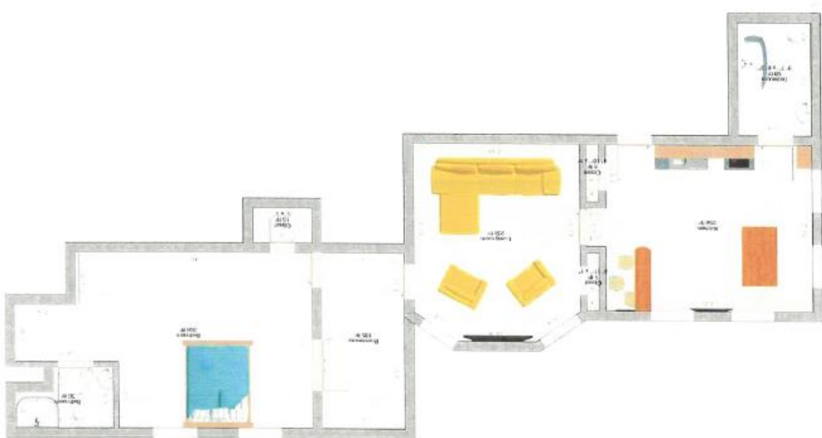
314 Duval Proposed Floor Plan