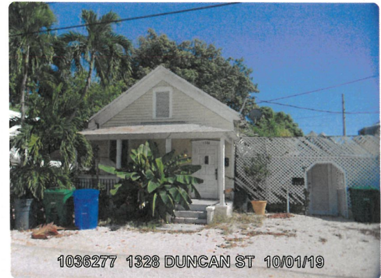
1036277 1328 DUNCAN ST 10/01/19

Parcel ID 00035410-000000 Account# 1036277 Property ID 1036277 Millage Group 10KW Location 1328 DUNCAN St, KEY WEST Address Legal KW MOFFATS SUB PB 1-12 LOT 5 SQR 4 TR 14 H1-128 OR384-551 OR446-312 Description OR1467-1158 OR1471-1030 OR1932-590 (Note: Not to be used on legal documents.) Neighborhood 6149 Property SINGLE FAMILY RESID (0100) Class Subdivision Moffat's Sub Sec/Twp/Rng 05/68/25 Affordable No Housing