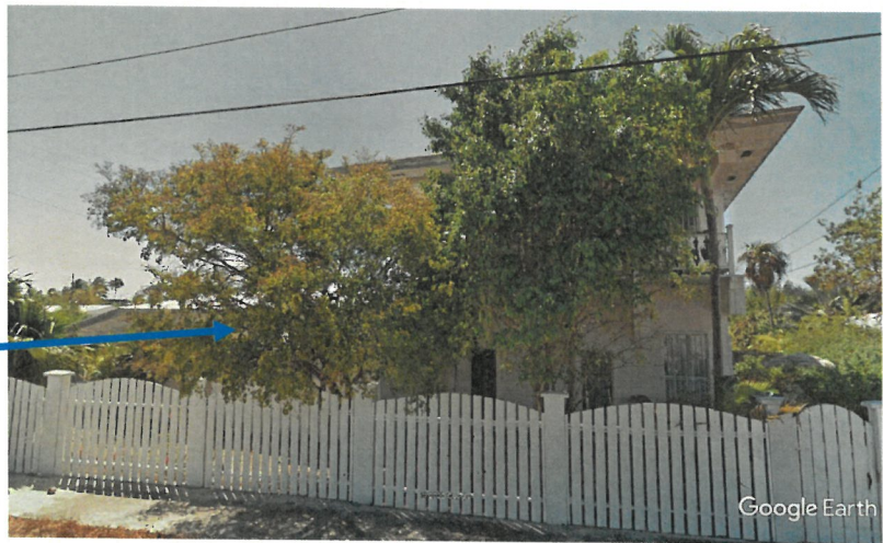
Lignum vitae location, March 2011