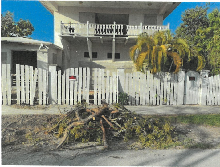
Photo dated February 23, 2022. Lignum vitae debris in pile.