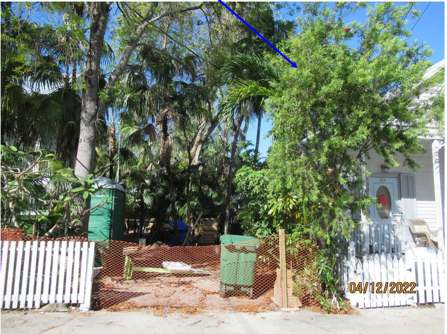
Photo showing tree location on property.

Tree Species: Bottlebrush (Callistemon sp.)