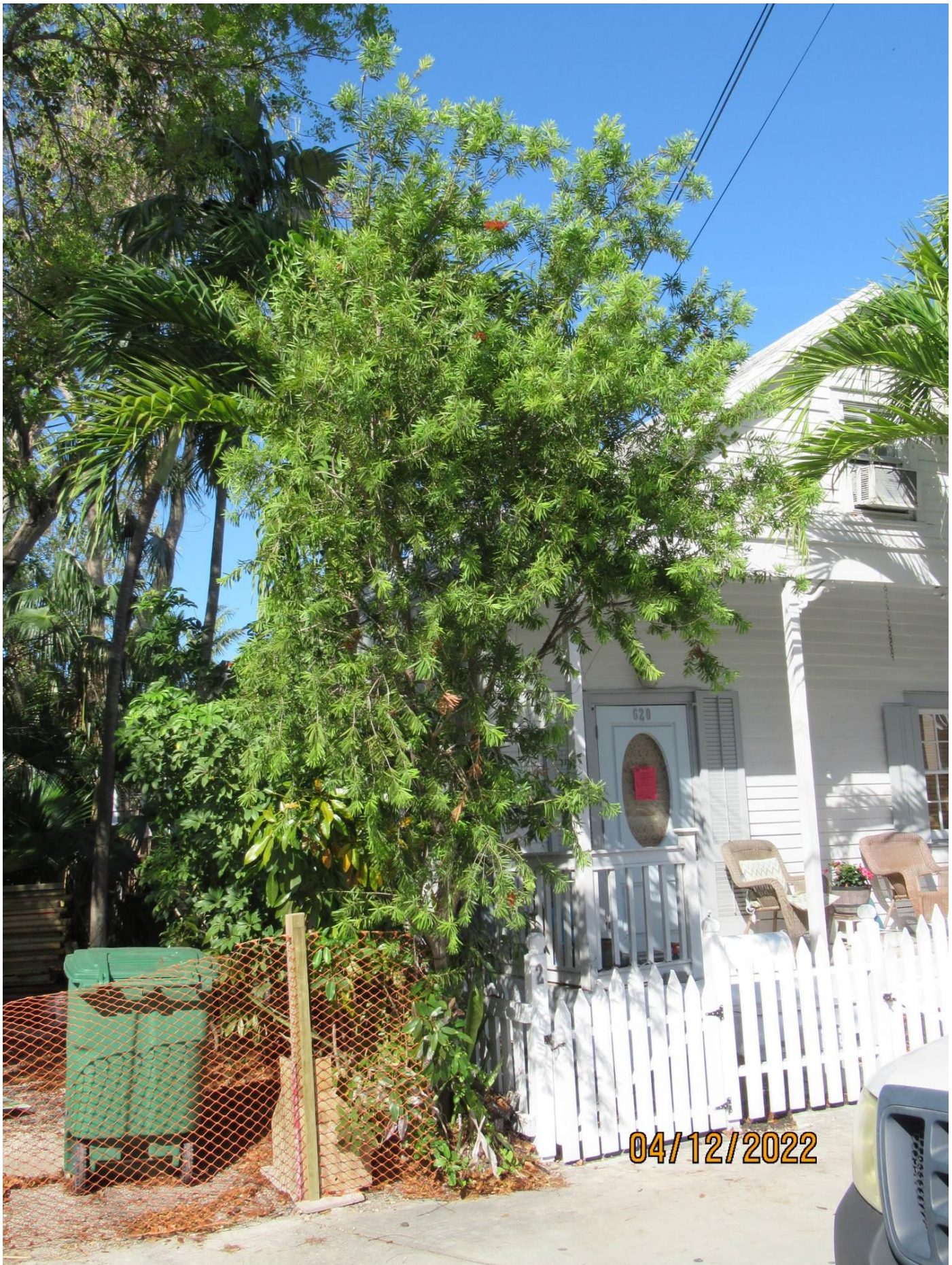
Photo showing whole tree.