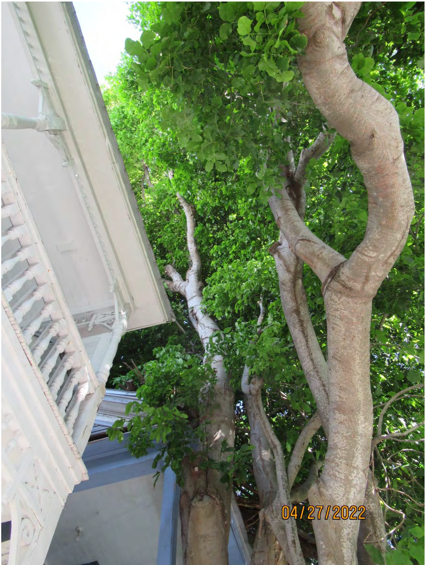
Photo showing location of tree canopy in relation to structure, view 2.