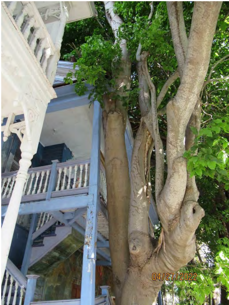
Photo showing location of tree canopy relation to structure, view 1.