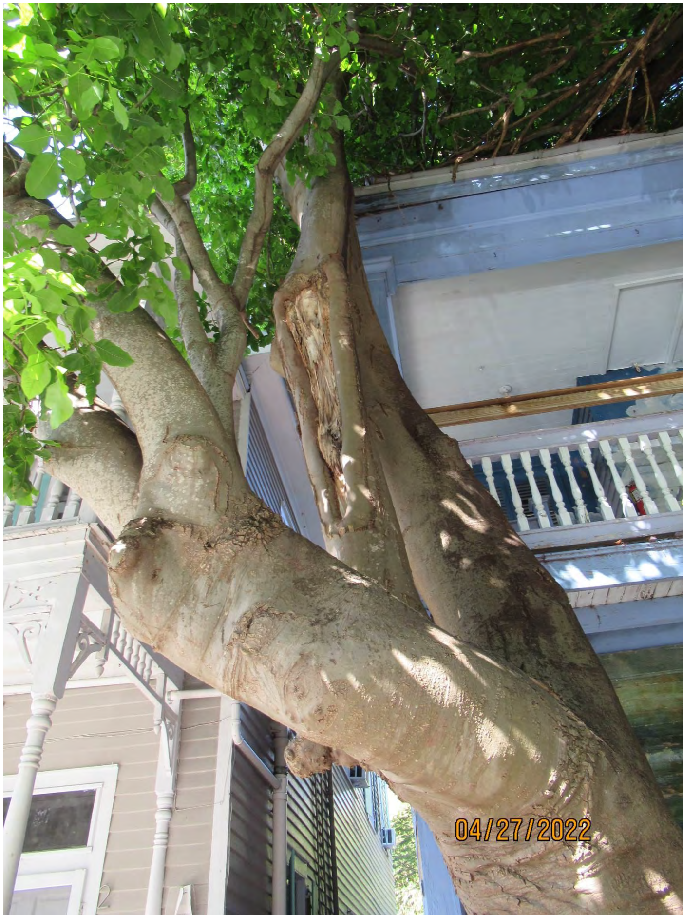
Photo of tree trunks.