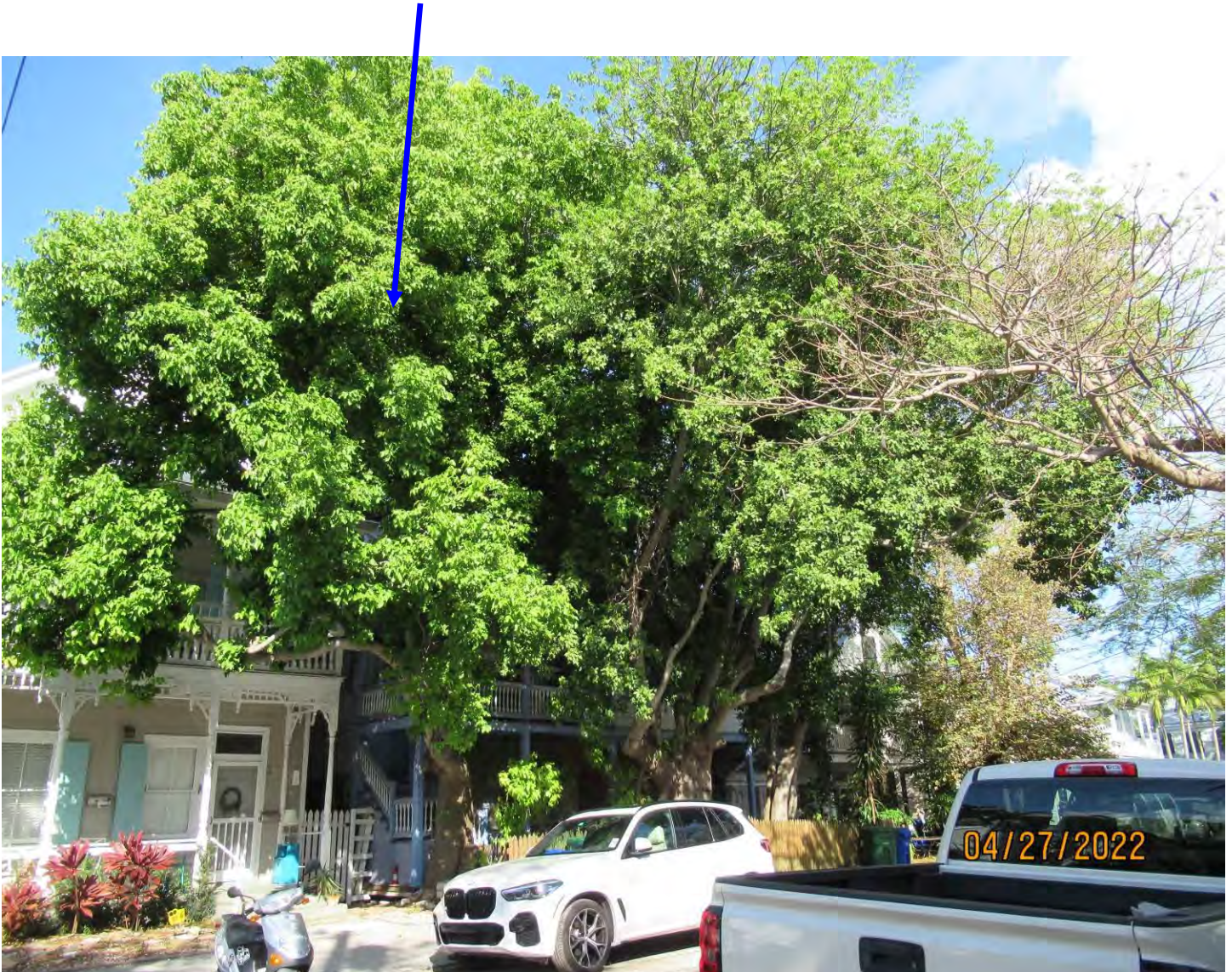
Photo showing whole tree and its location.

Tree Species: Spanish Lime ( Melicocccis bijugatus )