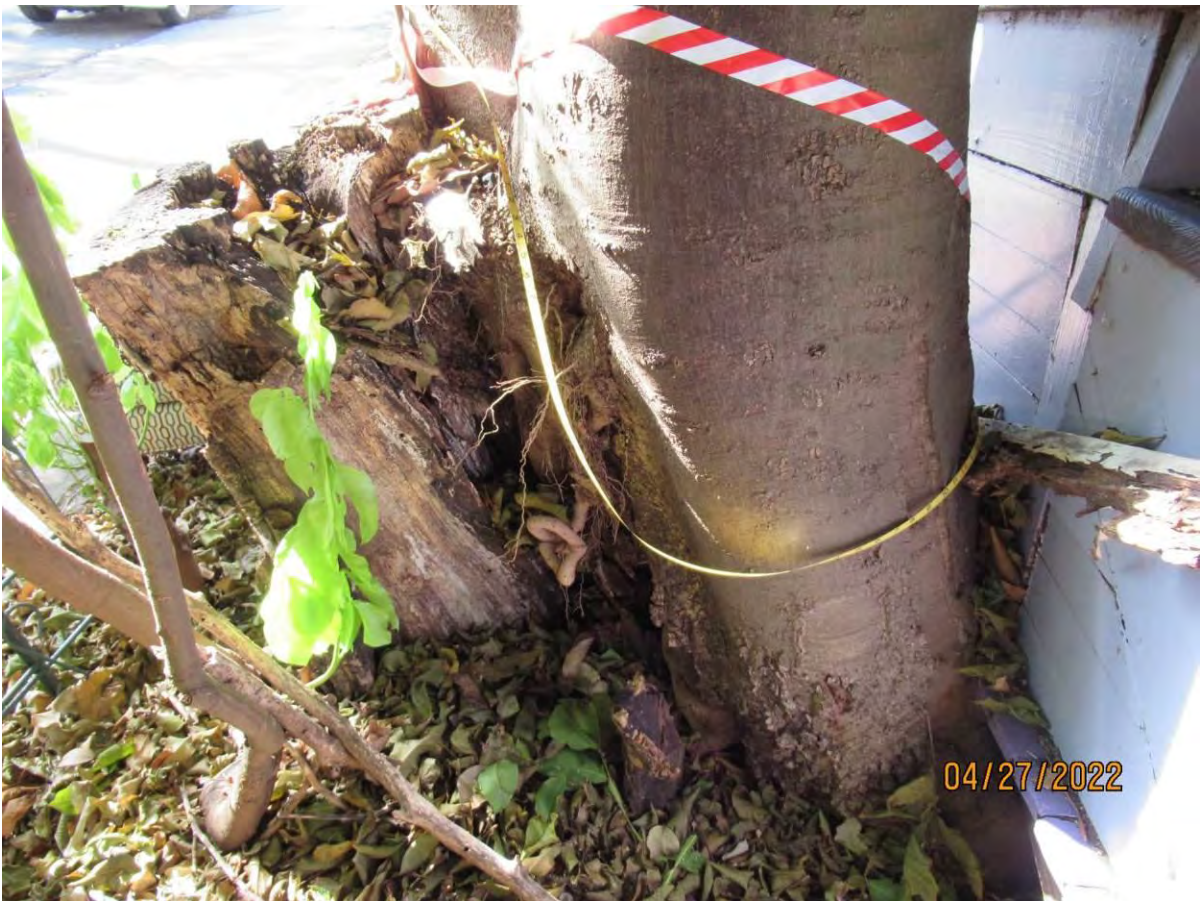
Photo of base of tree and old trunk stump, view 2.