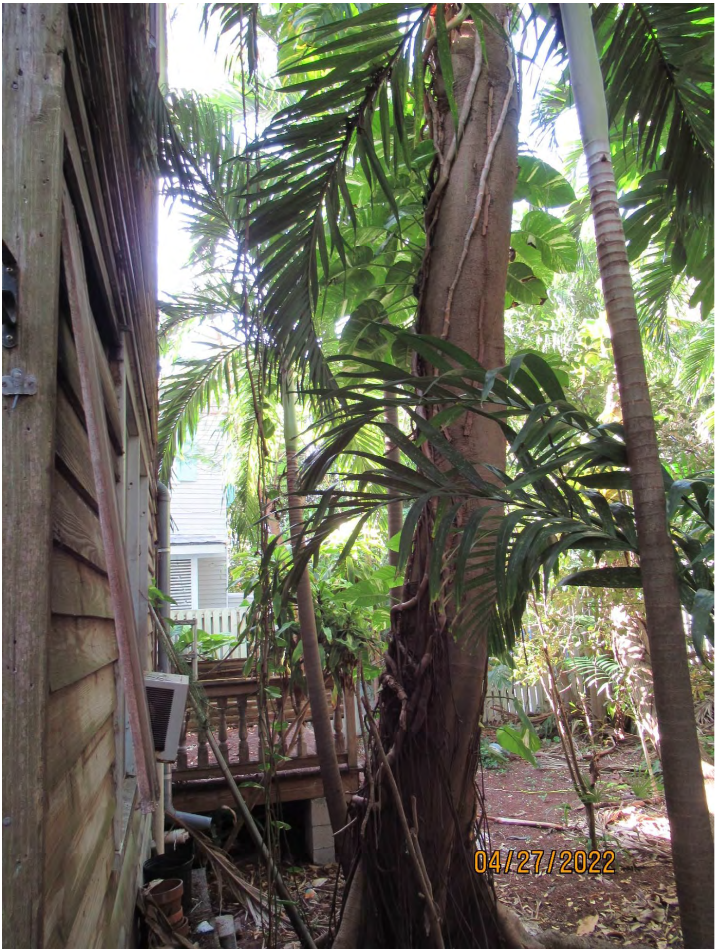
Photo of tree trunk, view 2.