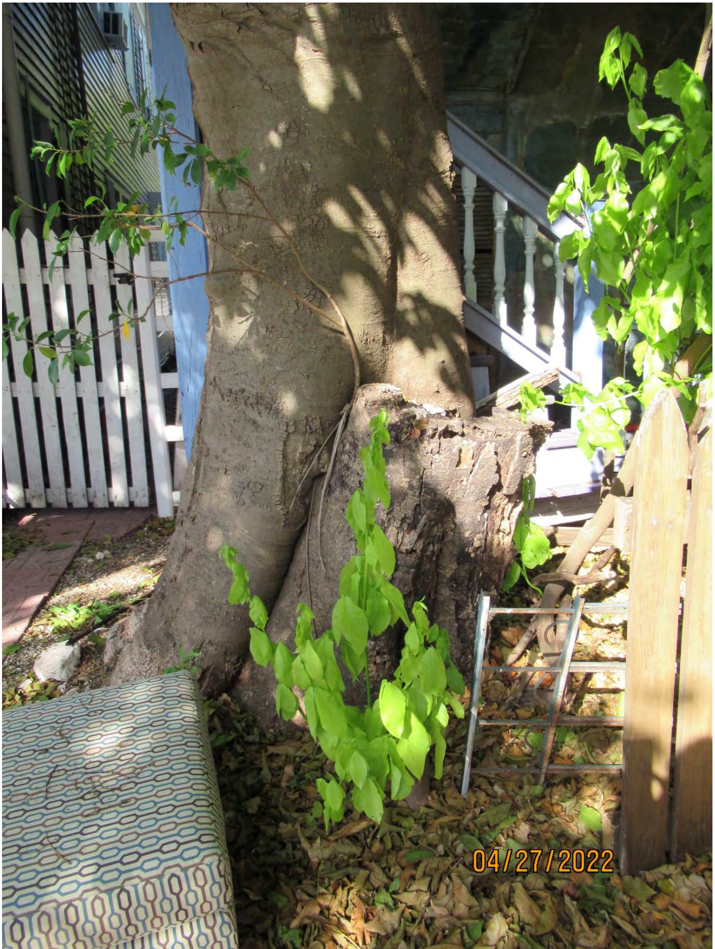
Photo of base of tree area showing old, decay trunk stump, view 1.