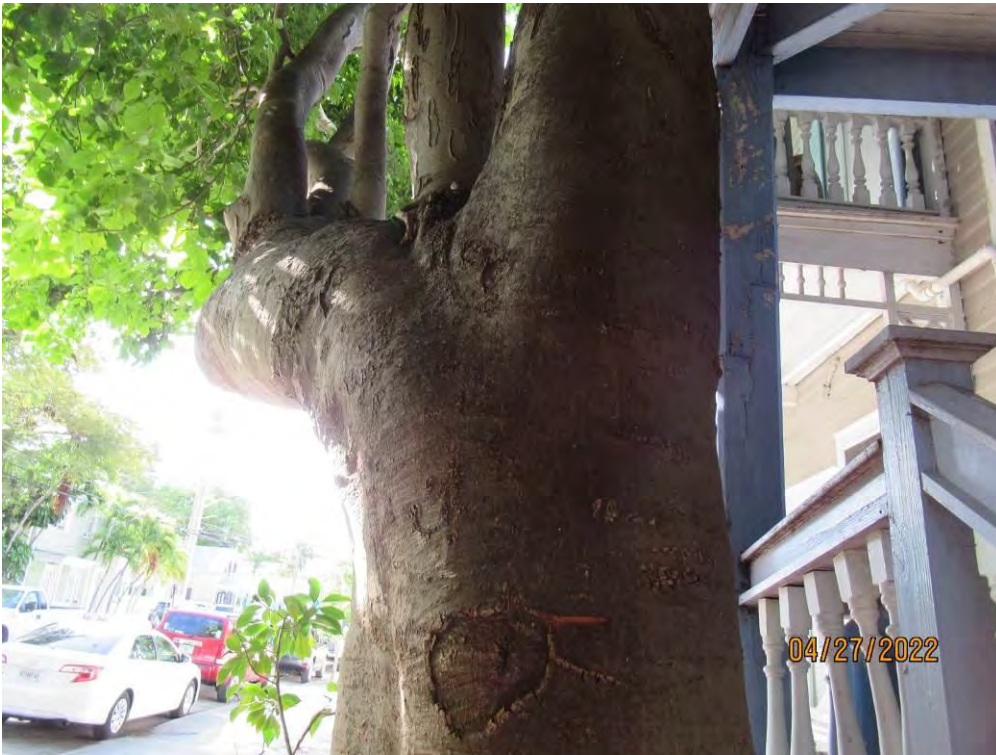
Photo showing main trunk and crotch area.