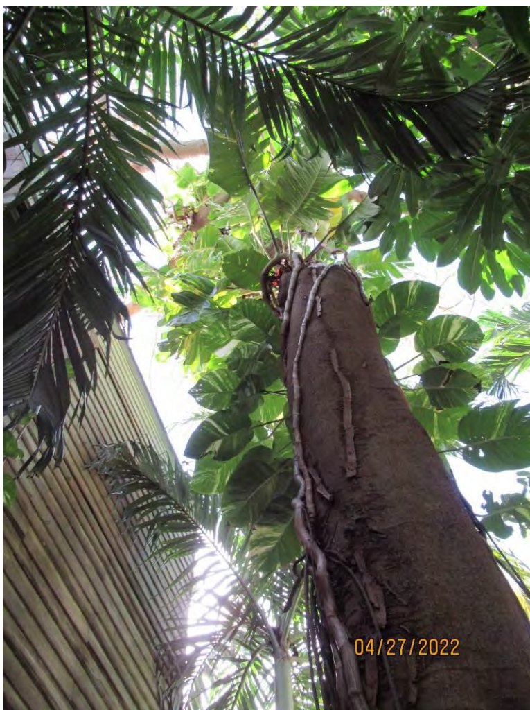
Photo of tree trunk, view 1.