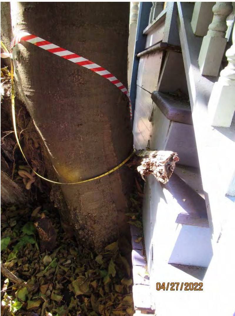
Photo showing location of base of tree and tree trunk in relation to structure, view 2.