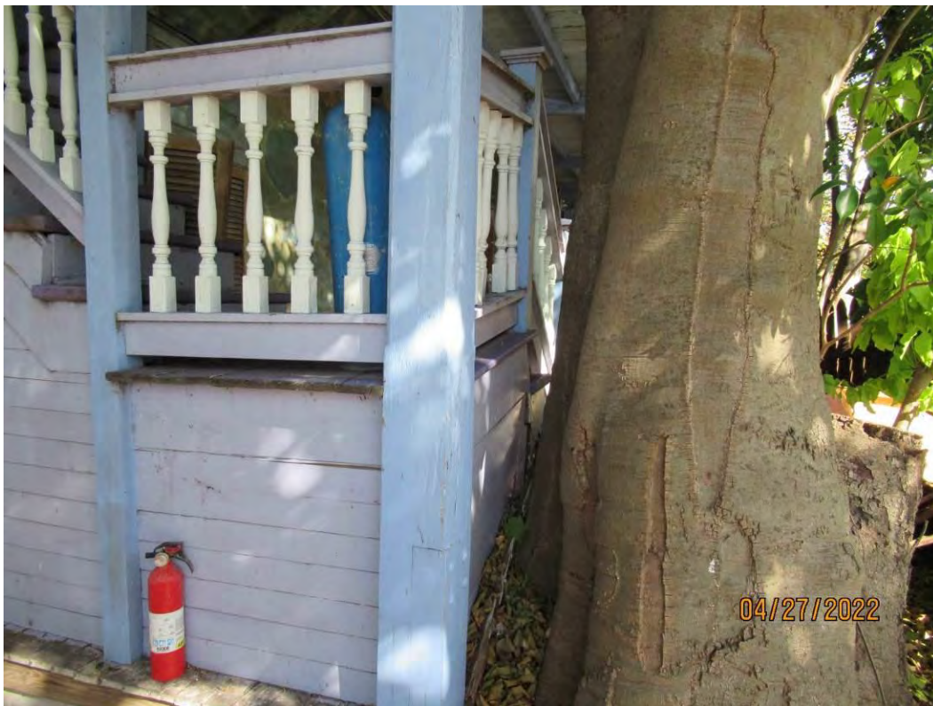
Photo showing location of base of tree and tree trunk in relation to structure, view 1.