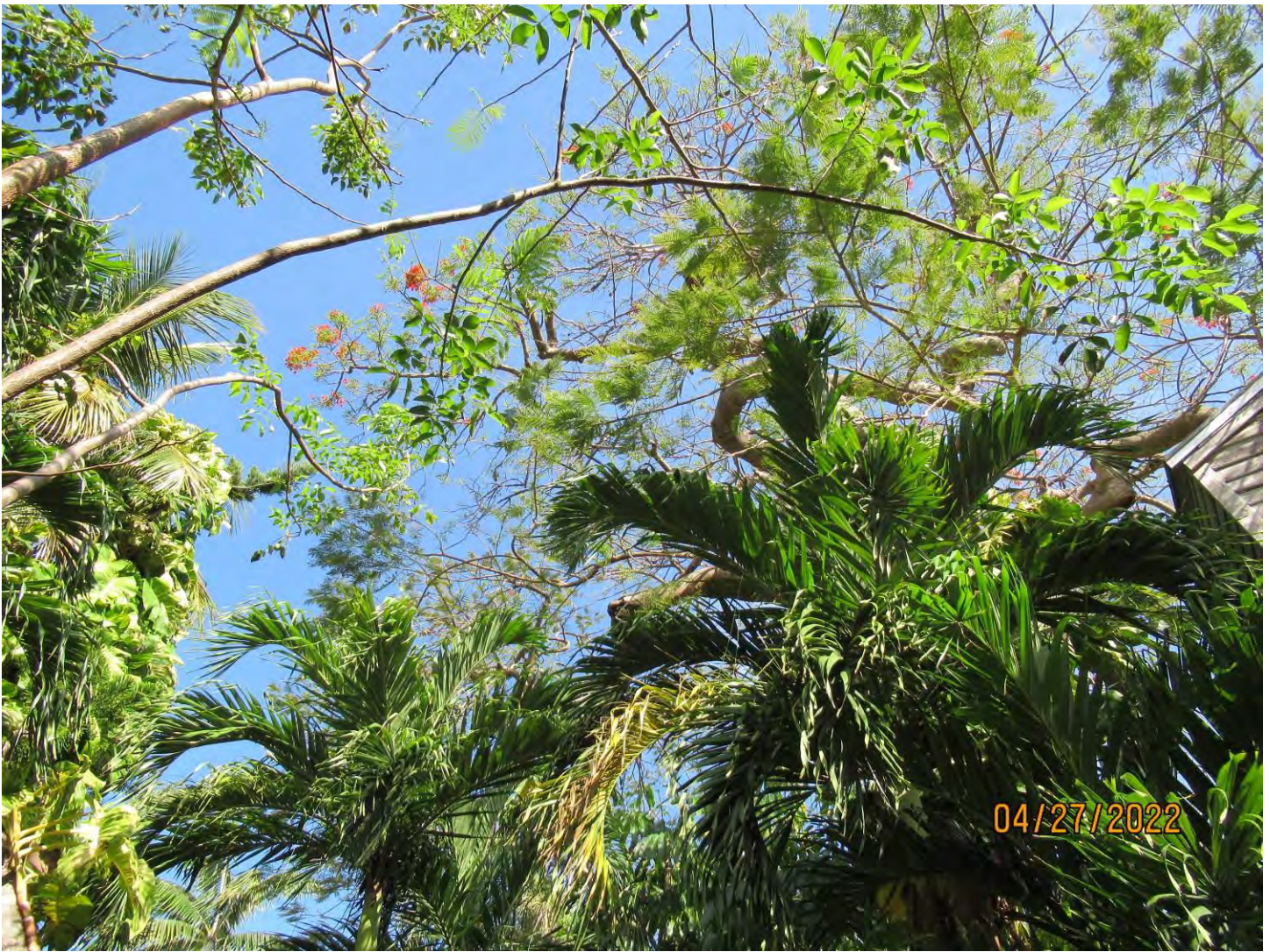
Photo of tree canopy.