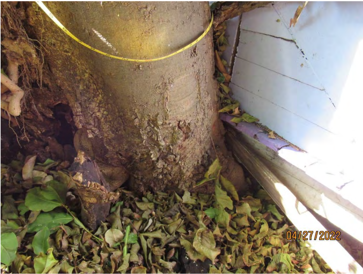
Close up photo of base of tree and structure impacts.