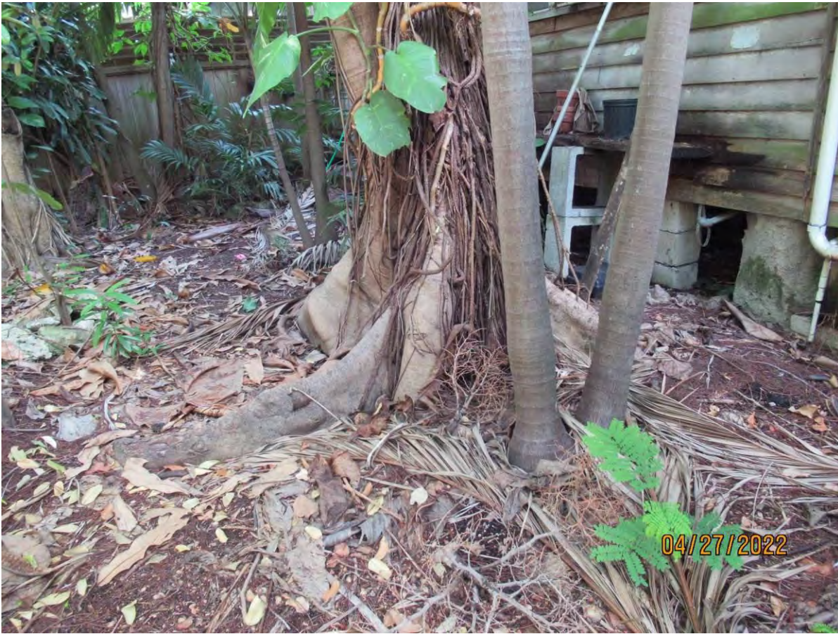
Photo of base of tree, view 2.