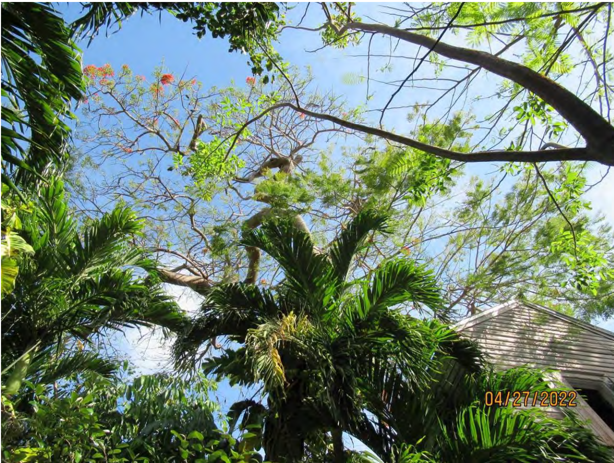
Two photos of tree canopy.