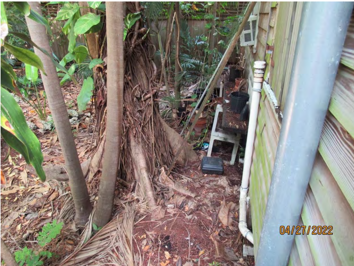
Photo of base of tree showing location in relation to structure.