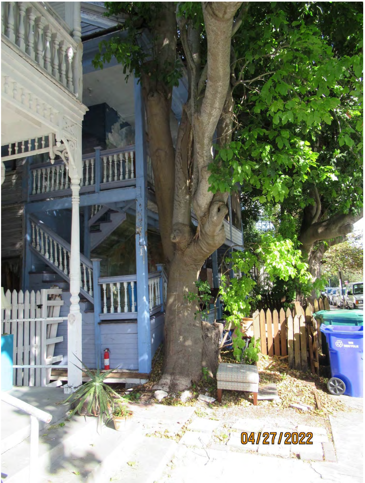
Photo showing base and trunk of tree, view 1.