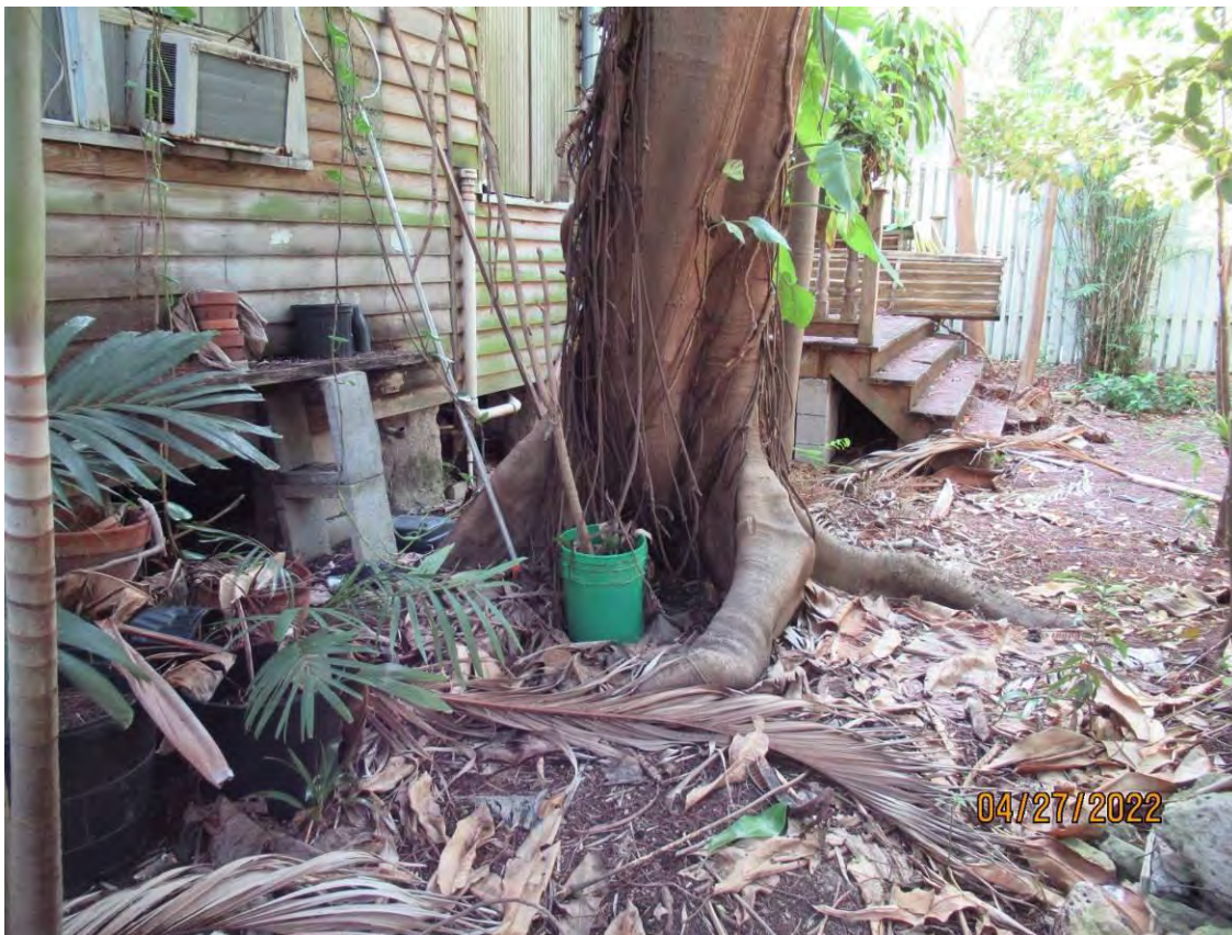
Photo of base of tree, view 1.