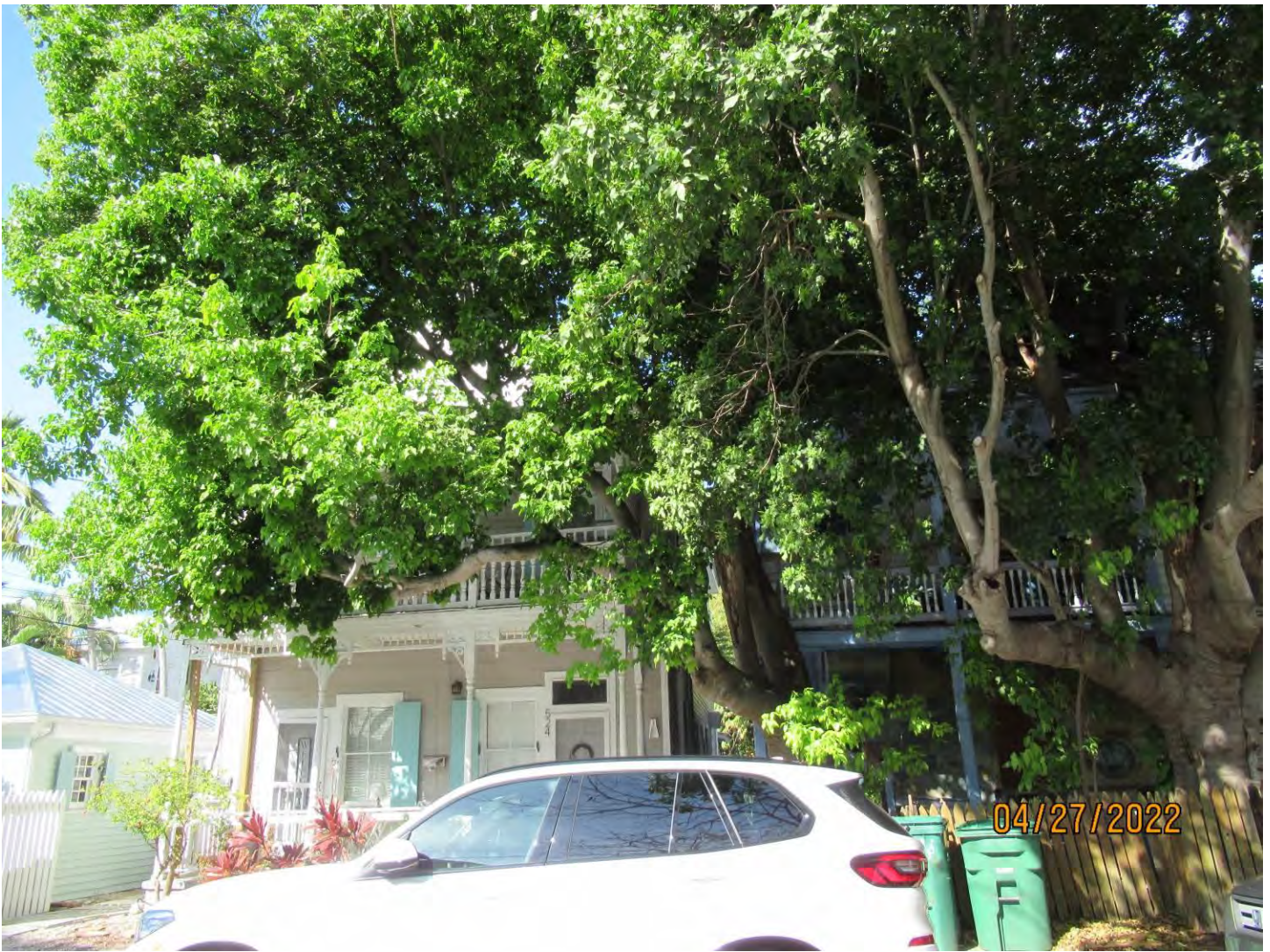
Photo of tree canopy.