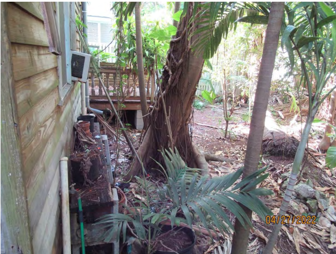
Photo showing location of trunk and base of tree in relation to structure, view 1.

Photo showing location of tree in backyard.