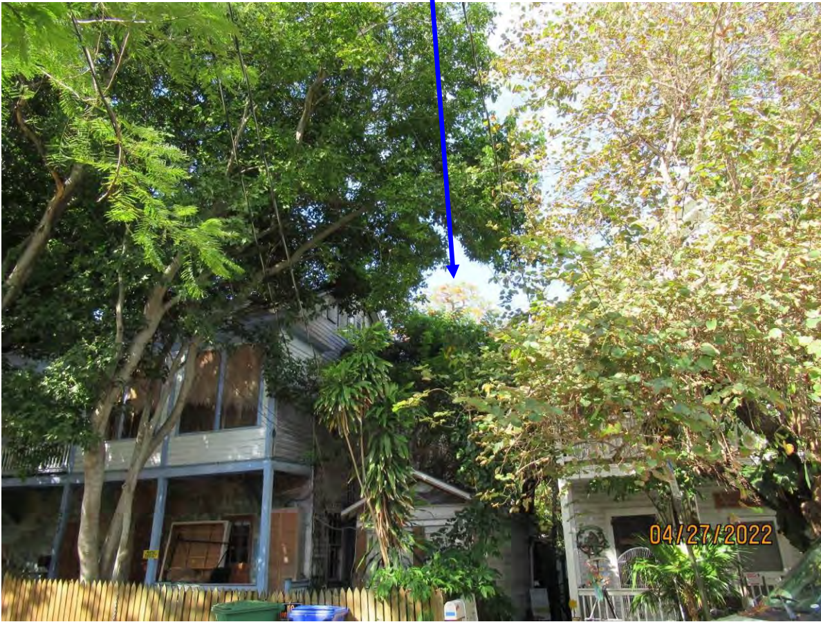
Photo showing location of tree in backyard.

Tree Species: Royal Poinciana (Delonix regia)