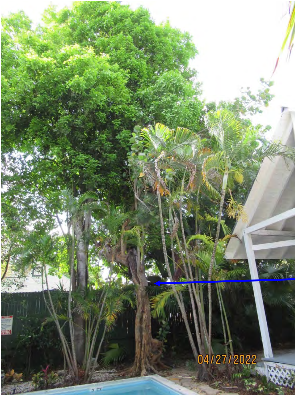
Photo showing whole tree and its location.

Tree Species: Sea Grape ( Cocoloba uvifera )