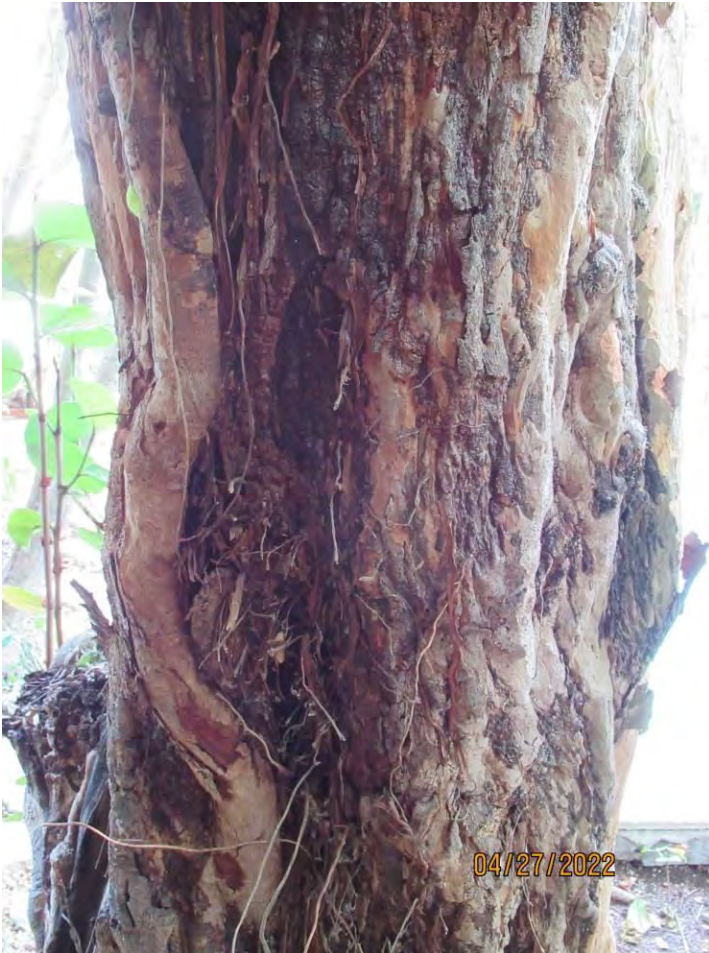
Two close up photos of termite damage in tree trunk, views 2 and 3.