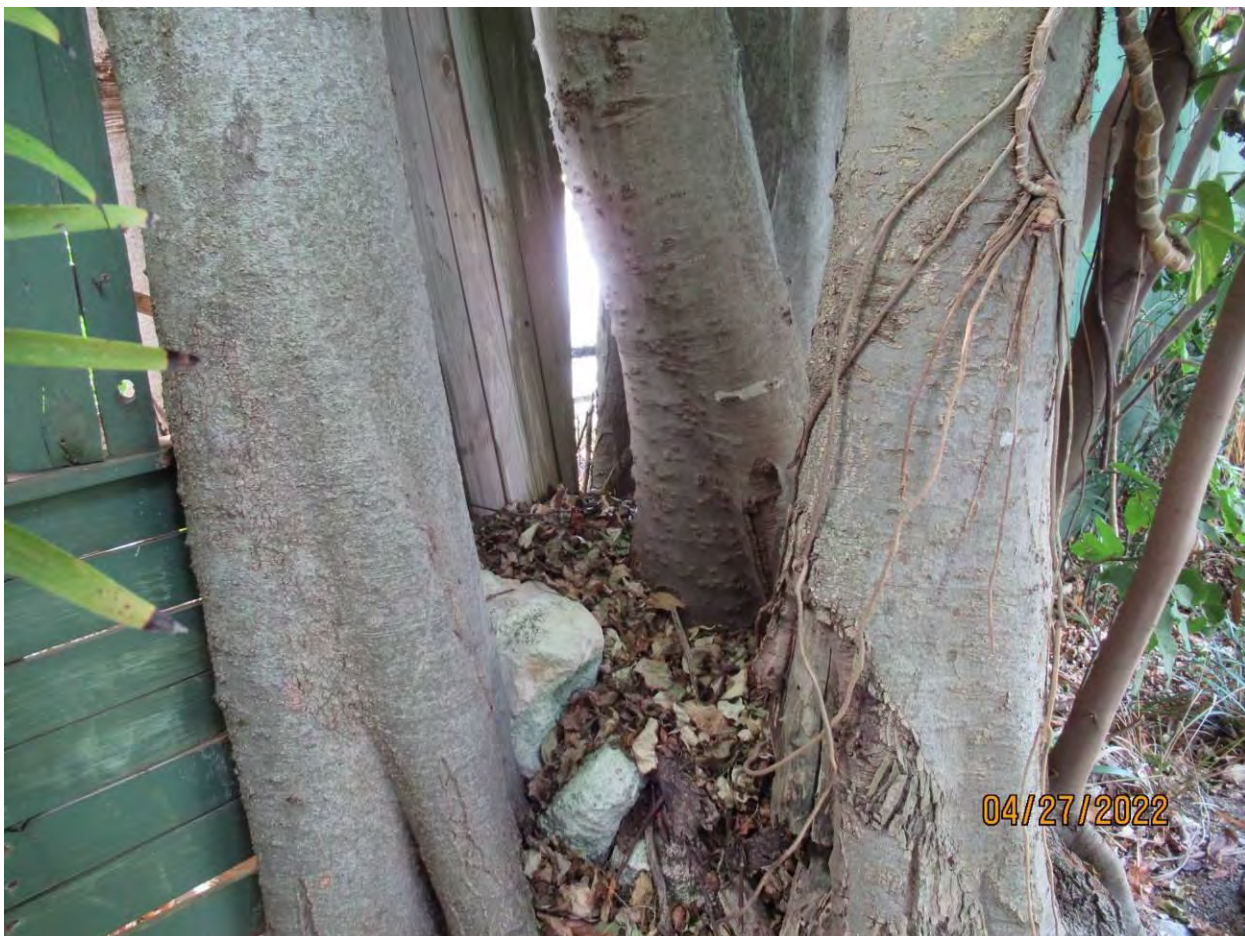
Photo of tree trunks near base.