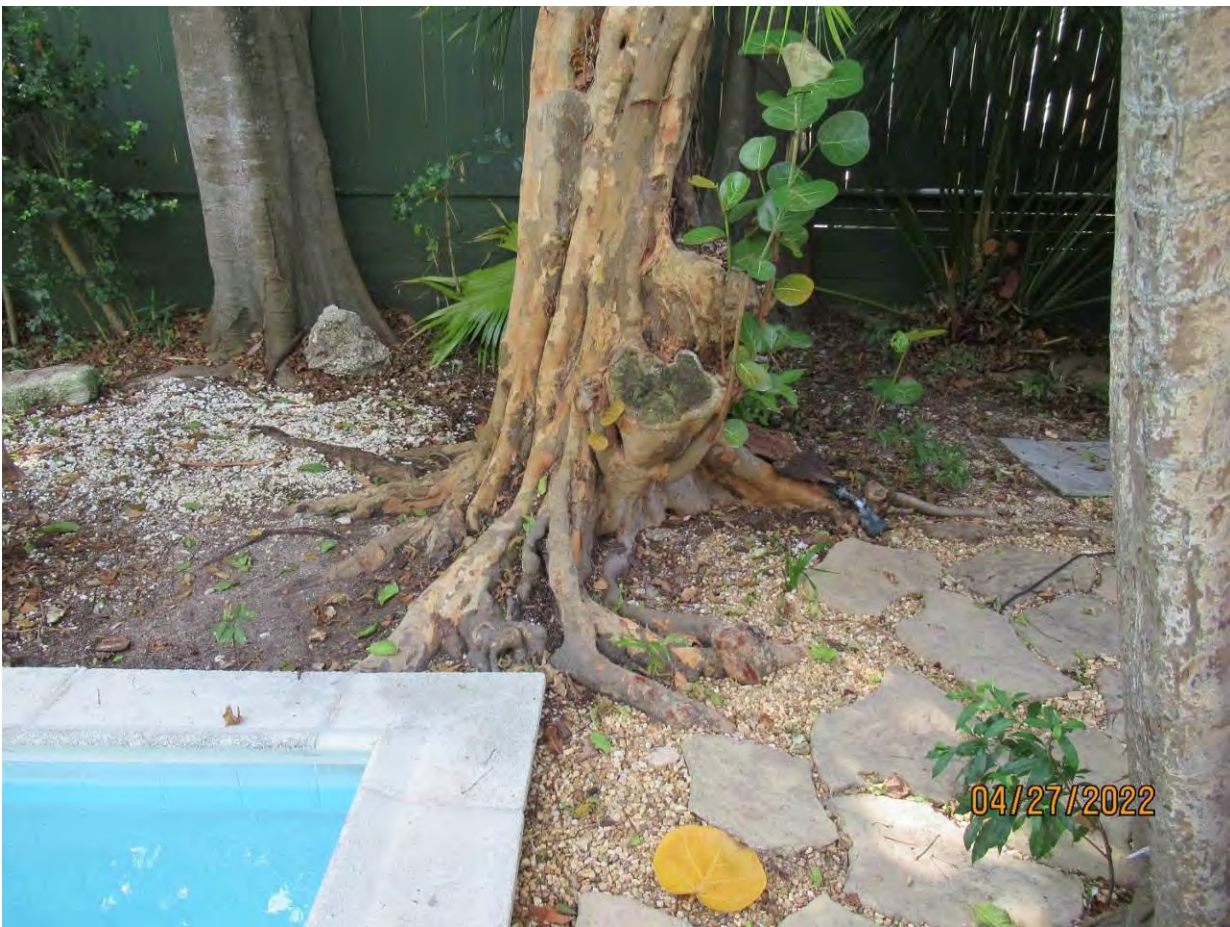
Photo of base of tree in relation to pool.