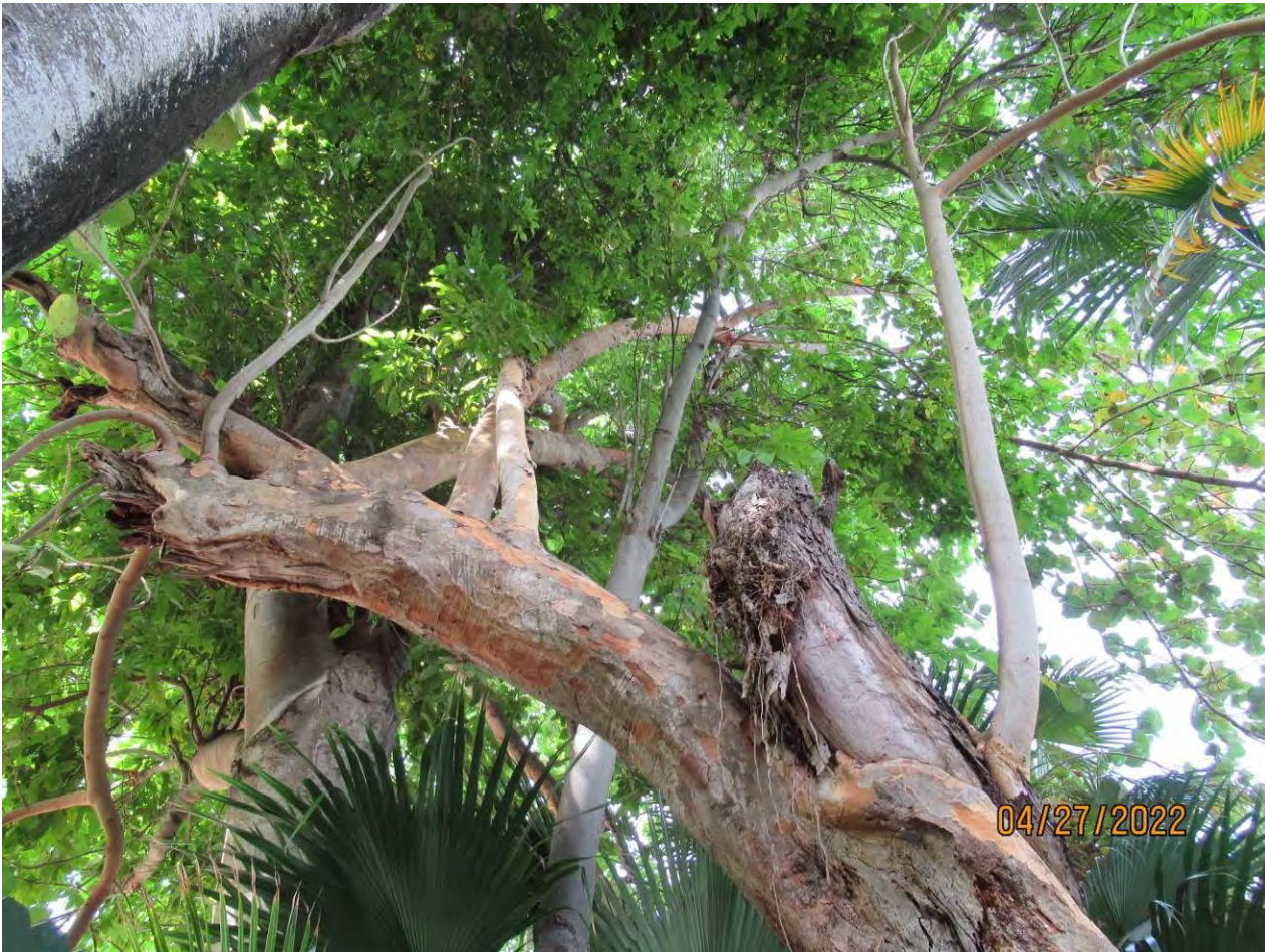
Photo of tree canopy and trunk, view 2.