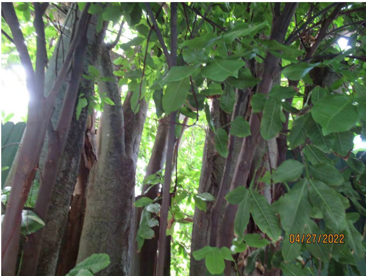
Photo of tree trunks near canopy, view 1.