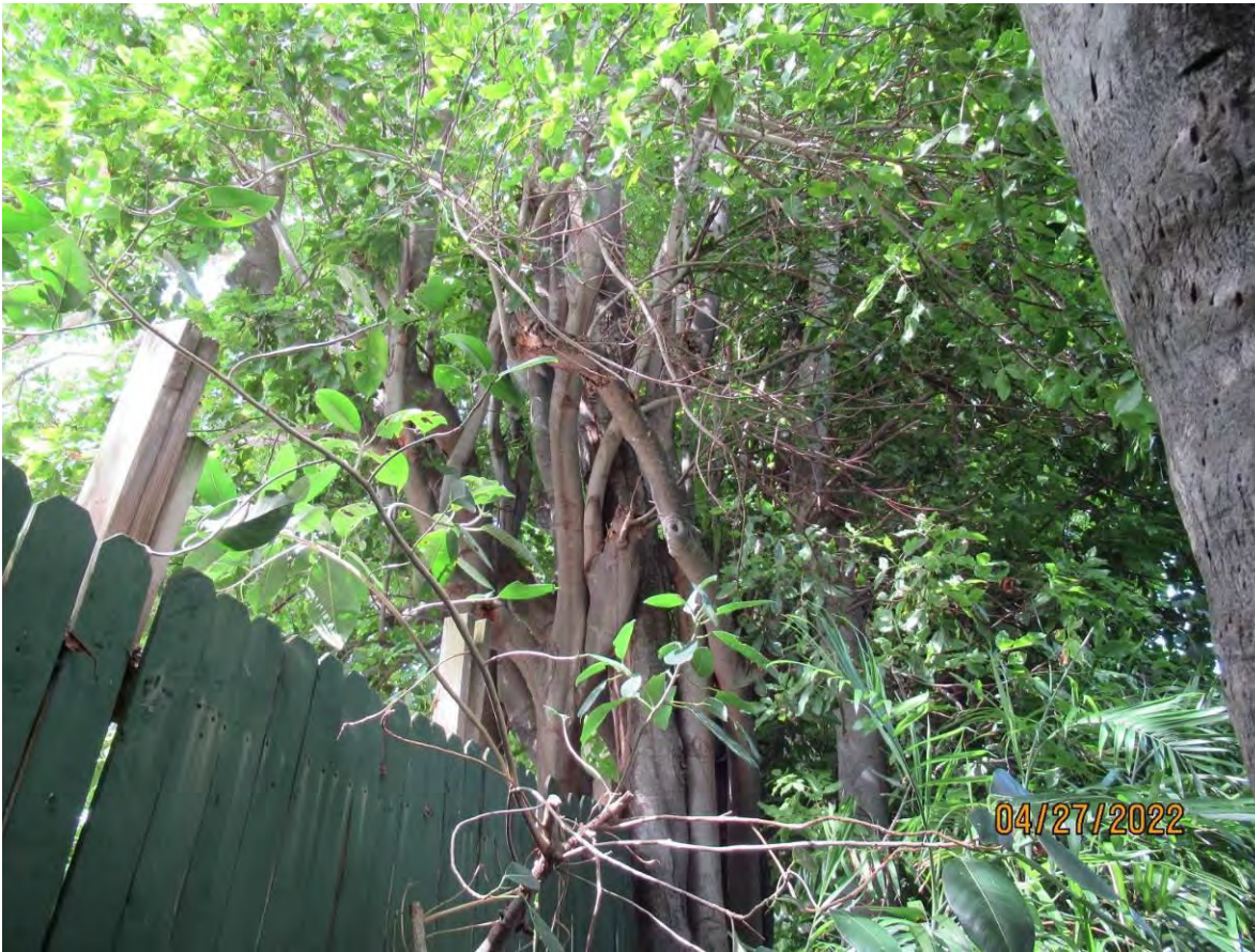
Photo of tree trunks near canopy, view 3.