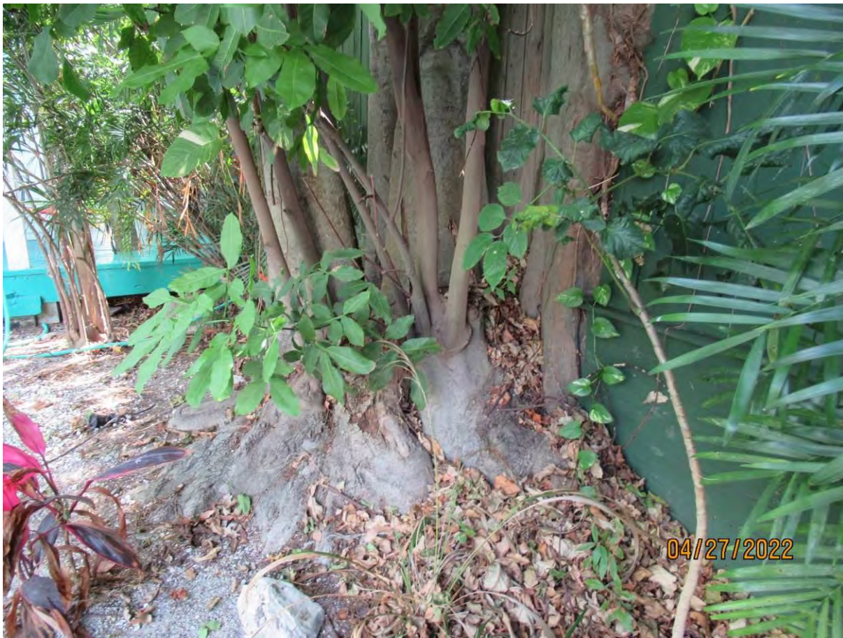
Photo of base area of tree, view 1.