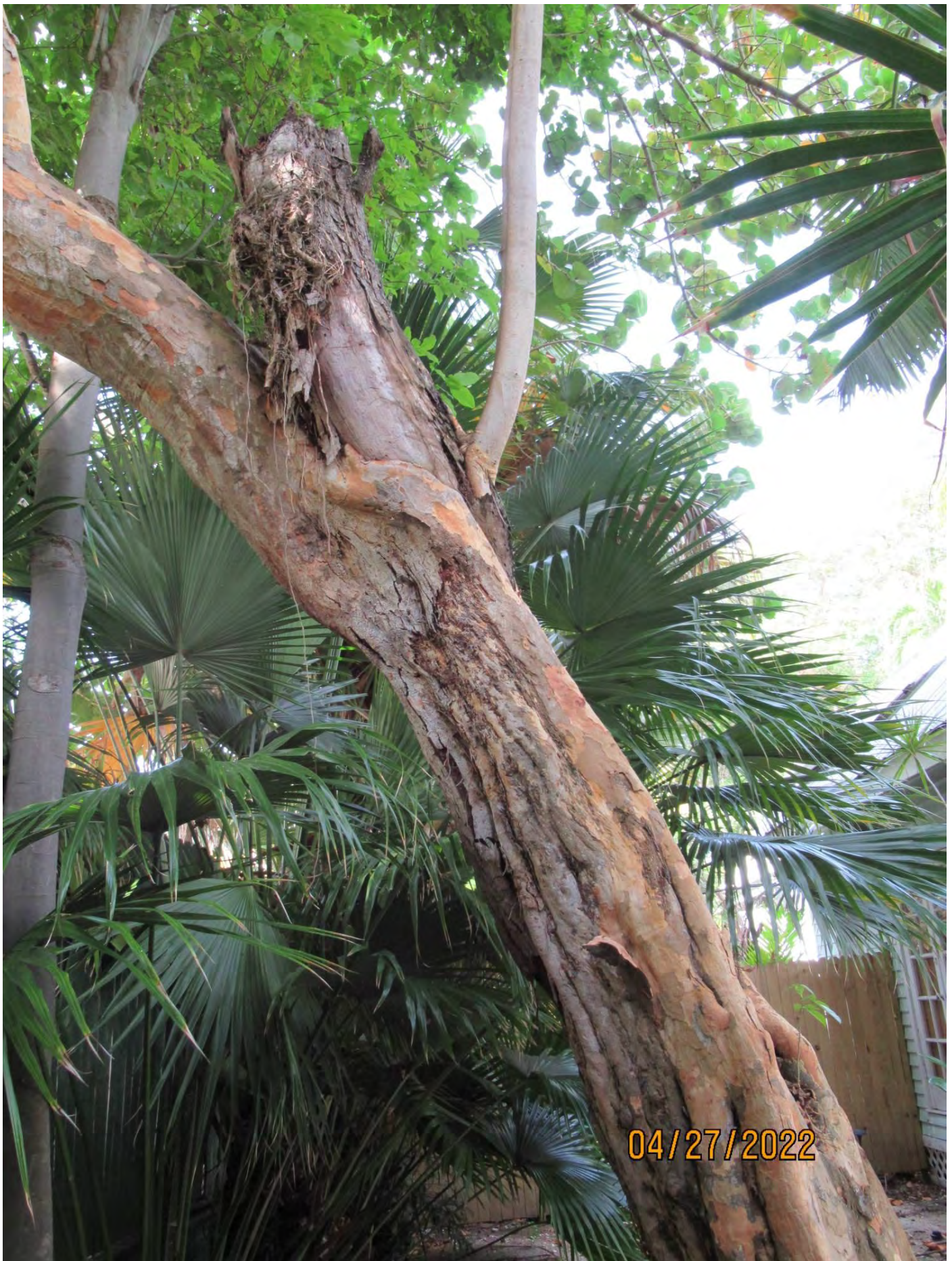
Photo of tree trunk, view 4.