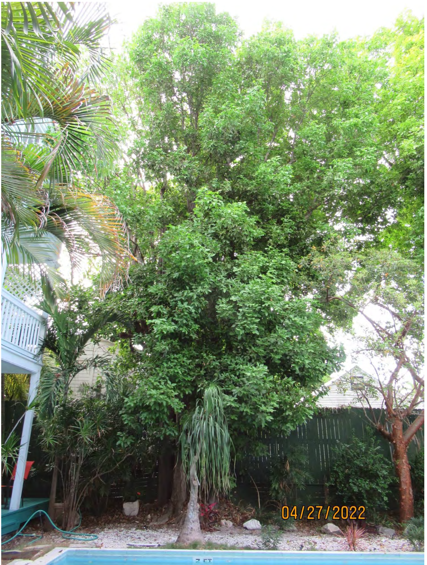
Photo of entire tree.