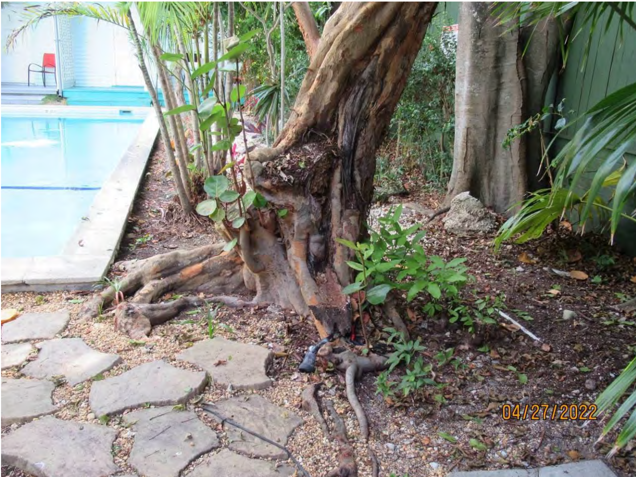
Photo of base of tree, view 1.