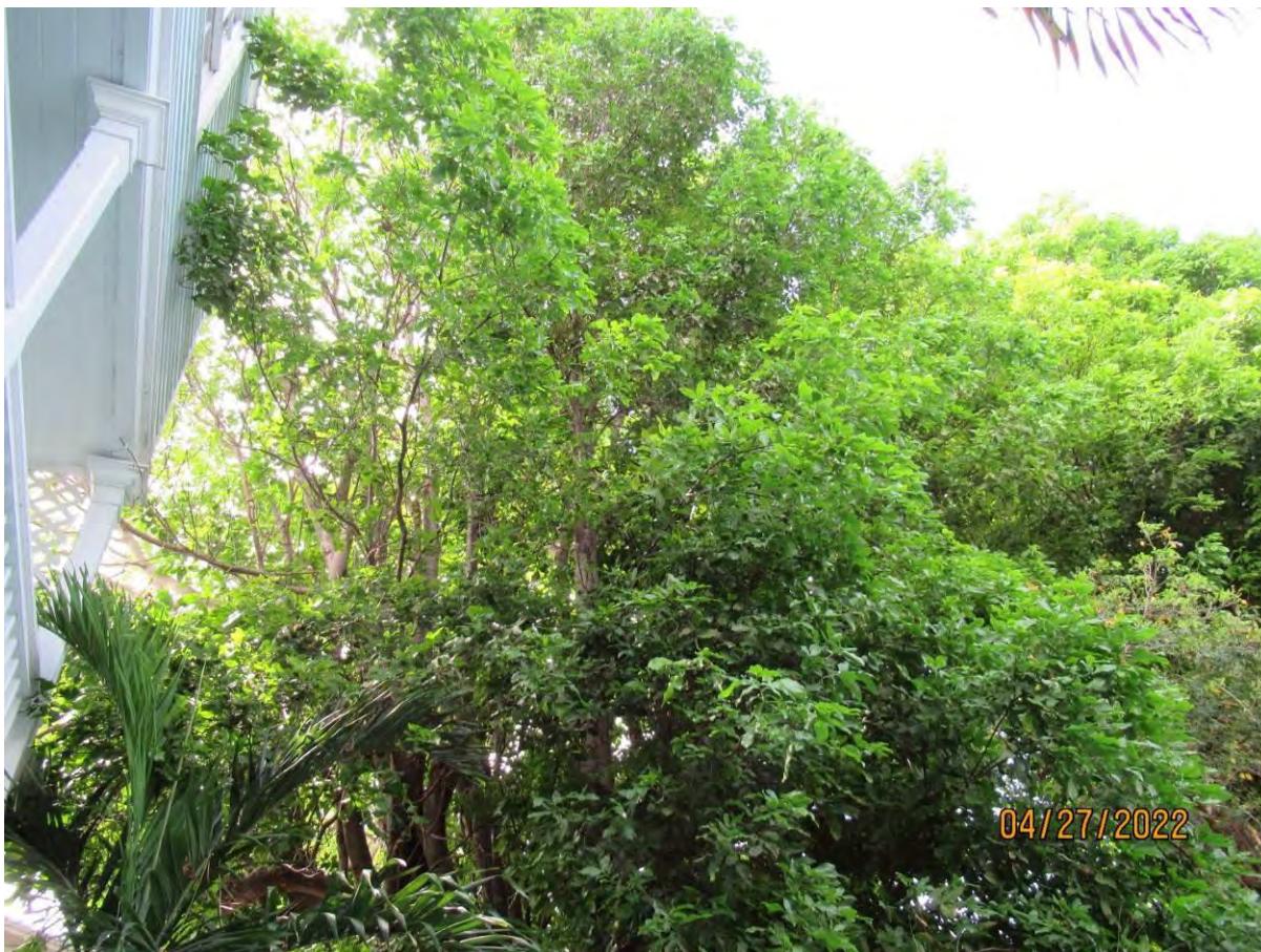
Two photos showing tree canopy.