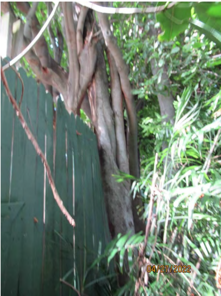
Phot of tree trunks in relation to property line fence.