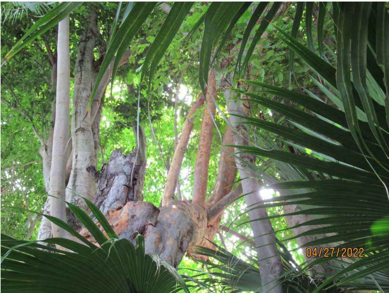
Photo of tree canopy and trunk, view 1.