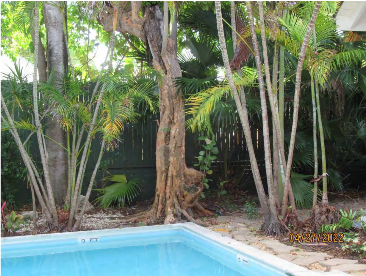
Photo of tree trunk, view 1.