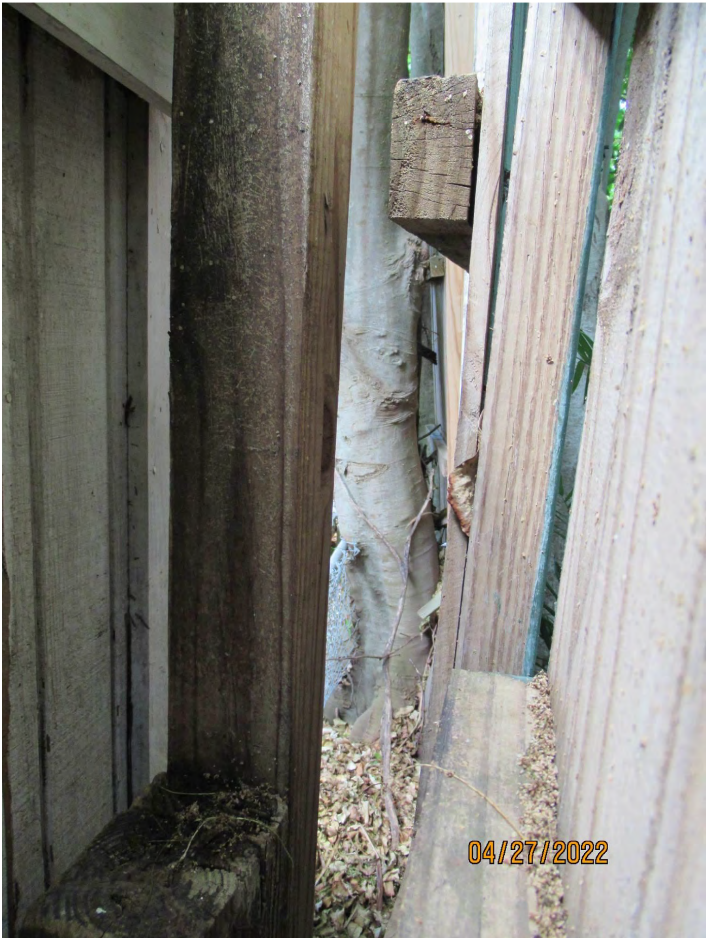
Photo looking on other side of property line fence at tree trunks-part of tree appears to be on neighboring property.