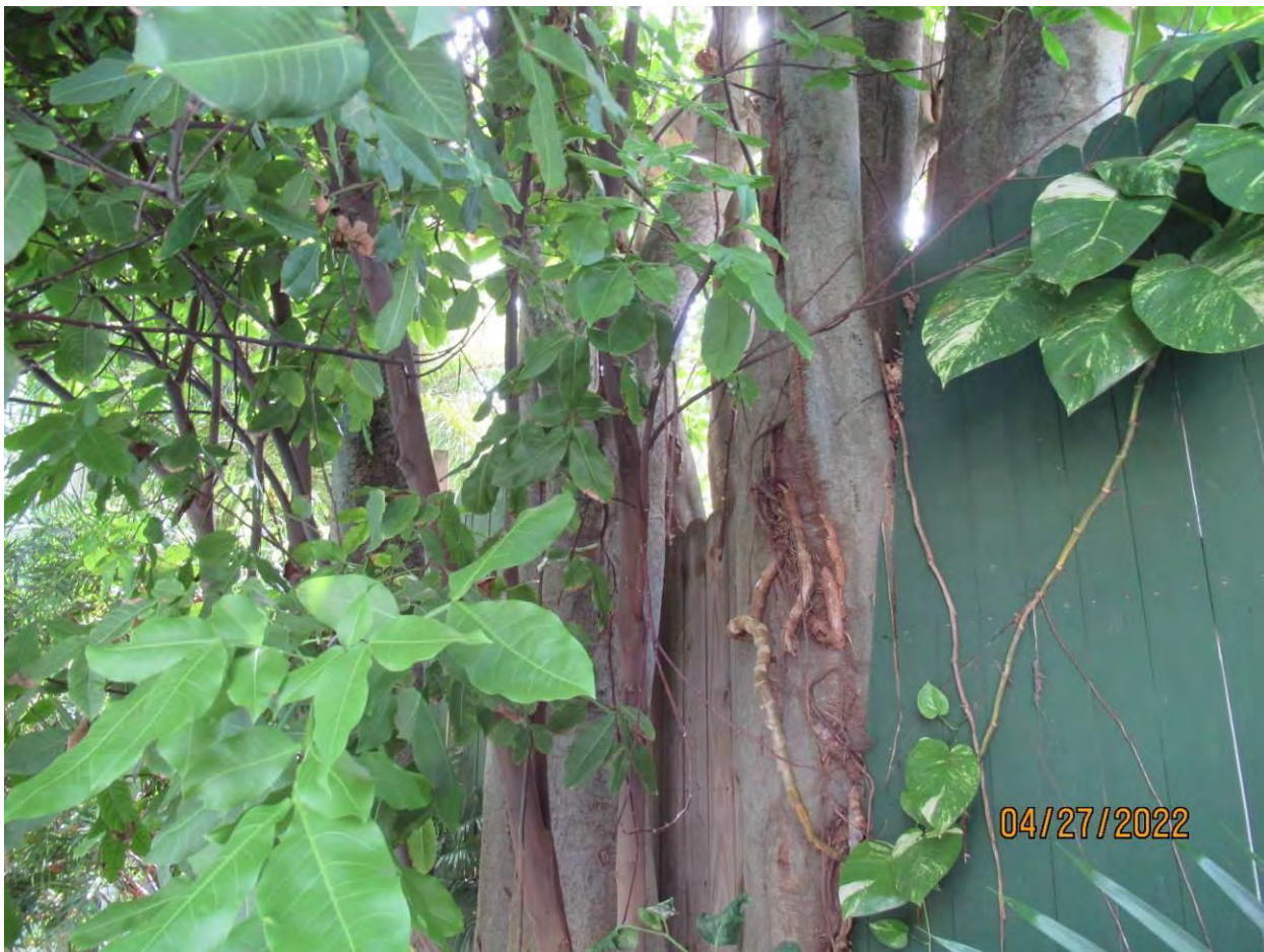
Photo of tree trunks near canopy, view 2.