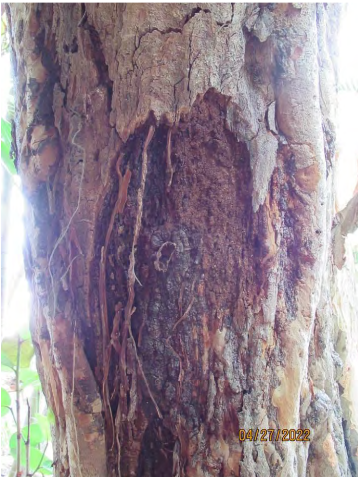
Close up photo of termite damage in tree trunk, view 1.