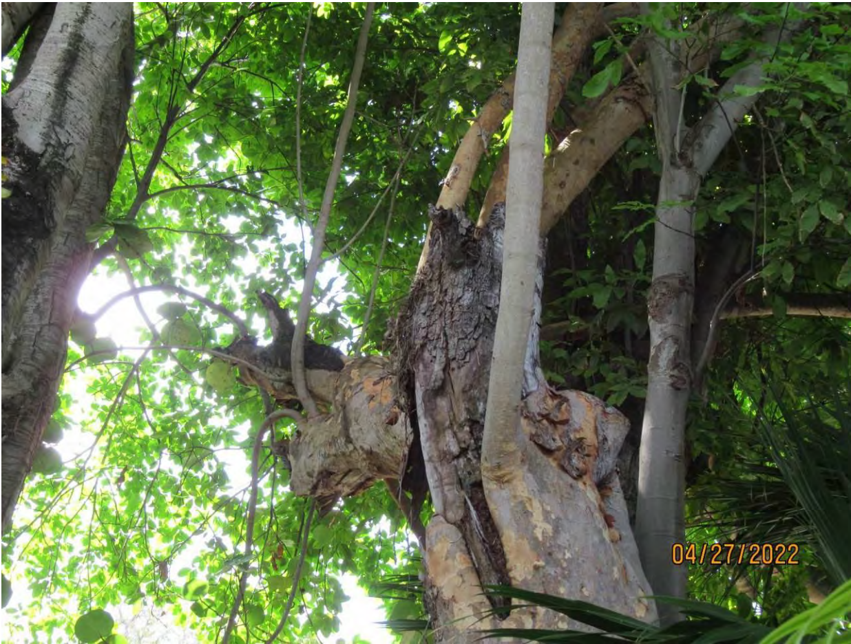
Photo of tree trunk, view 3.