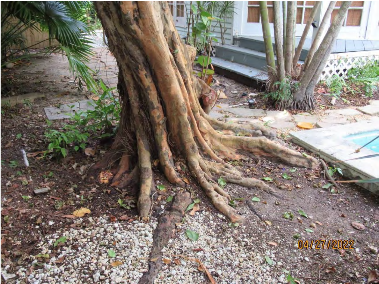
Photo of base of tree, view 2.