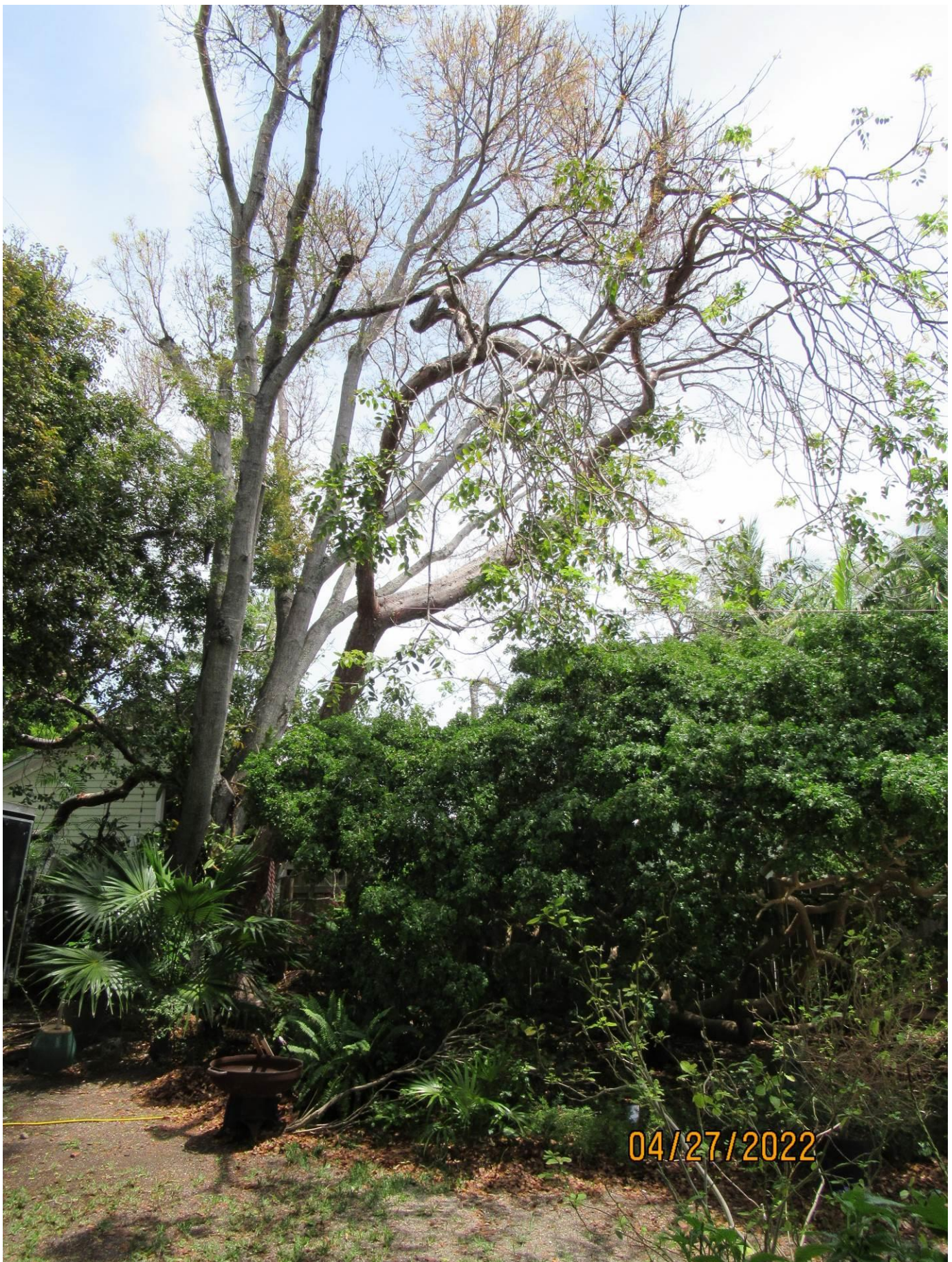
Photo showing canopy of mahogany and gumbo limbo tree.