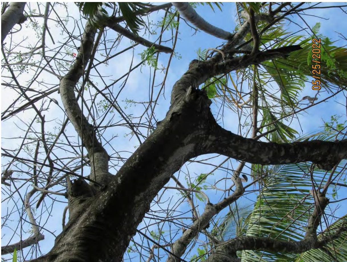
Photo of main trunk branches and canopy, view 1.