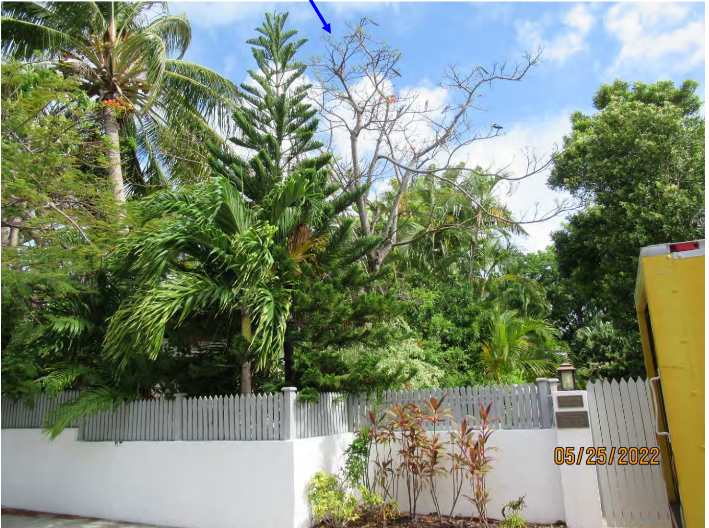
Photo showing location of tree.

Tree Species: Royal Poinciana ( Delonix regia )