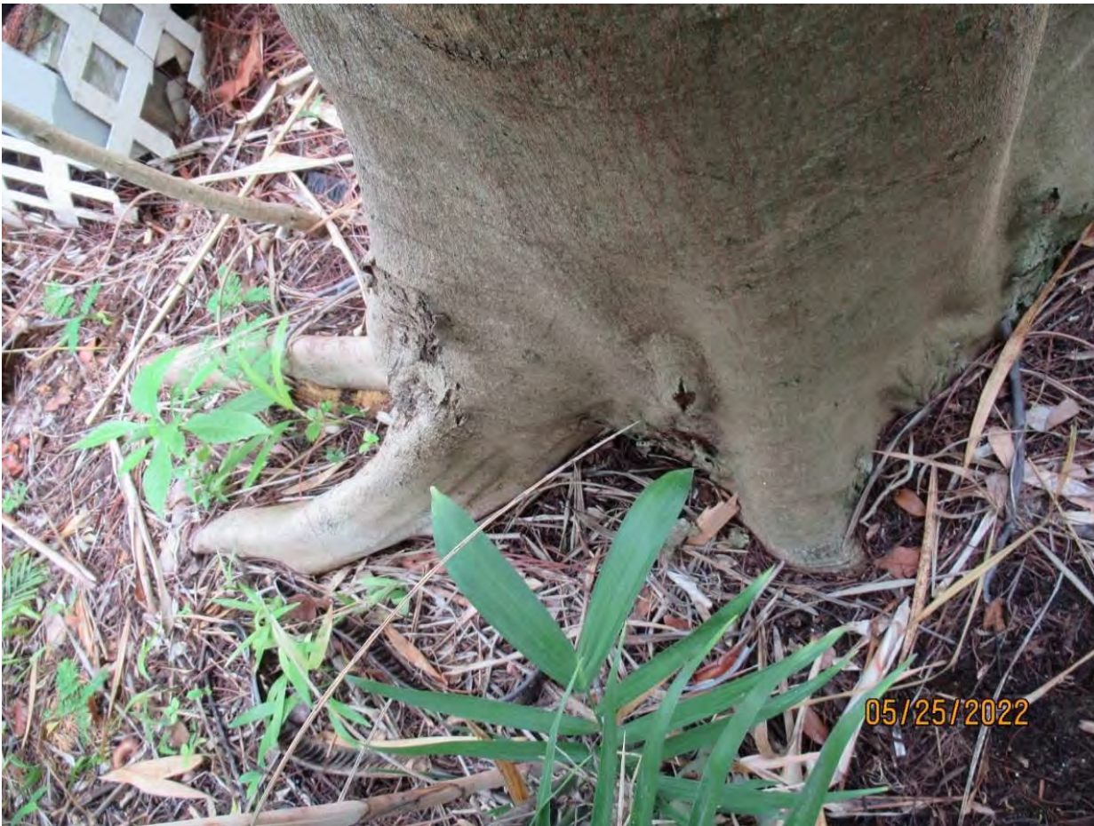
Photo of base of tree, view 3.