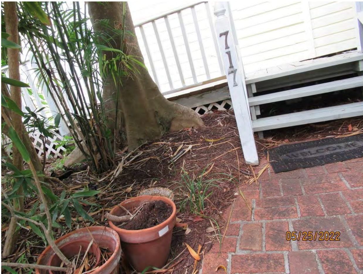
Photo of base of tree, view 1.