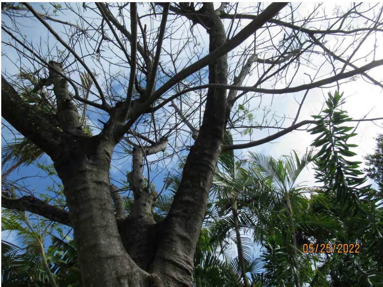
Photo of main trunk branches and canopy, view 3.