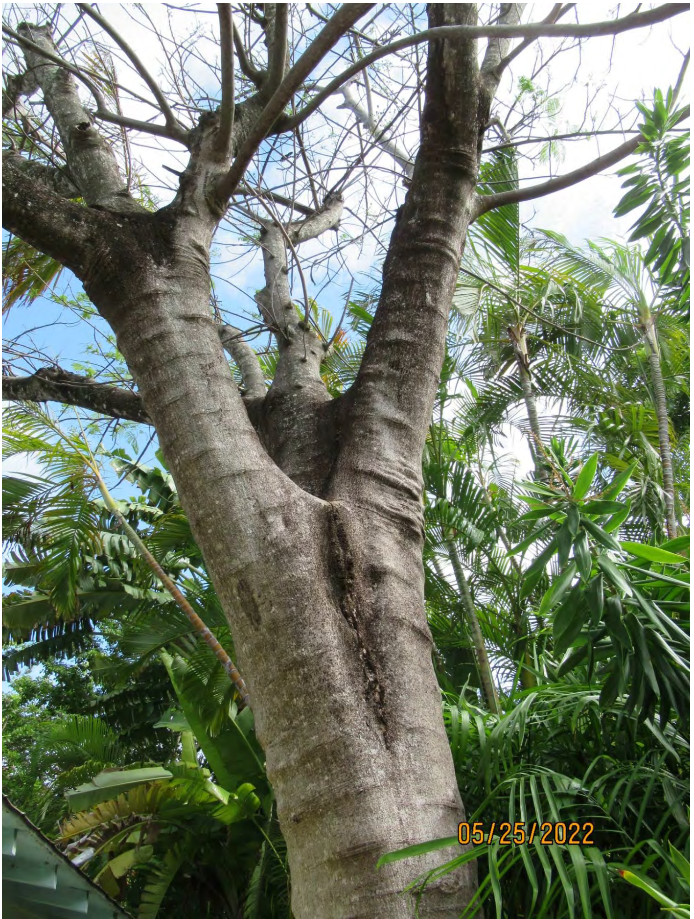
Photo of main trunk branches and canopy, view 2.