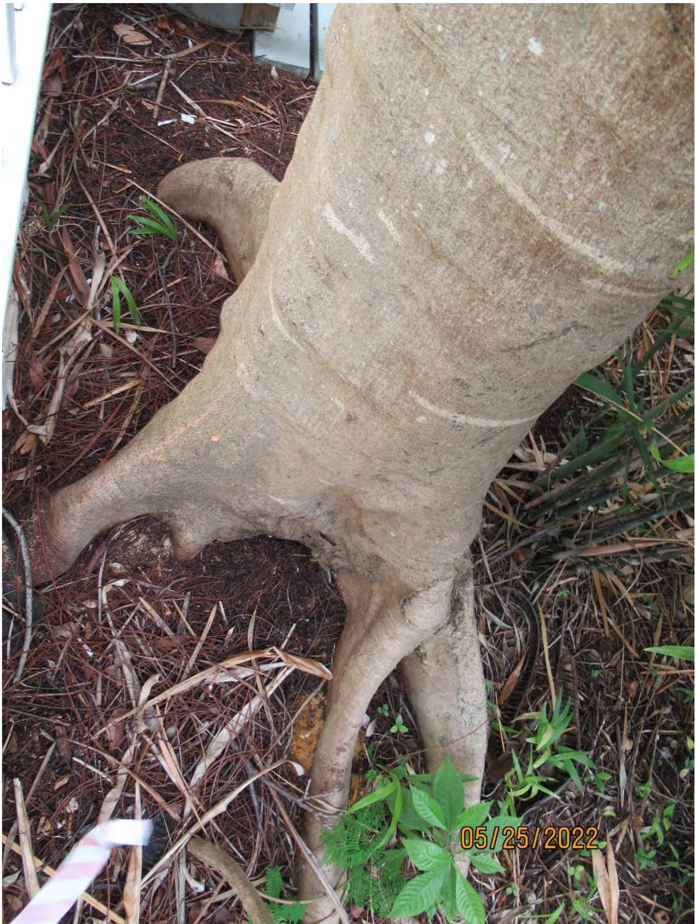
Photo of base of tree, view 2.