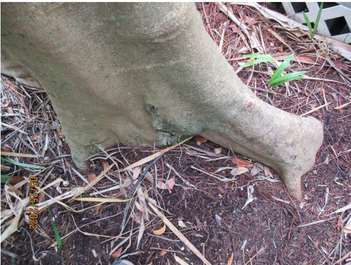
Photo of base of tree, view 4.