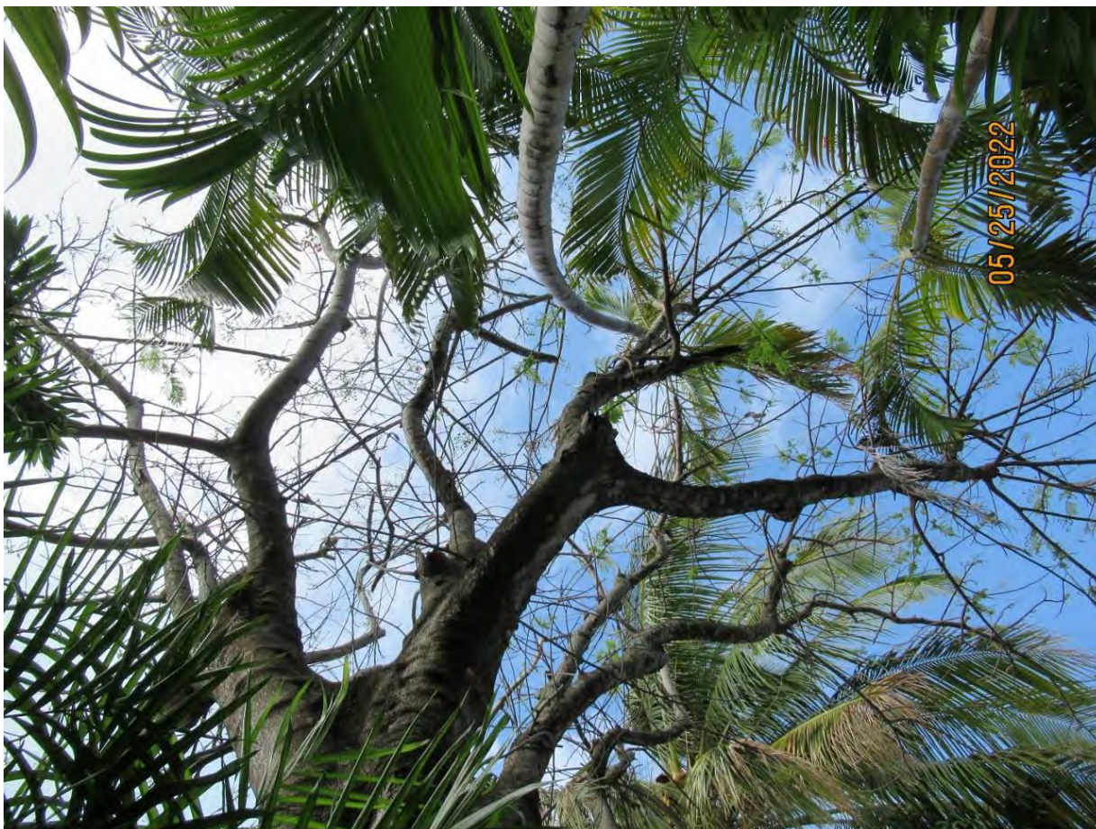
Photo of tree canopy, view 2.