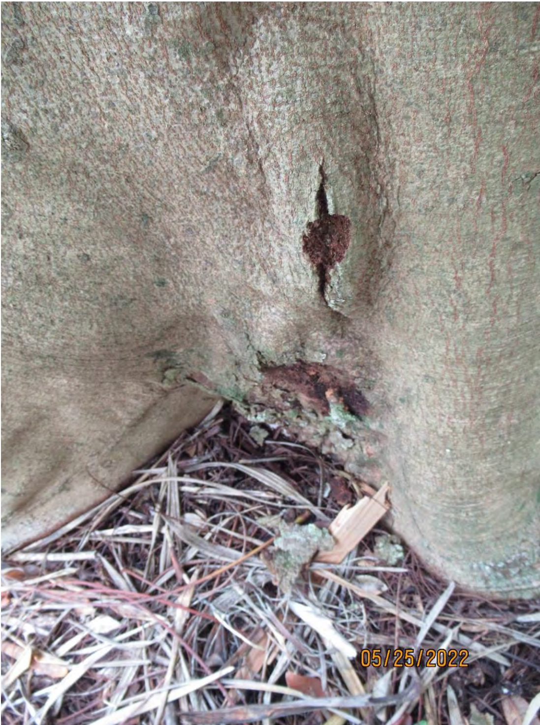
Photo of base of tree, view 5.

Diameter: 16.8" Location: 60% (tree very visible from street, root system close to structure) Species: 100% (on protected tree list) Condition: 60% (overall condition is fair, some fungus around base of tree and some decay in canopy.) Total Average Value = 73% Value x Diameter = 12.2 replacement caliper inches