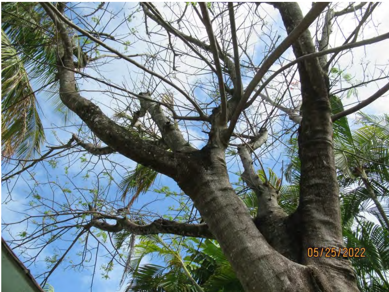
Photo of main trunk branches and canopy, view 2.