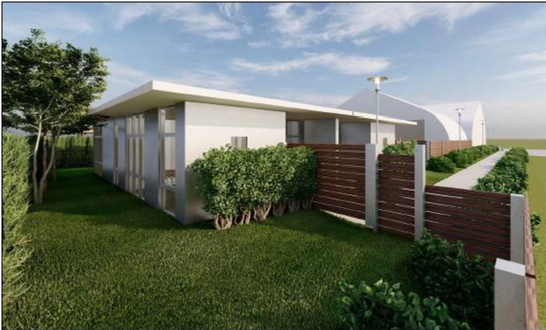
NORTH-EAST HOUSE ELEVATION SCALE: N/A

Proposed Elevations for Two New Housing Units