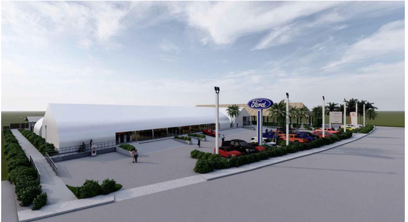
The Proposed Sales Building