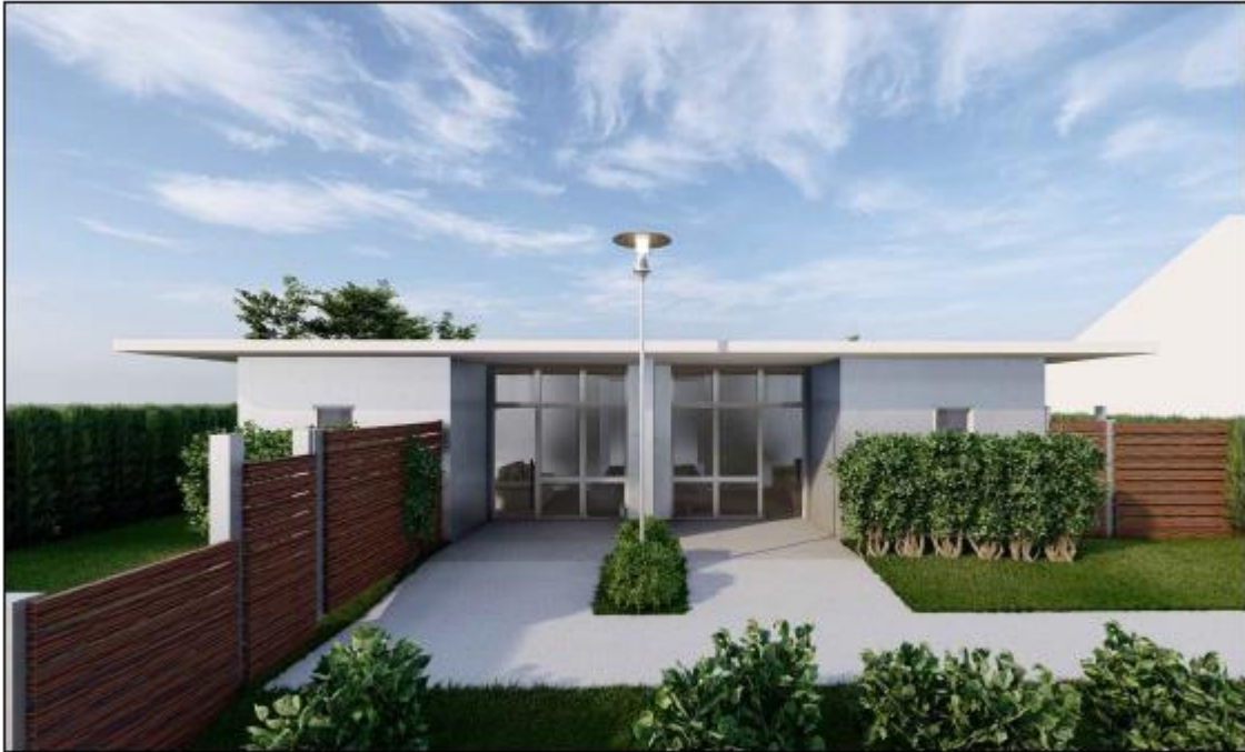
EAST HOUSE ELEVATION SCALE: N/A