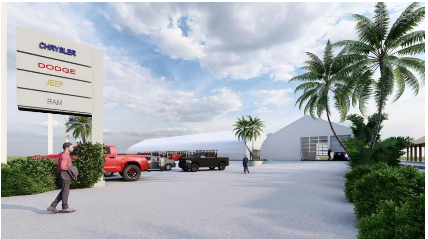
Proposed Buildings as seen from N. Roosevelt Boulevard