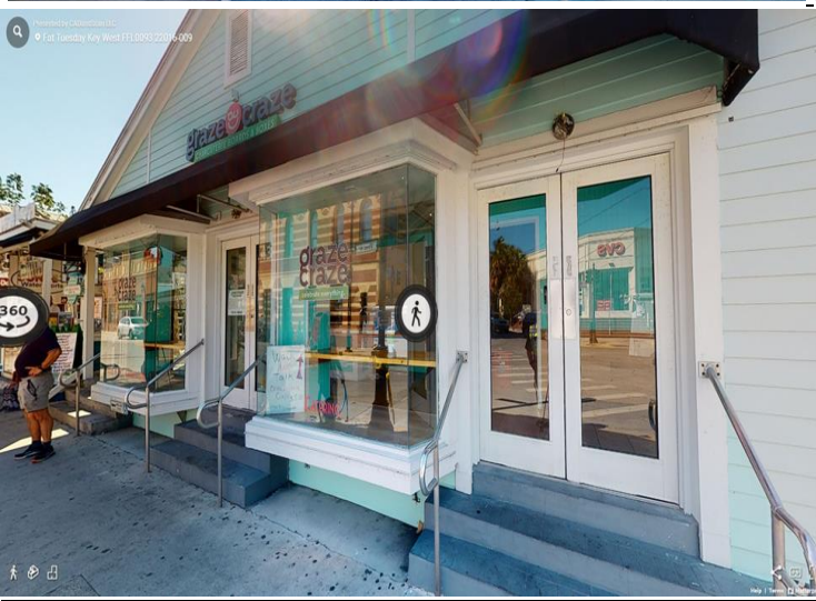
Front of Site