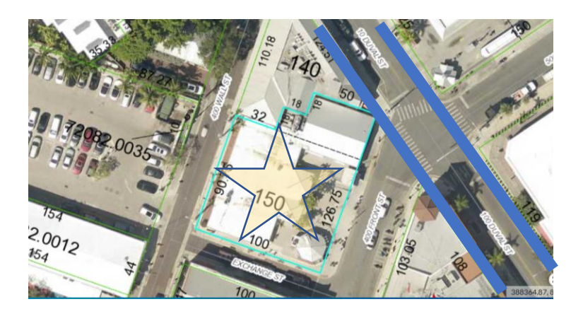
Aerial Photo of Site-Duval Street highlighted in blue