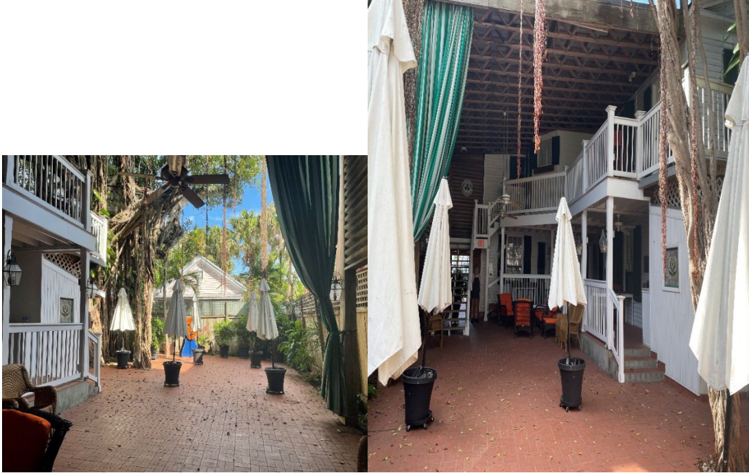
Pictures of the proposed outdoor event space (paved courtyard and covered porch, 1,400 sq. ft.)

The subject property is in the 500 block of Eaton Street near the corner of Simonton Street. The building was originally built in 1938. The two residential unit building is located within the Historic Neighborhood Commercial Truman/Simon (HNC-1) zoning district and is currently used to house visiting artists on a month-to-month basis, as both a transient and non-transient rental property. The Studios of Key West has a transient license attached to one of the two units that is occasionally rented short-term in the off-season. The second unit is a non-transient unit. The property has a driveway that can accommodate 2 vehicles. Currently it is not open to the public.