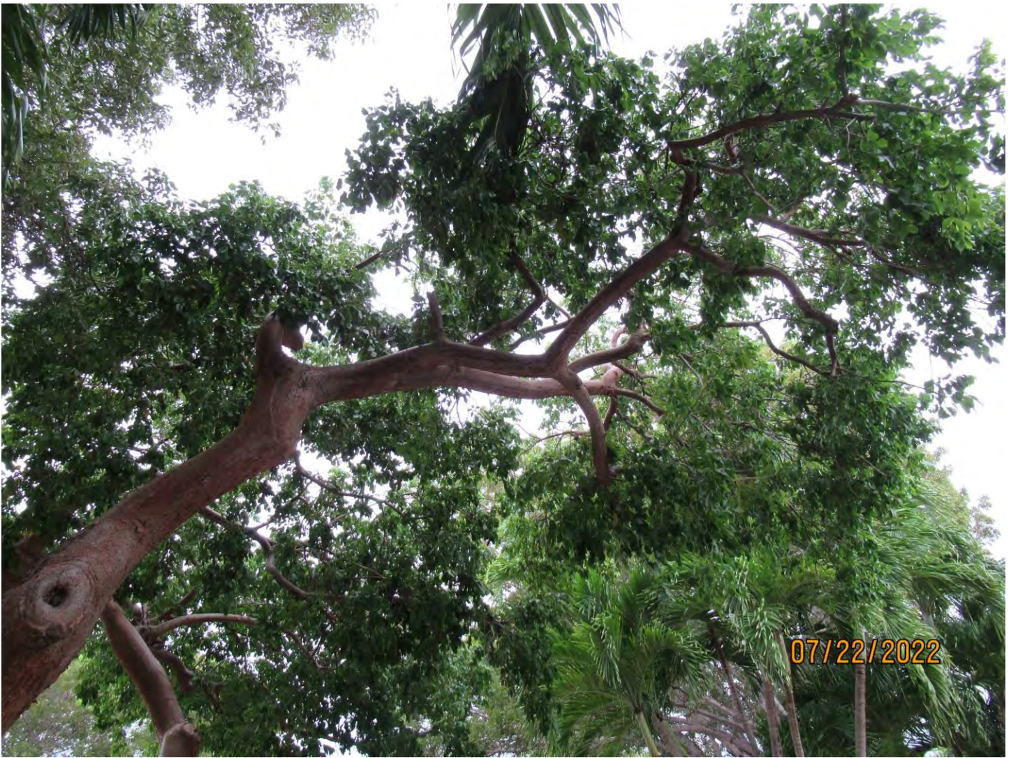
Photo of tree canopy, view 3.