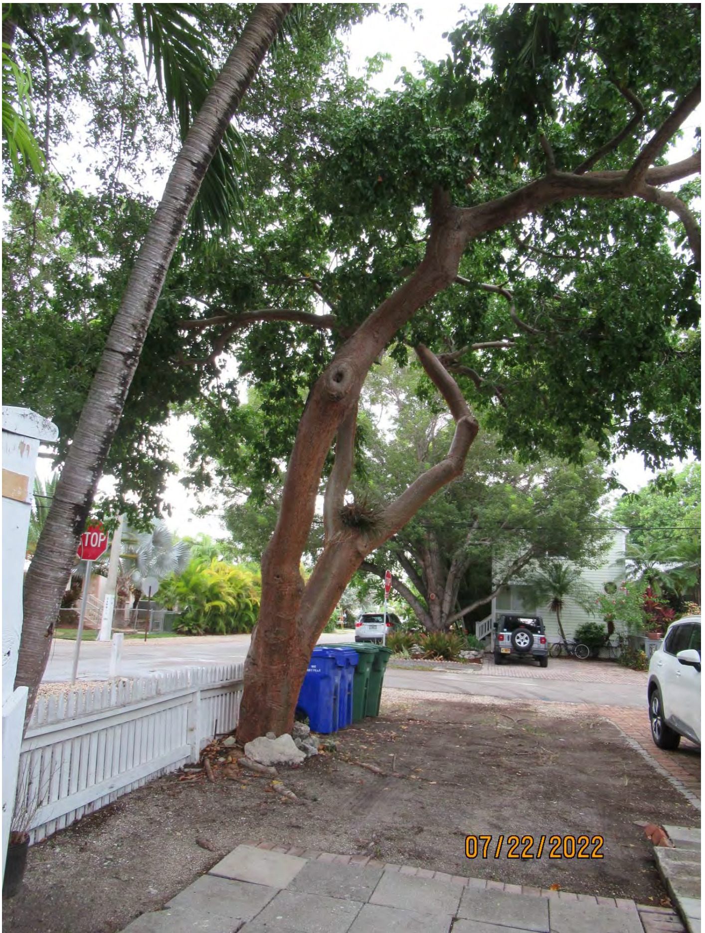
Photo of main trunk and canopy branches, view 2.