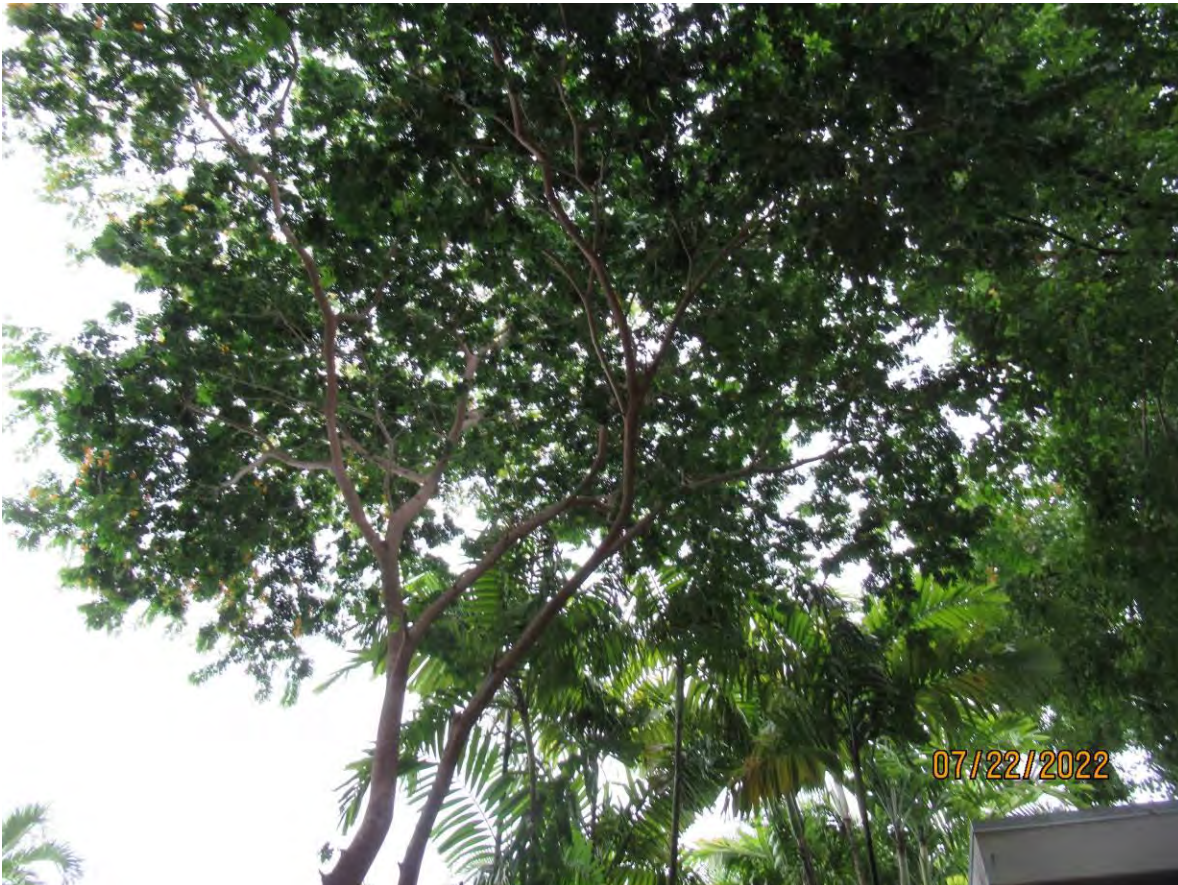
Photo of tree canopy, view 2.