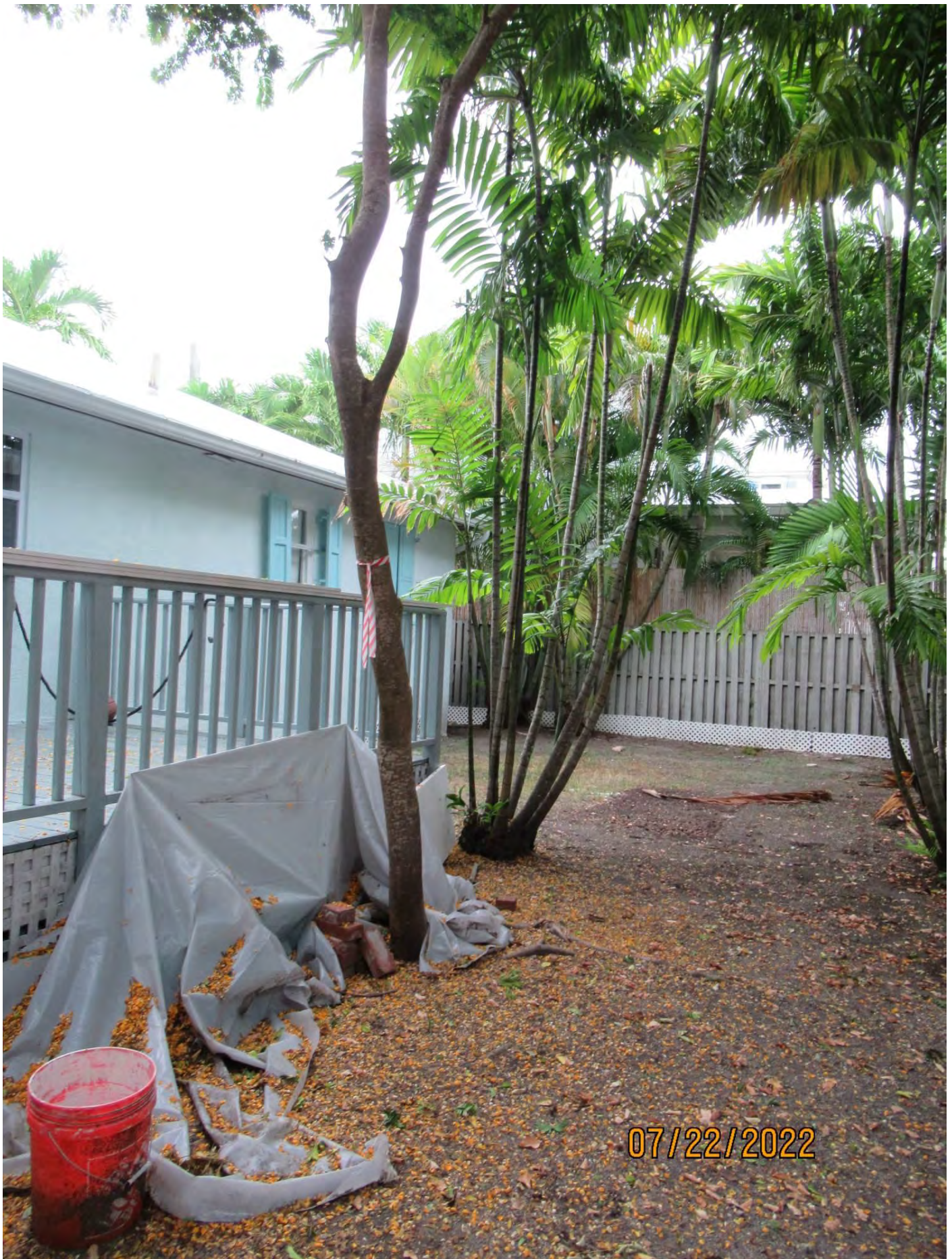
Photo of tree trunk showing location of tree, view 1.