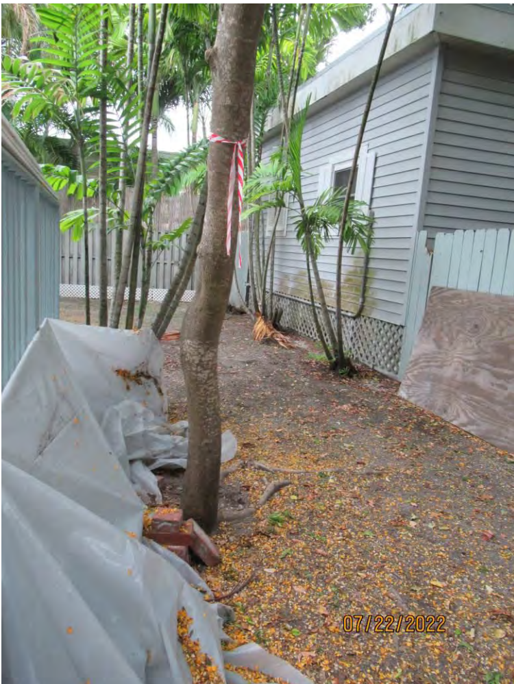
Photo of tree trunk, view 2.