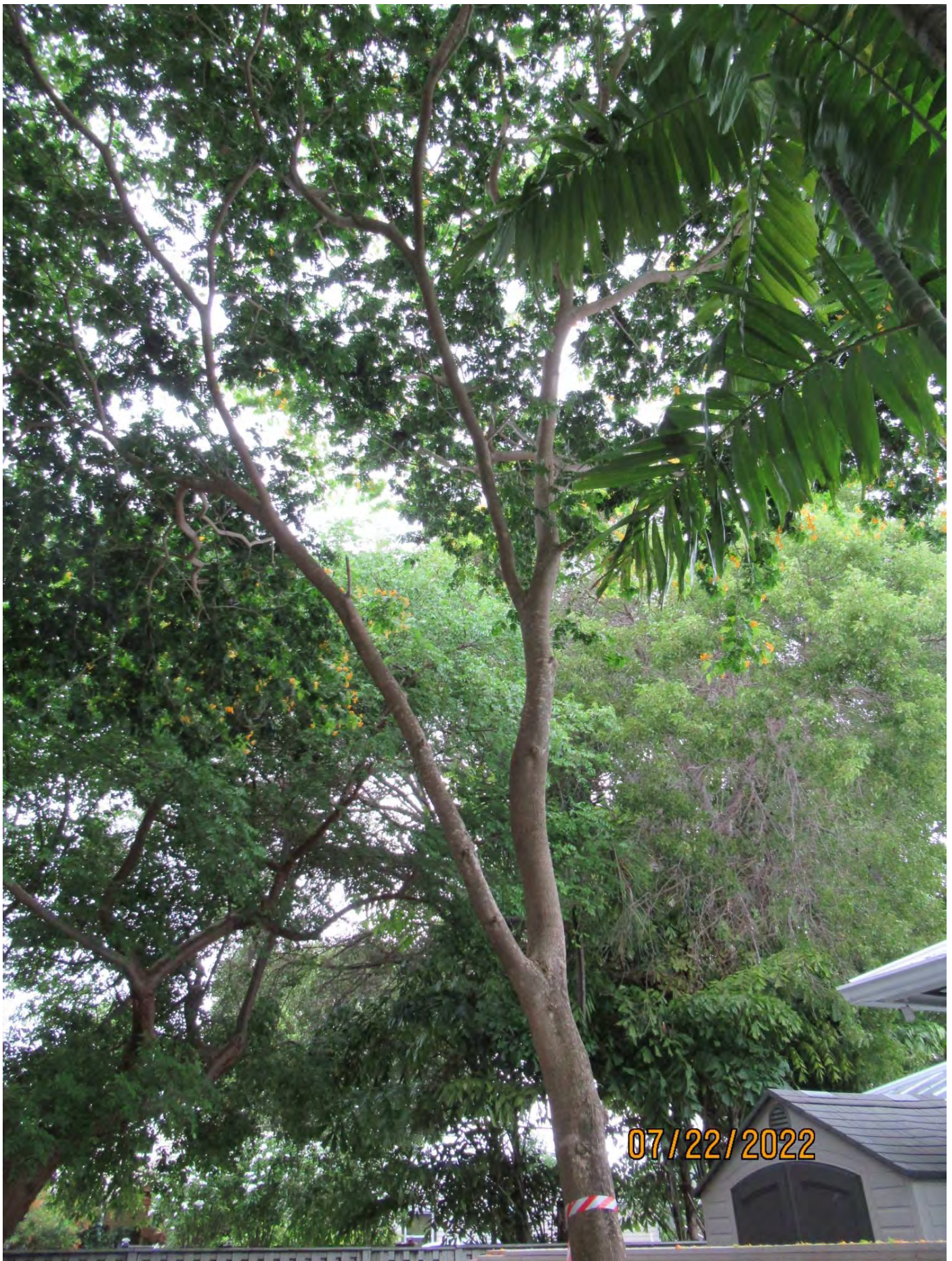
Photo of trunk and canopy branches.