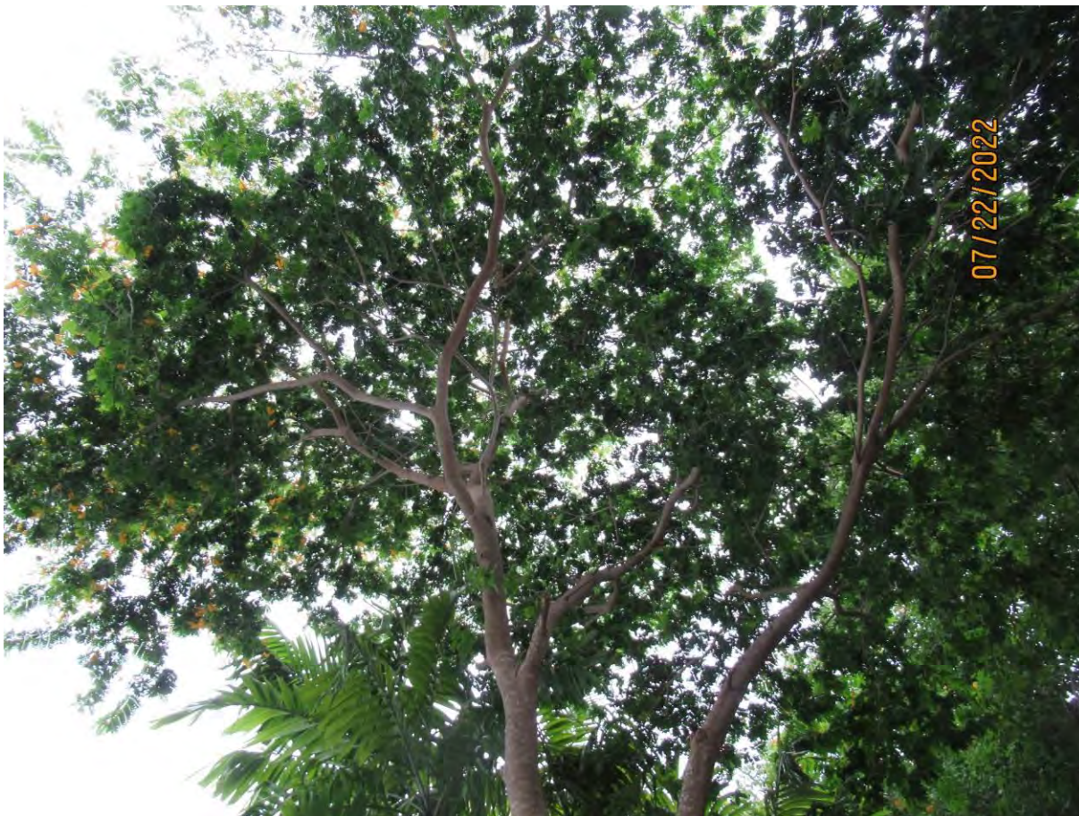
Photo of tree canopy, view 3.