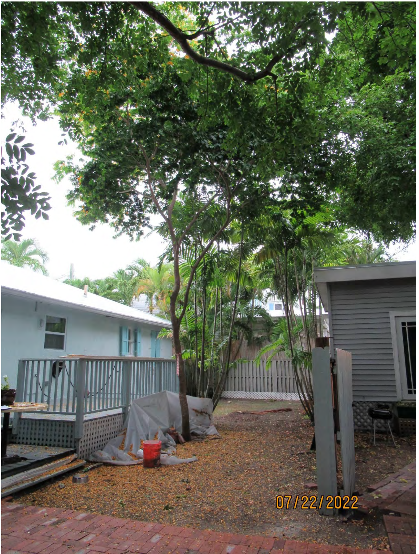
Photo of whole tree.