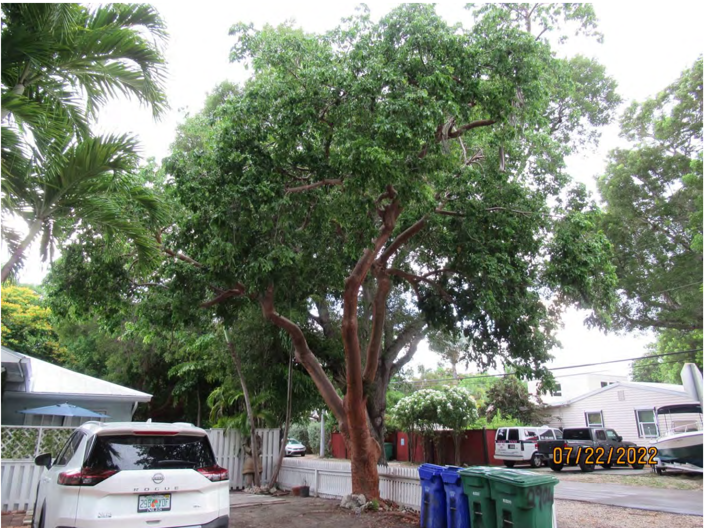
Photo of whole tree, view 1.

Tree Species: Gumbo Limbo ( Burera simaruba )