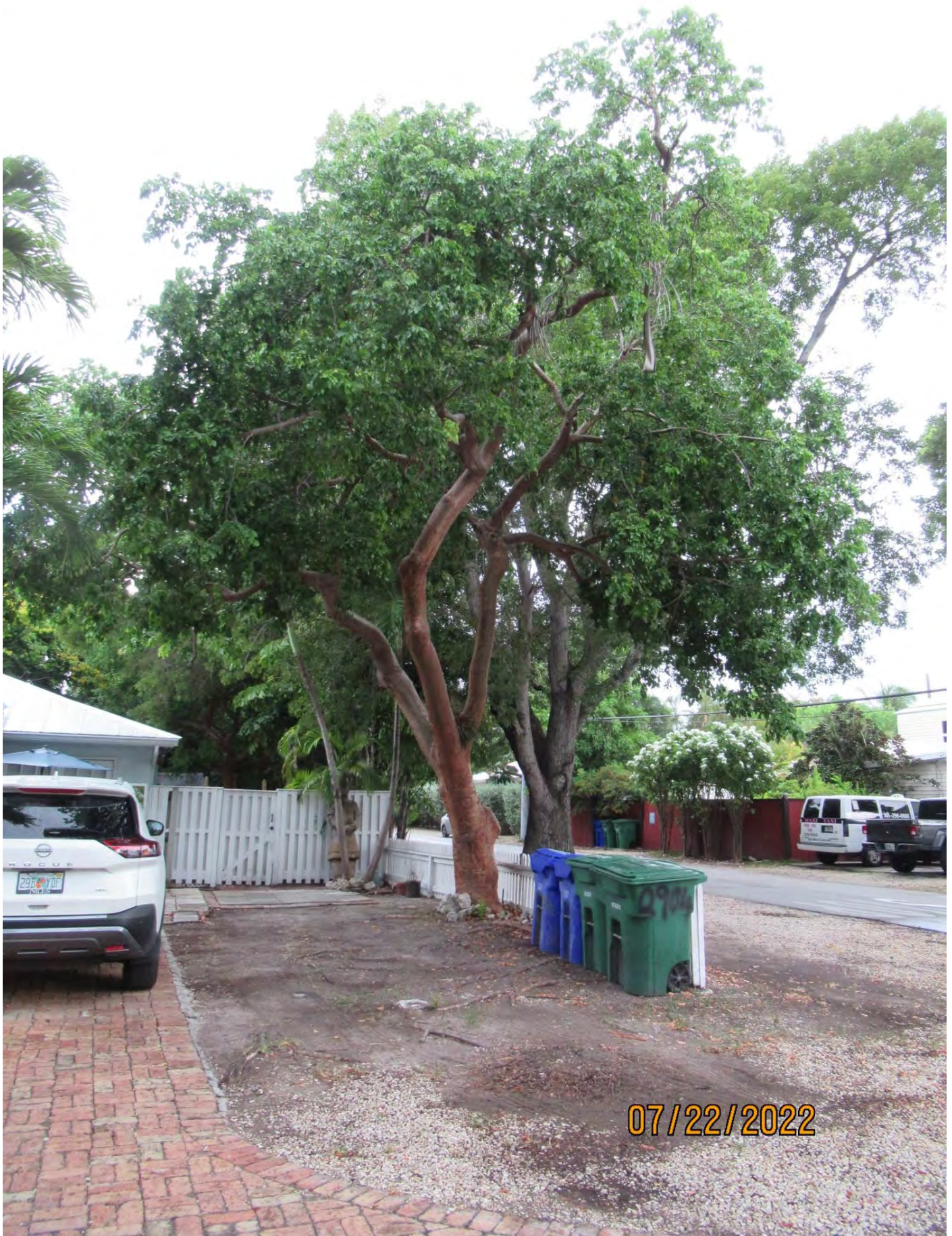
Photo of tree location on property.