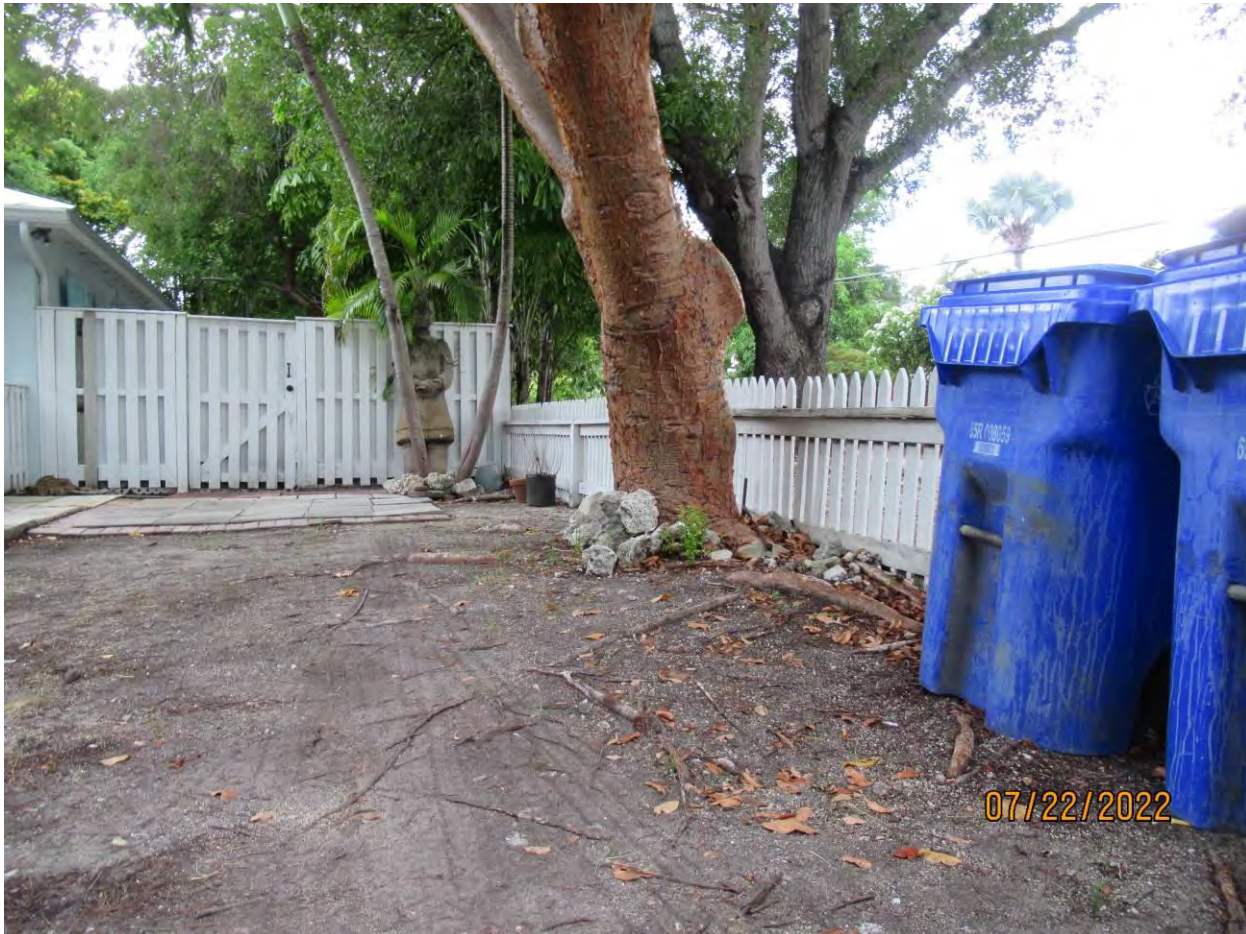
Photo of trunk and base of tree, view 1.