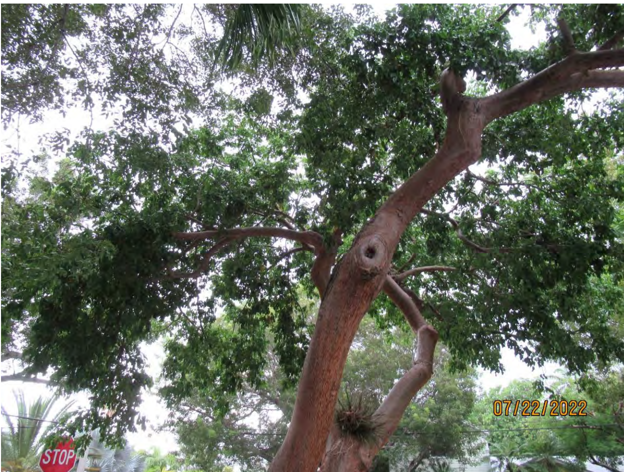
Photo of tree canopy, view 2.