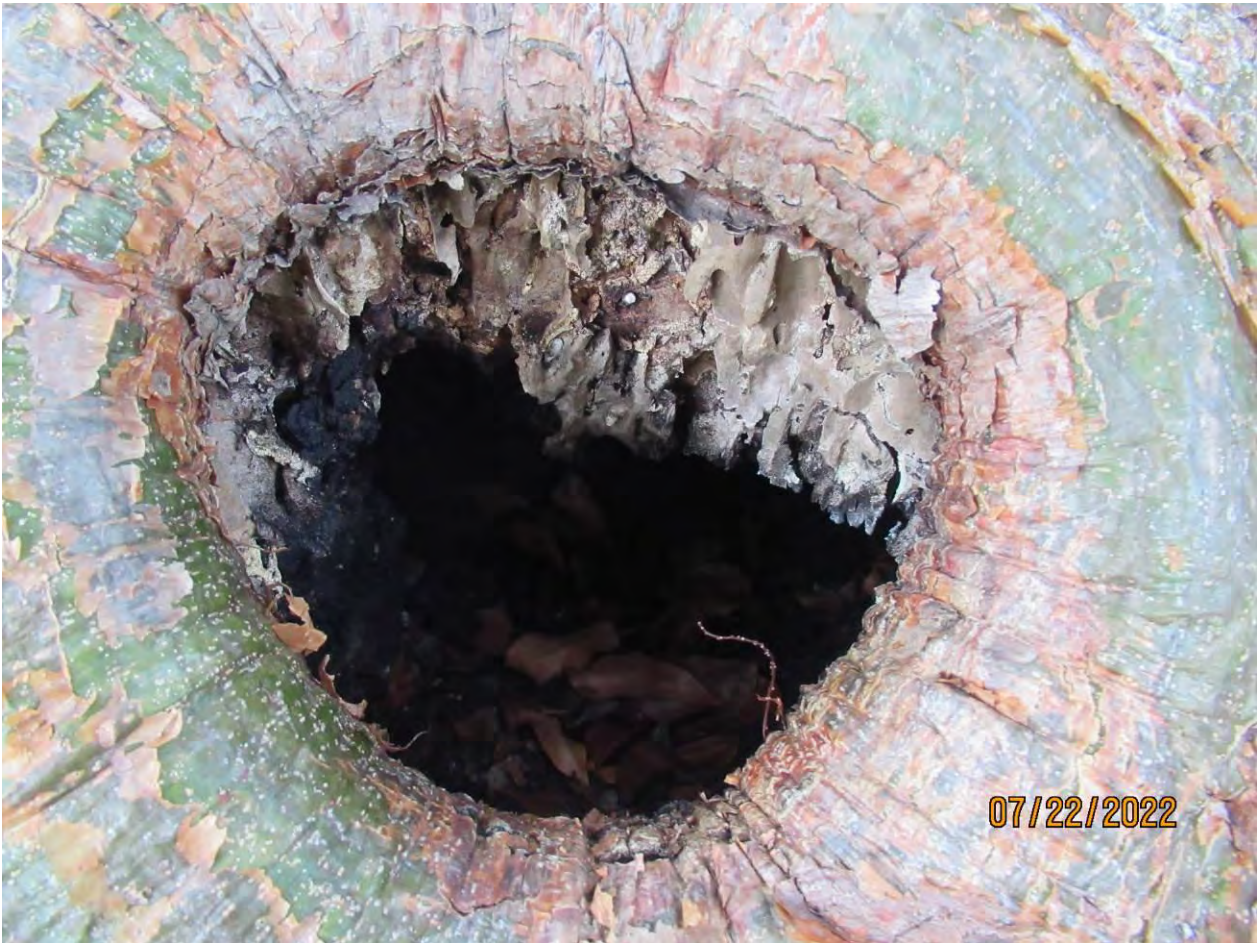
Two close up photos of decay hole in main trunk.