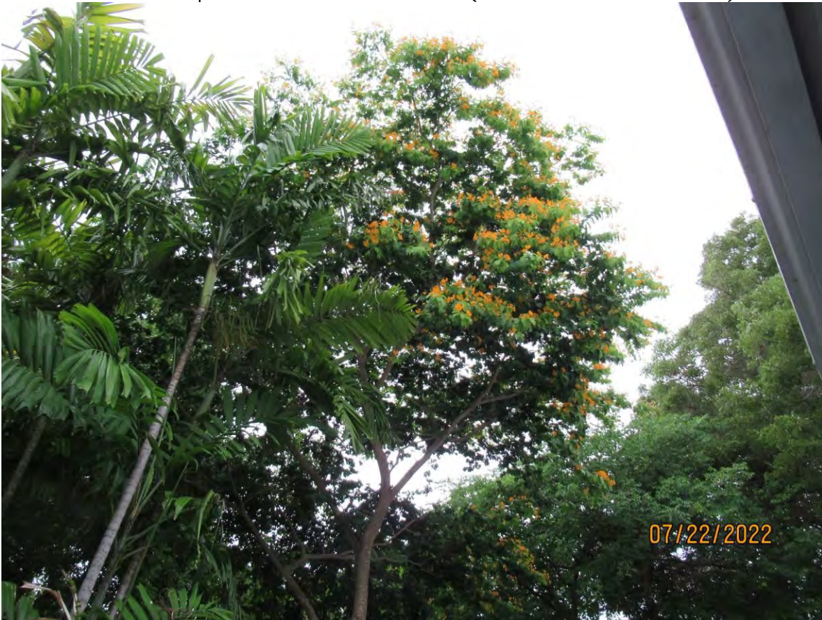
Photo of tree canopy, view 1.

Tree Species: Verawood ( Bulnesia arborea )