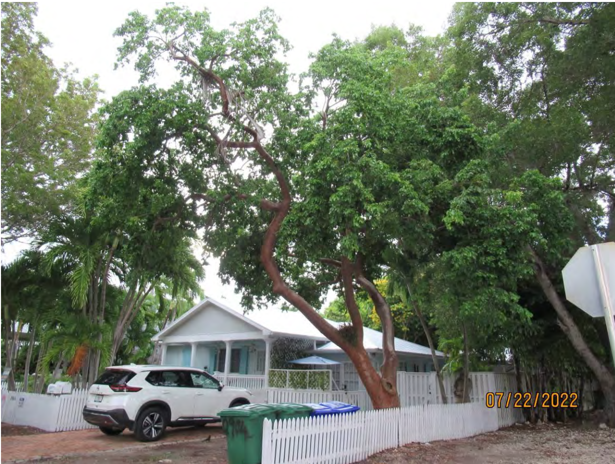
Photo of whole tree, view 2.