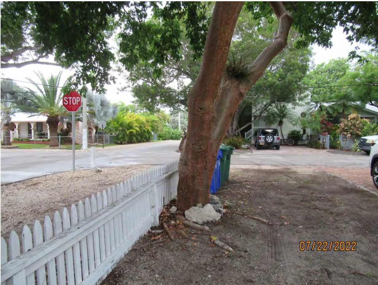
Photo of main trunk and canopy branches, view 3.