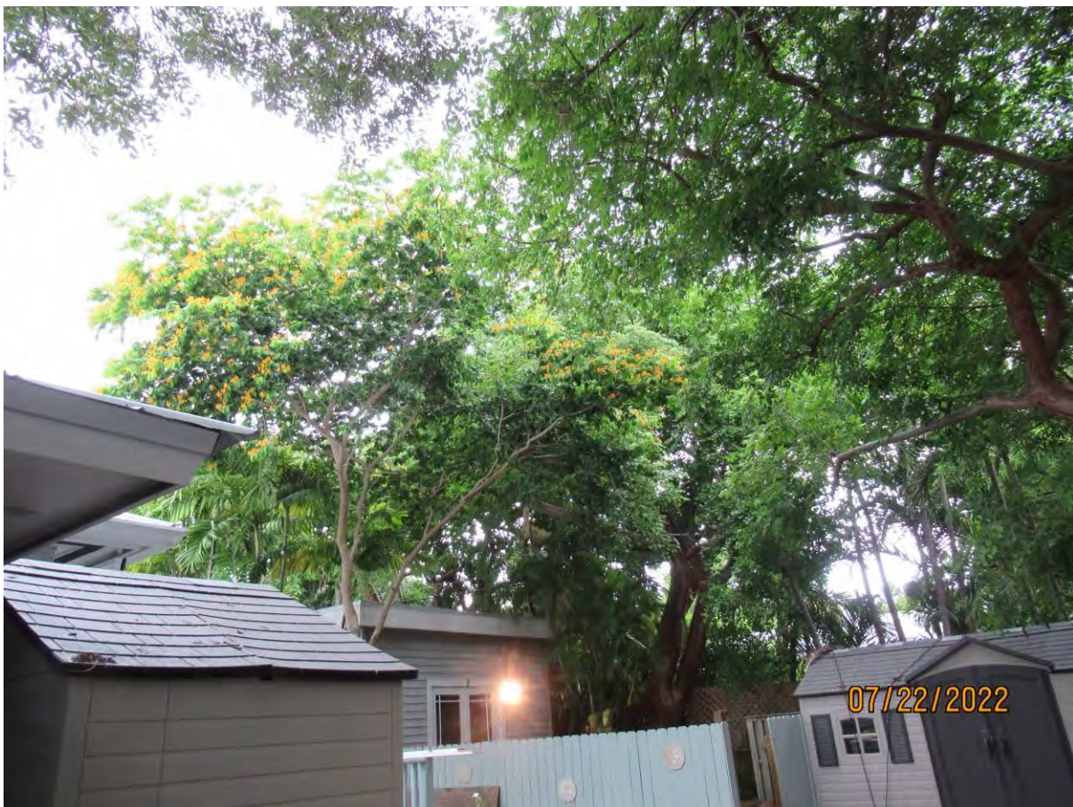
Photo of tree canopy, view 4. Photo also shows location of tree.