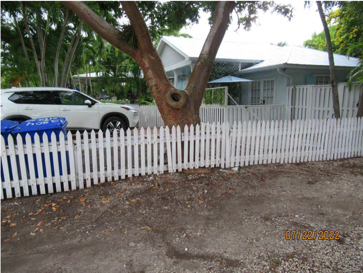
Photo of main trunk and canopy branches, view 1.