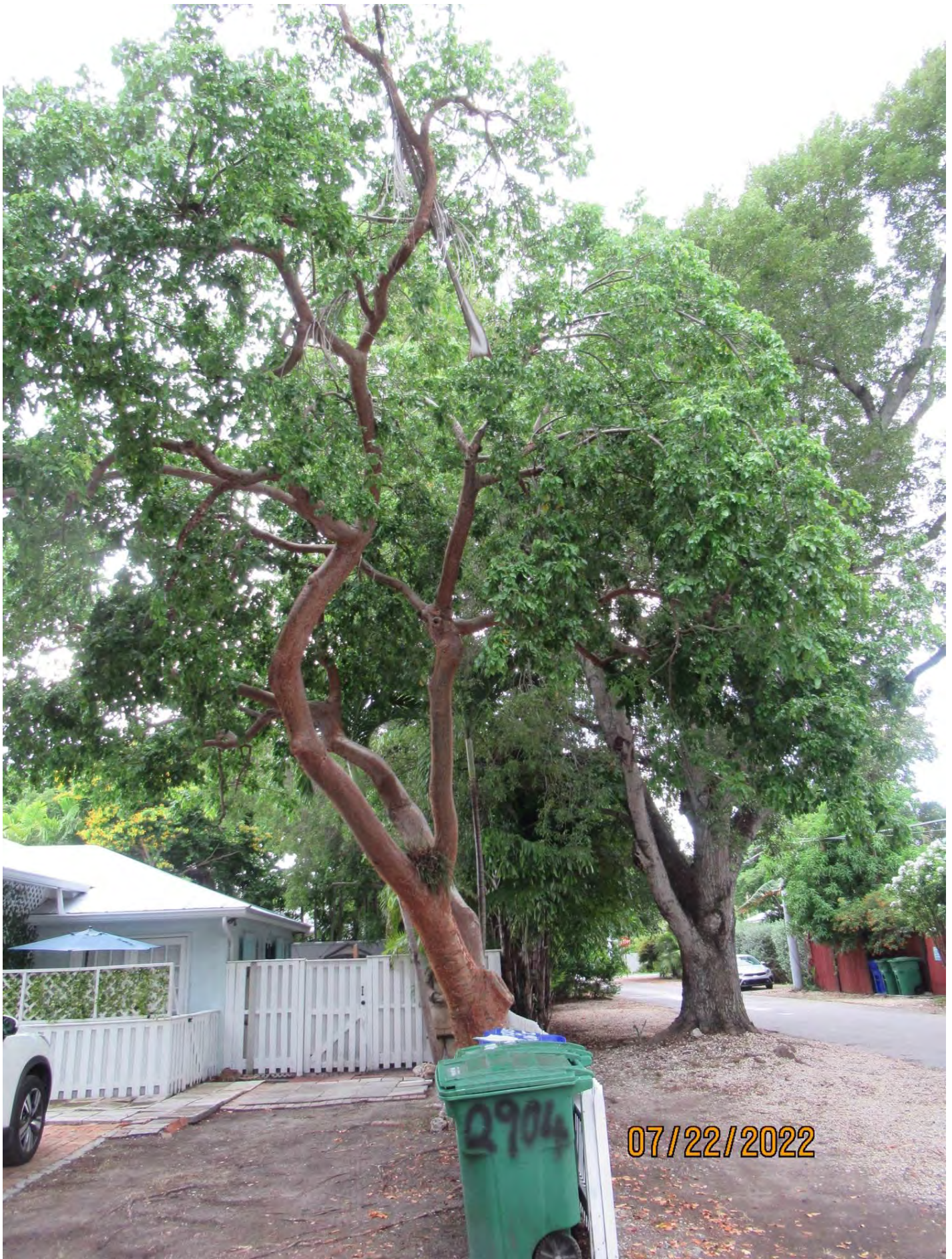
Photo of whole tree, view 3.