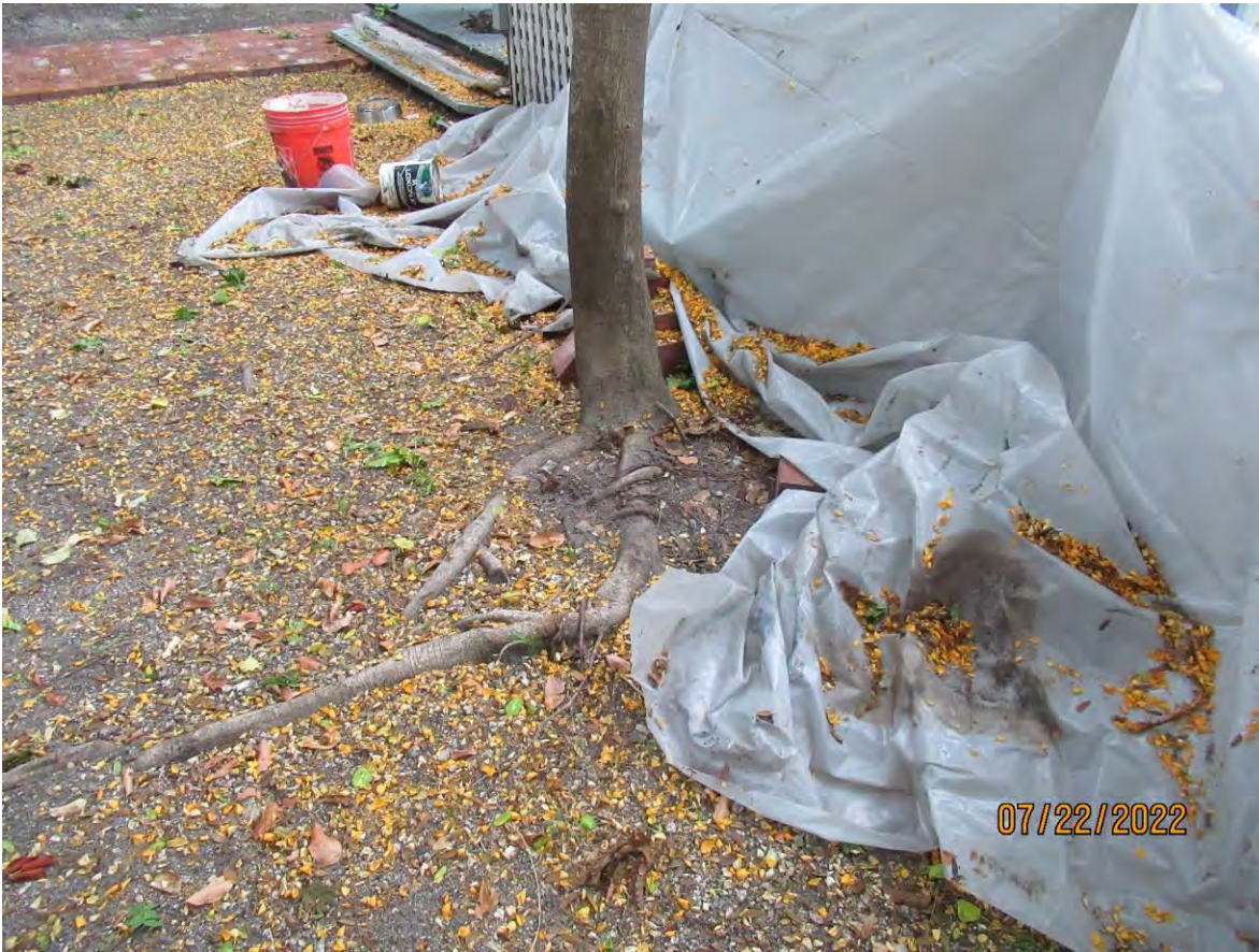
Photo of base of tree.