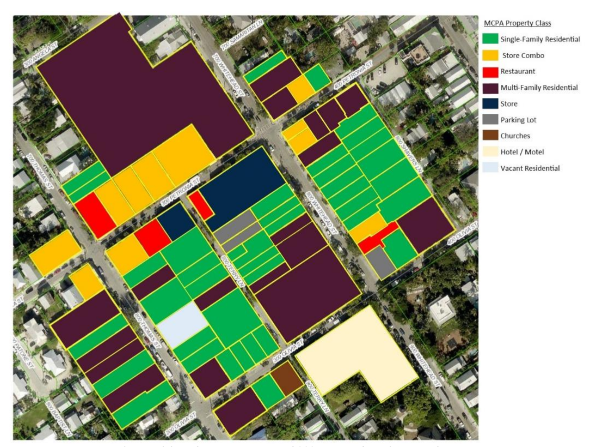
Aerial Map of the Subject Properties and 300-Foot Radius of Surrounding Uses

Pursuant to Code Section 122-866, the historic neighborhood commercial district (HNC-3) consists of the Bahama Village commercial core. The HNC-3 Bahama Village commercial core district includes the Bahama Village neighborhood commercial core along Petronia Street, approximately 200 feet southwest of Duval Street, and extends southwestward to the rear property lines of lots abutting the southwest side of Emma Street. The village area is a redevelopment area, including a commercial center linked to Duval Street. Consistent with the Comprehensive Plan, development in the district shall be directed toward maintaining and/or revitalizing existing housing structures, preventing displacement of residents, and compliance with concurrency management.