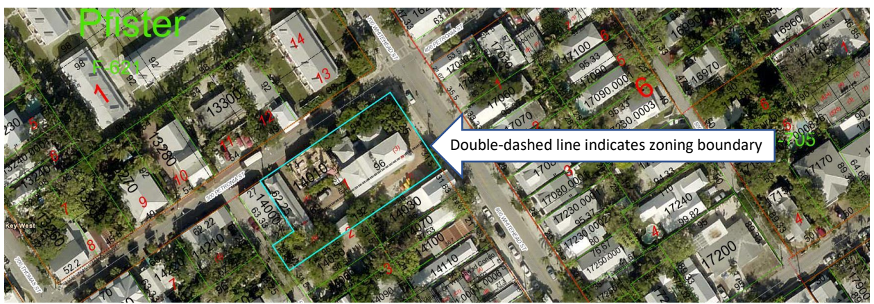
Aerial Map of the Subject Property

The aerial image (see image below) shows the dividing line, with the top portion of the parcel within the HNC-3 district and the bottom portion of the parcel within the HMDR district.