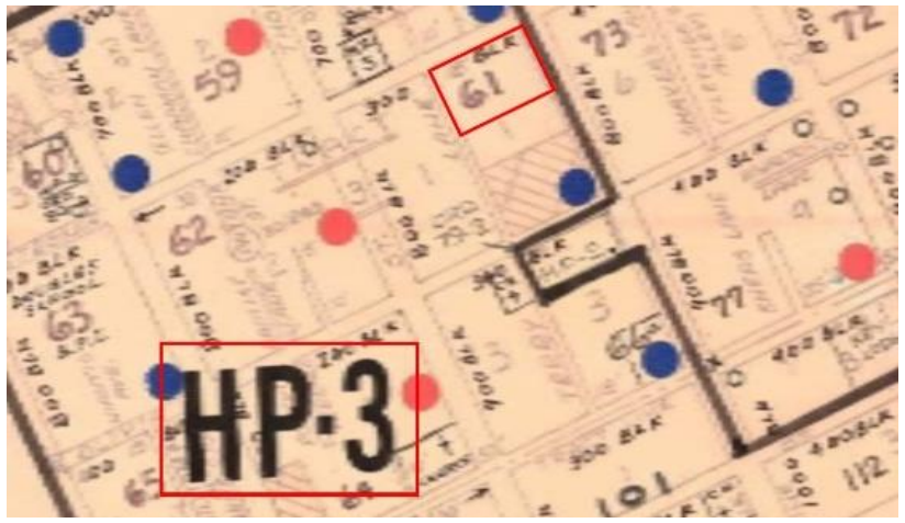
Zoning Map Prior to 1997

The property also falls within two zoning districts on the Future Land Use Map (FLUM) (HC and HR). Prior to 1997, the zoning for the property was HP-3 (Light Commercial Historic Preservation) (see image below).