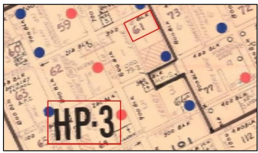
Zoning Map Prior to 1997

The new Future Land Use Map maintained the residential FLUM category that the property at 318-324 Petronia Street (802-806 Whitehead Street) partially had since the 1994 Comprehensive Plan and the 1997 Land Development Regulations. Prior to that, the property was zoned HP-3 (illustration below), which allowed residential uses as-of-right and allowed commercial and institutional uses as a special exception (similar to a conditional use).