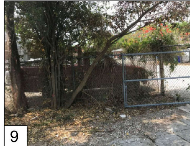
Here is the property line from your side: