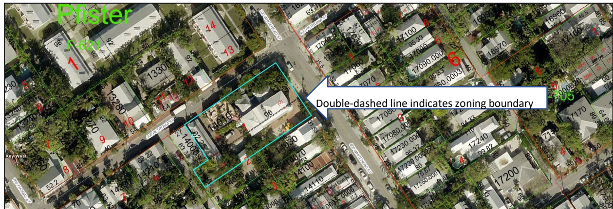
Parcel configuration as of September 2022.

change lot lines or boundaries defining land configurations. Prior to the unification, each parcel was entirely located within one zoning district, i.e. there were no split-zoned parcels. The parcel unification resulted in a parcel that is now bifurcated by two zoning districts, HNC-3 and Historic Medium Density Residential (HMDR). The current parcel configuration can be seen below.