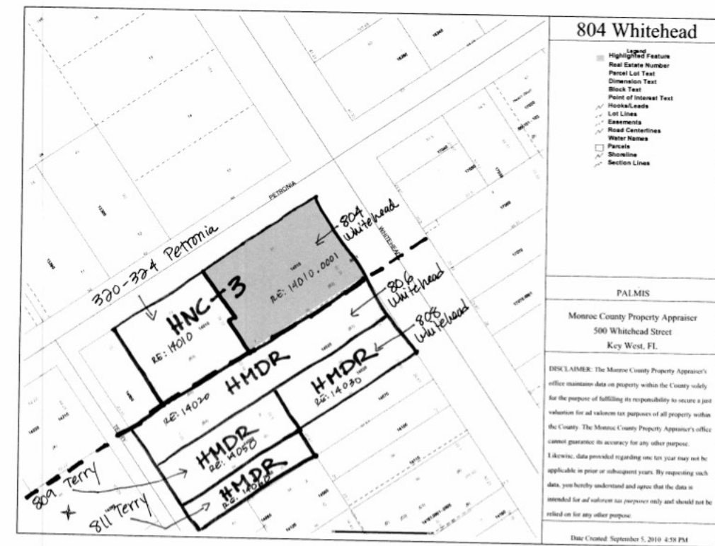
Parcel configuration as of 2010.

The image below is a 2010 map from the Monroe County Property Appraiser’s office. The markups on the image are from 2010, and indicate the former RE#s of the various parcels. The dashed line reflects the zoning district boundary.