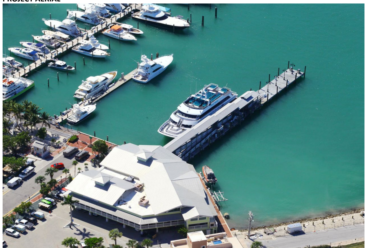
Insert 1: Existing Ferry Terminal Building, Pier, and Portion of Trumbo Road