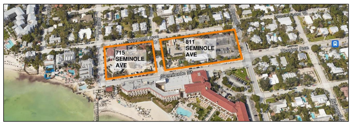
Aerial Map of the Subject Properties