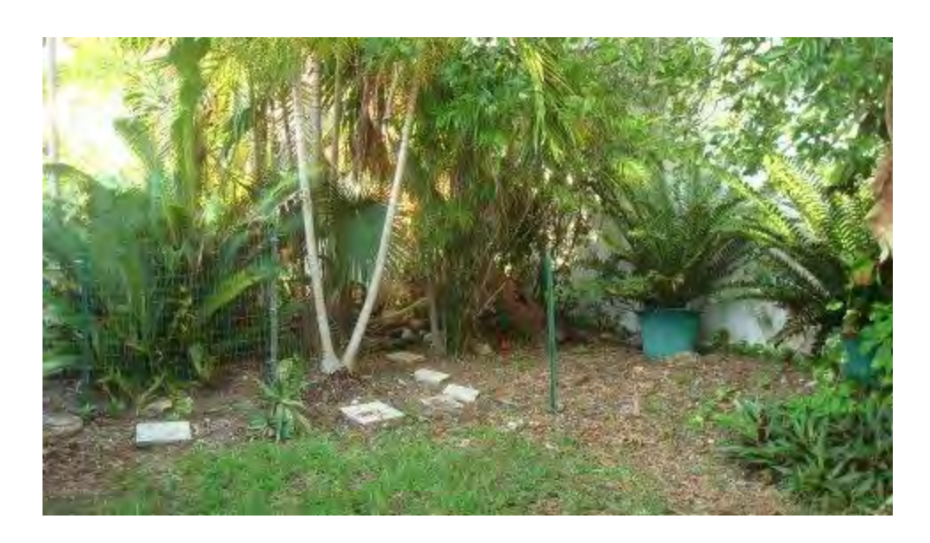
View to left of Gumbo, entire area shaded except for some of back wall and other neighbor's yard.