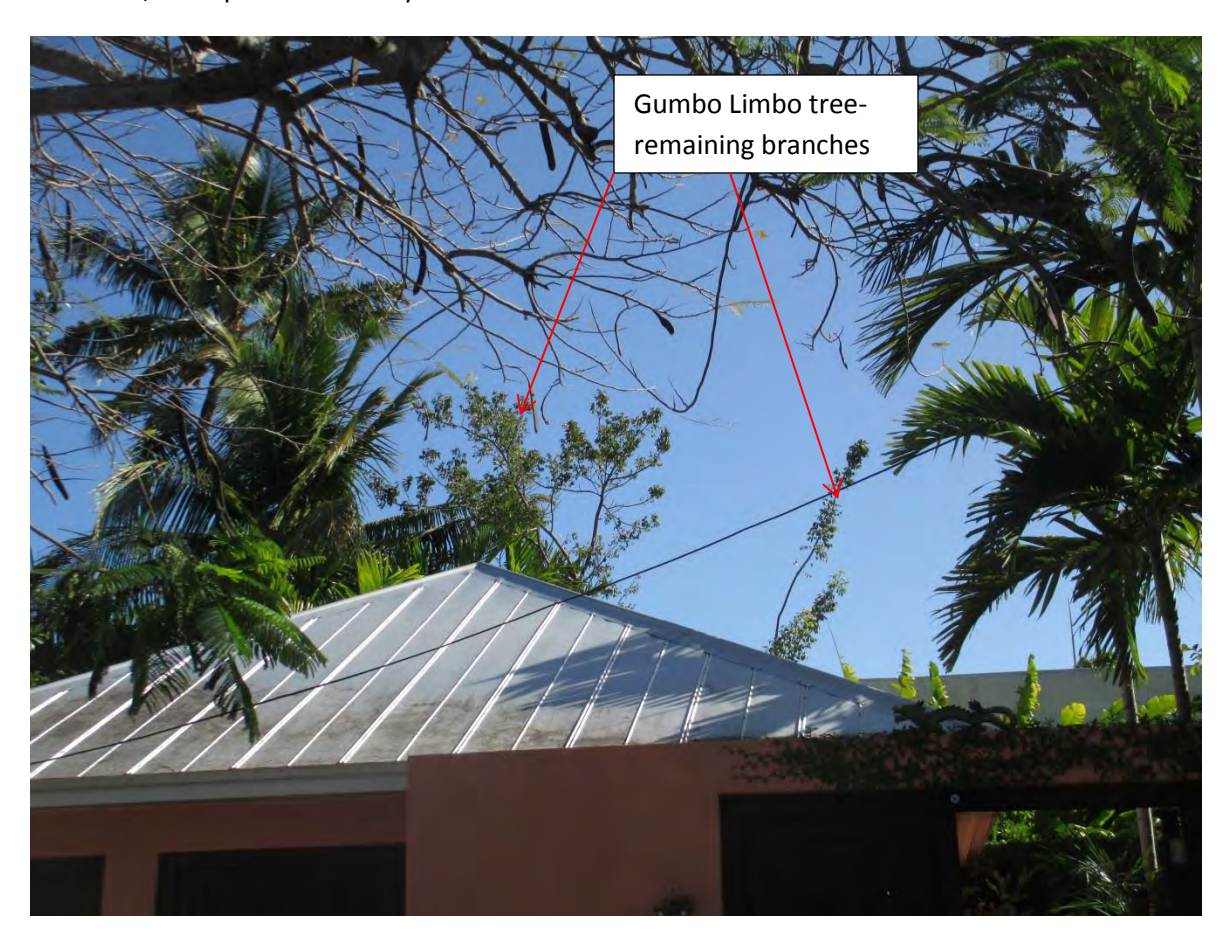
Standing on Margaret Street looking toward house