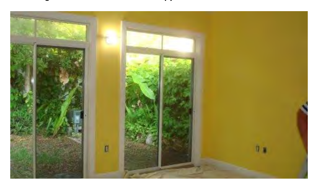
Gumbo at far left, back. Shade area of back yard shown with sun area to the right. (Before patio installed)