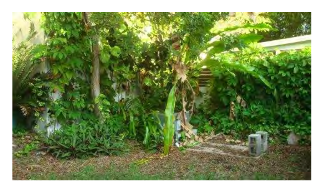
Another view, only sun on some of back wall of KW Mini Storage and neighbor's yard.