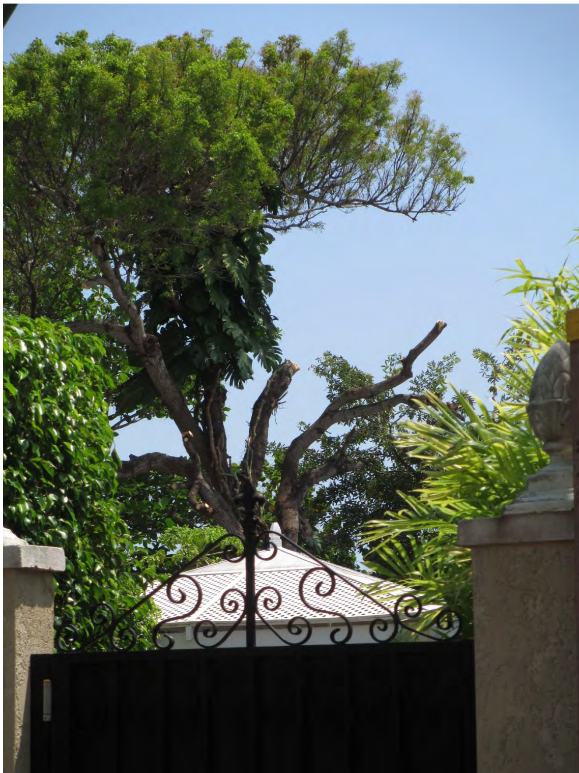
Looking from corner house at 18 th Terrace and 20 th St