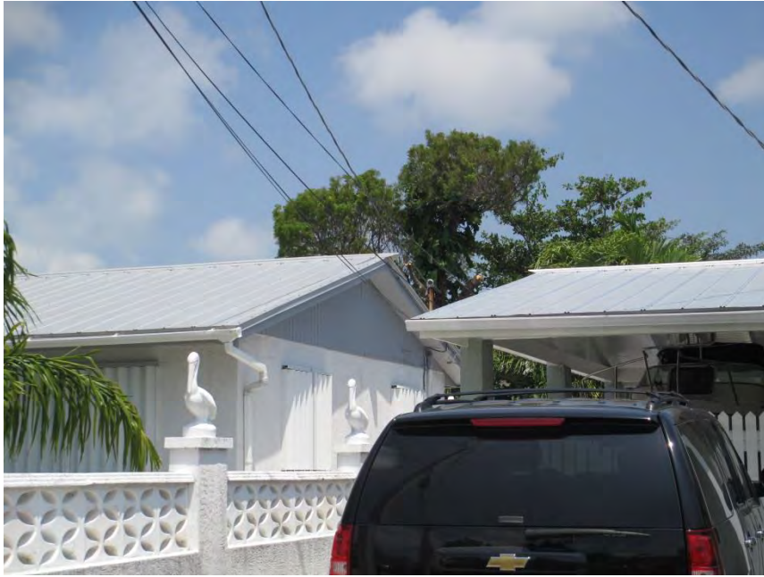
Looking from 1006 18 th Terrace