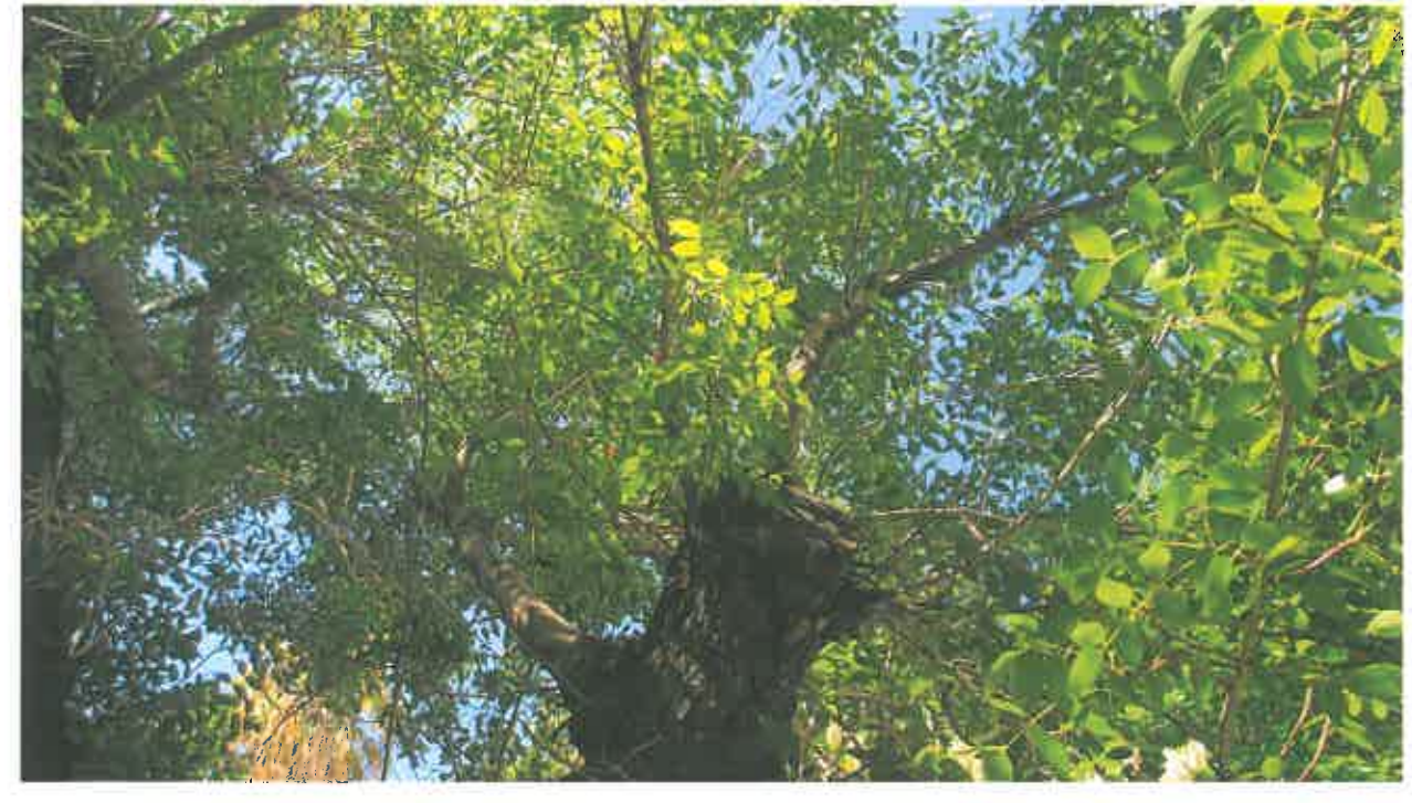
Top of tree cut off.