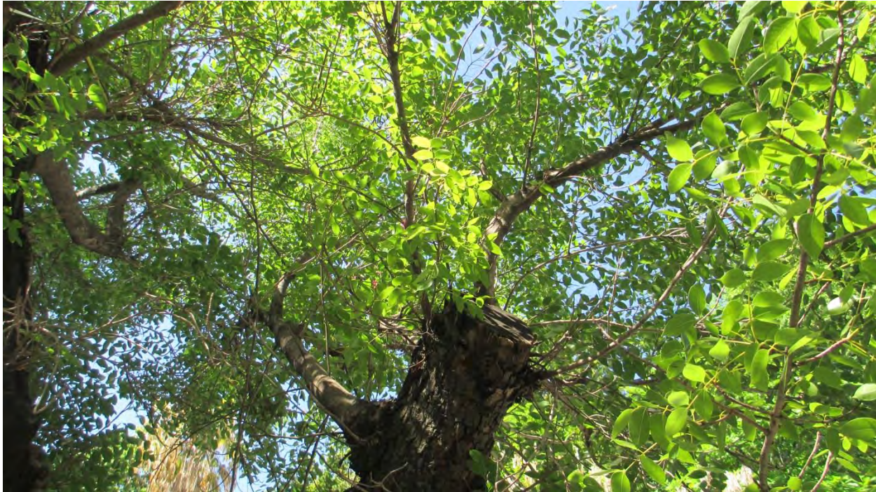
Top of tree cut off.

Recommendation: Recommend approval of the removal of (1) Mahogany tree located in the ROW in front of 711 Simonton St, to be replaced with 8 caliper inches of FL#1 native dicot trees on City ROW in the area.