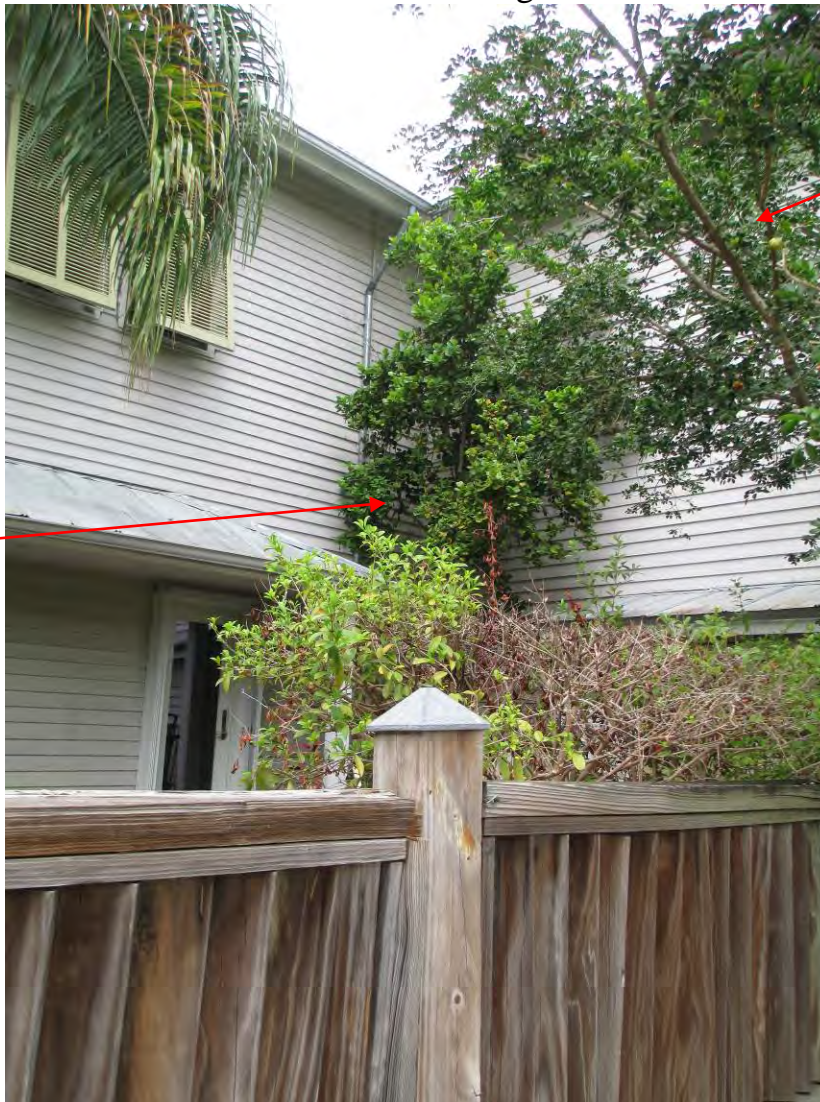
Tree #1 Pigeon Plum

An application was received for the removal of (3) Pigeon Plum and (1) Green Buttonwood trees. A site inspection was done on September 23, 2014 and documented the following: