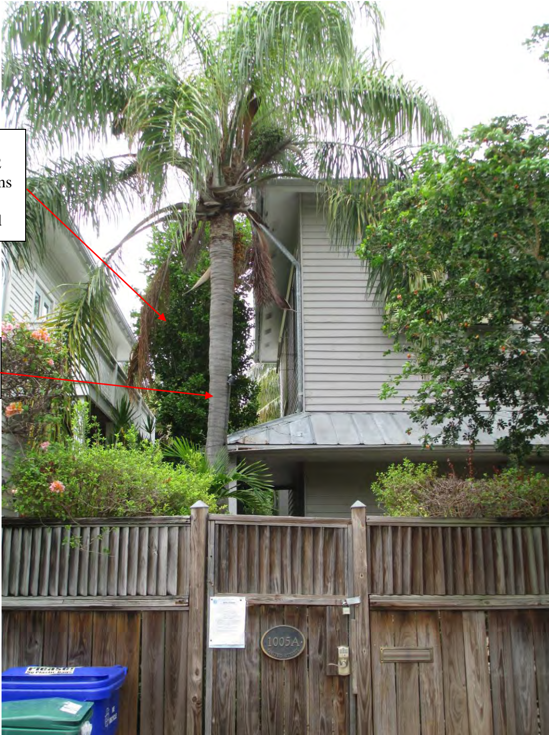
View of front yard standing outside of gate.