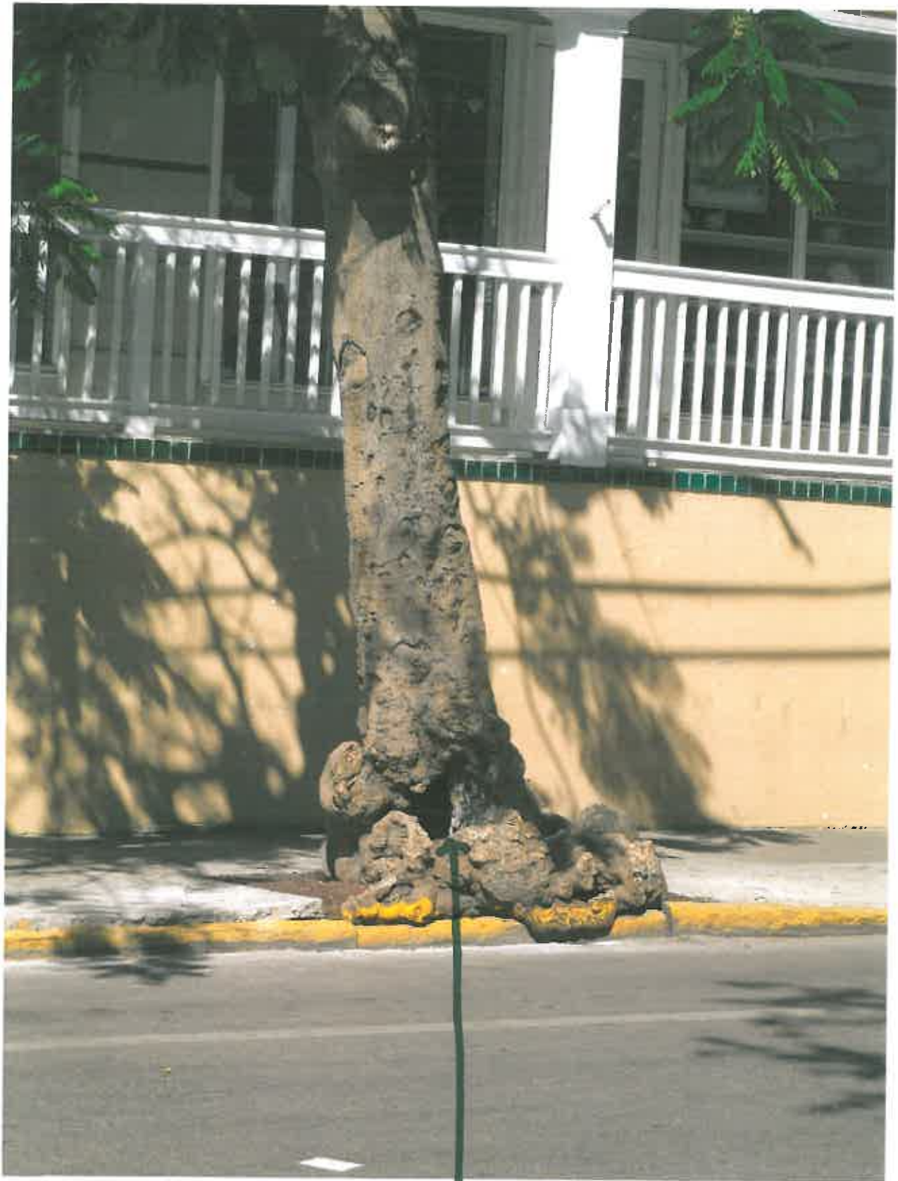
hole at base of tree