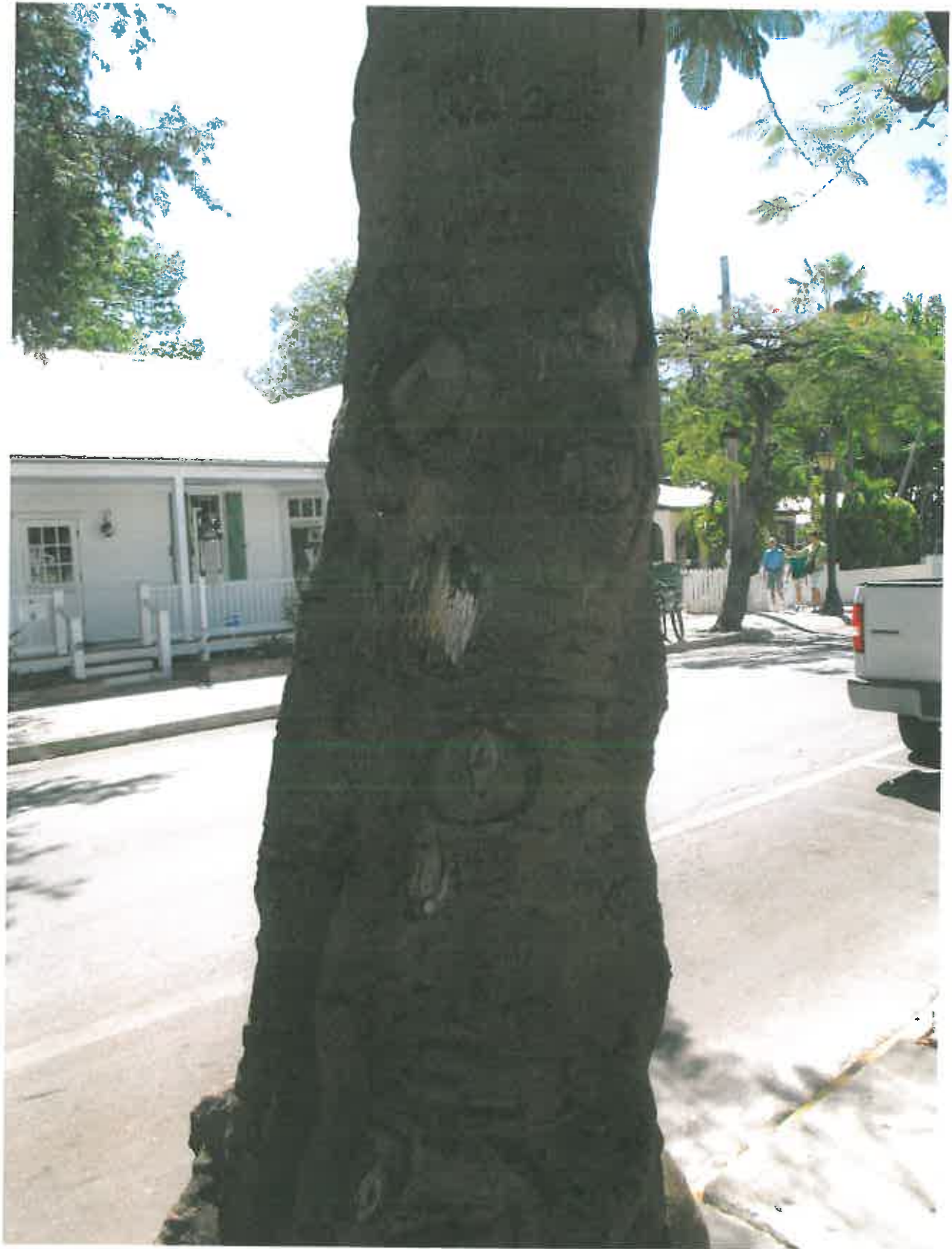
decay spot in trunk