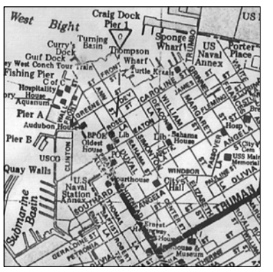
LOCATION MAP - NTS

ADDRESS: 711 DUVAL STREET KEY WEST, FL 33040