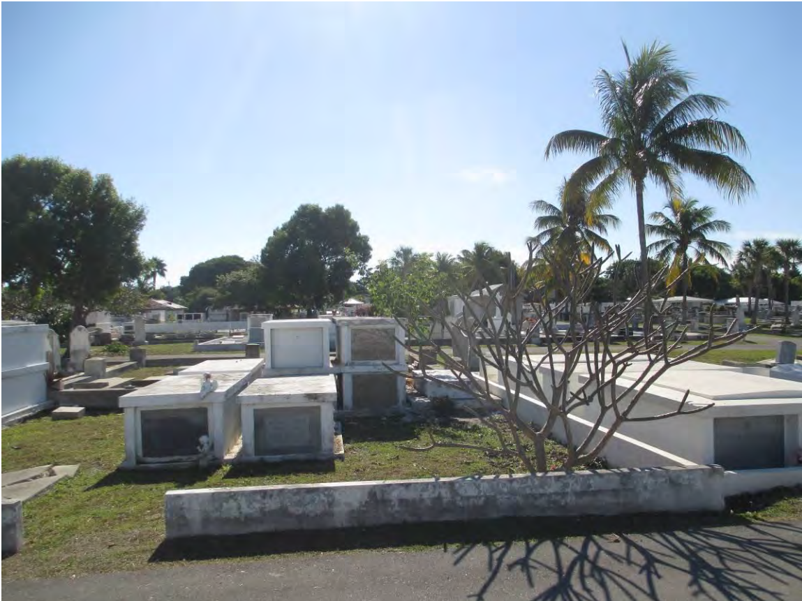
View of plot from Palm Ave

Tree Species: Gumbo Limbo ( Bursera simaruba )