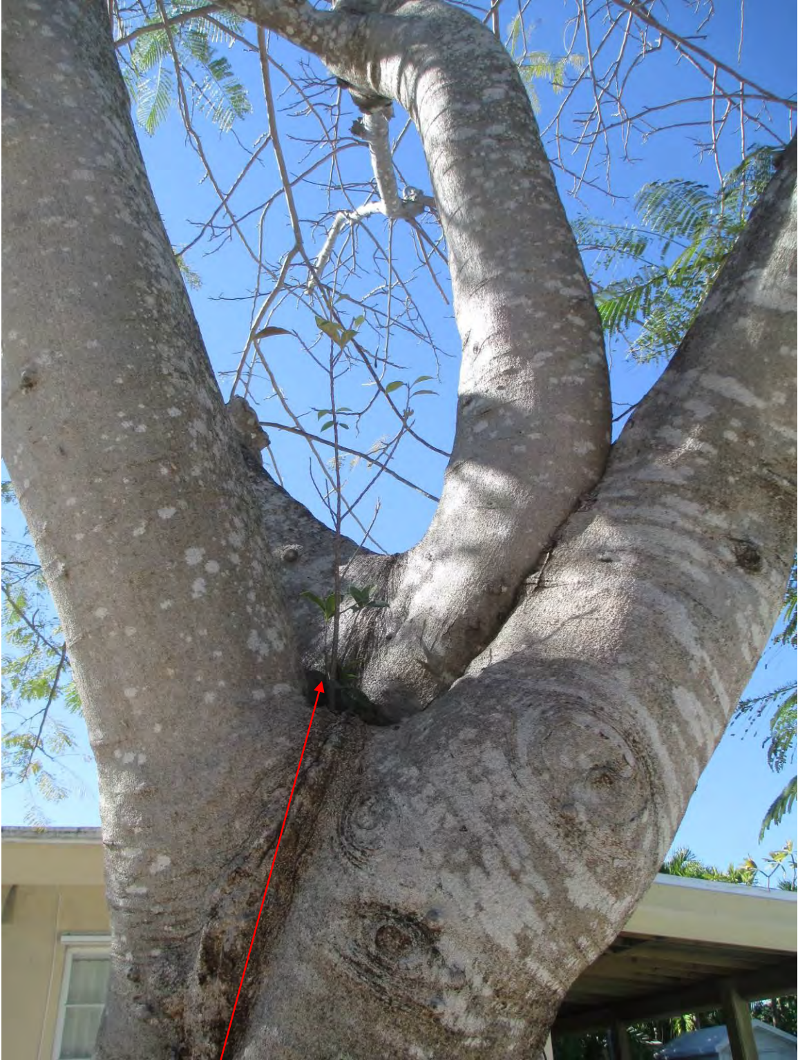
Tree growing out of crotch of tree