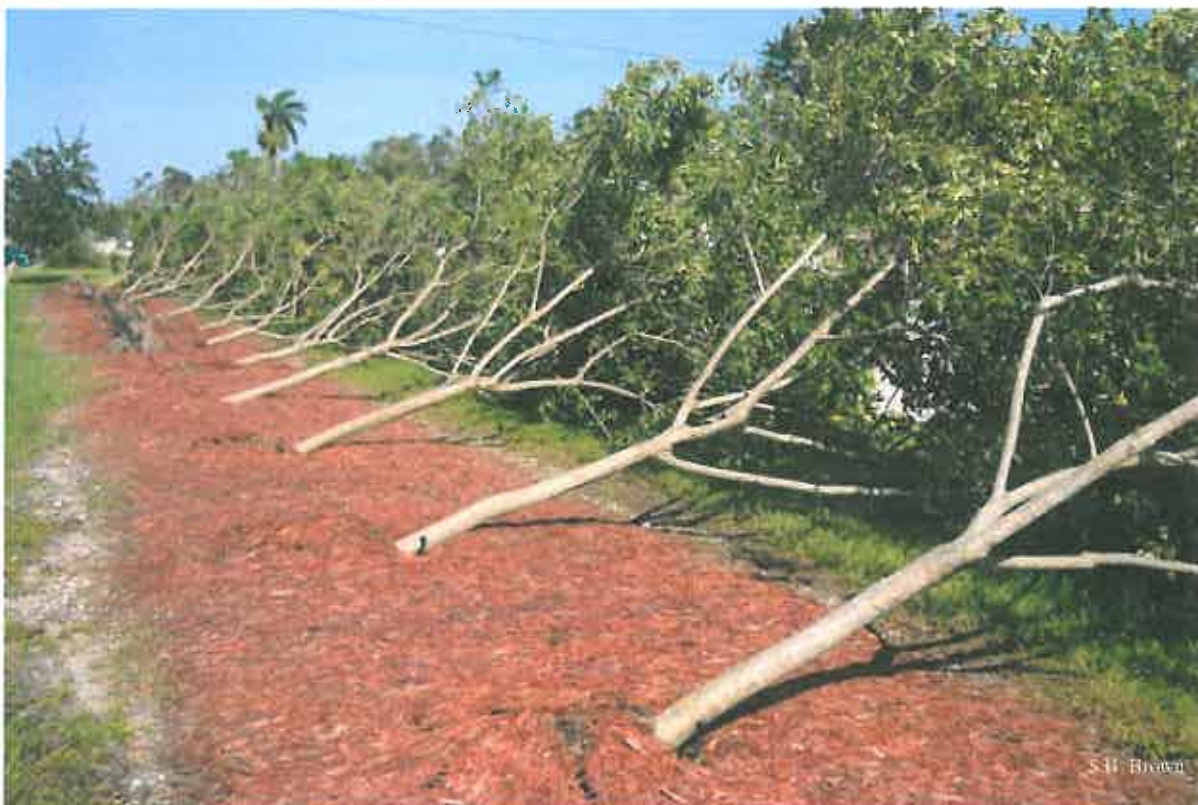
North Fort Myers, Florida Hurricane toppled Senna Surattensis