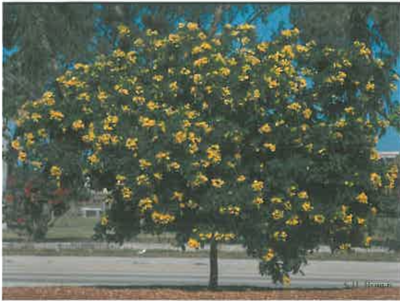
Fort Myers, Florida