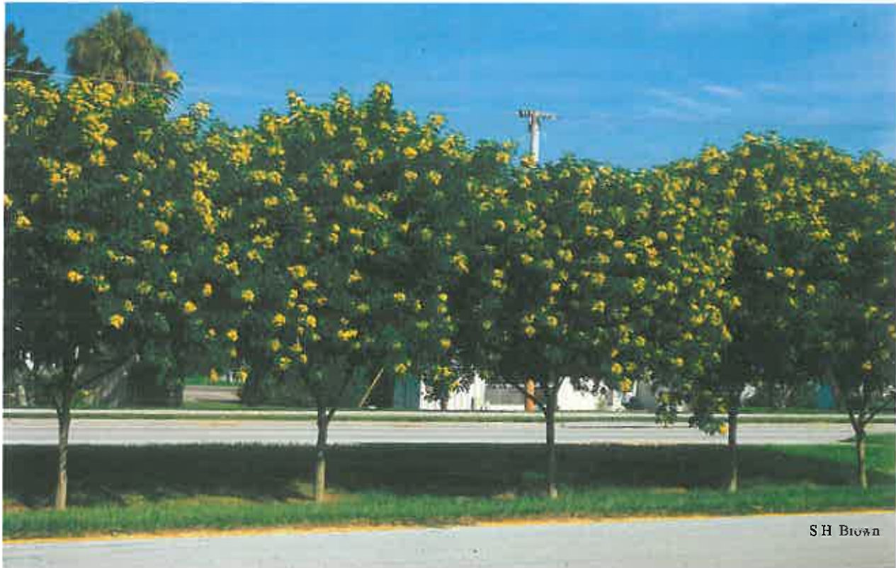
North Fort Myers, Florida