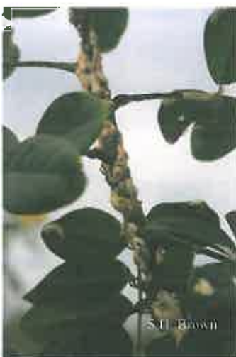
Fort Myers, Florida Mid December Scale insects can cause stem die-back

Tropical Flowering Trees List Questions/Comments: Email: brownsh@leegov.com