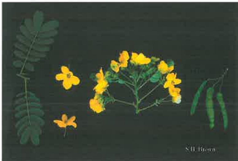
Fort Myers, Florida