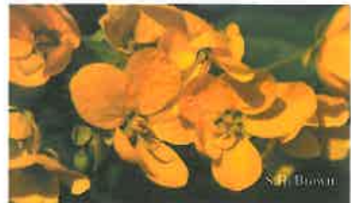
Fort Myers, Florida