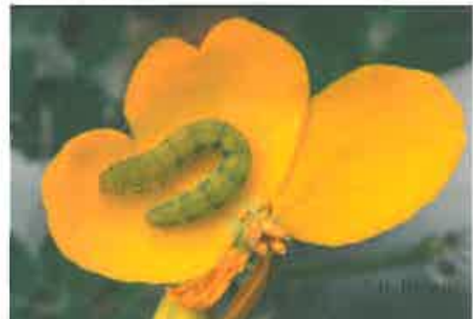
Fort Myers, Florida

Mid November Caterpillar soon to become a Cloudless Sulphur butterfly