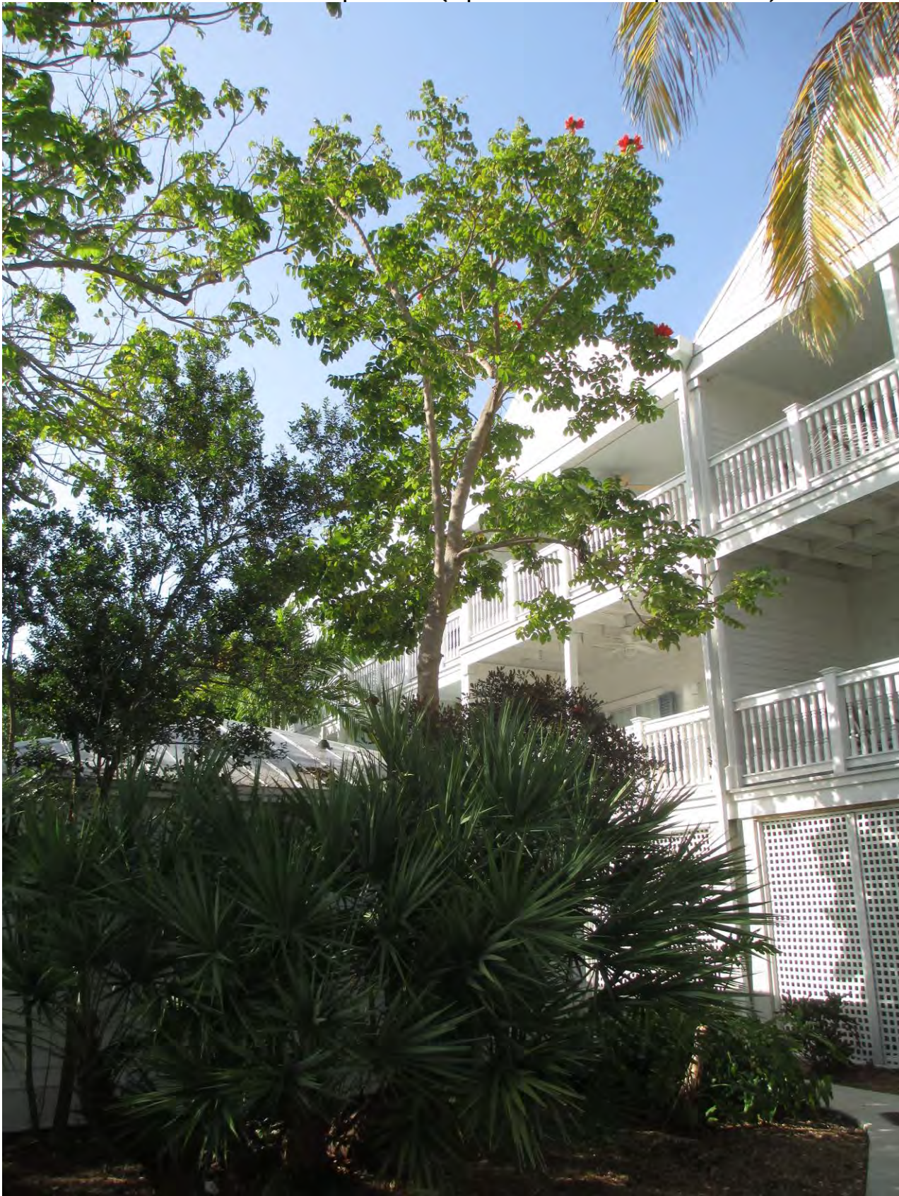
Tree Species: African Tulip Tree ( Spathodea campanulata )